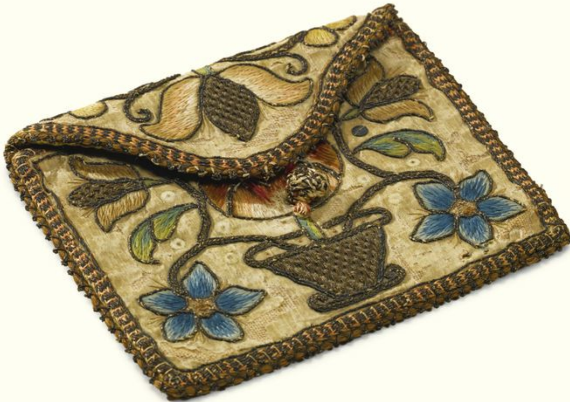
American Silk Embroidered Pocket Book from Chester County, Pennsylvania