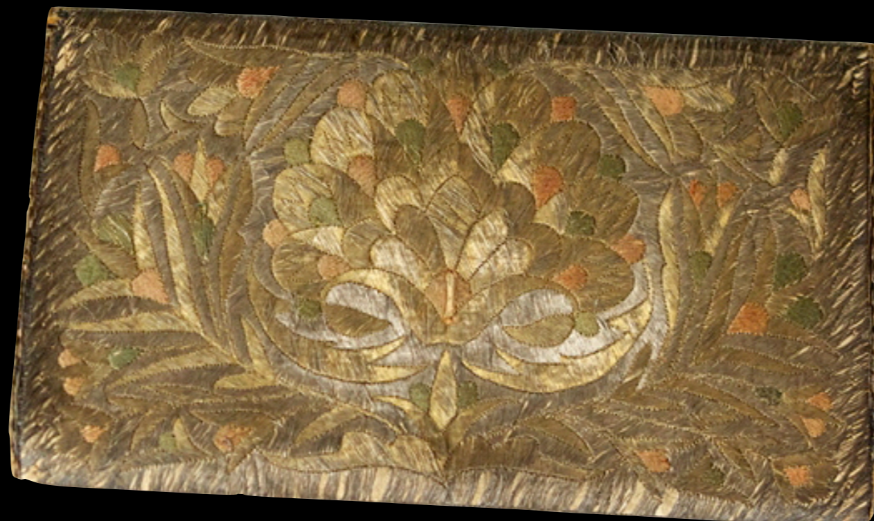
Wallet Marked "Constantinople 1742"