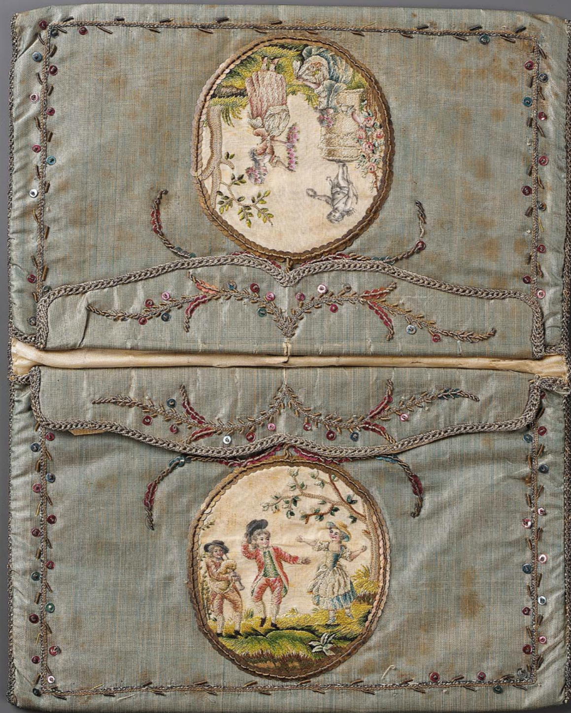
French Silk Appliquéd Pocket Book Embroidered with Silk, Metallic Threads, Metal Purl & Metal Spangles Late 18th Century (Museum of Fine Arts, Boston)