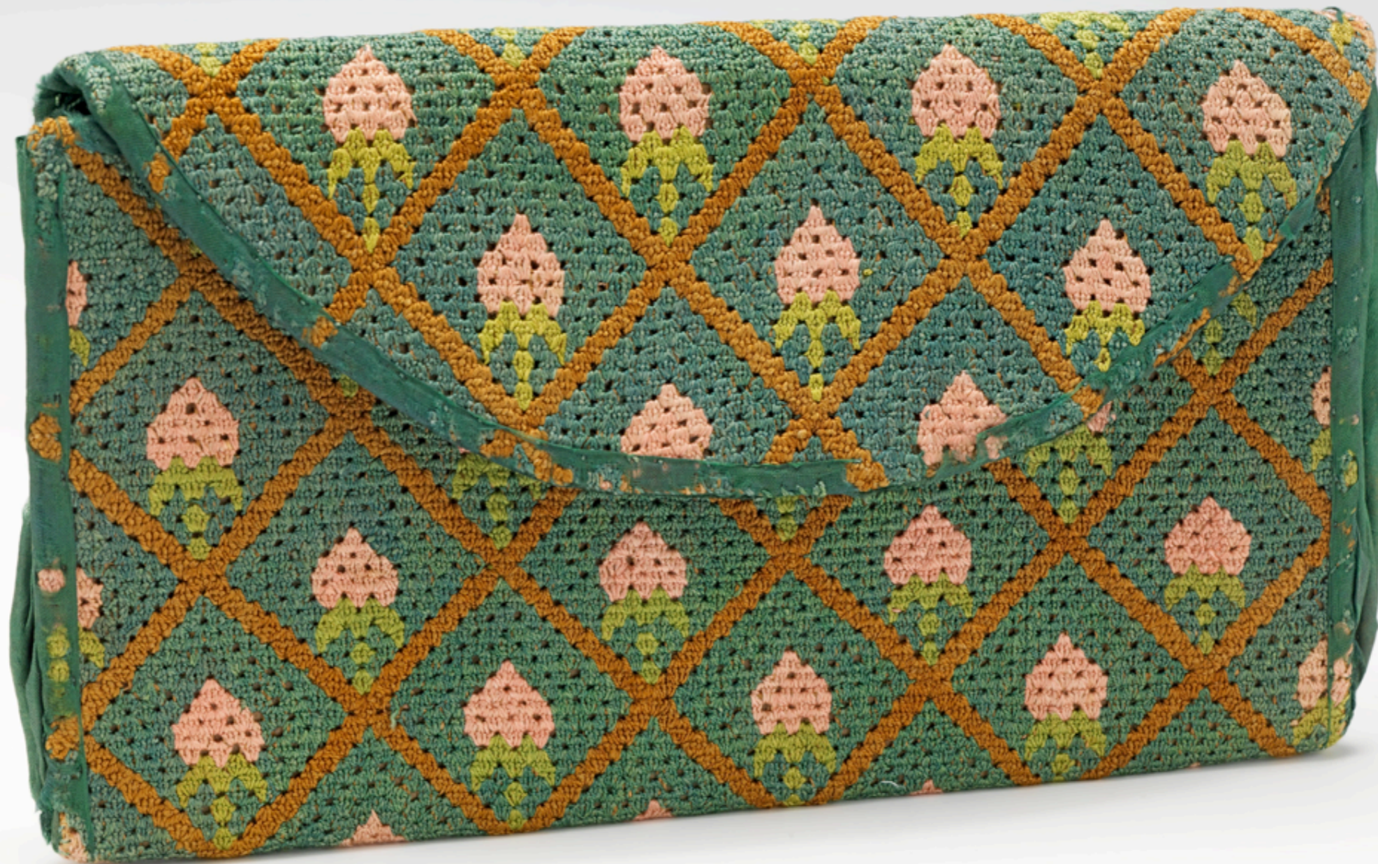
American Silk Pocket Book 4th Quarter 18th Century (Metropolitan Museum of Art)