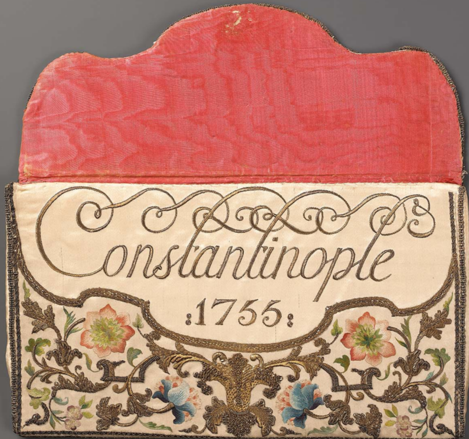
Turkish Silk Pocket Book Embroidered with Silk and Metallic Threads, Metal Purl, Flat Metal Strips & Chain