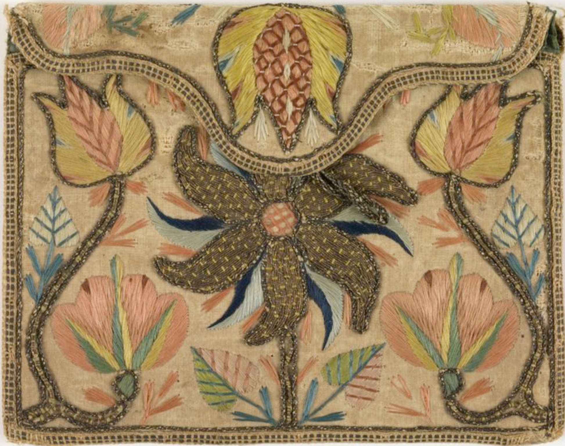
Linen with Silk Embroidery Pocketbook 18th Century (Cooper - Hewitt Museum, Smithsonian)