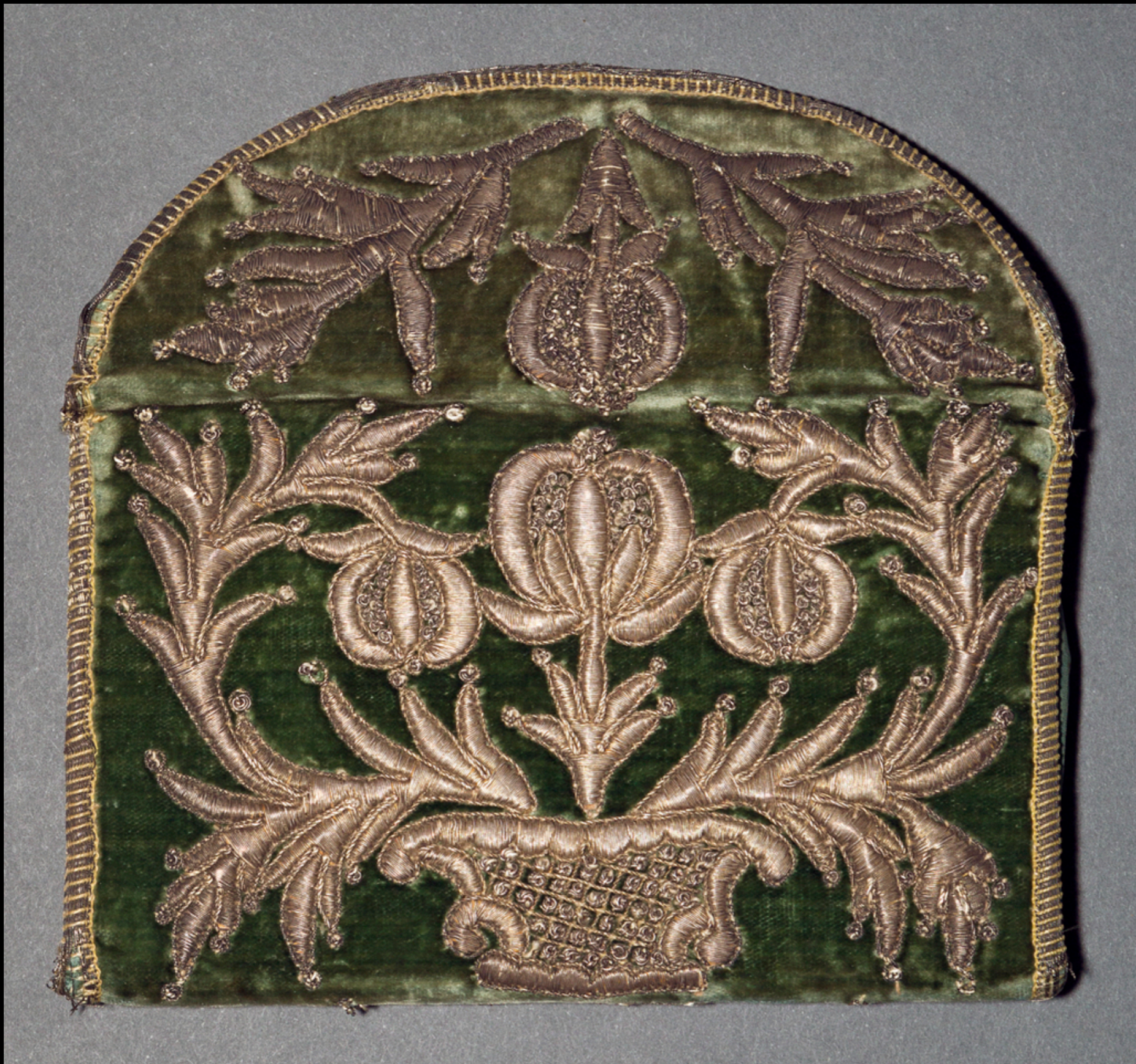
Continental Europe or North American Silk Pocket Book with Metallic Embroidery Late 18th Century (Winterthur)