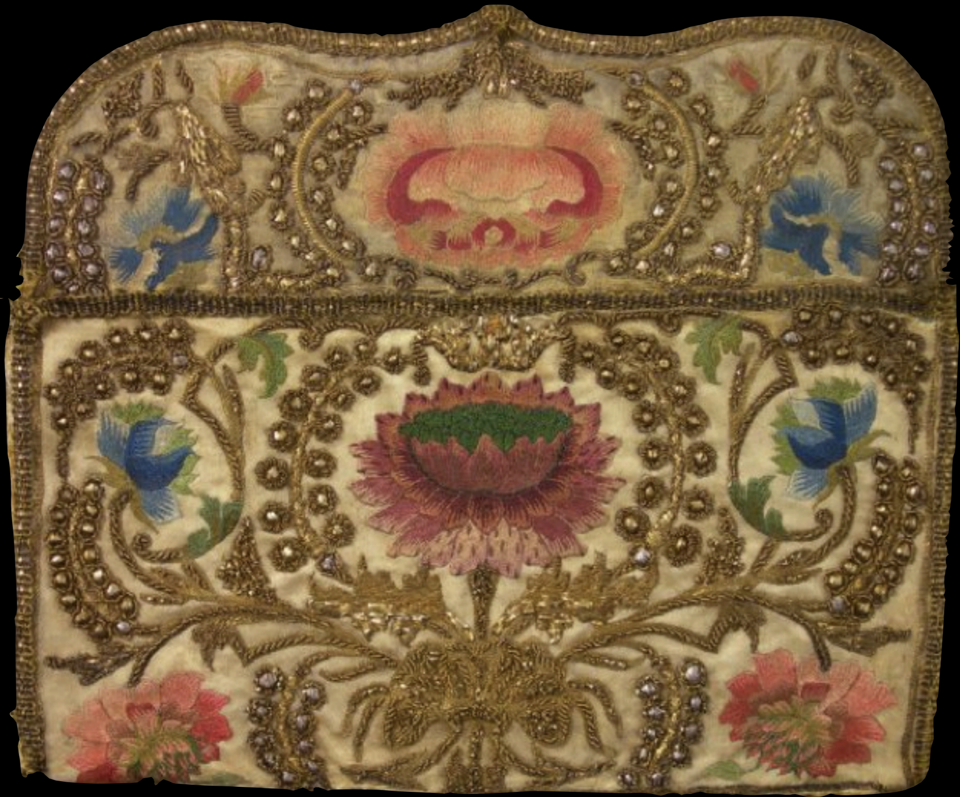
Turkish Silk Pocket Book Embroidered with Silk and Metallic Threads & Metal Purl