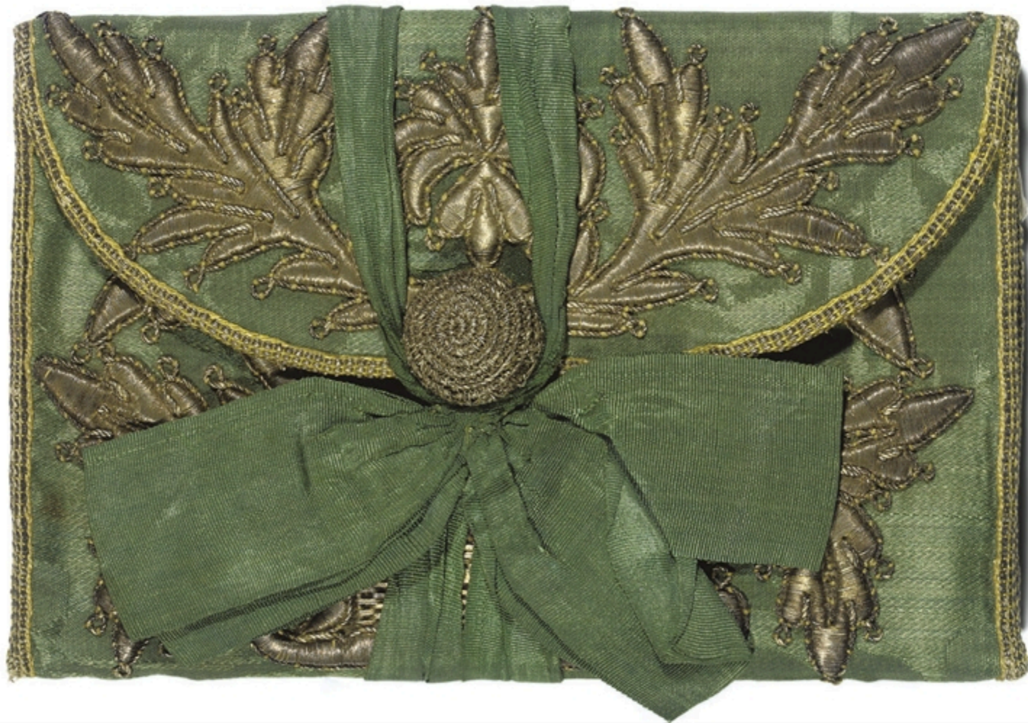
Continental Europe Silk Pocket Book or Letter Case with Metallic Embroidery 18th Century (Sotheby's)