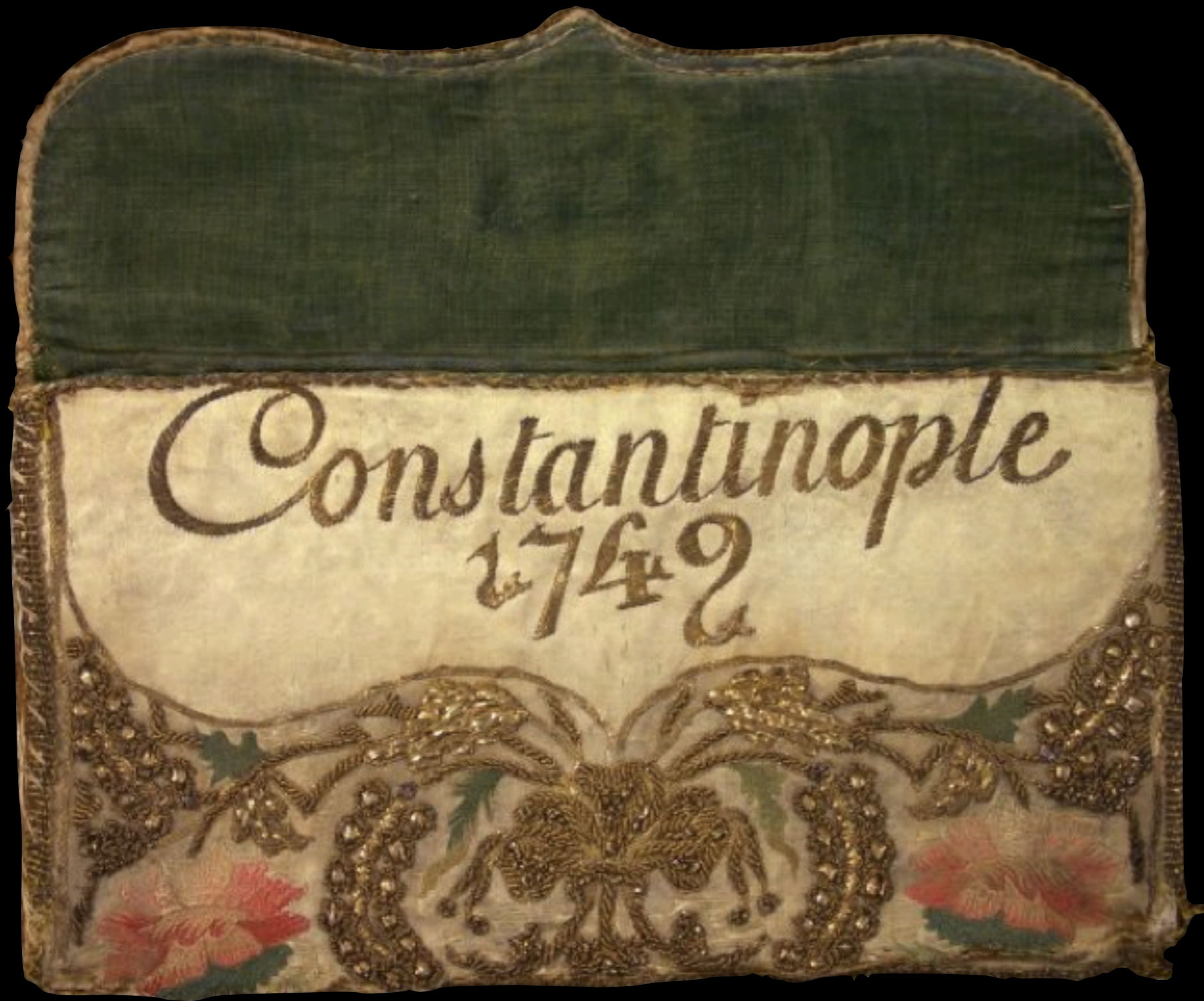
Turkish Silk Pocket Book Embroidered with Silk and Metallic Threads & Metal Purl