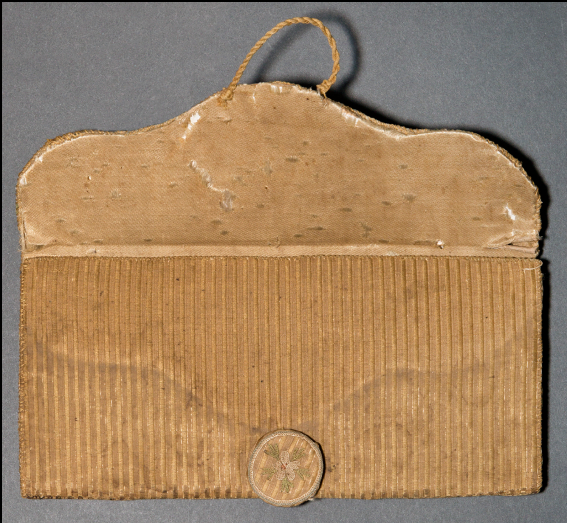
English Silk Embroidered Pocket Book c. 1770 - 1800 (Winterthur)