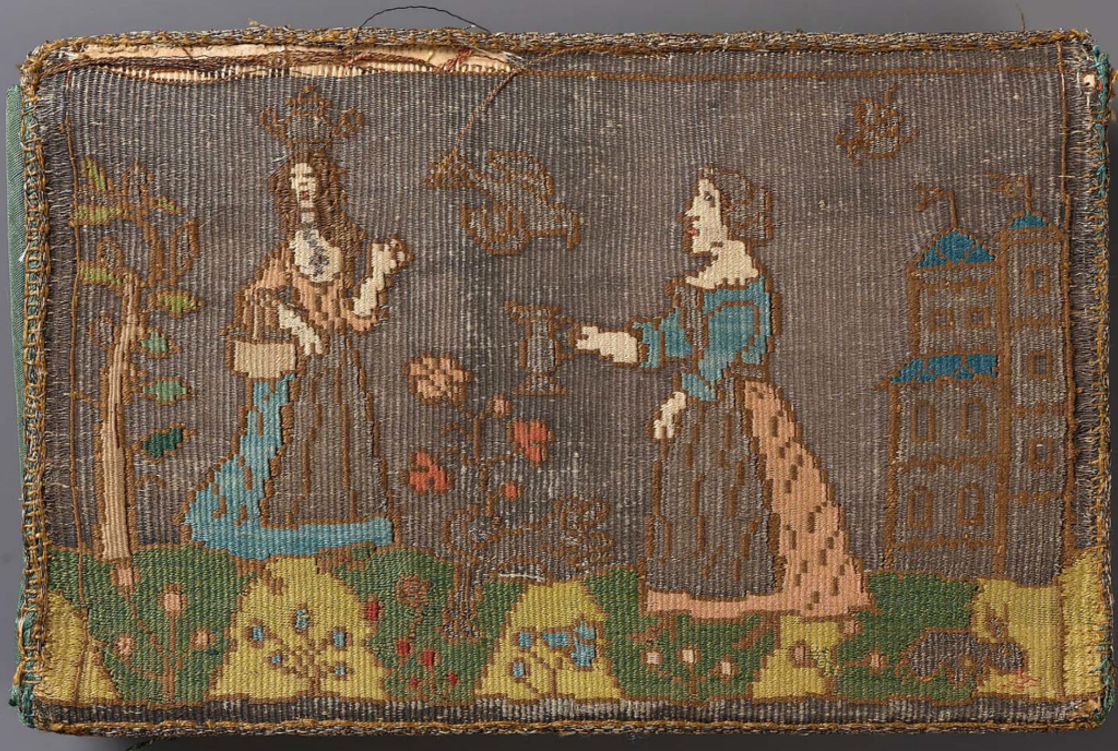
French Silk & Metallic Thread Embroidered Pocket Book 17th Century (Museum of Fine Arts, Boston)