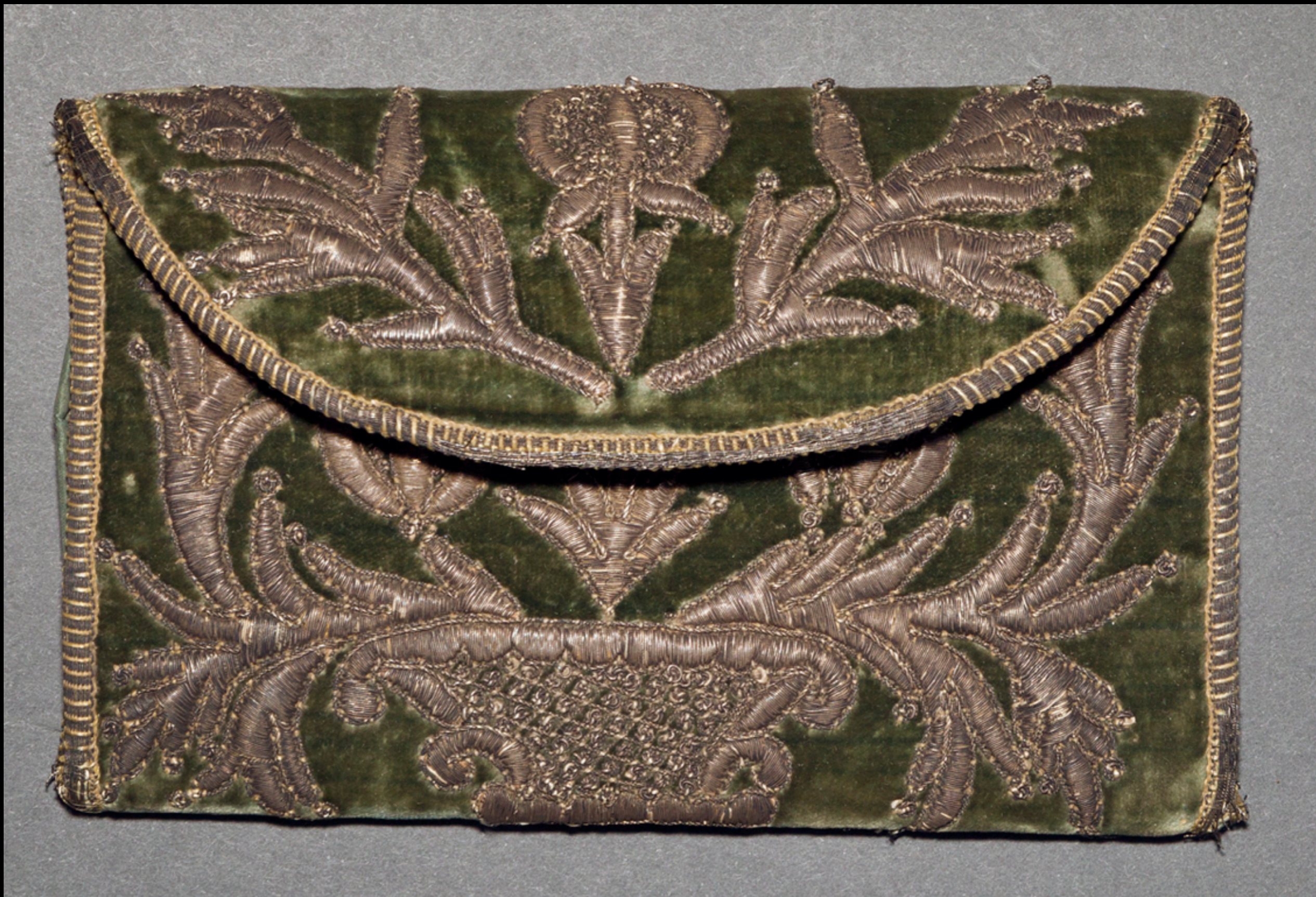
Continental Europe or North American Silk Pocket Book with Metallic Embroidery Late 18th Century (Winterthur)