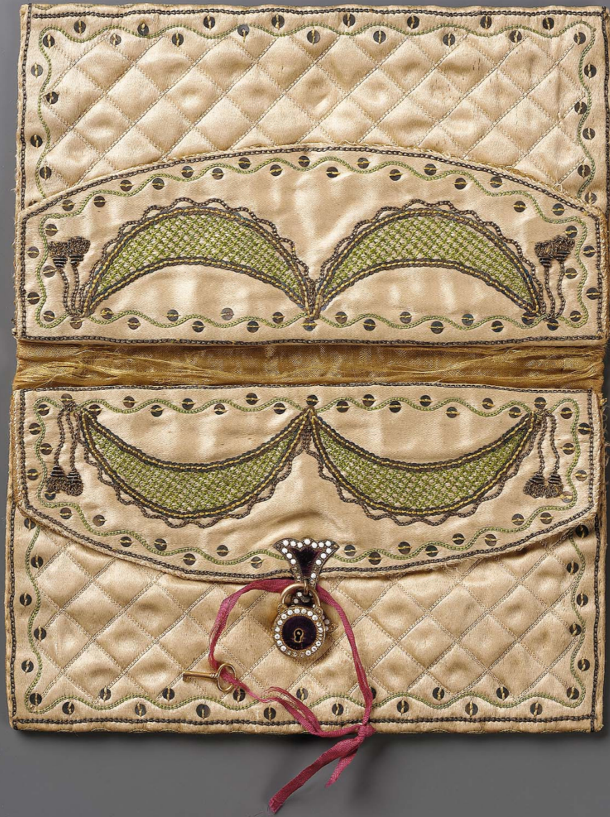
French Silk with Metallic Thread Pocket Book Mid to Late 18th Century (Museum of Fine Arts, Boston)