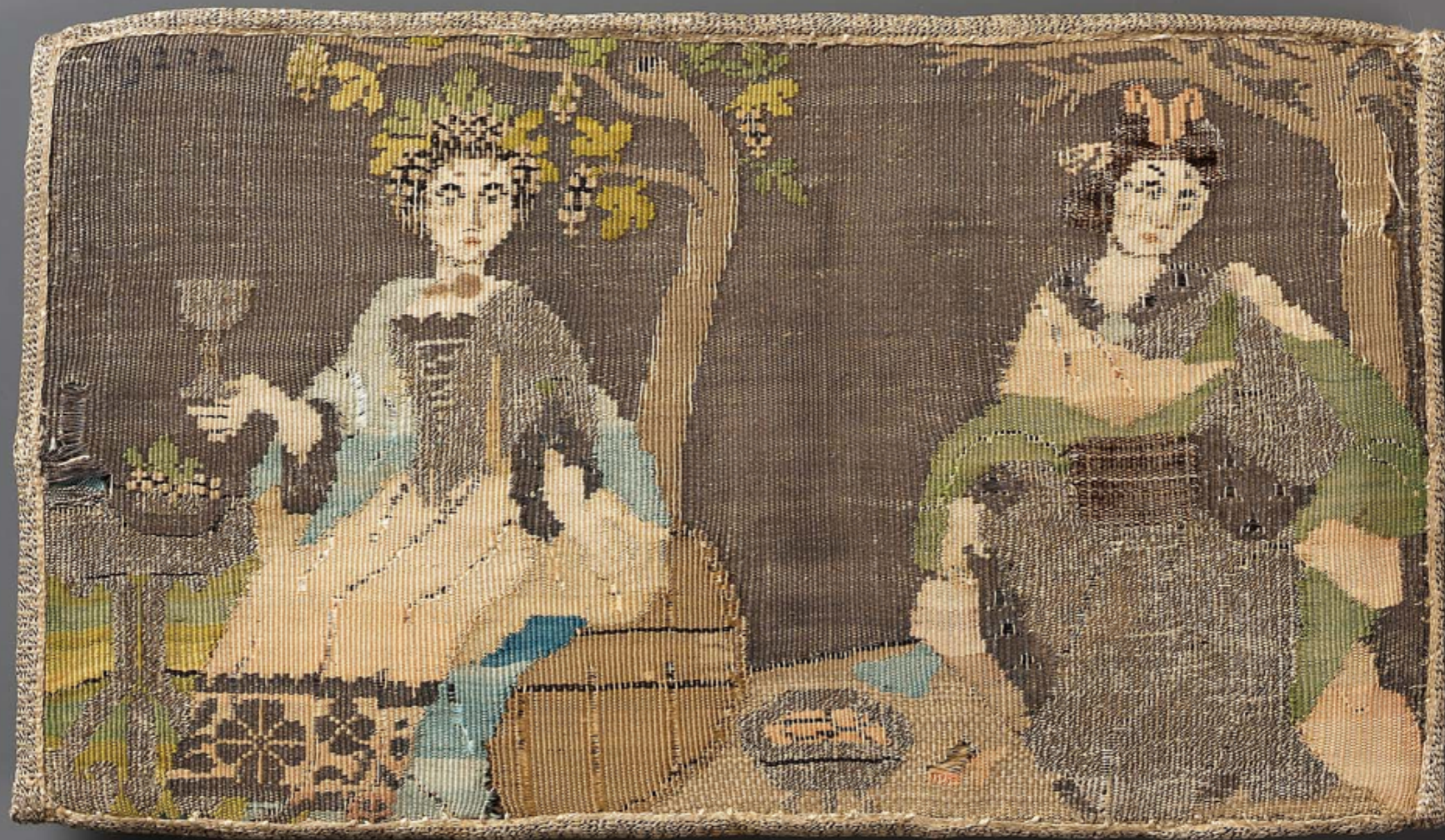
French Silk & Metallic Thread Embroidered Pocket Book c. 1660 - 1690 (Museum of Fine Arts, Boston)