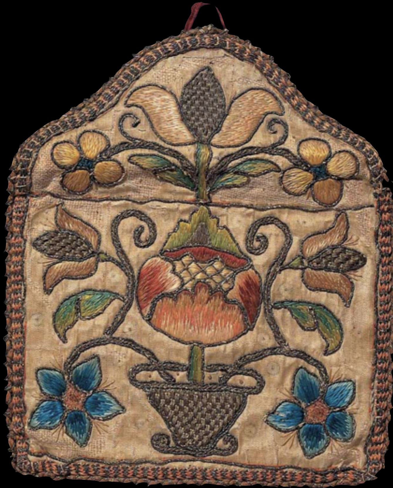
American Silk Embroidered Pocket Book from Chester County, Pennsylvania c. 1720 - 1750 (American Folk Art Museum of New York)