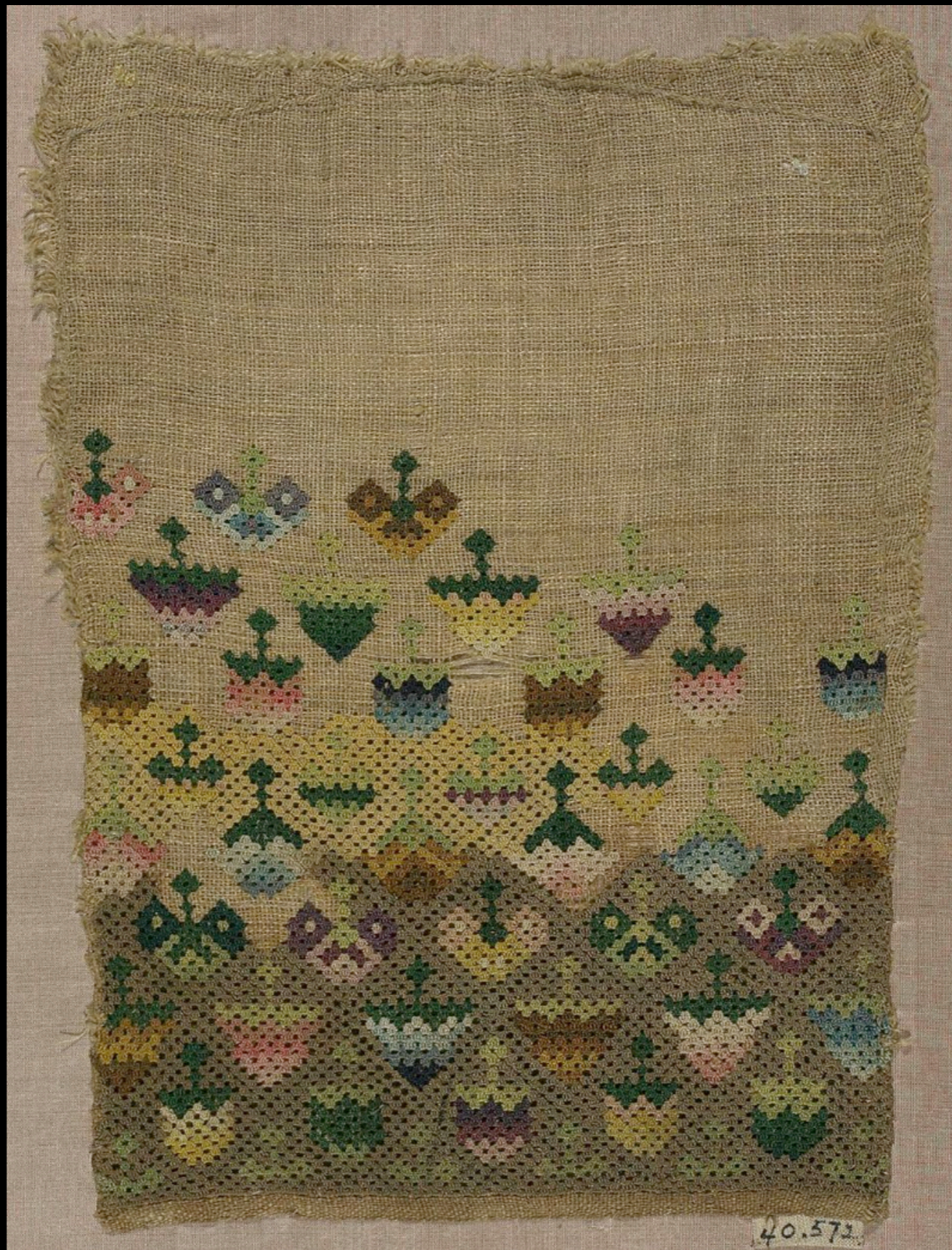
New England Linen with Silk Embroidery Unfinished Pocket Book Late 18th Century (Museum of Fine Arts, Boston)