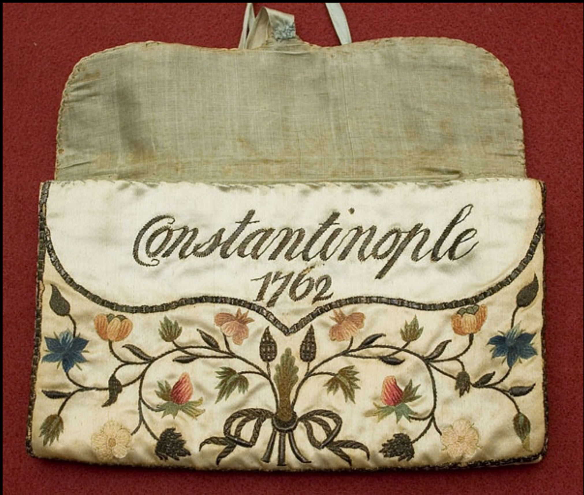
Turkish Silk Pocket Book Embroidered with Silk and Metallic Threads & Metal Purl