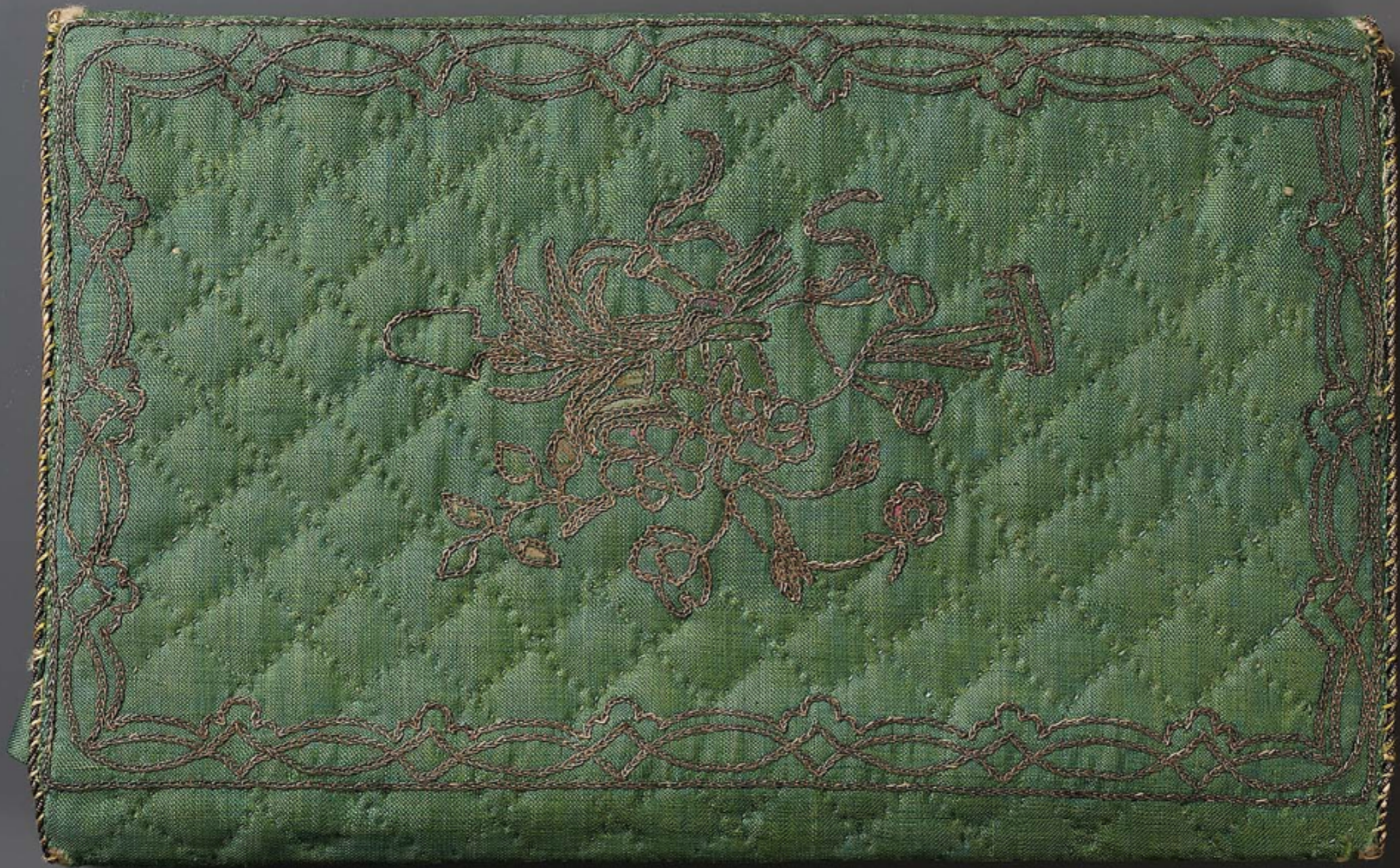
French Silk with Metallic Thread Pocket Book Mid to Late 18th Century (Museum of Fine Arts, Boston)