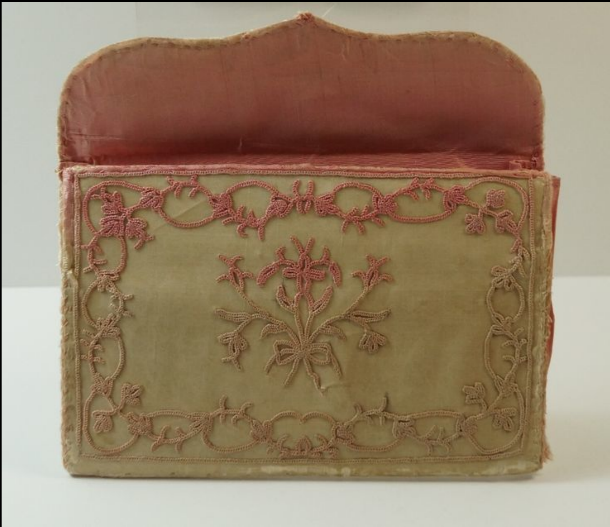
Silk Embroidered Pocket Book 18th Century