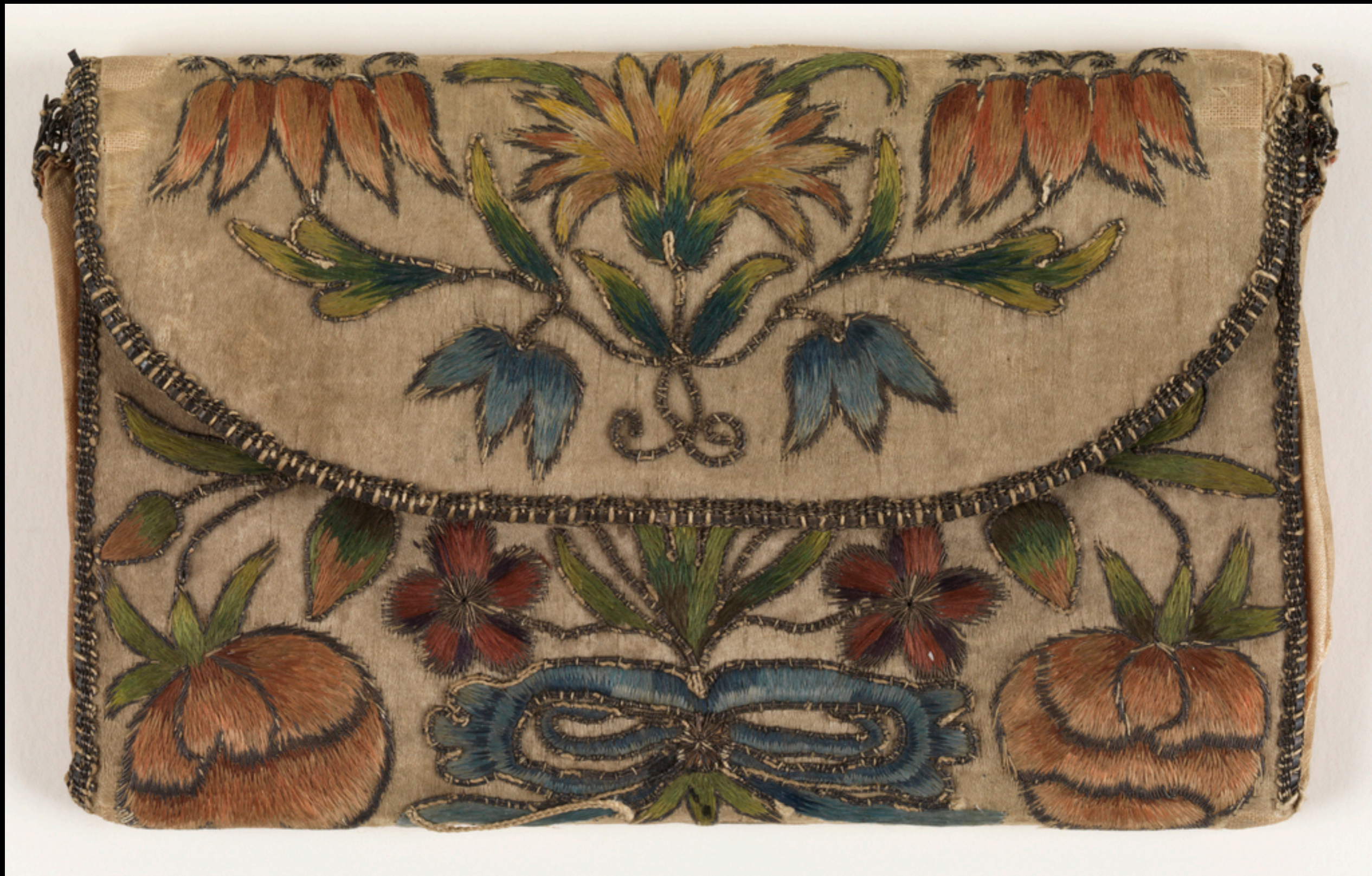
French Satin Pocketbook Embroidered with Flowers in Polychrome Silks & Metal Threads, Trimmed with Metallic Bobbin Lace 18th Century (Cooper - Hewitt Museum, Smithsonian)