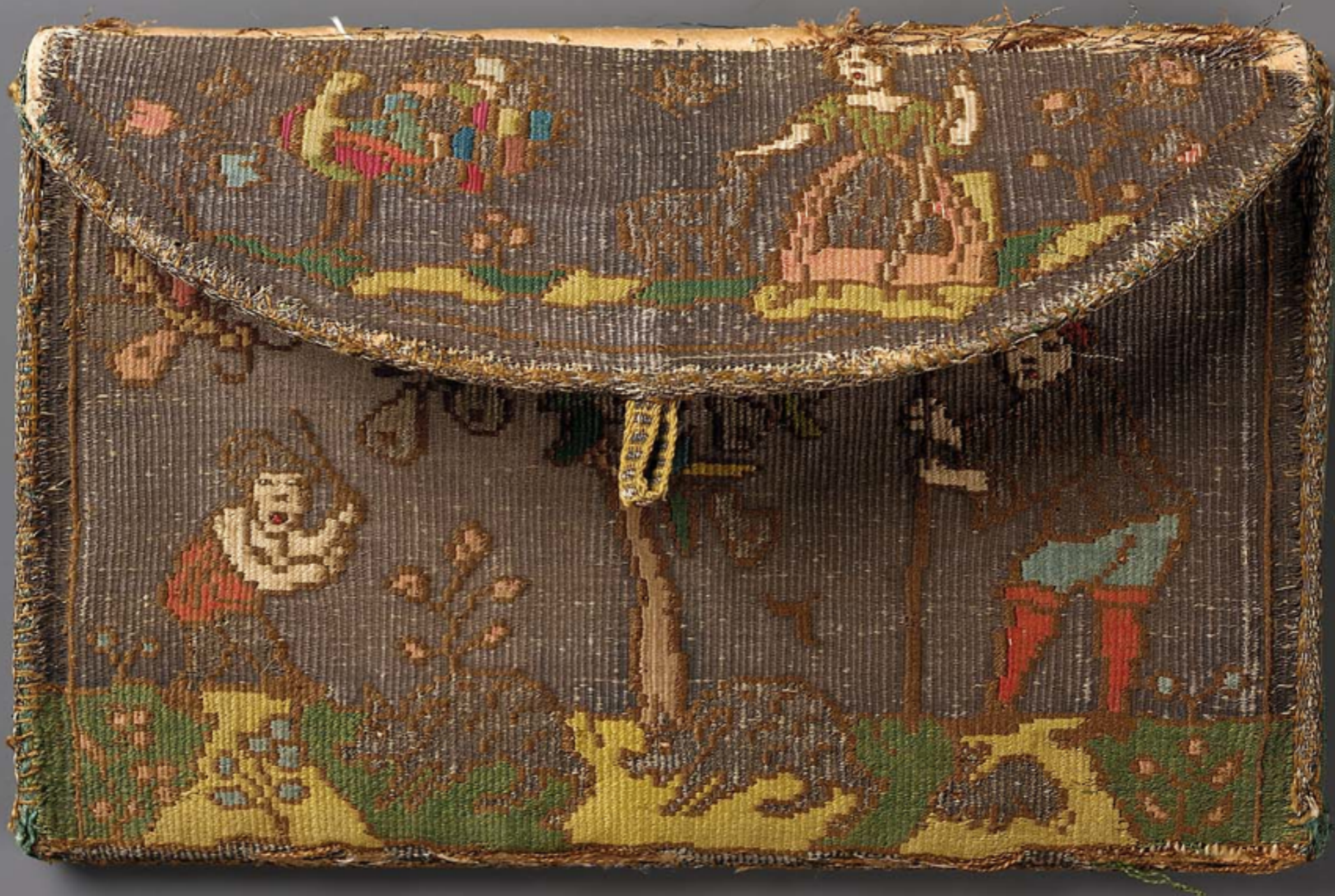
French Silk & Metallic Thread Embroidered Pocket Book 17th Century (Museum of Fine Arts, Boston)