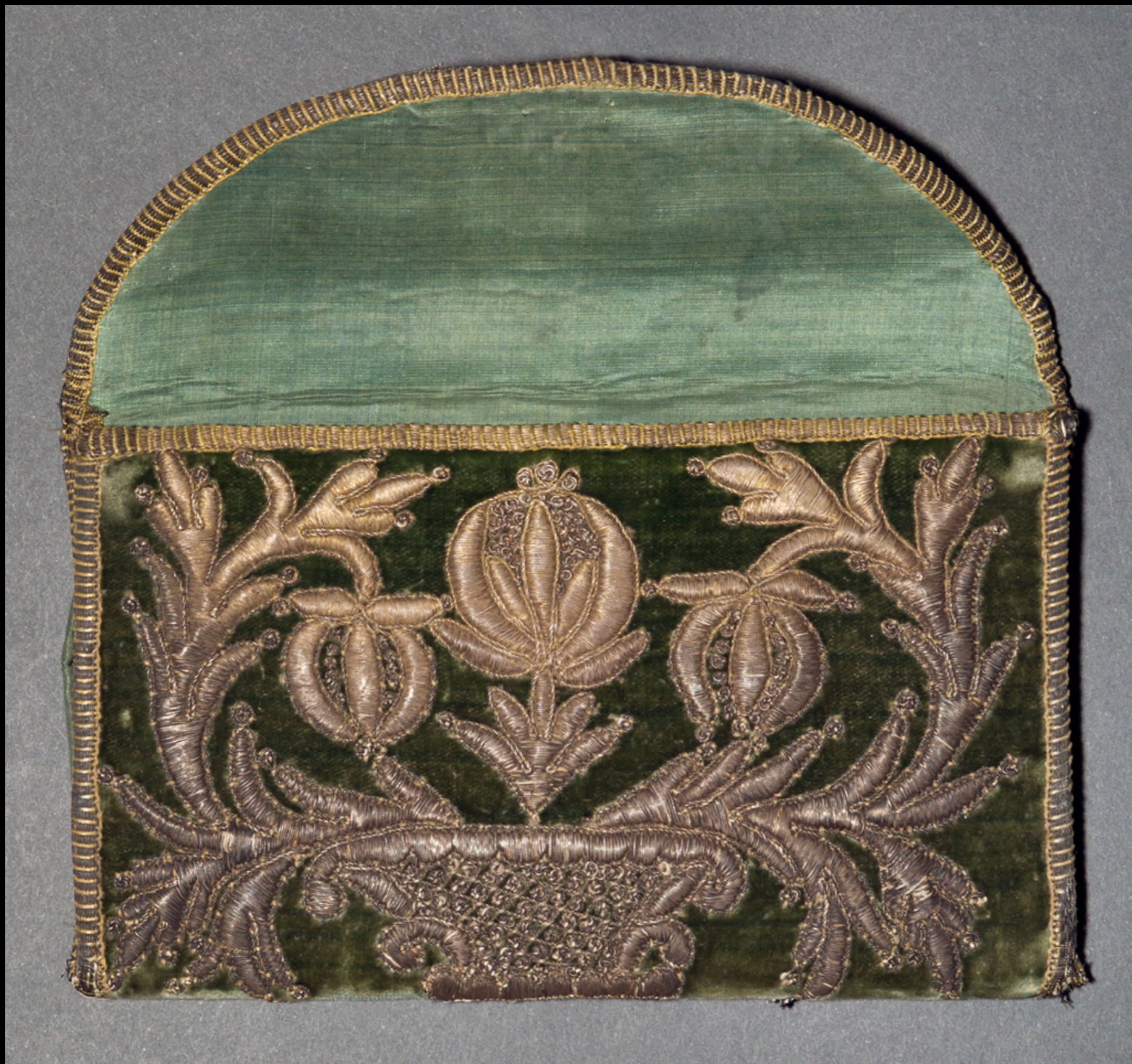
Continental Europe or North American Silk Pocket Book with Metallic Embroidery Late 18th Century (Winterthur)