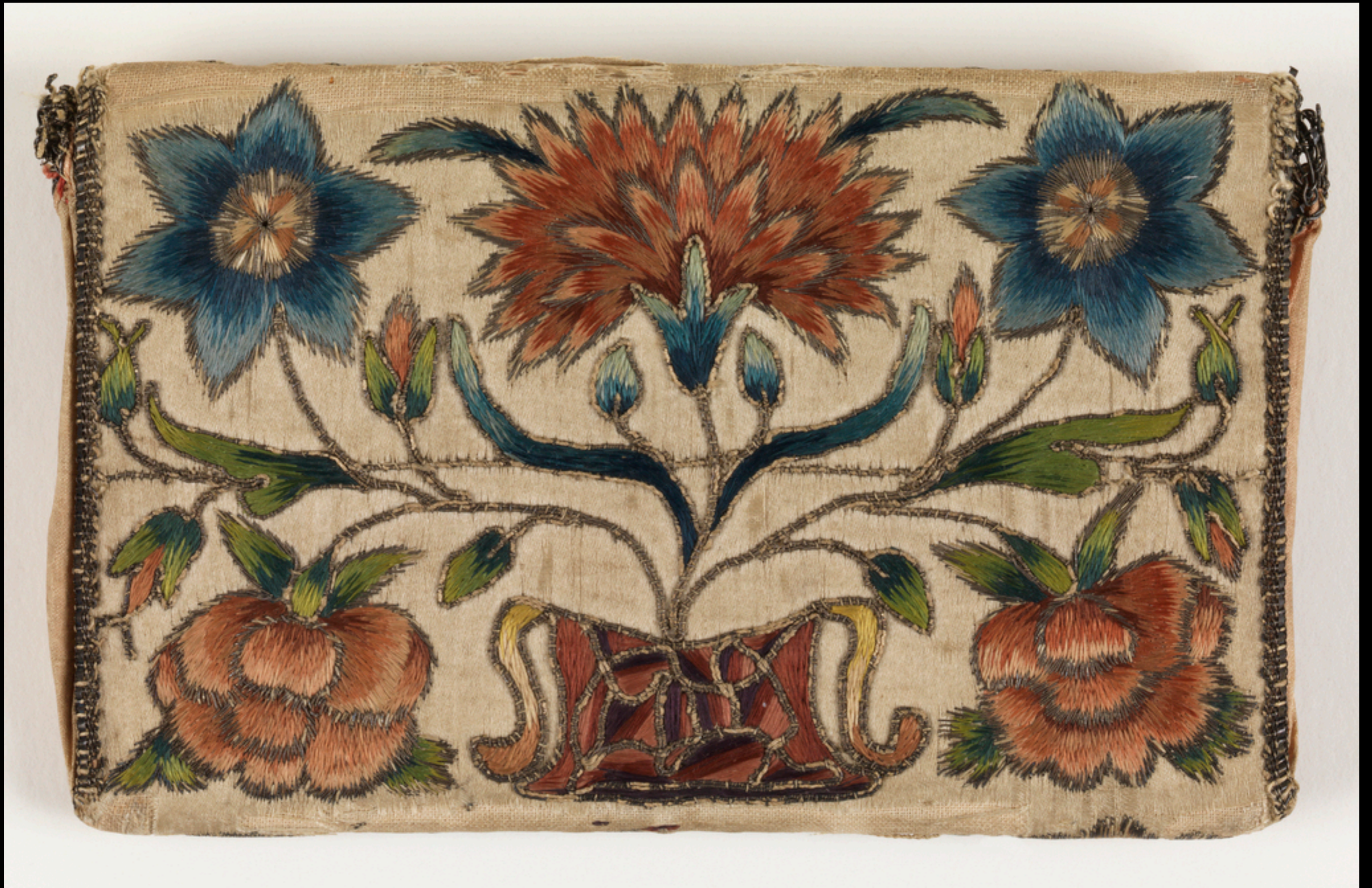
French Satin Pocketbook Embroidered with Flowers in Polychrome Silks & Metal Threads, Trimmed with Metallic Bobbin Lace 18th Century (Cooper - Hewitt Museum, Smithsonian)