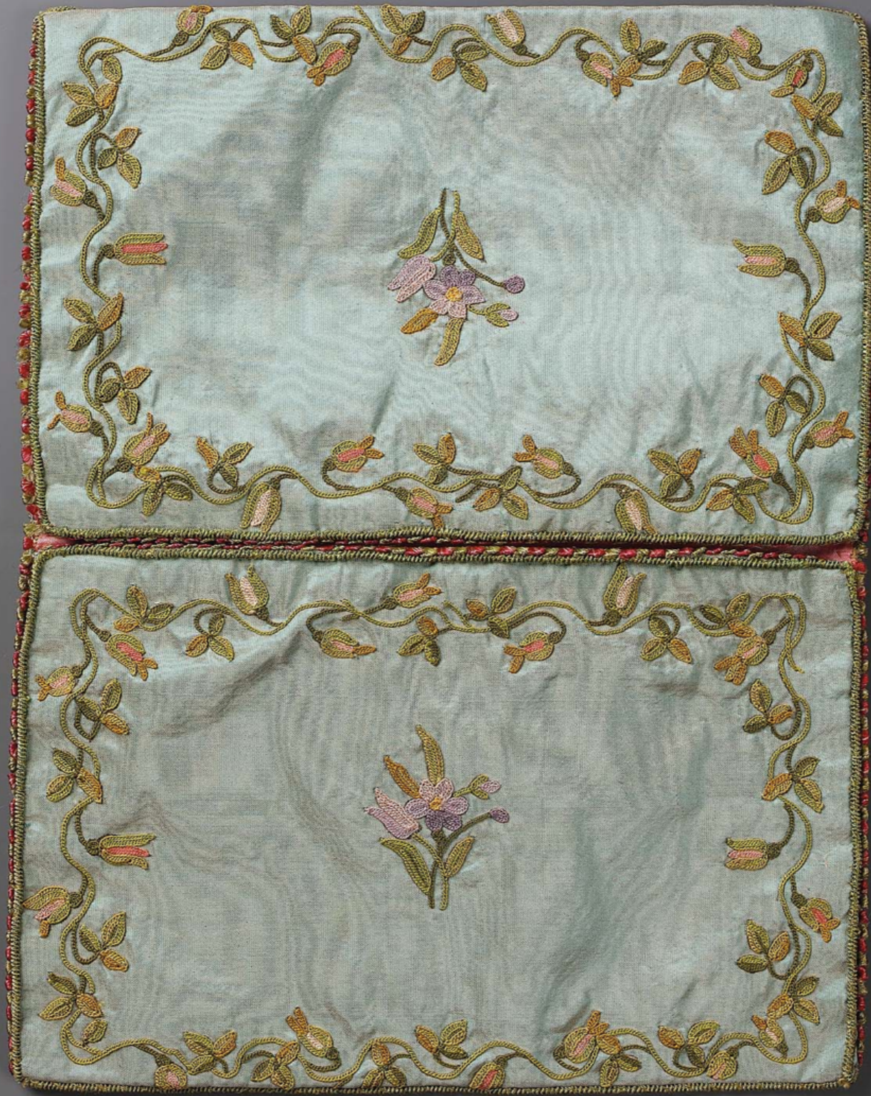
French Silk Appliquéd Pocket Book Embroidered with Silk c. 1775 - 1790 (Museum of Fine Arts, Boston)