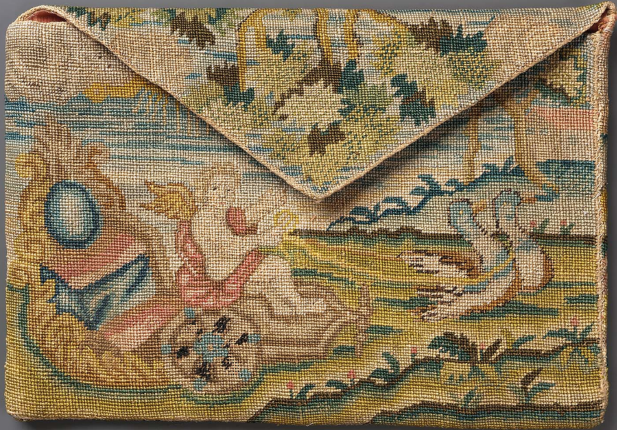
English Linen with Silk Embroidery Pocketbook 17th Century (Museum of Fine Arts, Boston)