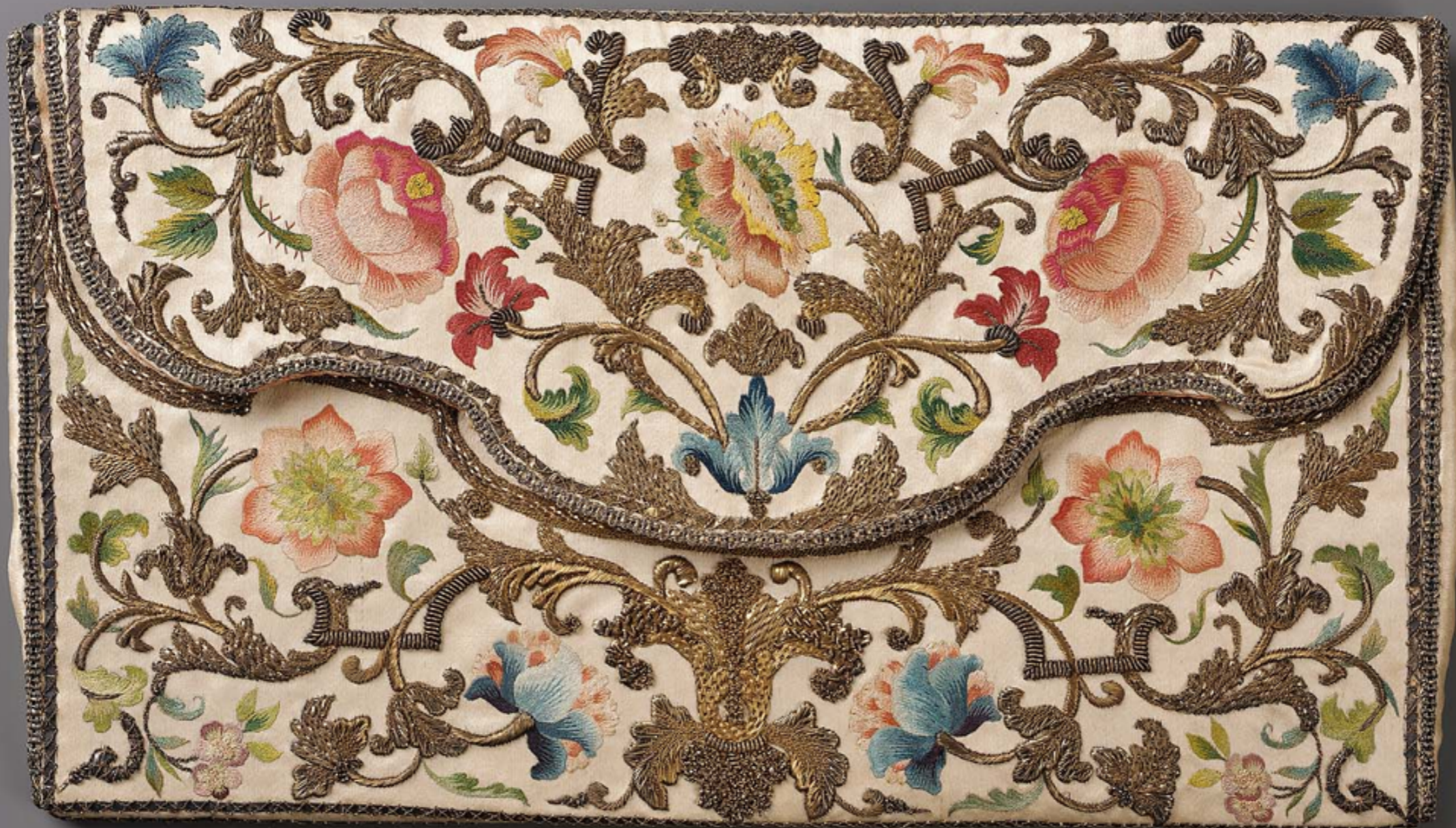
Turkish Silk Pocket Book Embroidered with Silk and Metallic Threads, Metal Purl, Flat Metal Strips & Chain