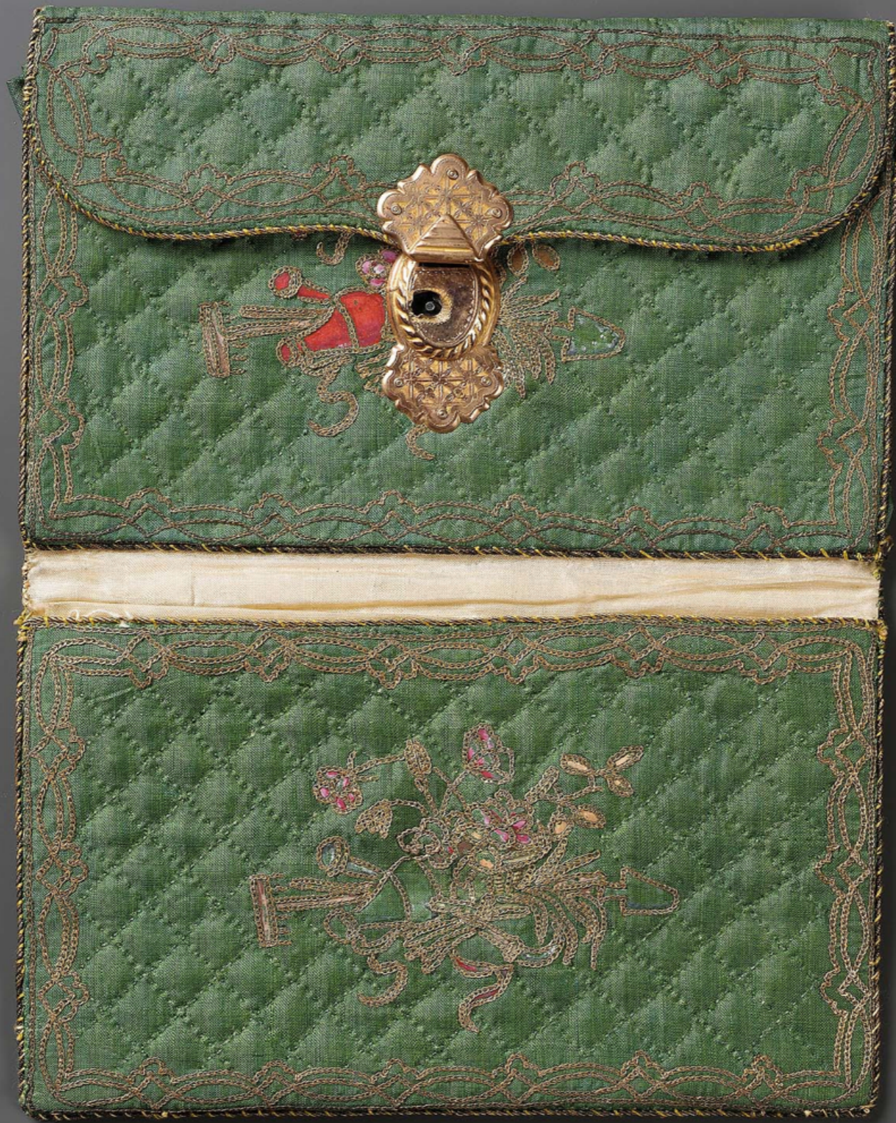
French Silk with Metallic Thread Pocket Book Mid to Late 18th Century (Museum of Fine Arts, Boston)