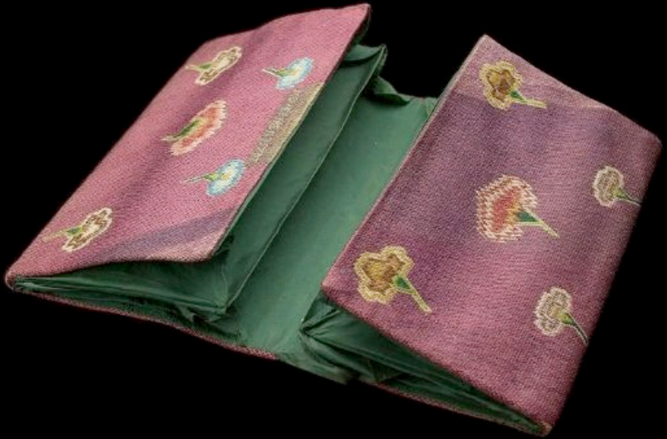
American Linen with Silk Embroidery Pocketbook from Massachusetts 1787 (Museum of Fine Arts, Boston)