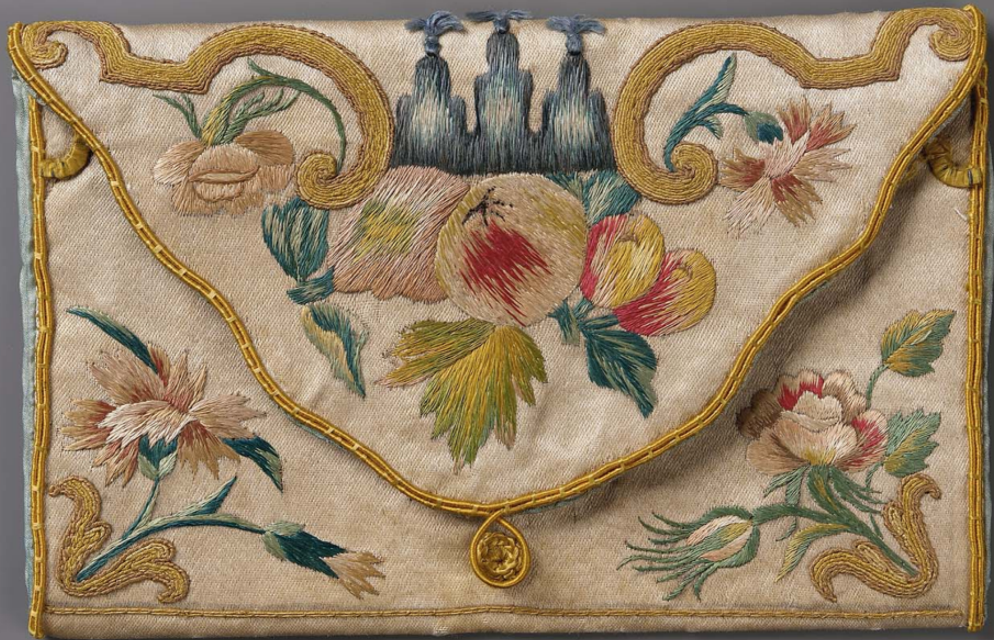
English or French Silk Embroidered Pocketbook c. 1725 - 1775 (Museum of Fine Arts, Boston)