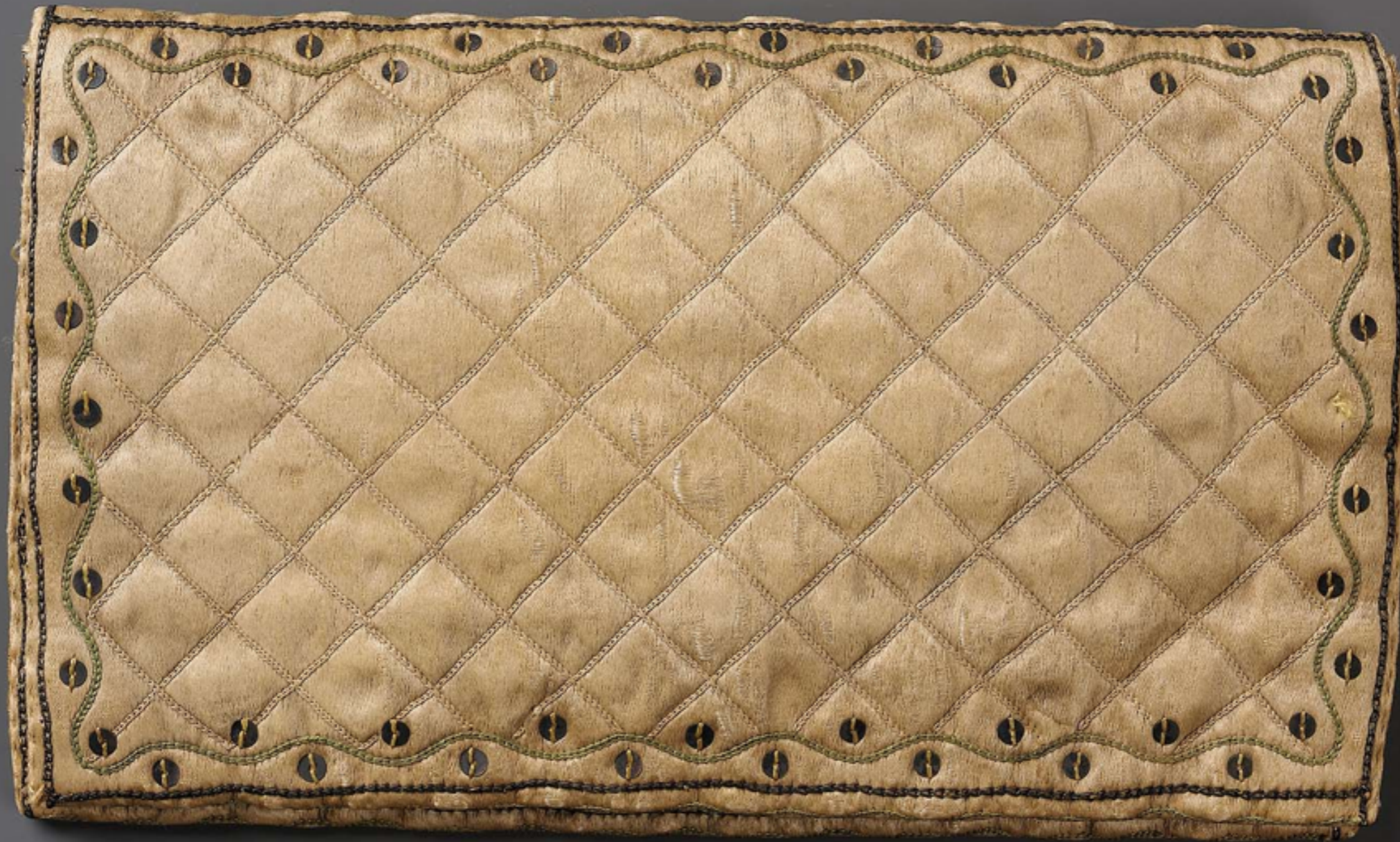
French Silk with Metallic Thread Pocket Book Mid to Late 18th Century (Museum of Fine Arts, Boston)