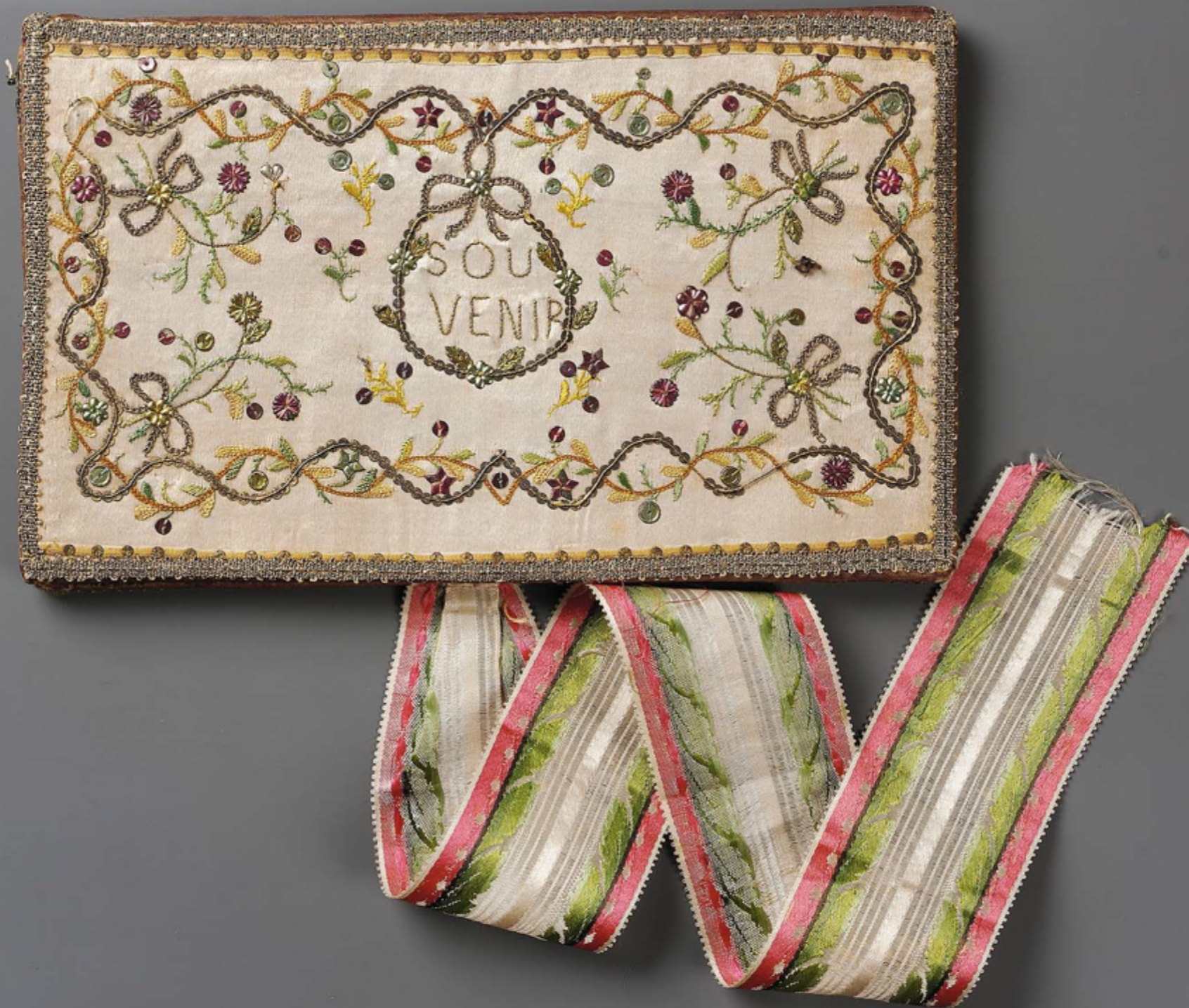
French or English Silk Pocket Book Embroidered with Silk, Metallic Threads & Metal Spangles Late 18th Century (Museum of Fine Arts, Boston)