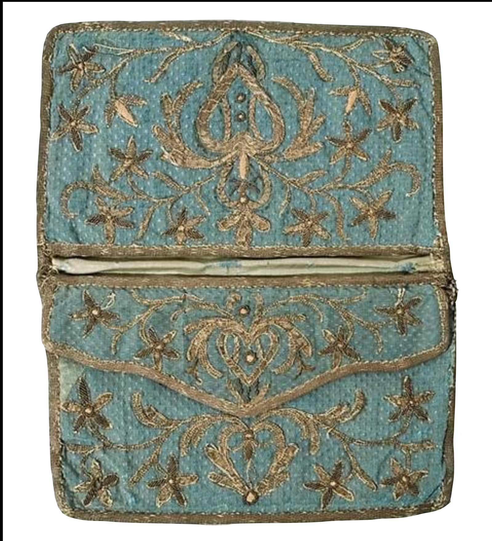
Silk Pocketbook with Metallic Lace Embroidery Mid 18th Century (Private Collection)