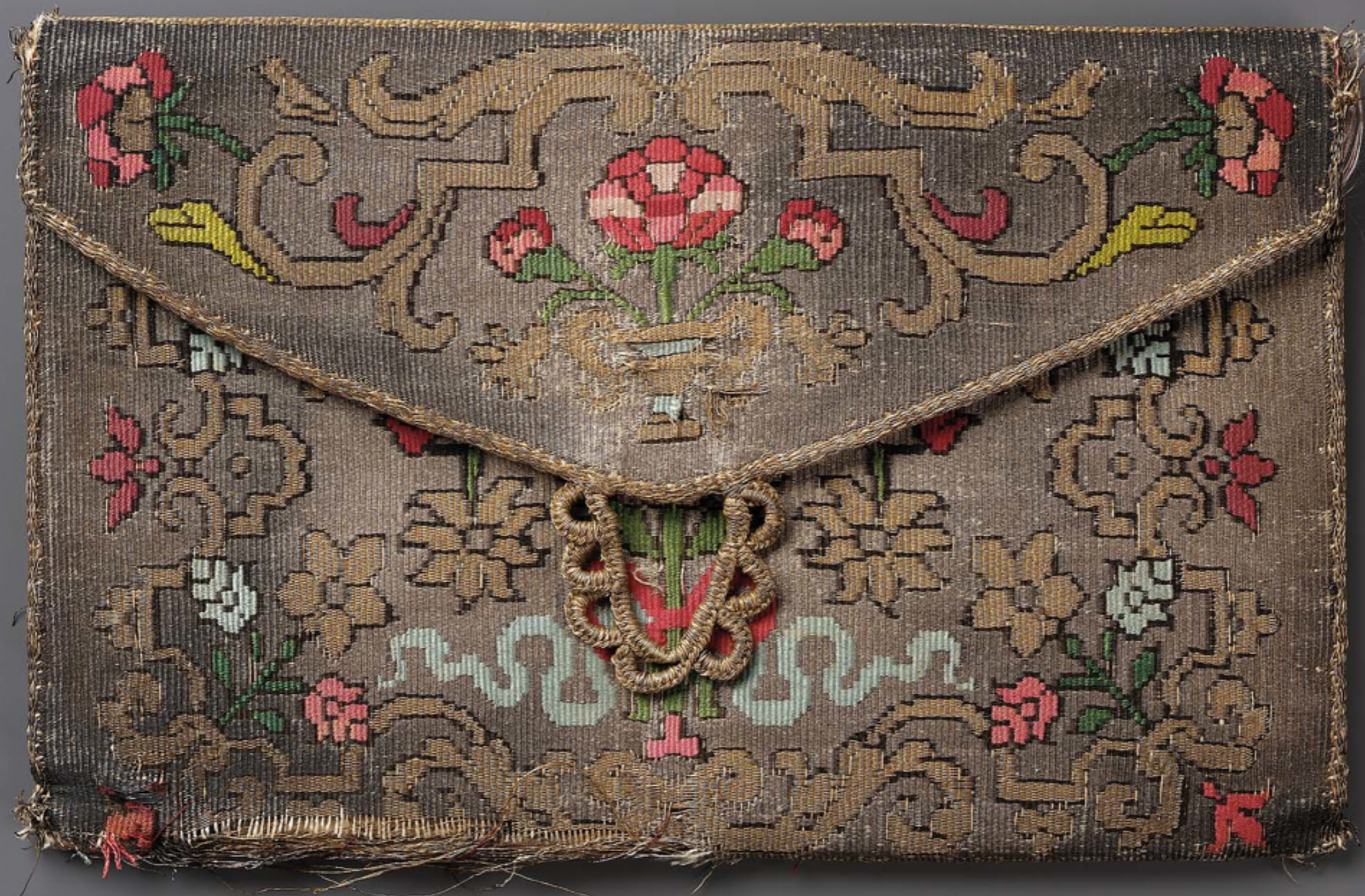
French Silk & Metallic Thread Embroidered Pocket Book c. 1600 - 1650 (Museum of Fine Arts, Boston)