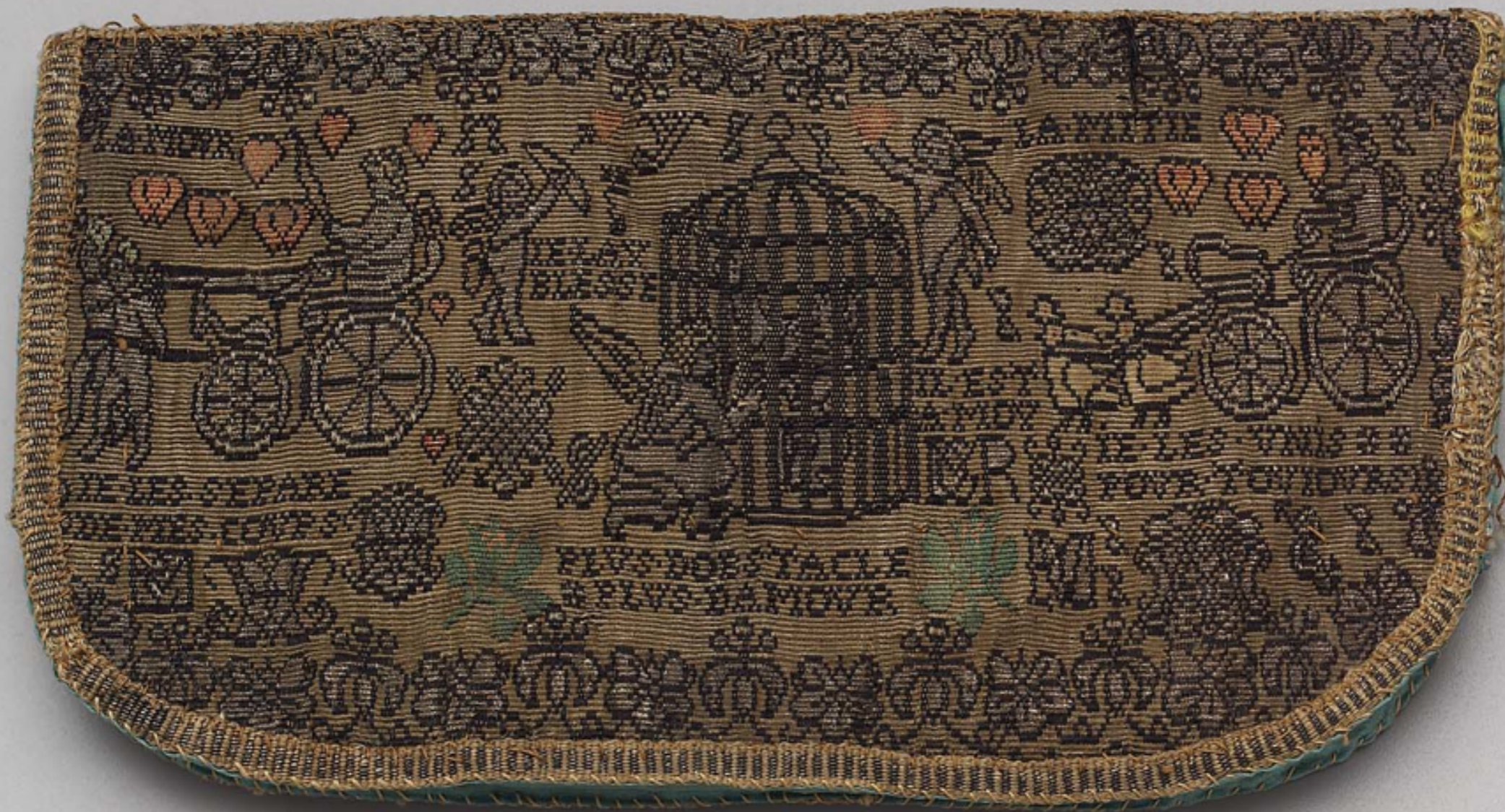
French Silk & Metallic Thread Embroidered Pocket Book Early 17th Century (Museum of Fine Arts, Boston)