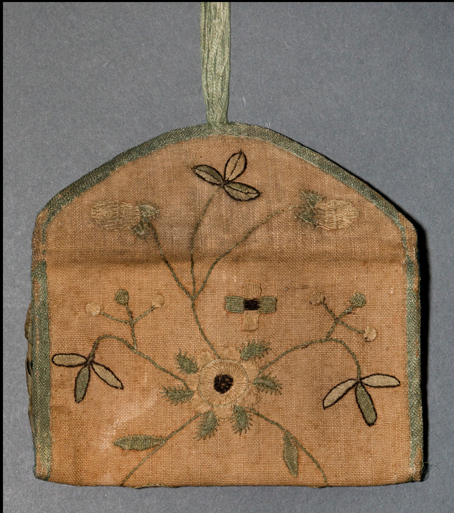
American Silk Embroidery on Linen Pocket Book from Philadelphia, Pennsylvania "W * B" c. 1750 - 1810 (Winterthur)