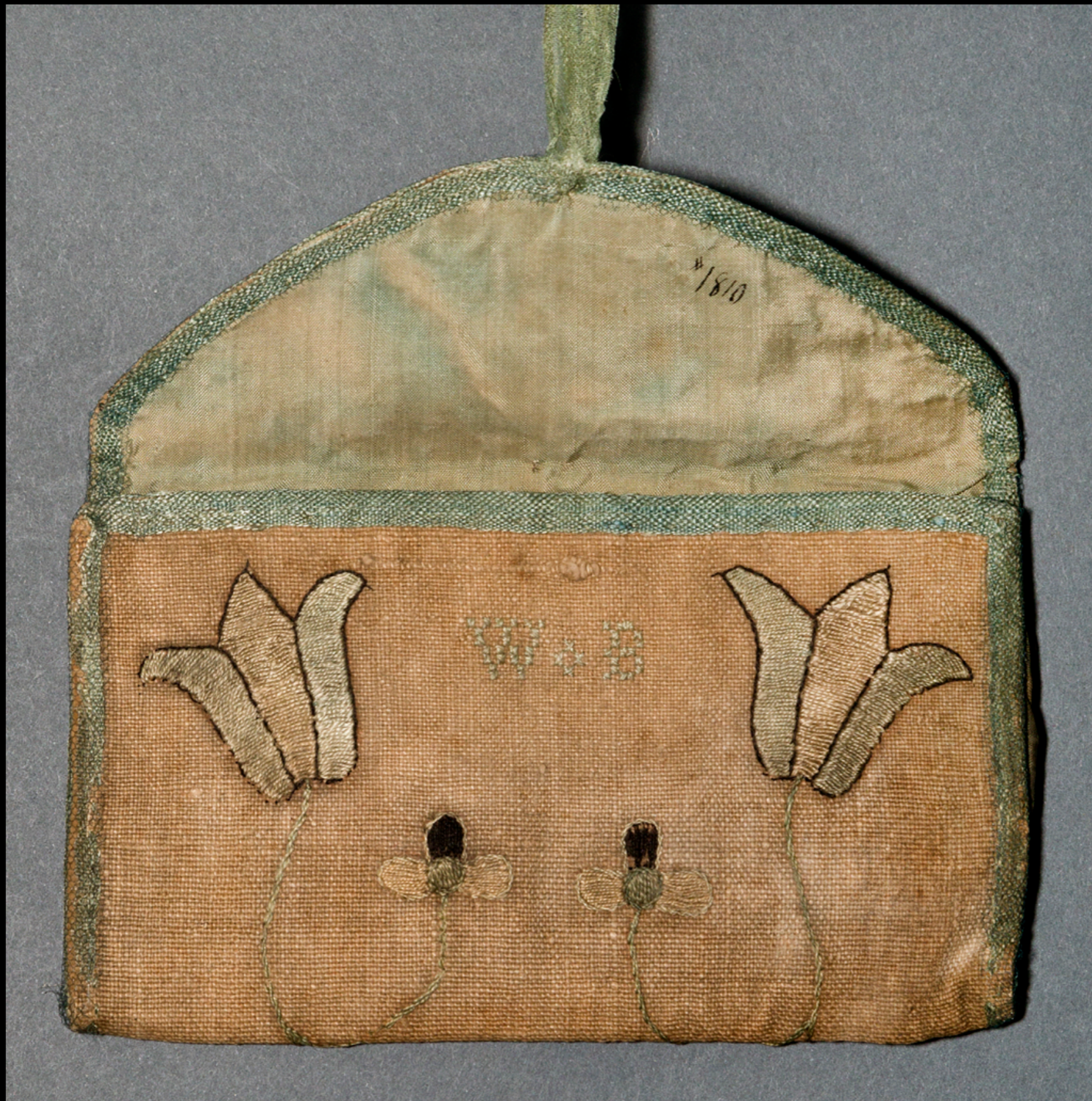
American Silk Embroidery on Linen Pocket Book from Philadelphia, Pennsylvania "W*B" c. 1750 - 1810 (Winterthur)