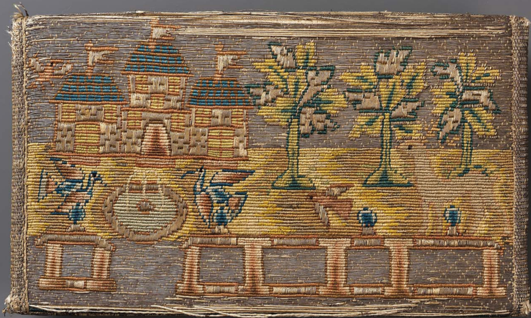
French Silk & Metallic Thread Embroidered Pocket Book 17th Century (Museum of Fine Arts, Boston)