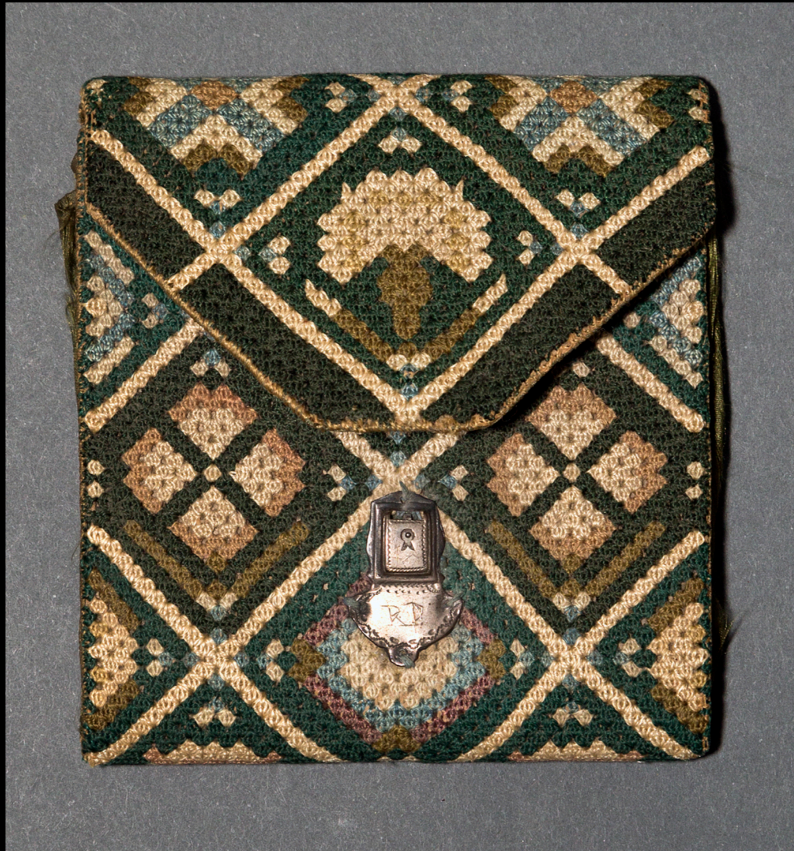
American Silk Embroidered Pocket Book