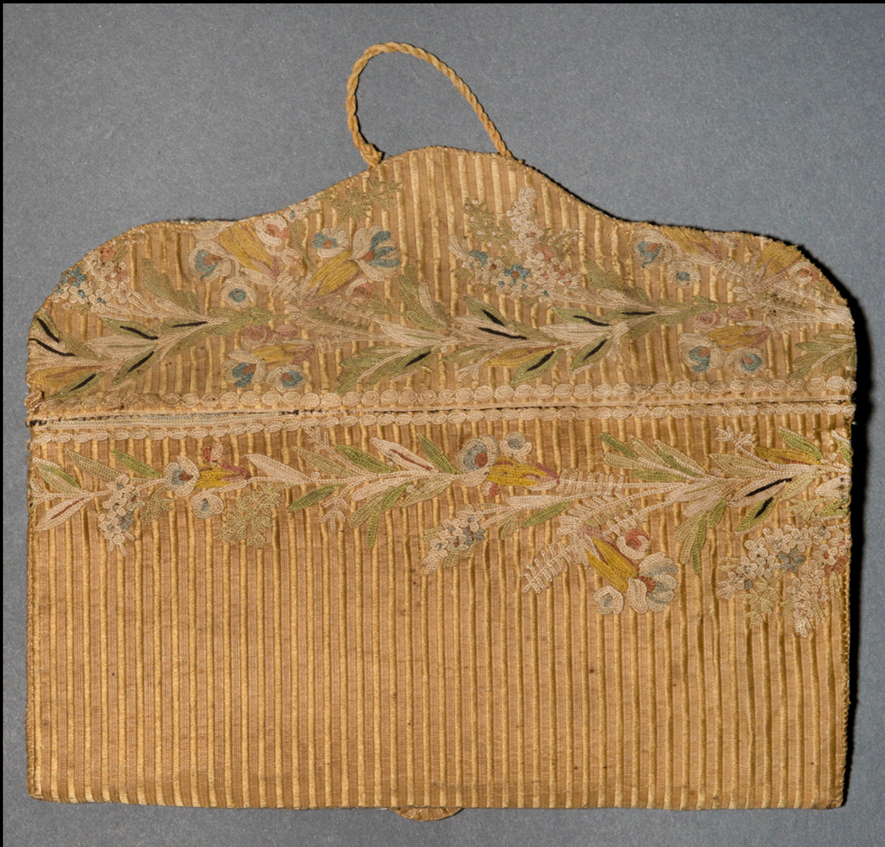
English Silk Embroidered Pocket Book c. 1770 - 1800 (Winterthur)