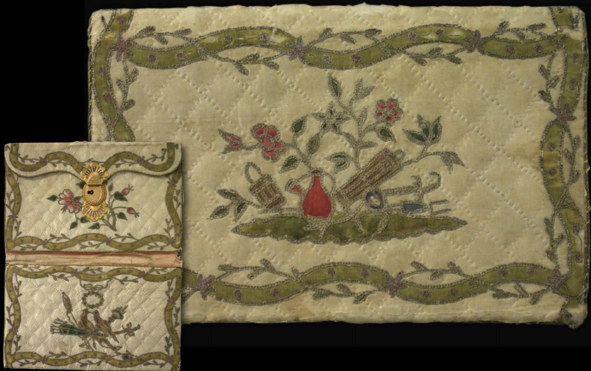
French Silk & Silver Gilt Metallic Thread Pocketbook with Lock of Hair c. 1760 - 1780 (Colonial Williamsburg)