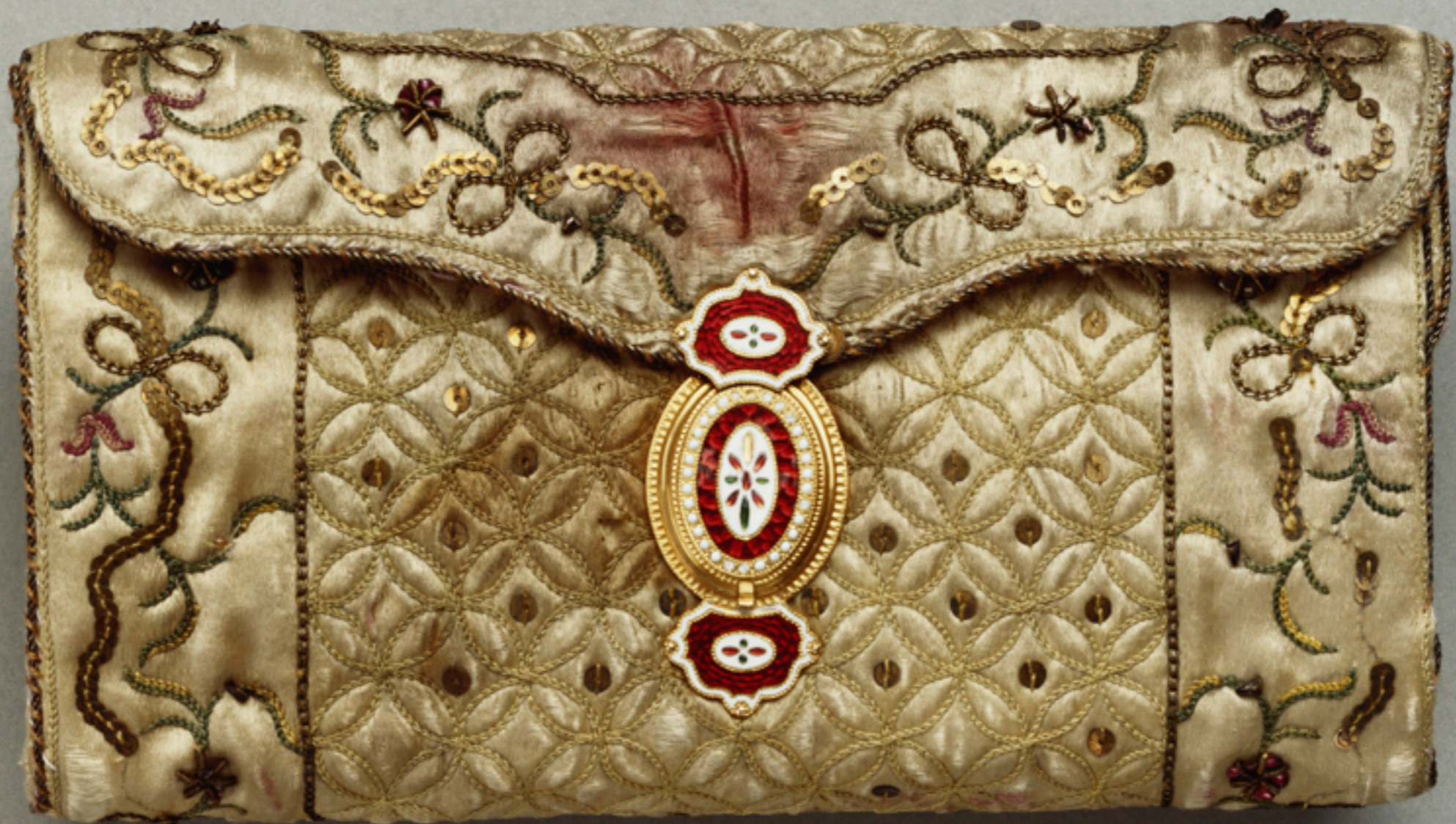
English Silk Pocketbook Embroidered with Silk & Metal Sequins and Closed by an Enamel Clasp Reported to Have been Made by Queen Charlotte and Given to Mrs. Delany in 1781 Contains Ten Sewing Tools (The Royal Collection)