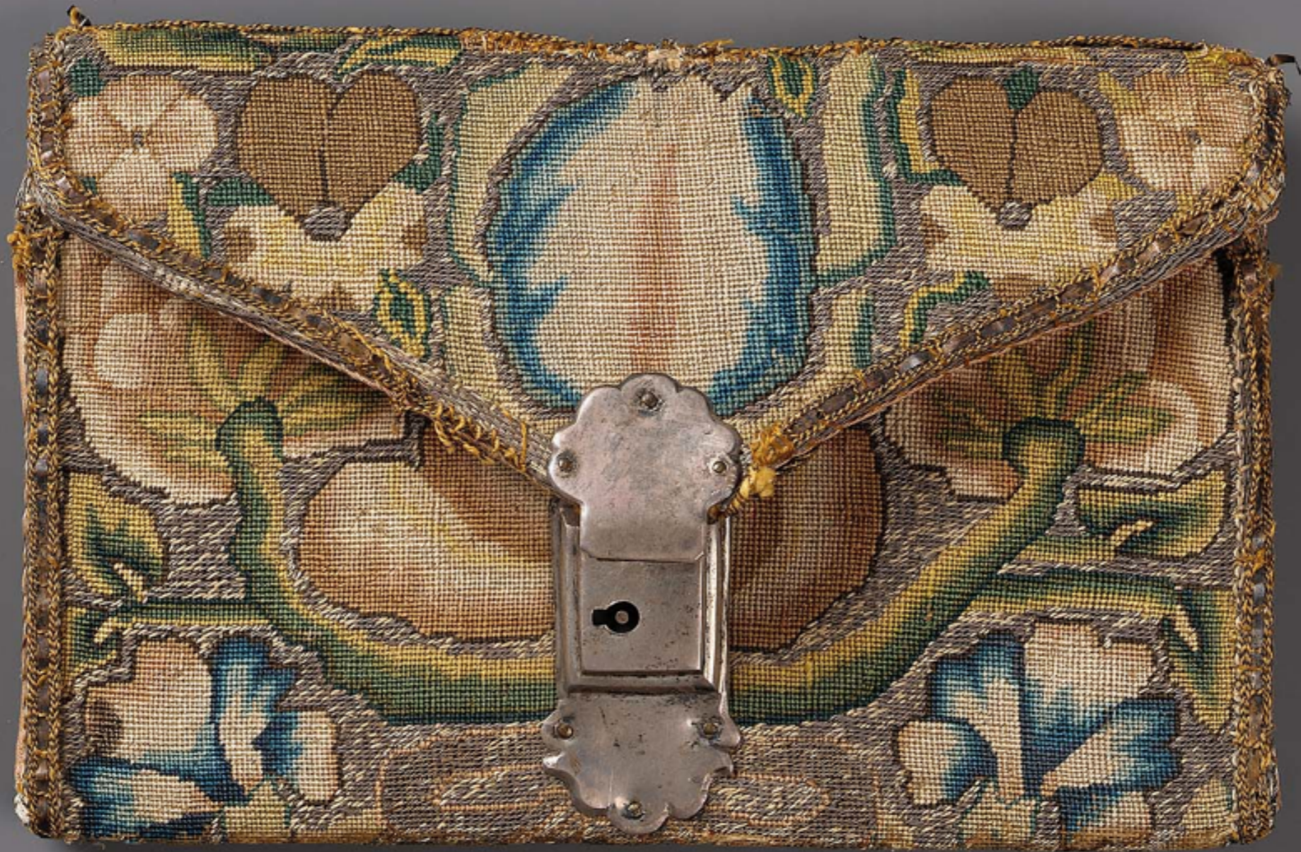
English Linen with Silk Embroidery Pocketbook 17th Century (Museum of Fine Arts, Boston)