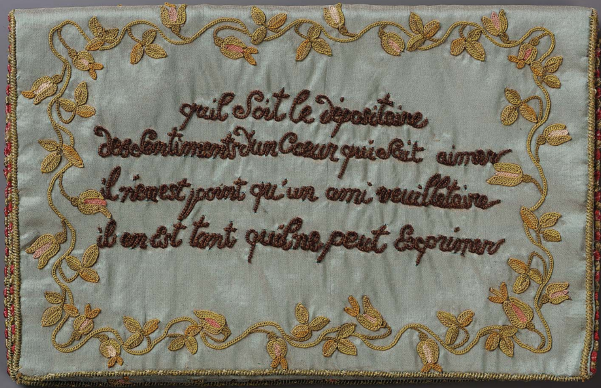
French Silk Appliquéd Pocket Book Embroidered with Silk