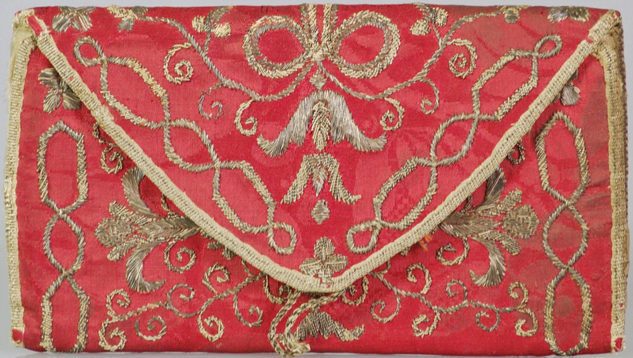
European Silk Pocketbook with Metallic Lace Embroidery