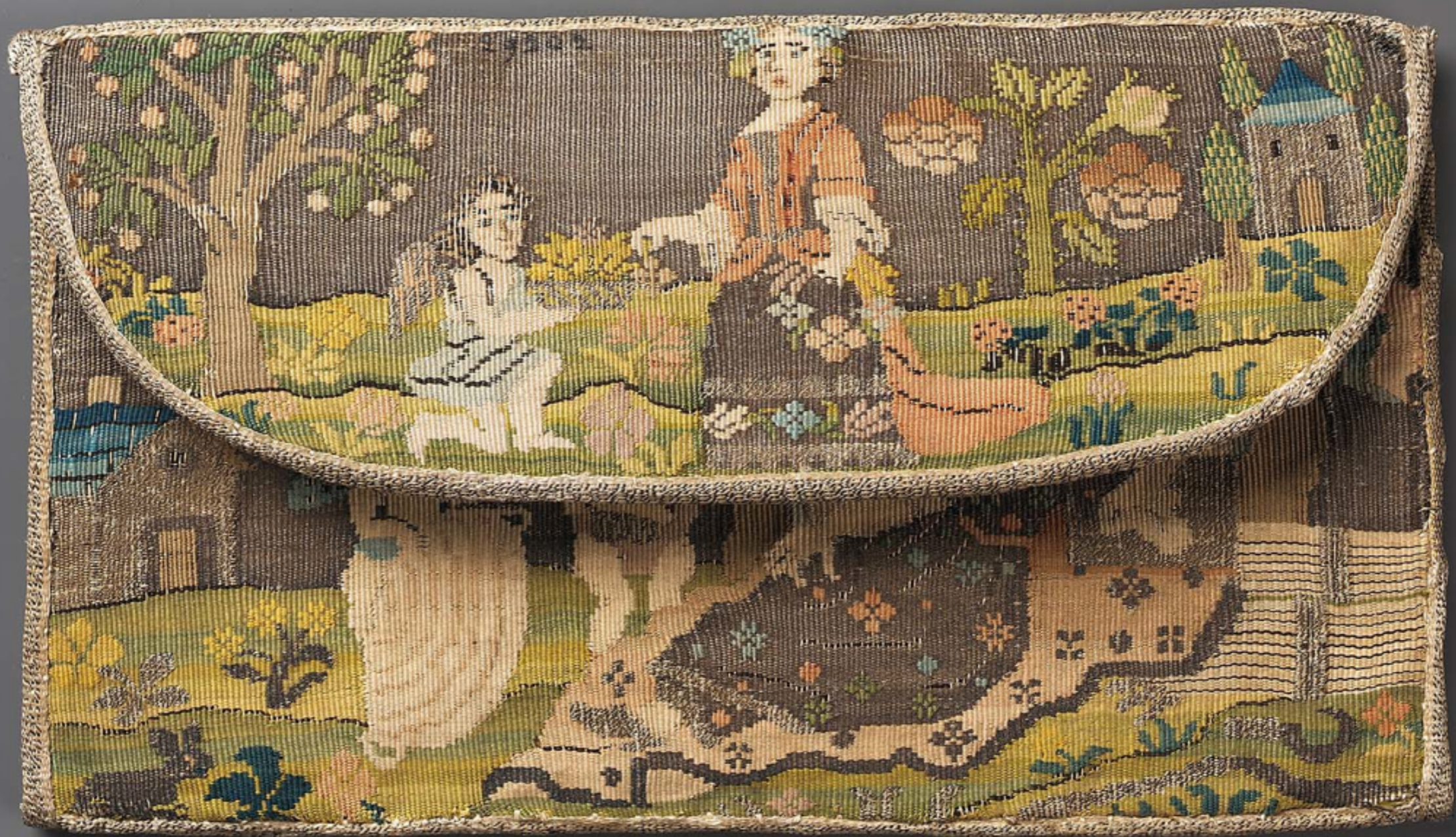
French Silk & Metallic Thread Embroidered Pocket Book c. 1660 - 1690 (Museum of Fine Arts, Boston)