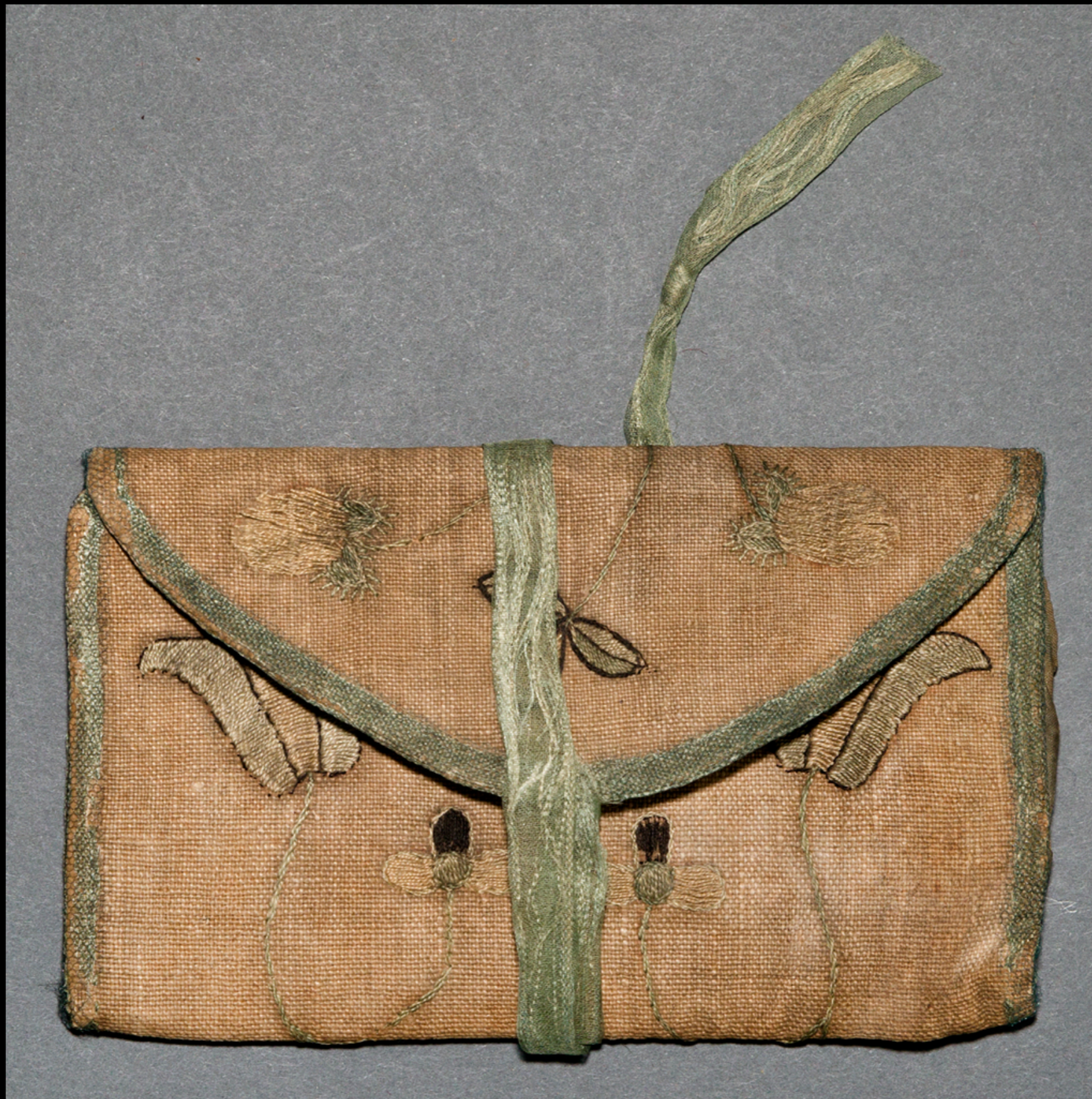
American Silk Embroidery on Linen Pocket Book from Philadelphia, Pennsylvania "W*B" c. 1750 - 1810 (Winterthur)