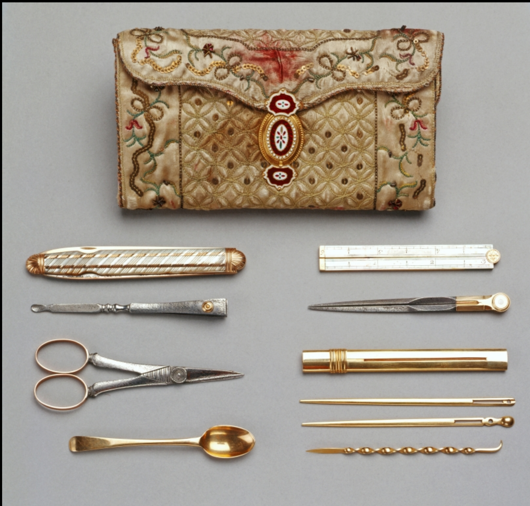
English Silk Pocketbook Embroidered with Silk & Metal Sequins and Closed by an Enamel Clasp Reported to Have been Made by Queen Charlotte and Given to Mrs. Delany in 1781 Contains Ten Sewing Tools (The Royal Collection)