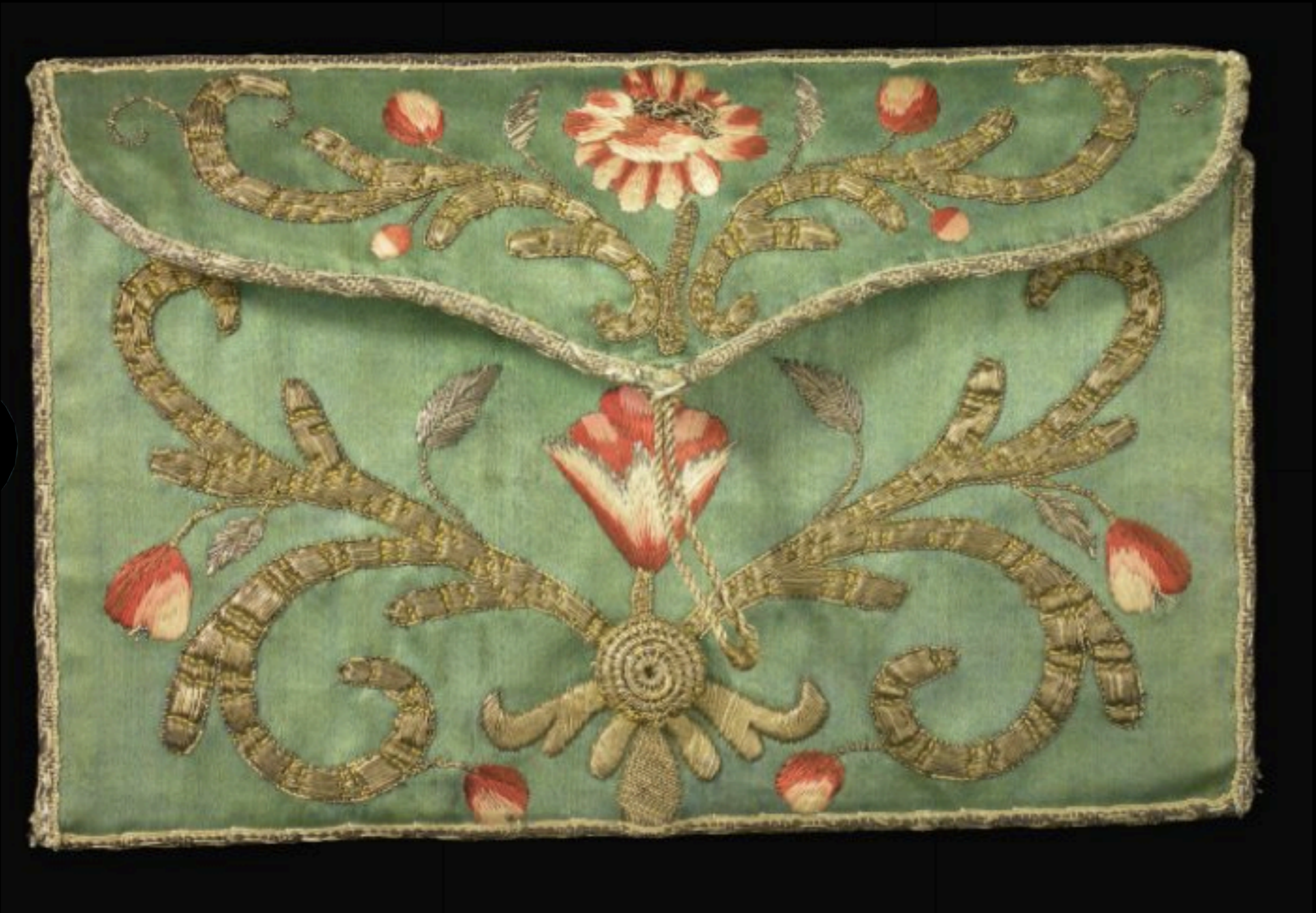
French Silk Pocketbook Embroidered with Silk, Silver and Silver Gilt