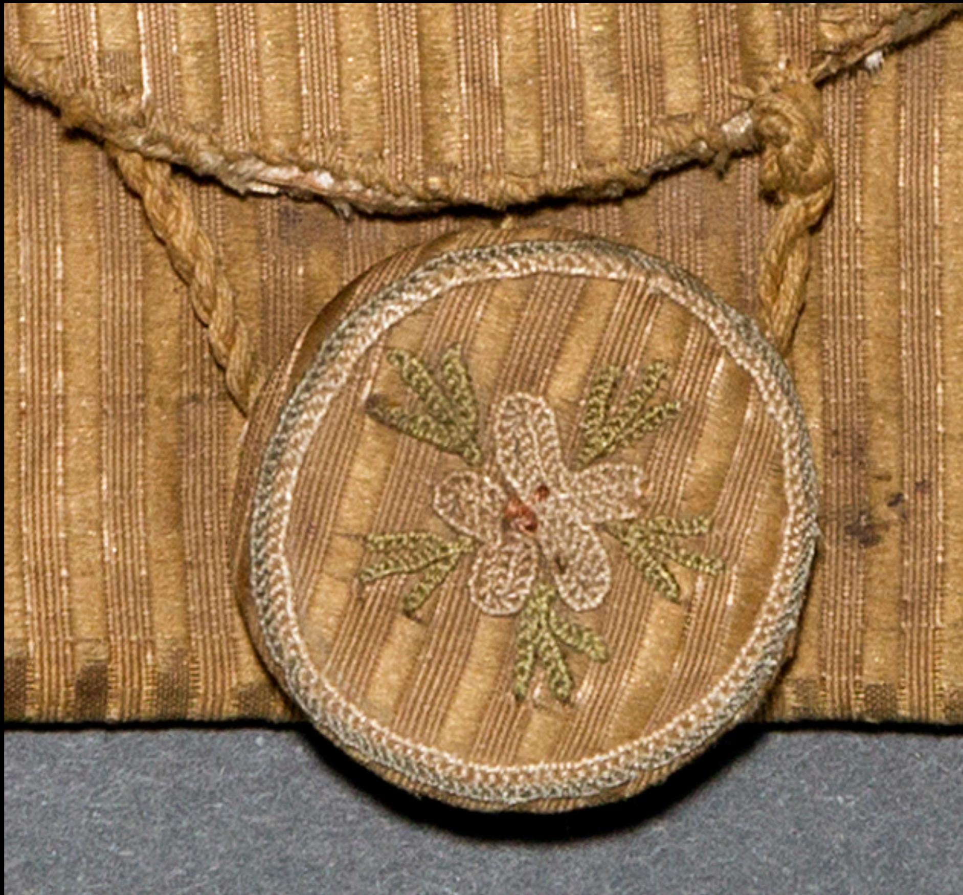
English Silk Embroidered Pocket Book c. 1770 - 1800 (Winterthur)