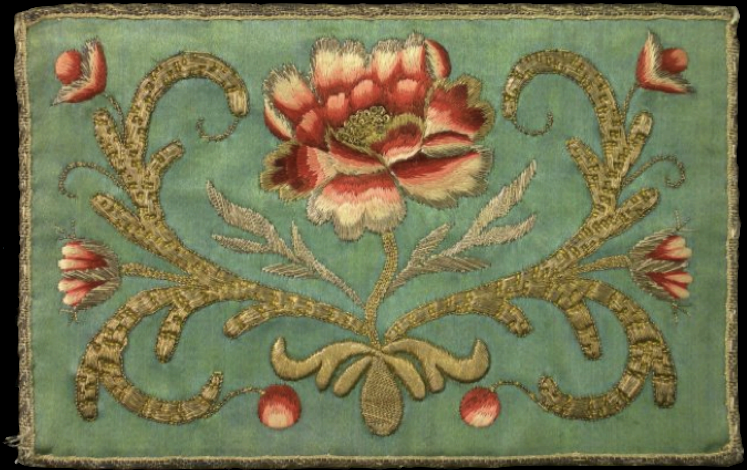
French Silk Pocketbook Embroidered with Silk, Silver and Silver Gilt