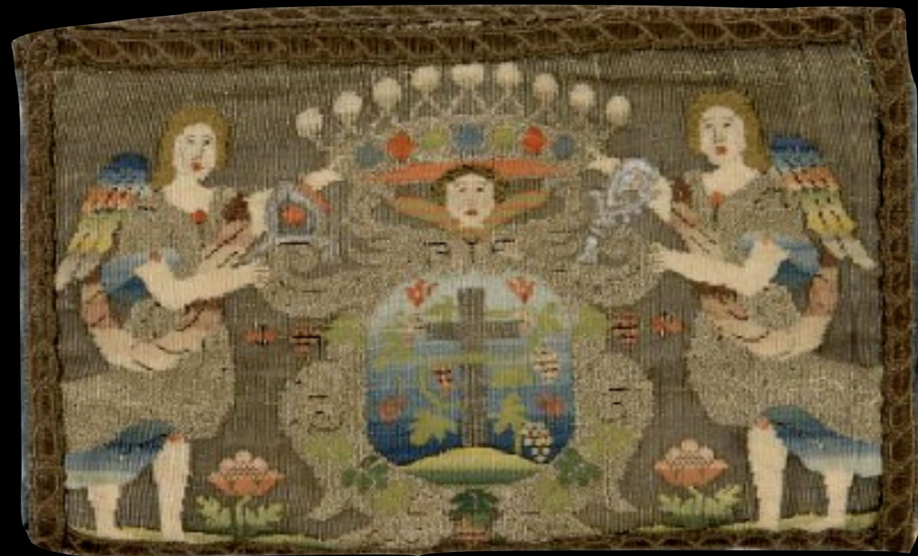
French Tapestry Pocket Book with the Arms of Jean Paul Bignon (1662 - 1743) First Half 18th Century