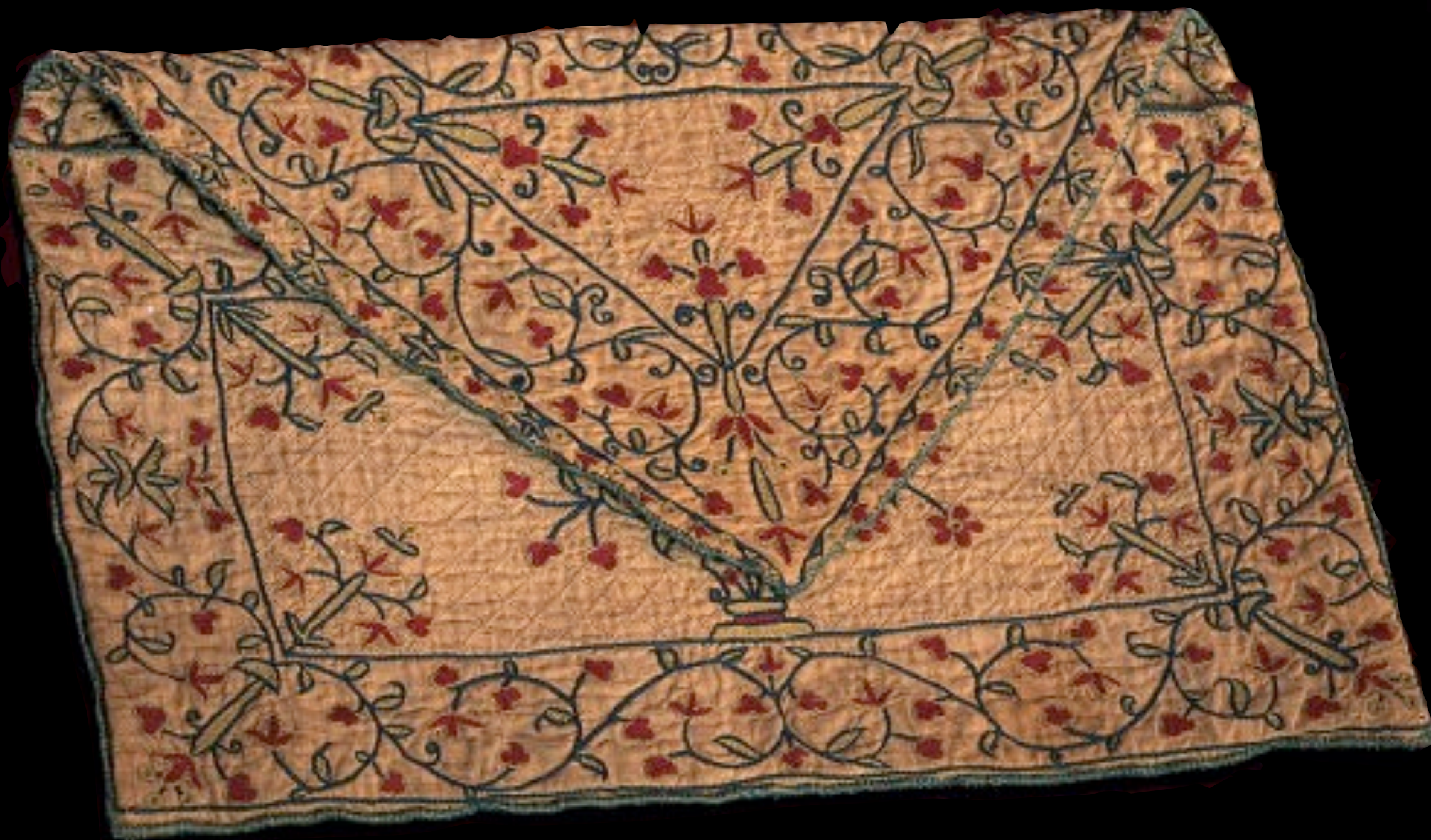
English Silk Embroidered Pocketbook