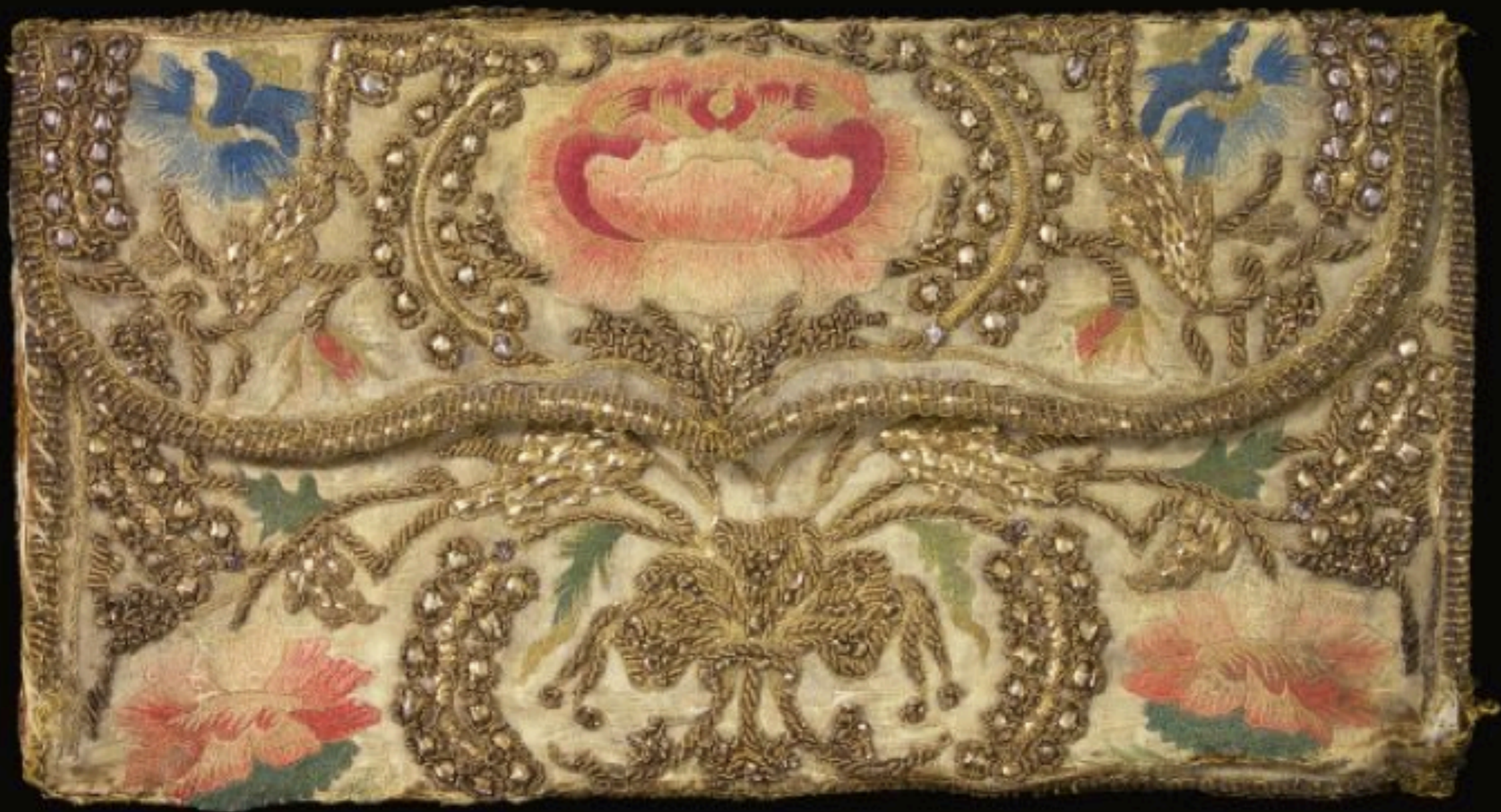
Turkish Silk Pocket Book Embroidered with Silk and Metallic Threads & Metal Purl