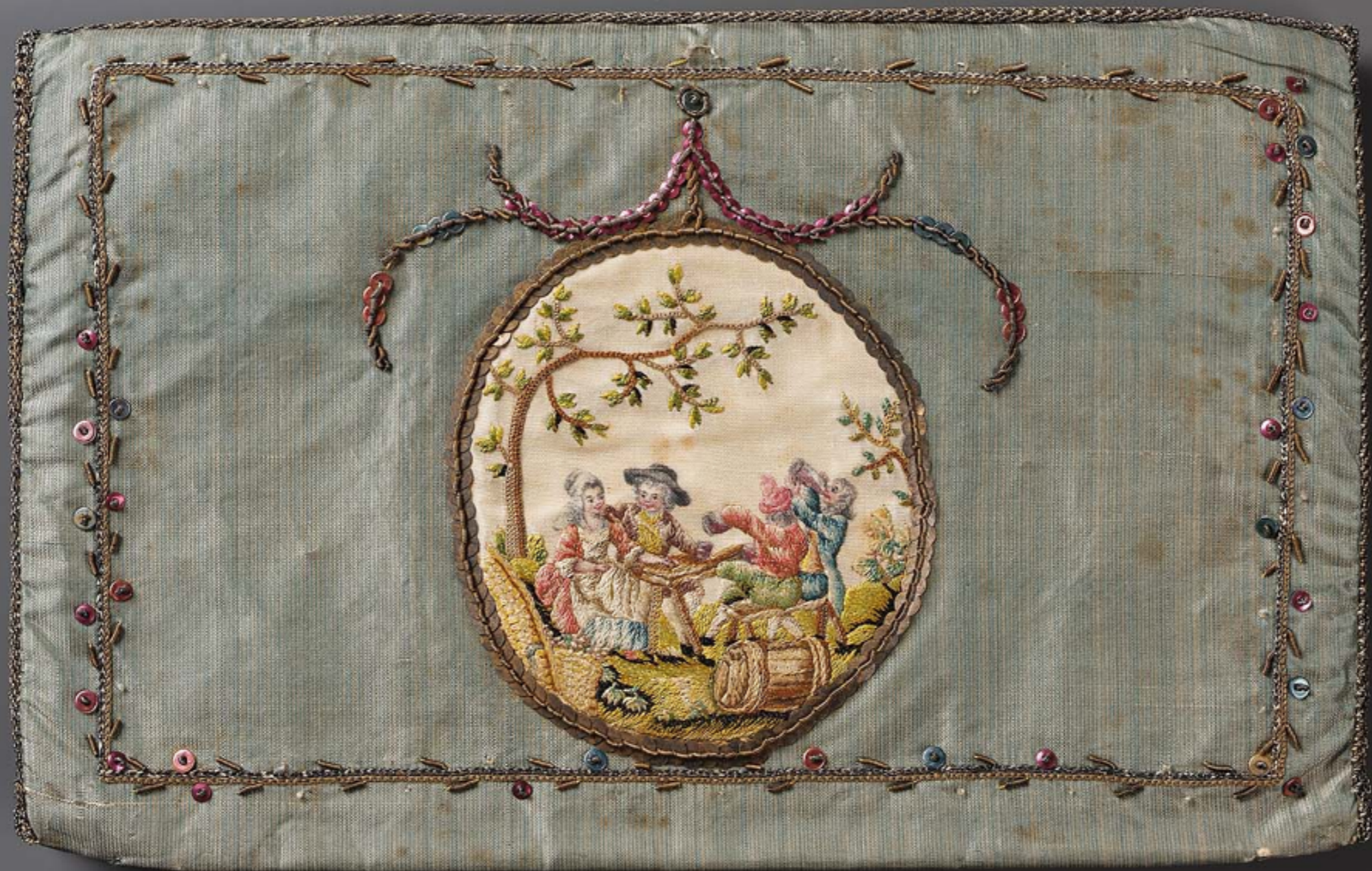
French Silk Appliquéd Pocket Book Embroidered with Silk, Metallic Threads, Metal Purl & Metal Spangles Late 18th Century (Museum of Fine Arts, Boston)