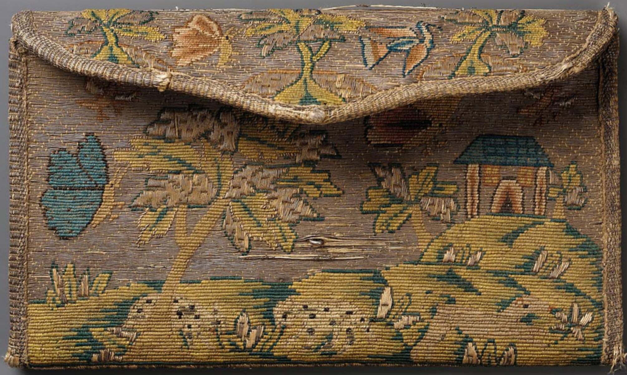
French Silk & Metallic Thread Embroidered Pocket Book 17th Century (Museum of Fine Arts, Boston)