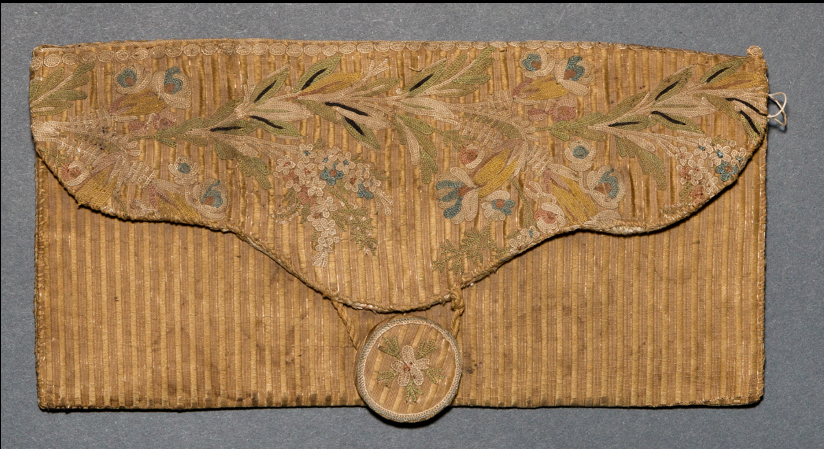
English Silk Embroidered Pocket Book