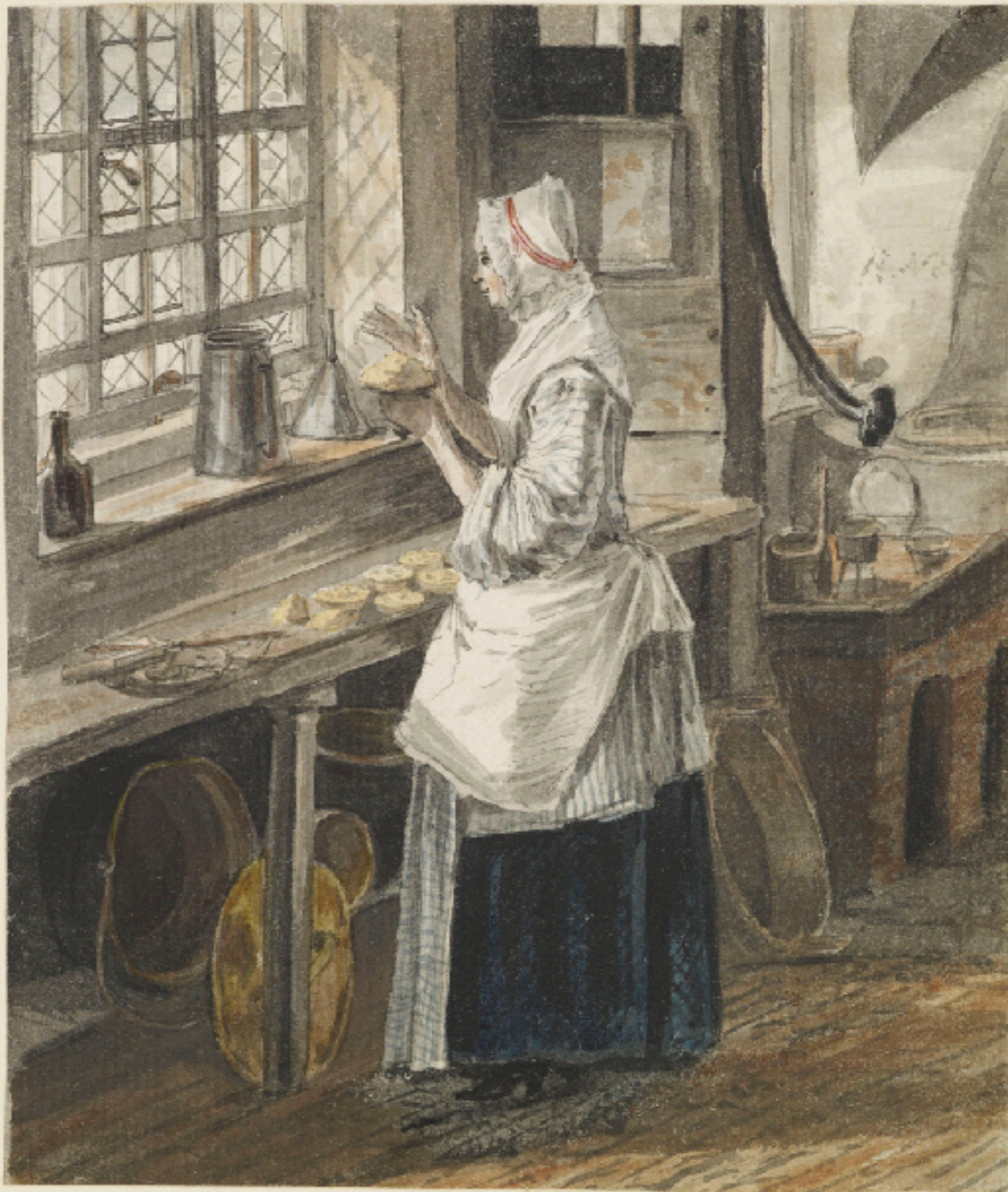
The Kitchen at Sandpit Gate by Paul Sandby (The Royal Collection)