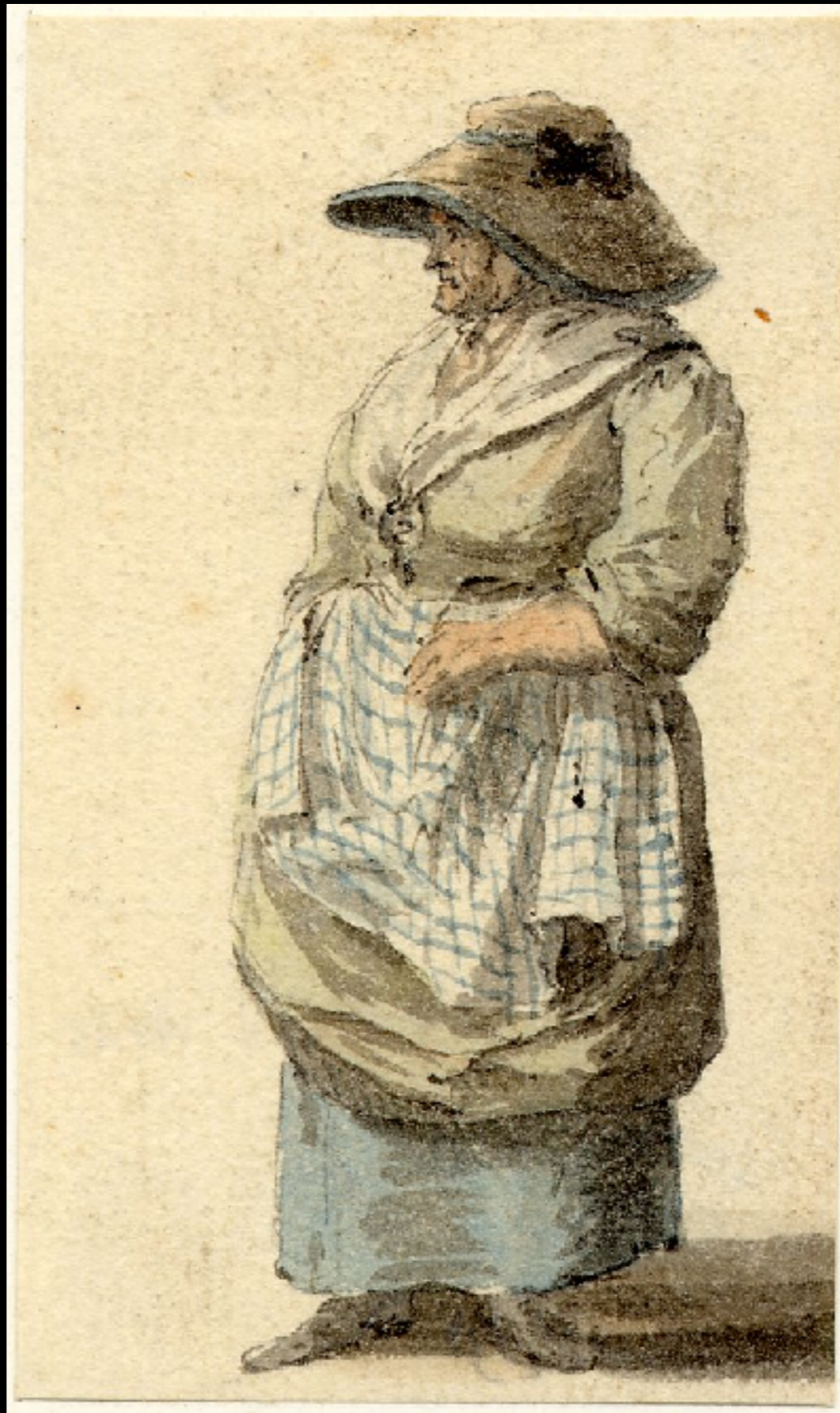
An Edinburgh Market Woman Paul Sandby c. 1745 (The British Museum)