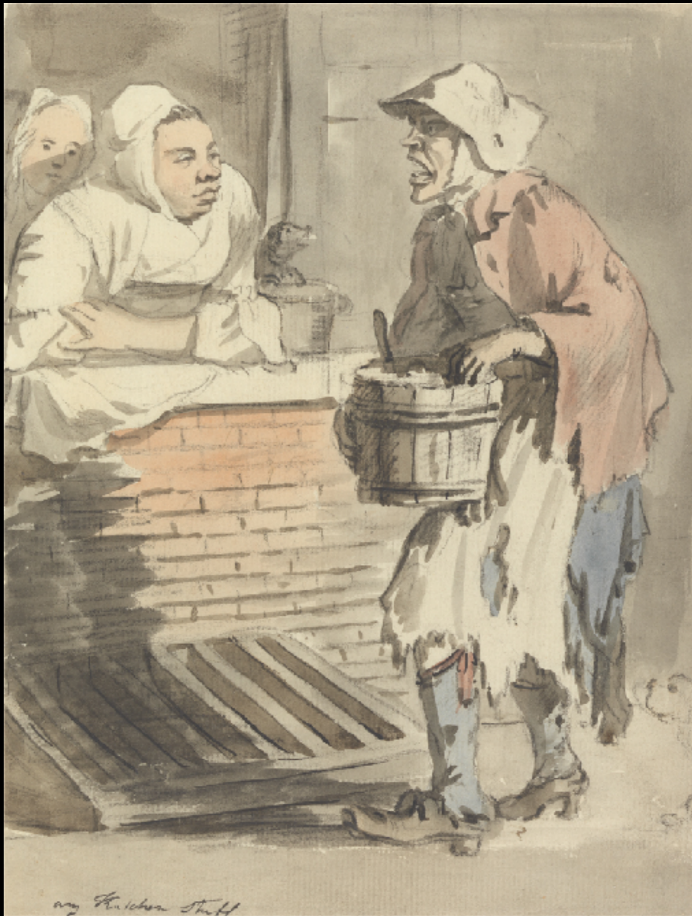
London Cries: "Any Kitchen Stuff"