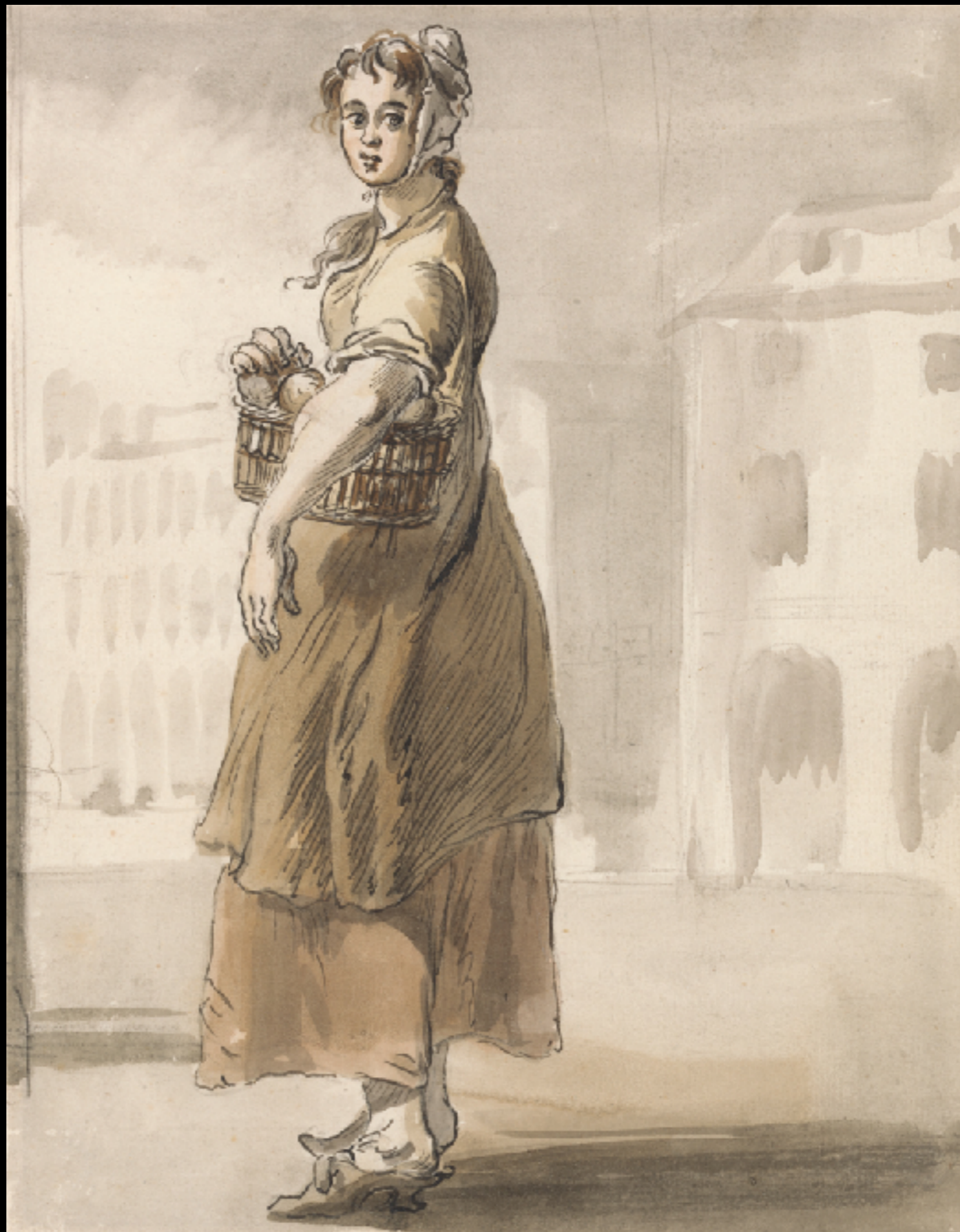
London Cries: A Girl with a Basket of Oranges Paul Sandby c. 1759 (Yale Center for British Art)