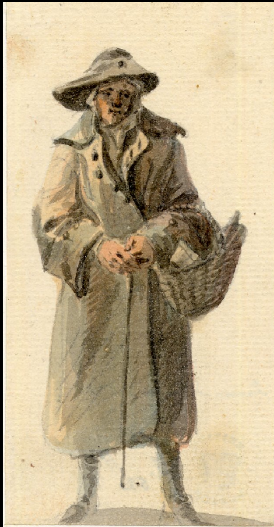
An Edinburgh Old Woman Carrying a Basket Paul Sandby c. 1745