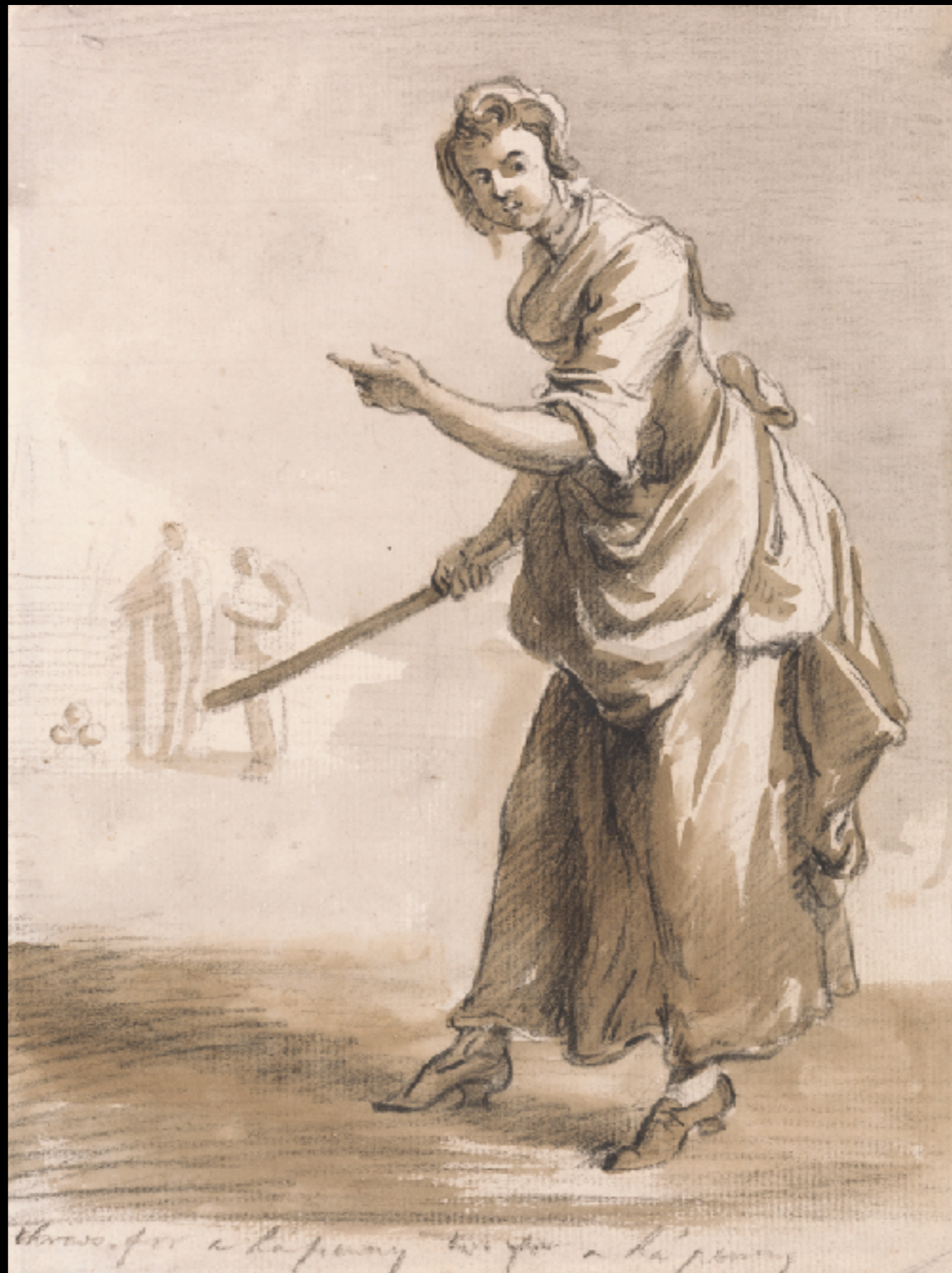
London Cries: "Throws for a Ha'penny Have You a Ha'penny"