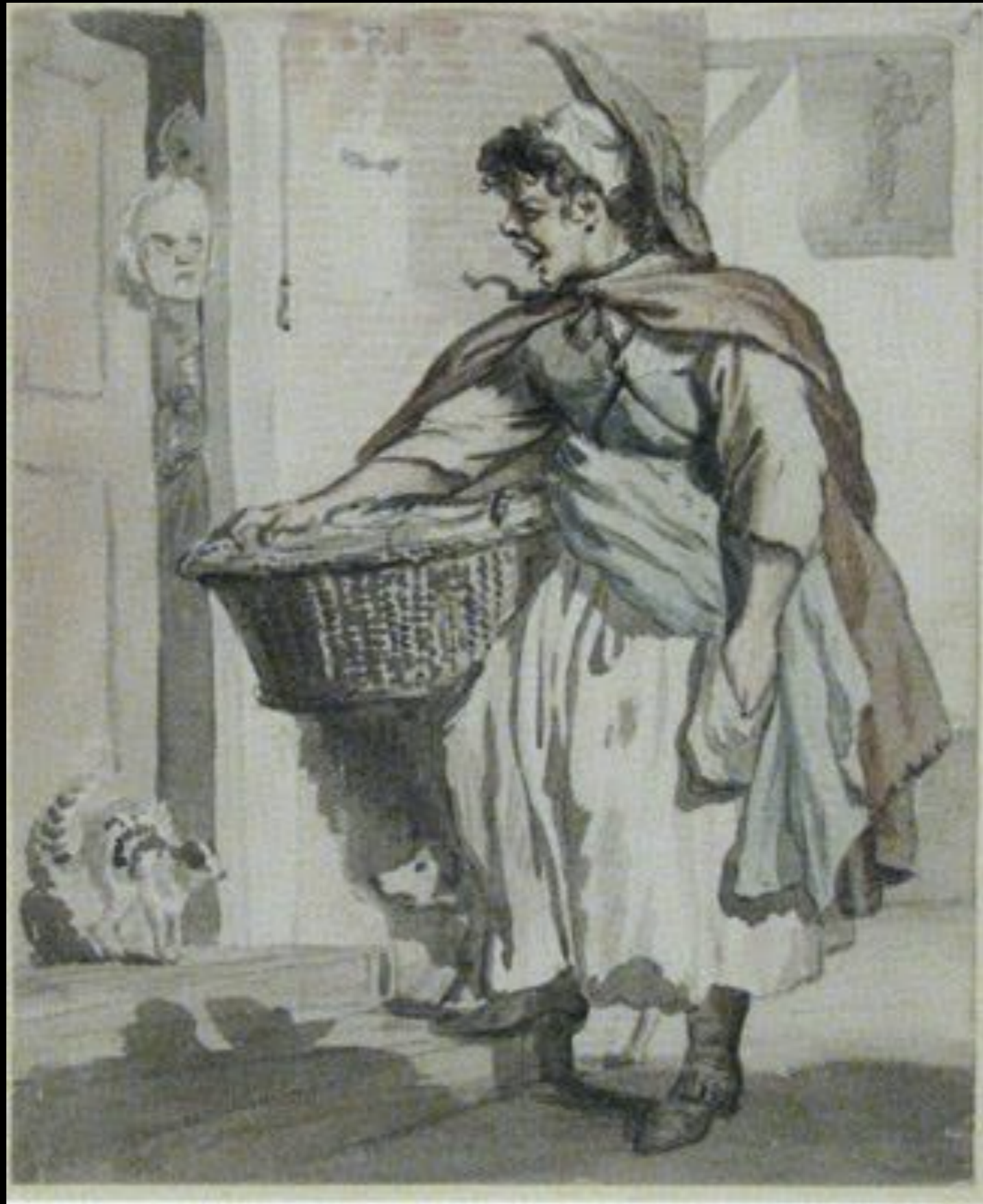
"Rare mackerel, Three a Groat or Four for Sixpence" Paul Sandby