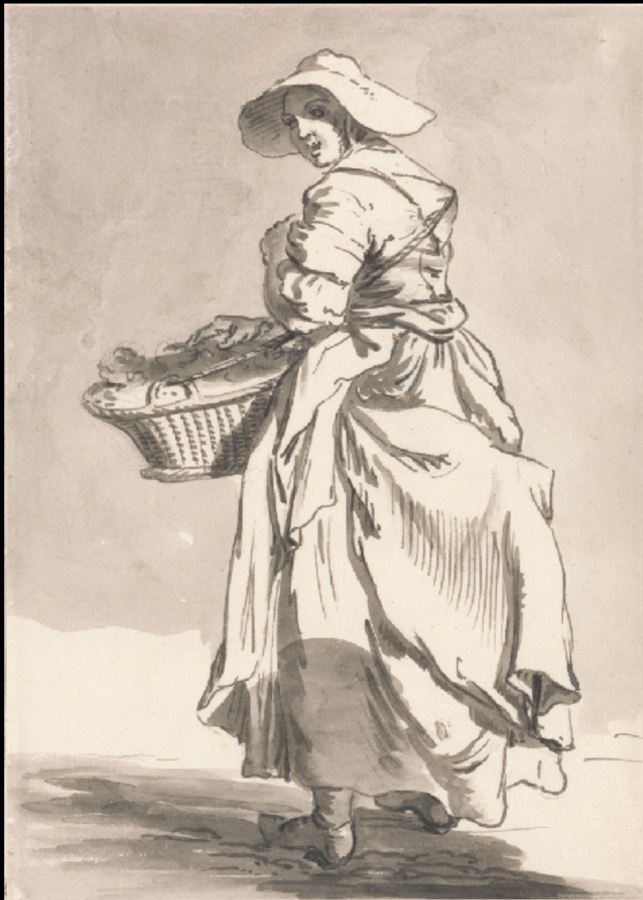
London Cries: "Flowers" Paul Sandby c. 1759 (Yale Center for British Art)