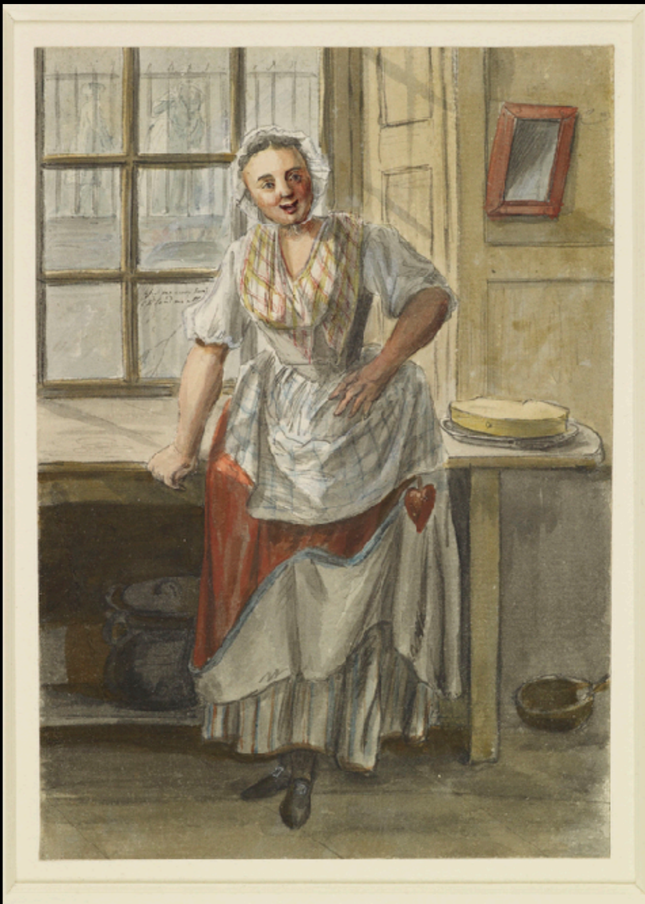
Woman in a Kitchen by Paul Sandby c. 1754 (The Royal Collection)