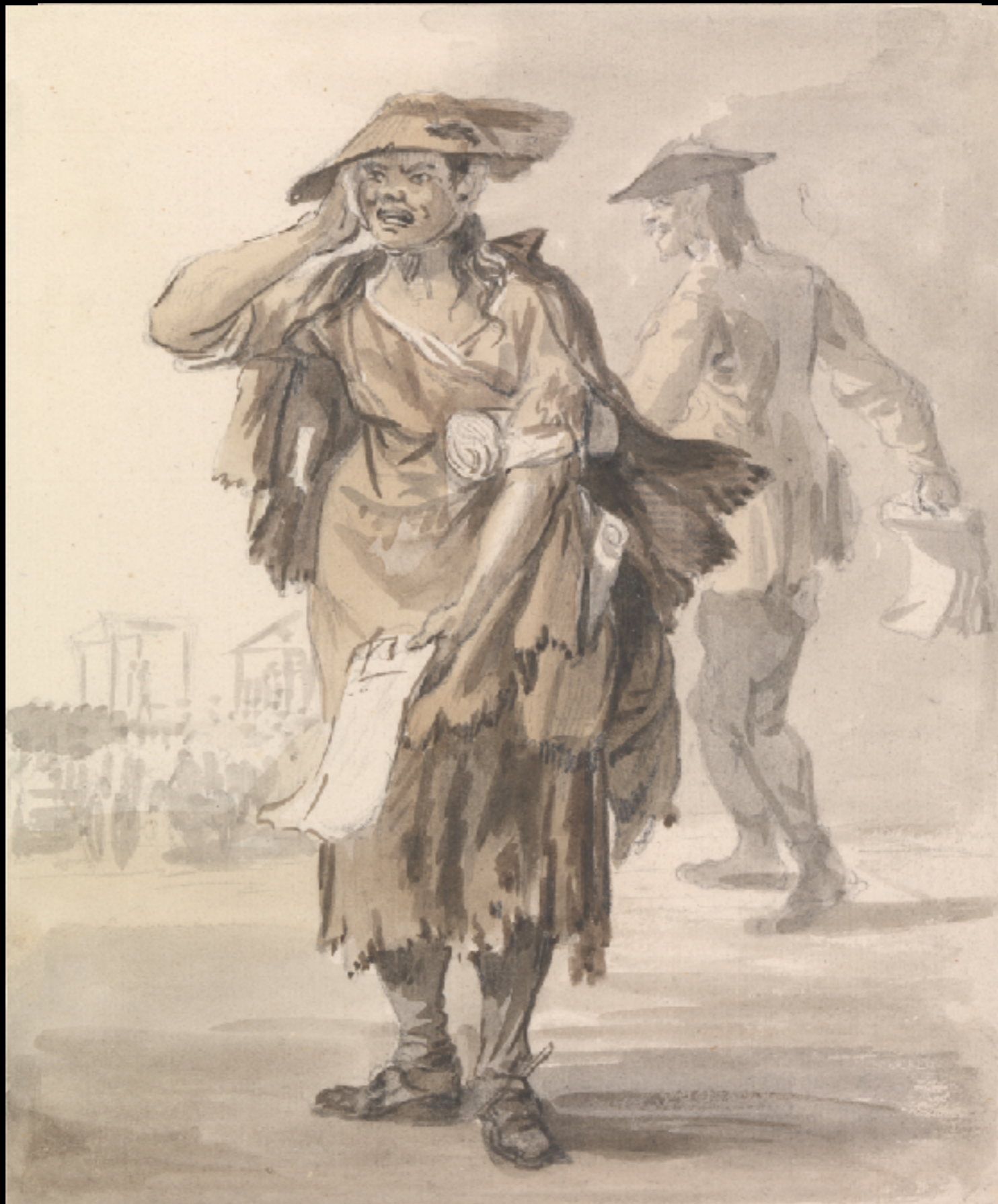
London Cries: Last Dying Speech and Confession Paul Sandby c. 1759 (Yale Center for British Art)