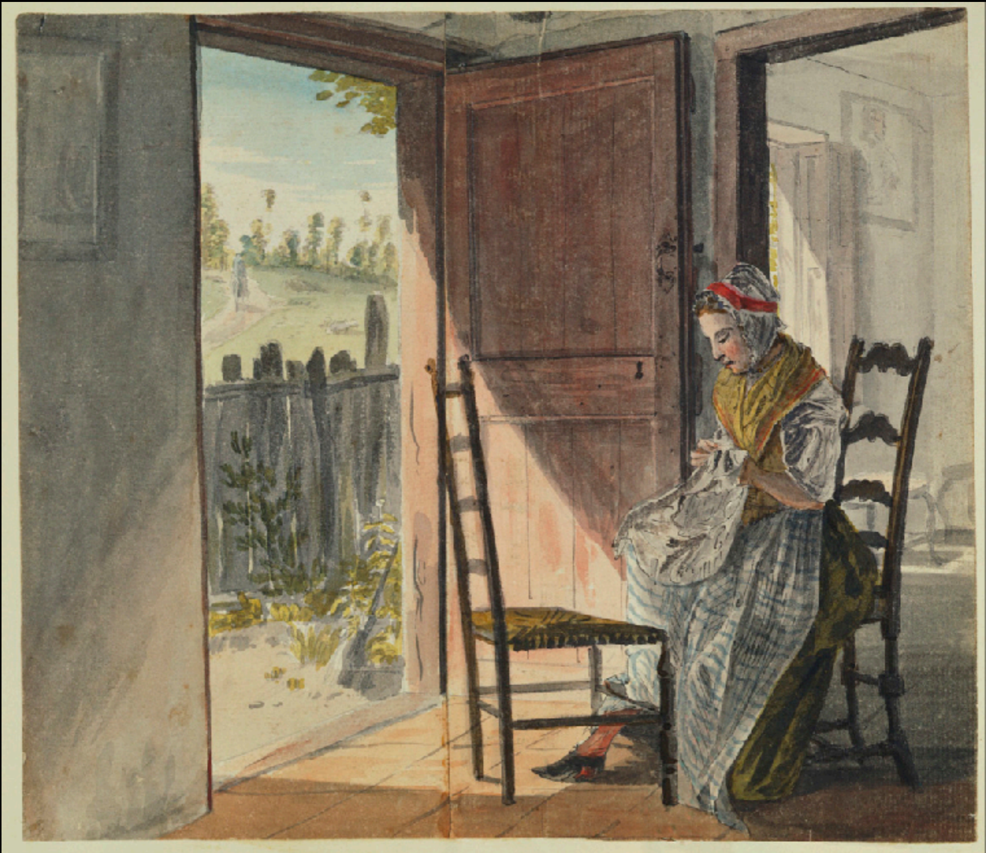
At Sandpit Gate by Paul Sandby (The Royal Collection)