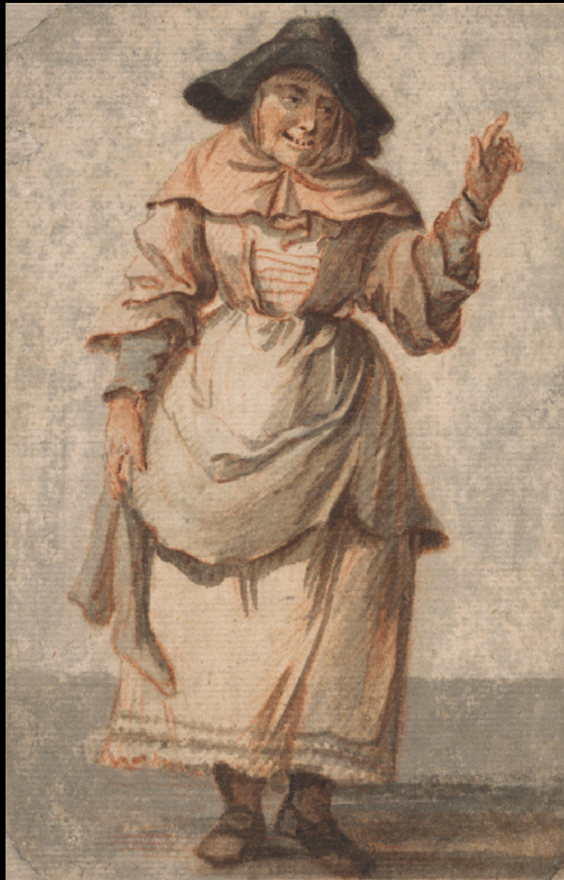
An old Market Woman Paul Sandby