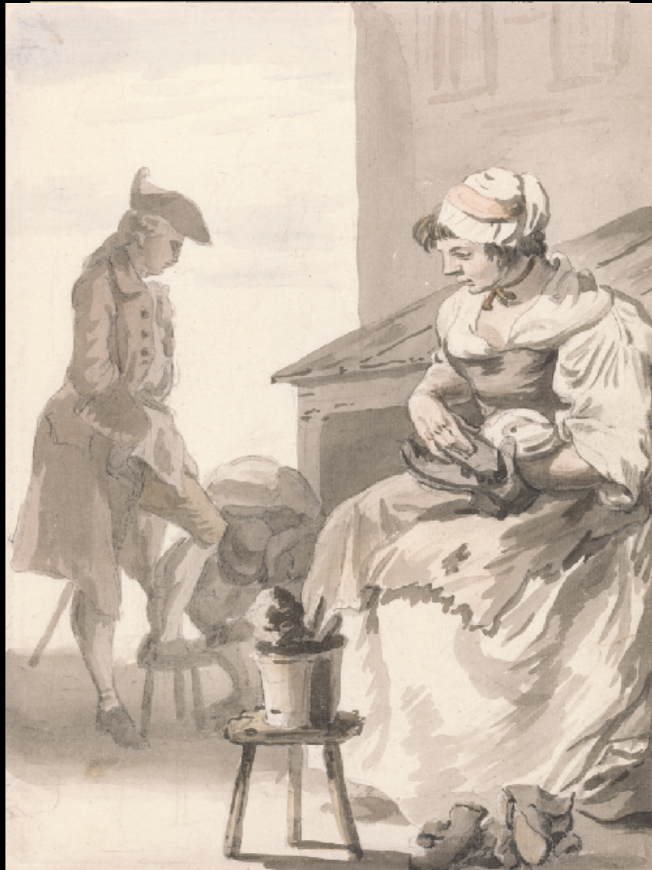
London Cries: "Shoe Cleaner" Paul Sandby c. 1759 (Yale Center for British Art)