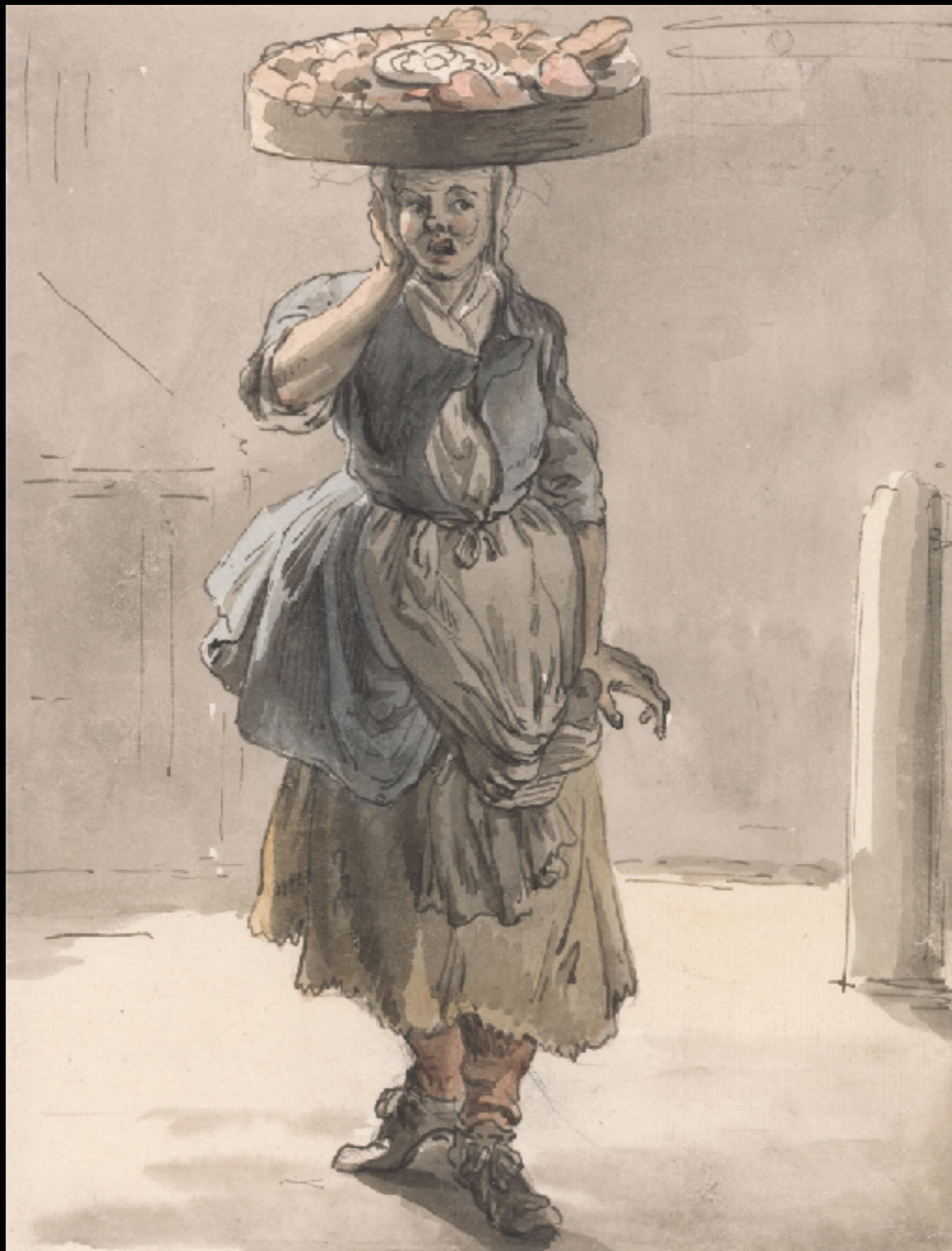
London Cries: "Lights for the Cats, Liver for the Dogs"