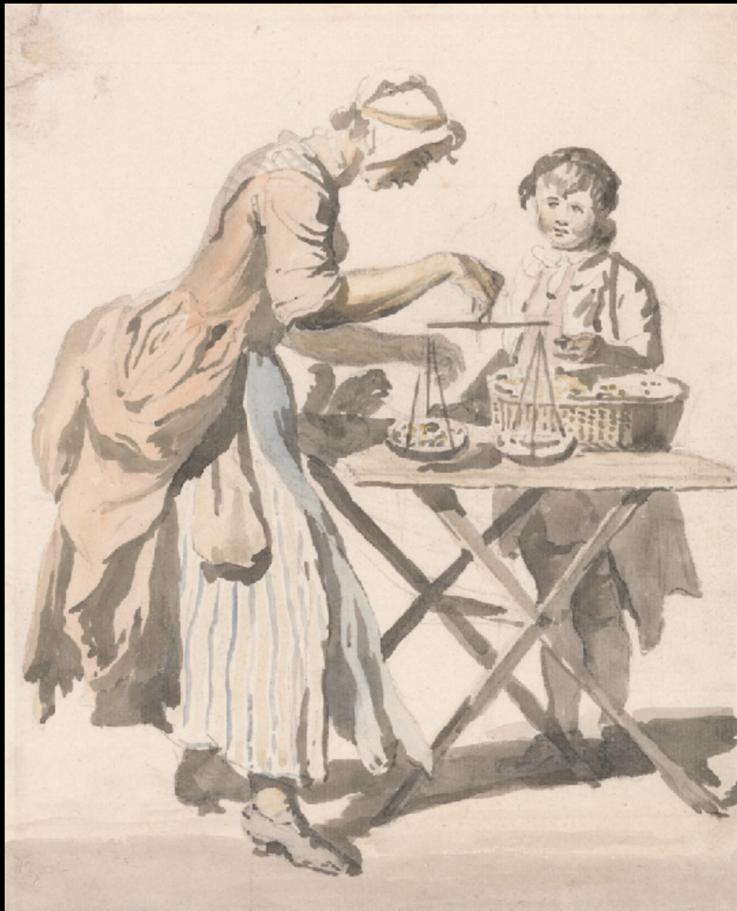
London Cries: "Black Hear Cherries"