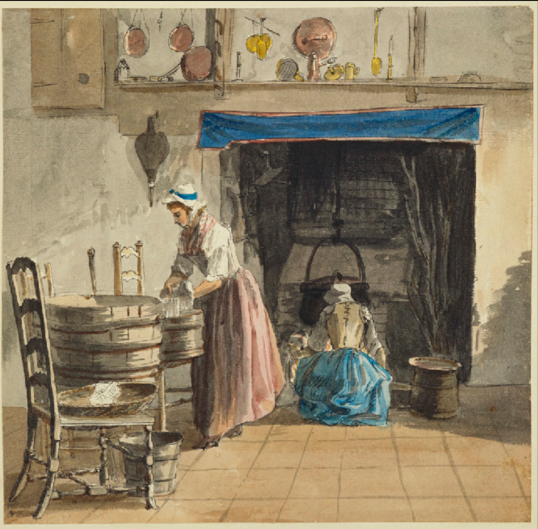
At Sandpit Gate by Paul Sandby (The Royal Collection)