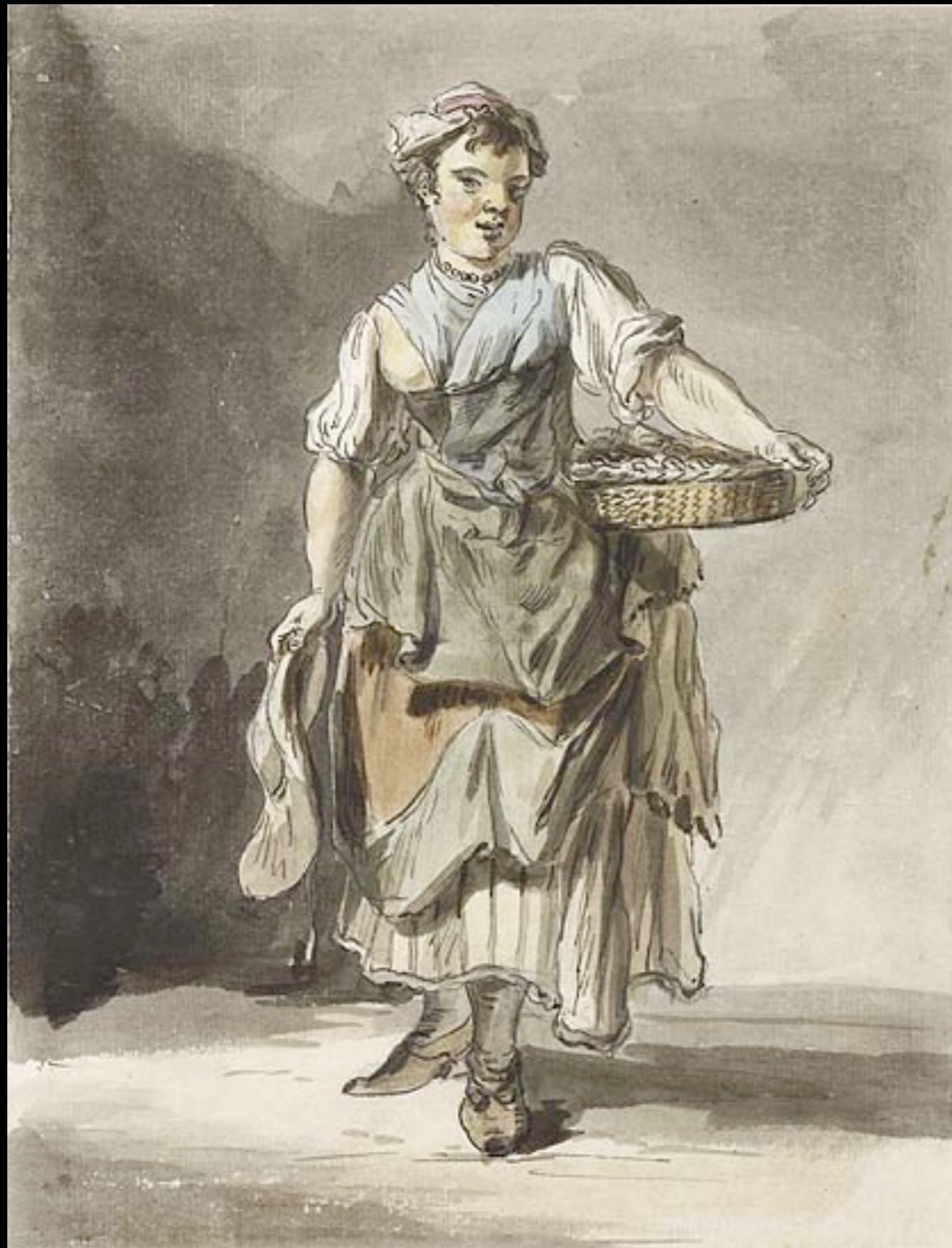
Cries of London - The Shrimp Seller Paul Sandby 1759