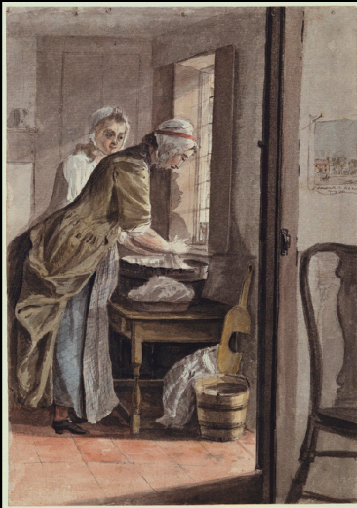
Washer Woman at Sandpit Gate Paul Sandby c. 1765 (The Royal Collection)