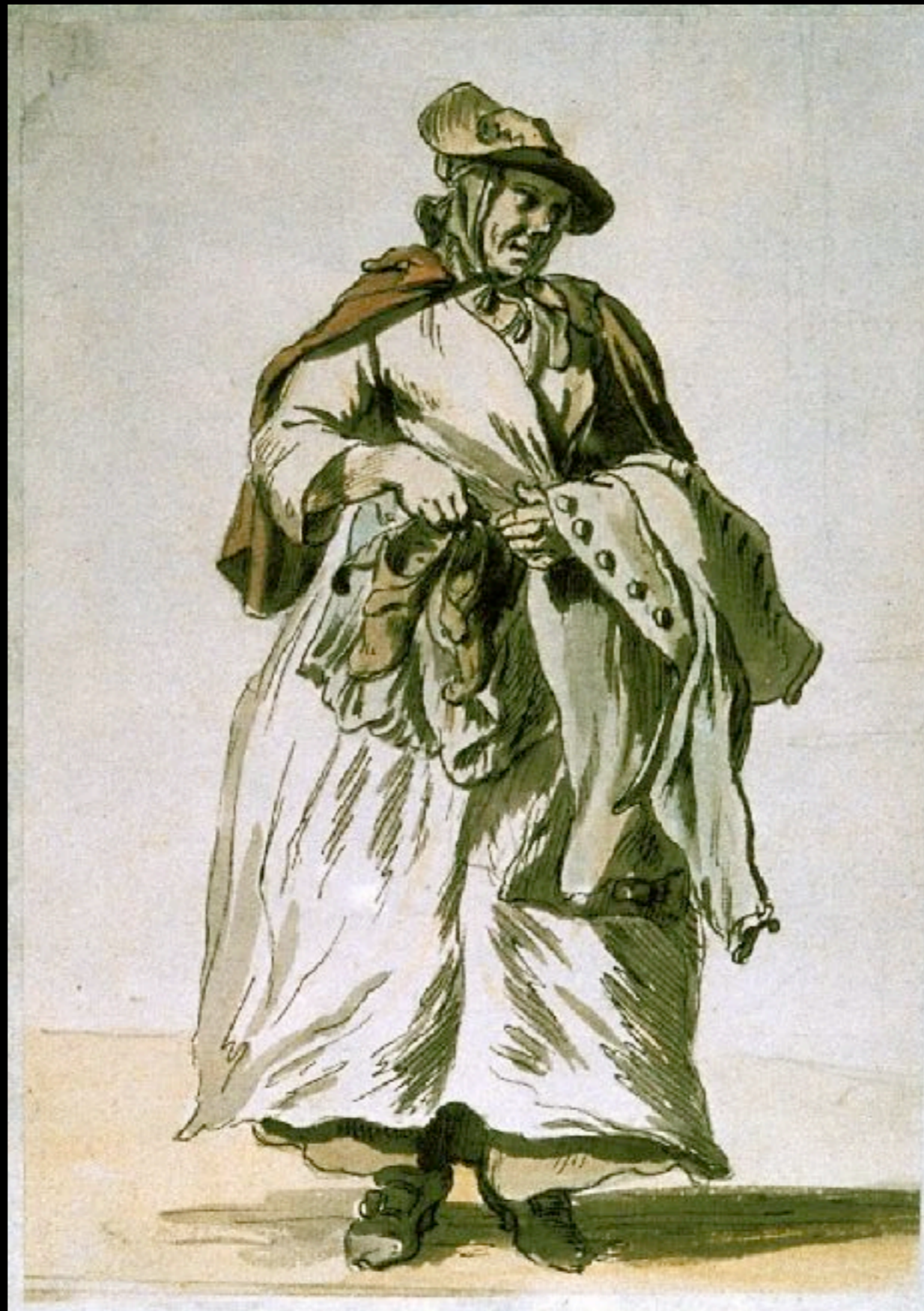
Cries of London - "Old Clothes to Sell" Paul Sandby 1759