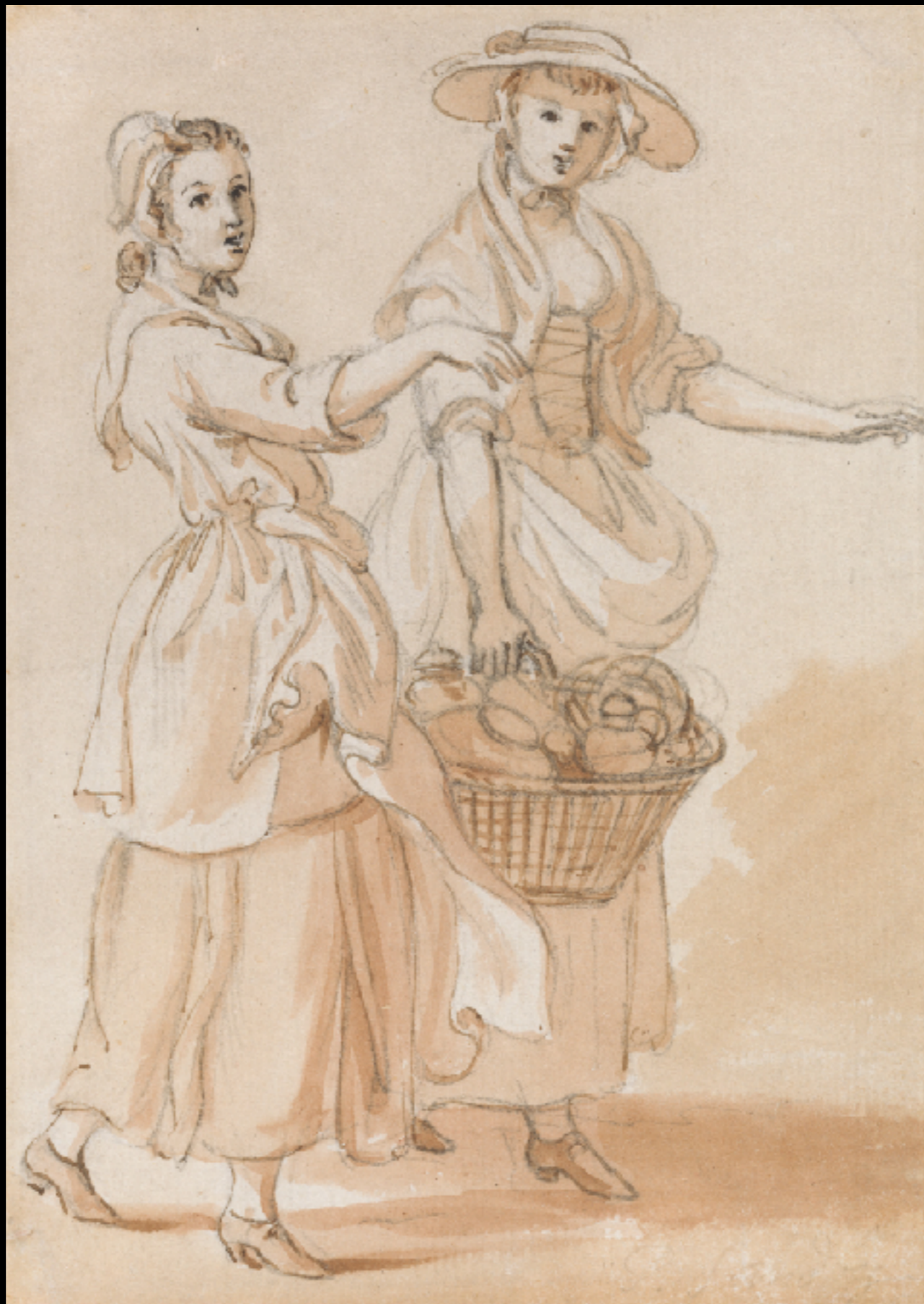
Two Girls Carrying a Basket Paul Sandby