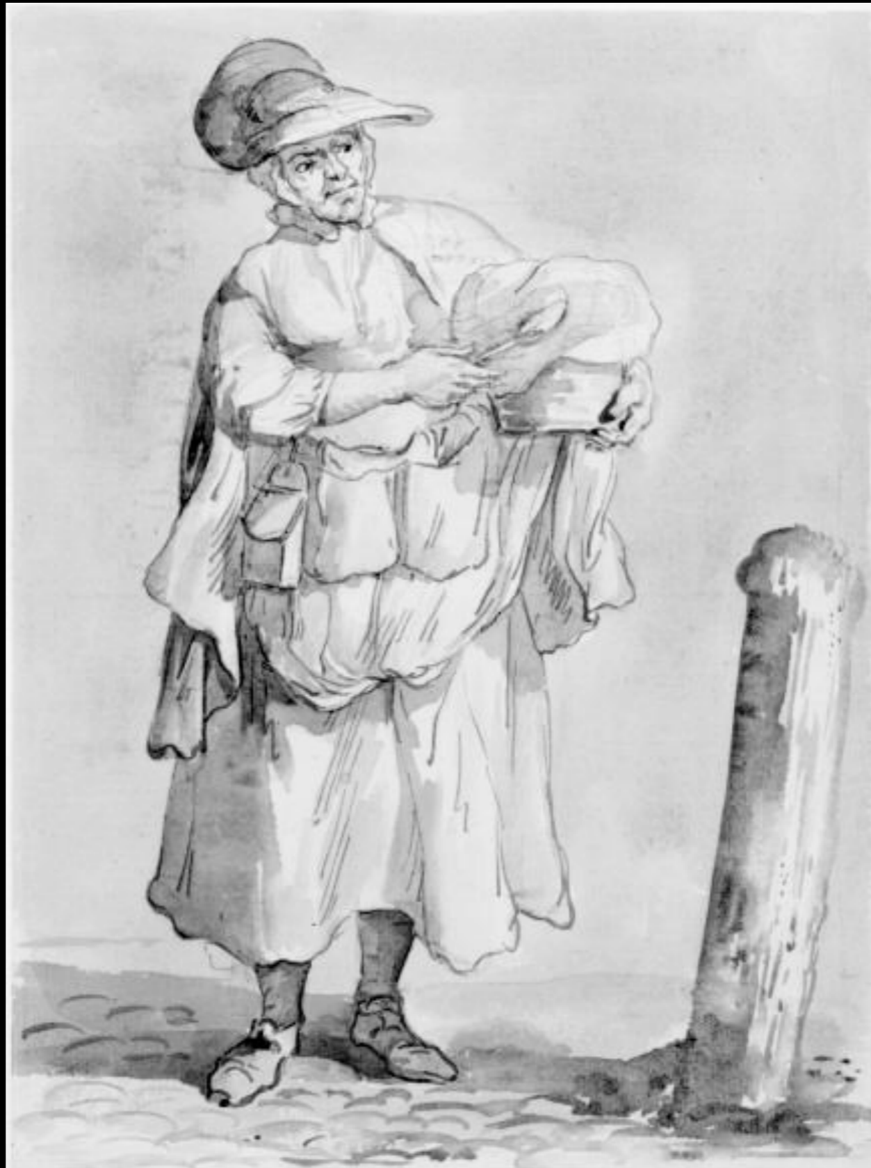
Woman with a Spoon & Covered Basket Paul Sandby