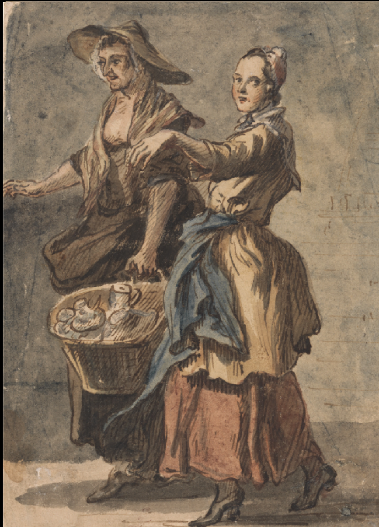
Two Women holding a Basket Paul Sandby c. 1759 (Yale Center for British Art)