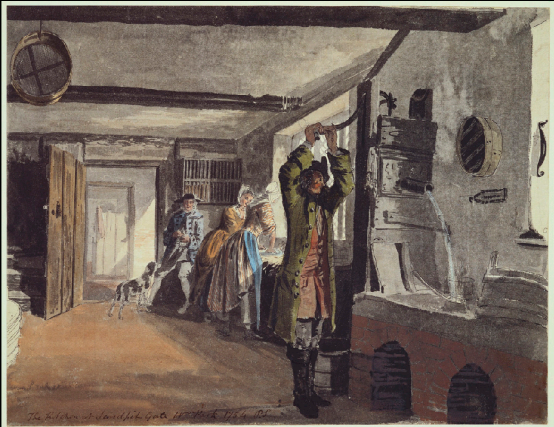
The Kitchen at Sandpit Gate by Paul Sandby 1754