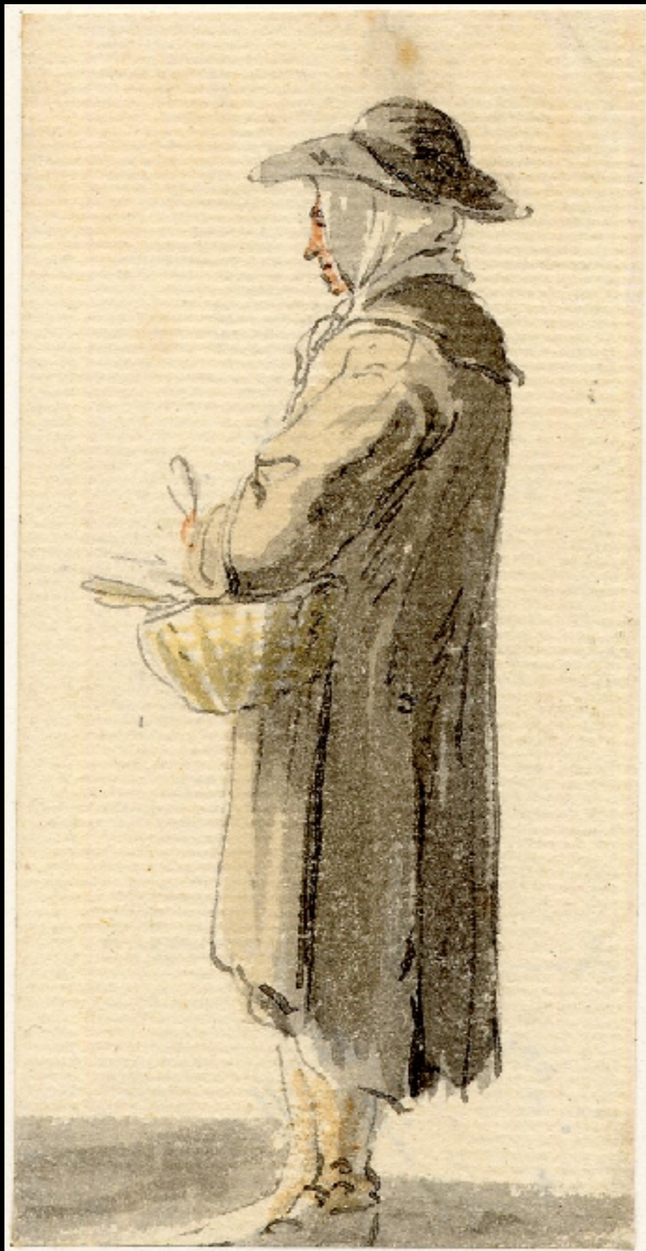
An Edinburgh Old Woman Carrying a Basket Paul Sandby c. 1745 (The British Museum)