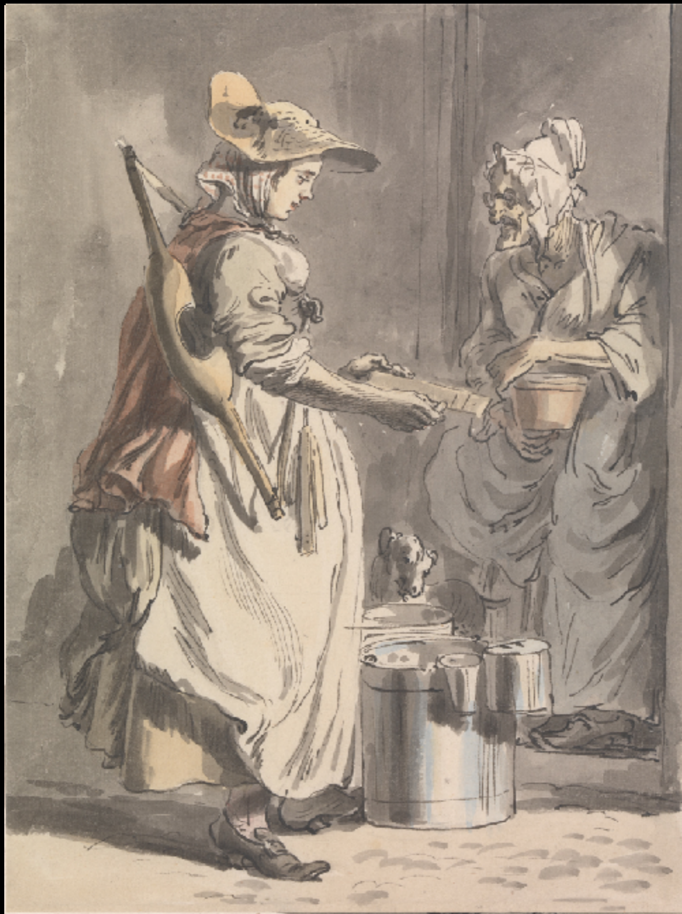
London Cries: "A Milkmaid" Paul Sandby c. 1759 (Yale Center for British Art)