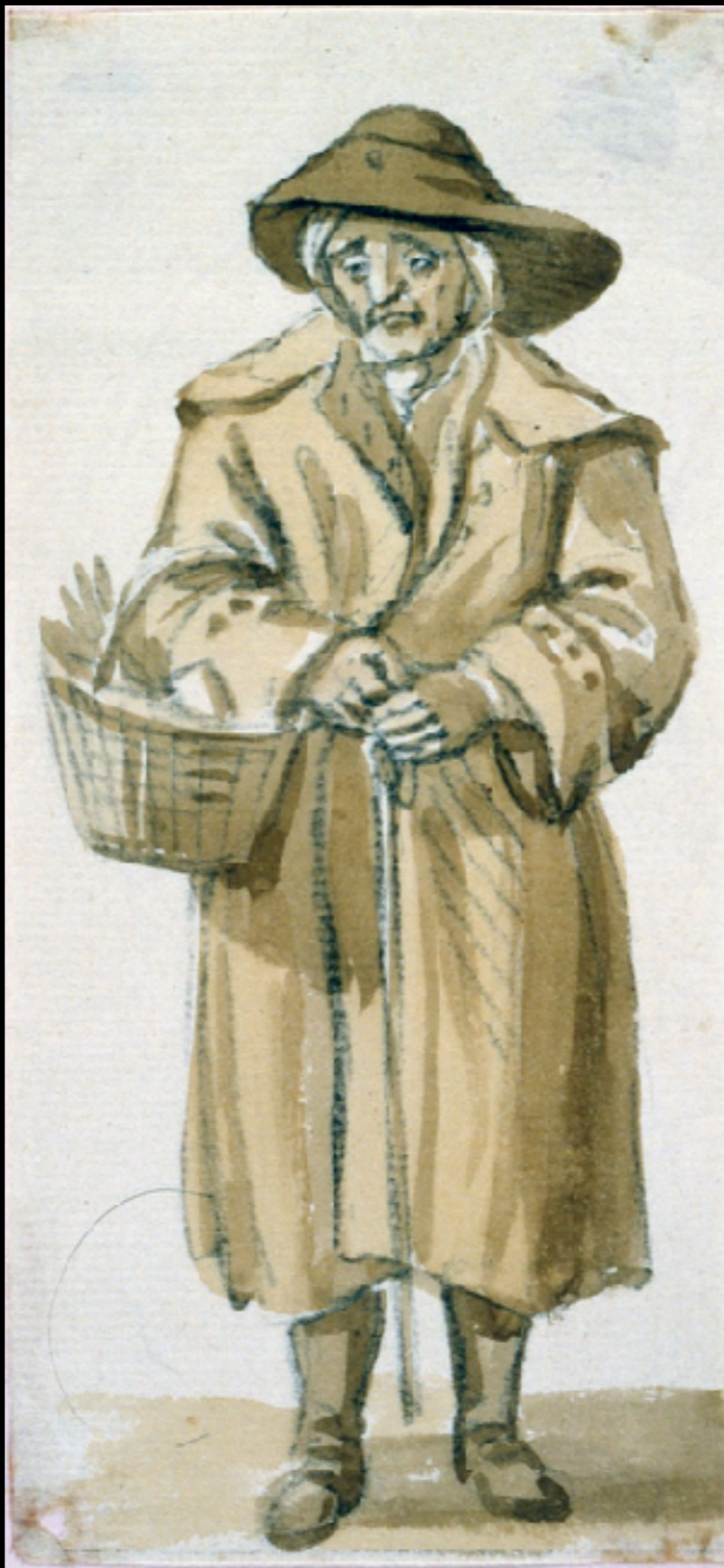
The Old Woman Paul Sandby (The British Museum)