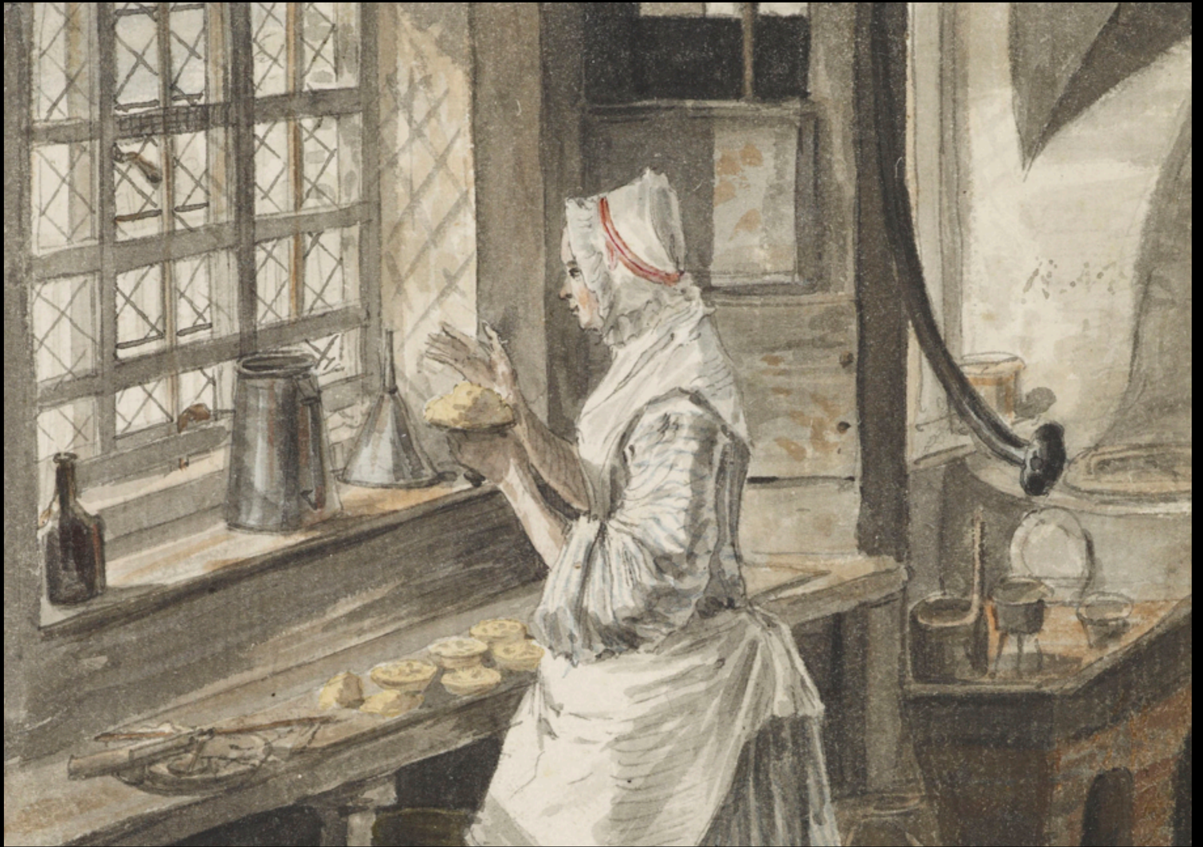
The Kitchen at Sandpit Gate by Paul Sandby (The Royal Collection)