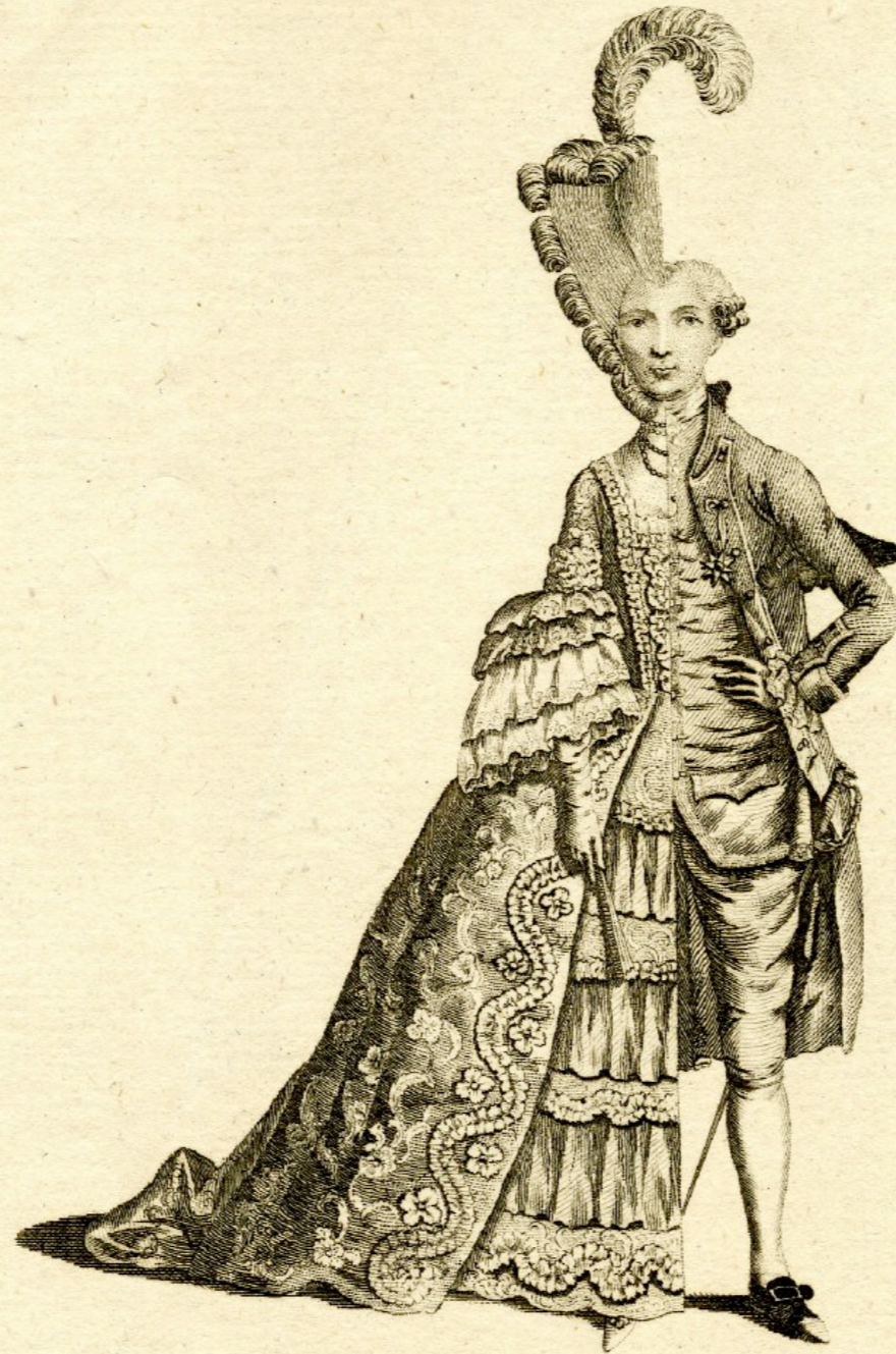
MADemoisELLE de BEAUMONT, or the CHEVALIER D'EON. Female Minister Plenipo. Capt. of Dragoons &c. &c.

“Mademoiselle de Beaumont or the Chevalier D'Eon” by Anonymous 1777 (The British Museum)