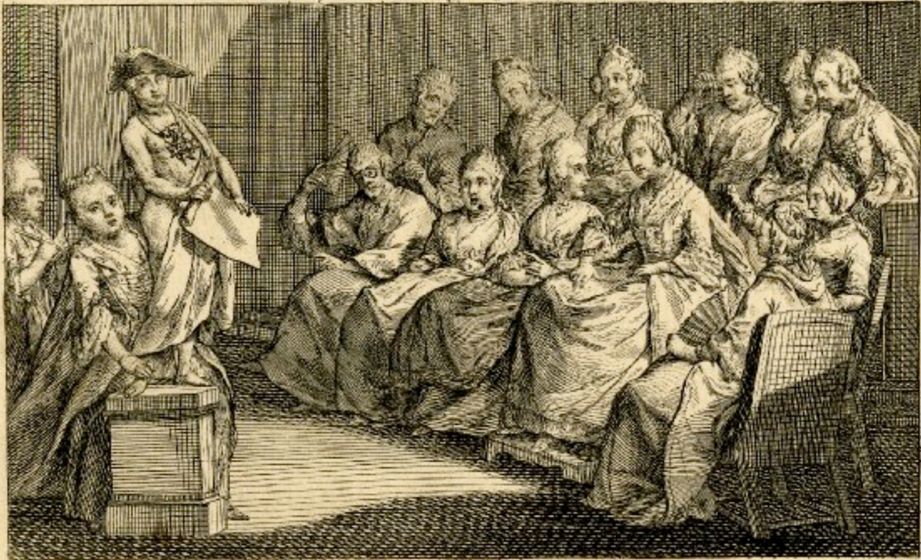
“The Trial of M. D'Eon by a Jury of Matrons” by Anonymous 1771 (The British Museum)