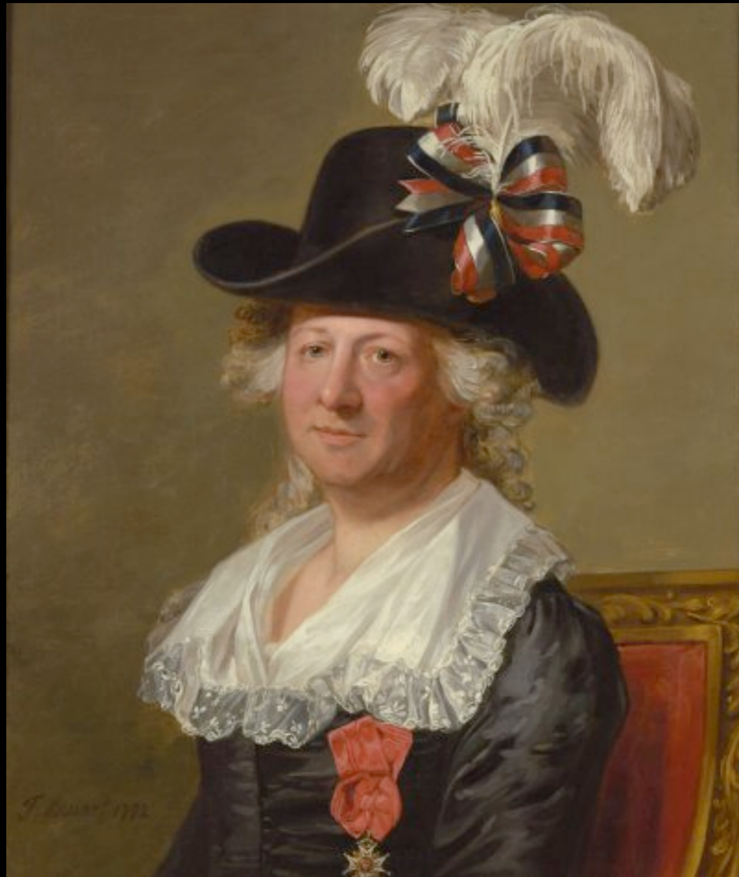
The Chevalier D'Eon by Francis Hastings Rawdon c. 1790