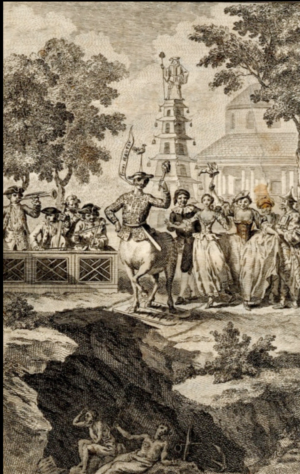
Bigamist Elizabeth Chudleigh, Duchess of Kingston