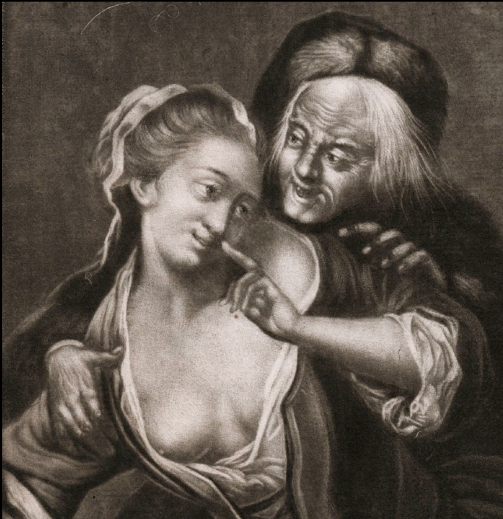
"The Dutch Lover"

Printed for Rob.t Savor, No. 53 Fleet Stree 1st Oct.r 1772 (Yale Center for British Art)