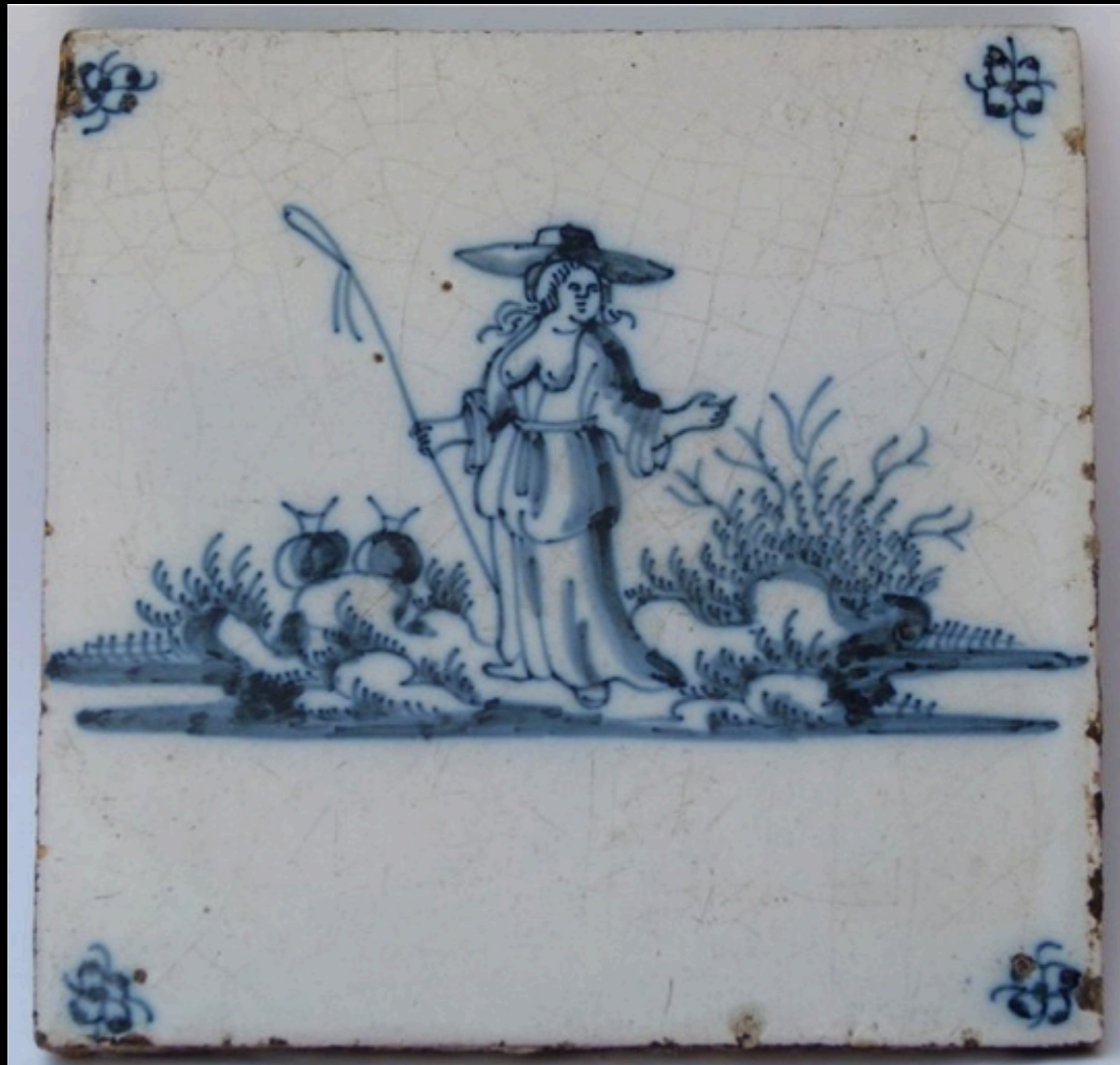
Erotic Delft Tile Bare Breasted Shepherdess in the Meadows (Private Collection)