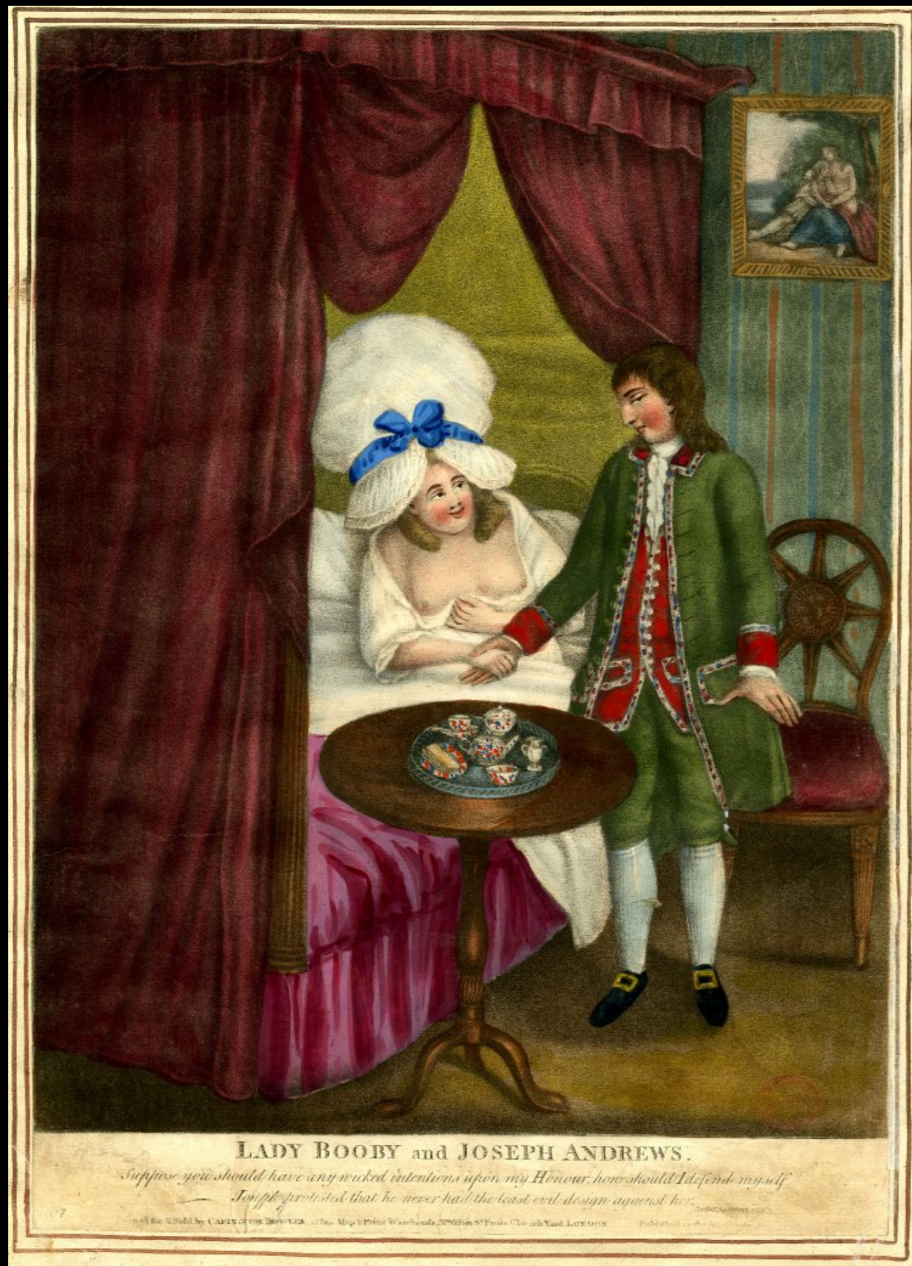
“LADY BOOBY and JOSEPH ANDREWS” by Carington Bowles c. 1780 - 1790 (The British Museum)