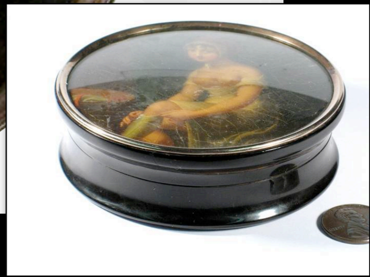
Snuff Box 18th Century