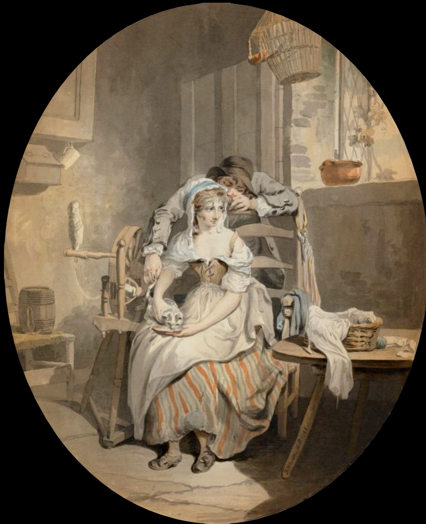
"The Rustic Lover" by Francis Wheatley c. 1786