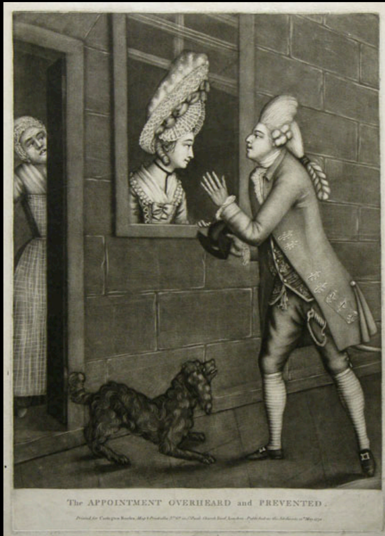
“The APPOINTMENT OVERHEARD and PREVENTED” by Carington Bowles c. 1772