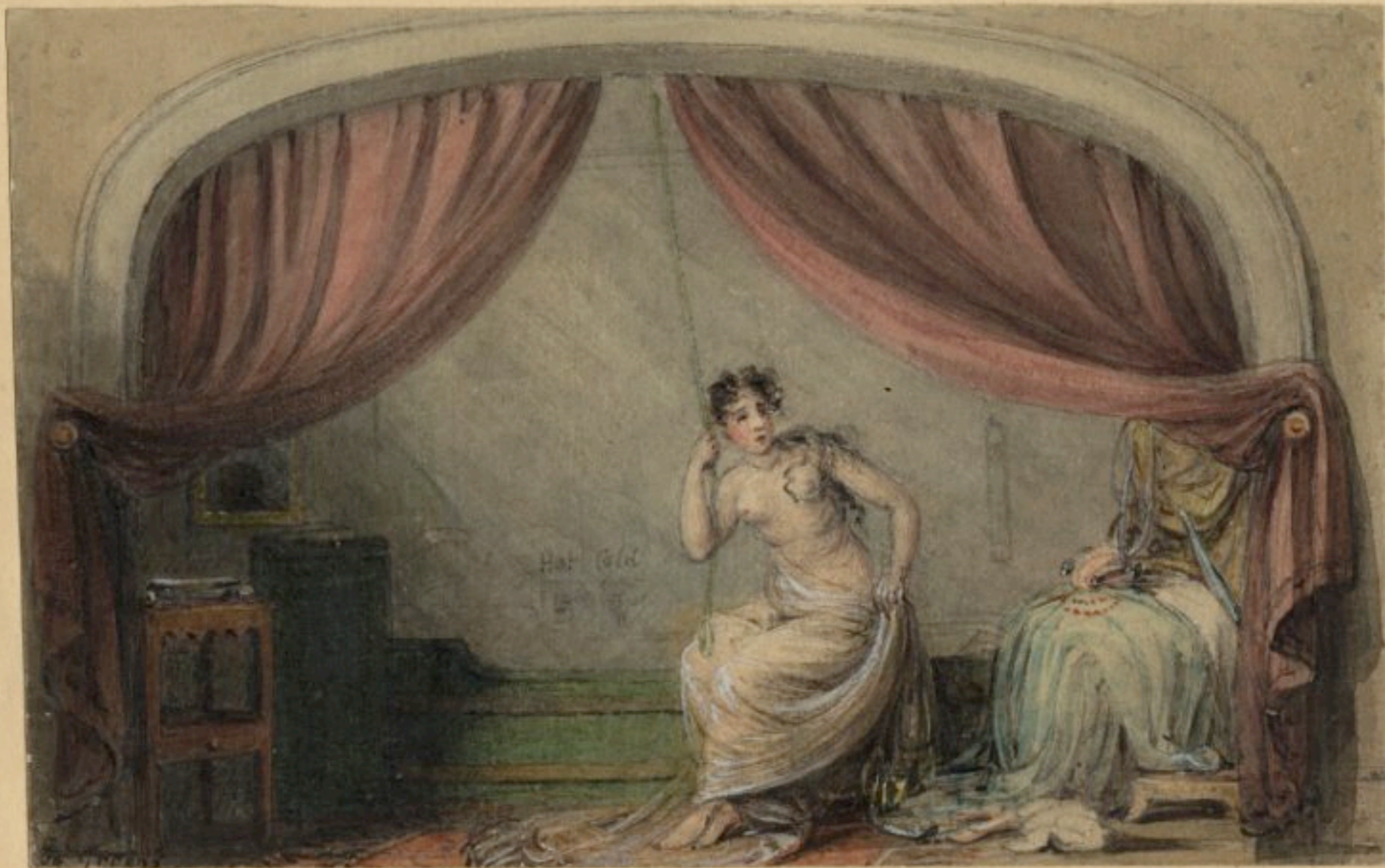
“Hot Cold” by J. Green, British School c. 1746 (The British Museum)