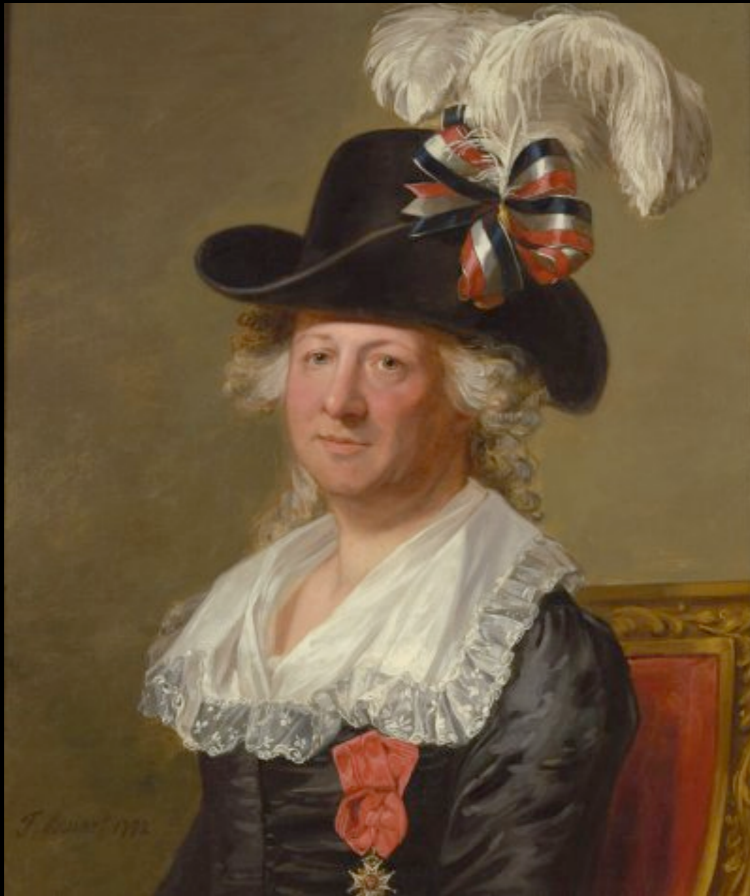
The Chevalier D'Eon by Francis Hastings Rawdon c. 1790