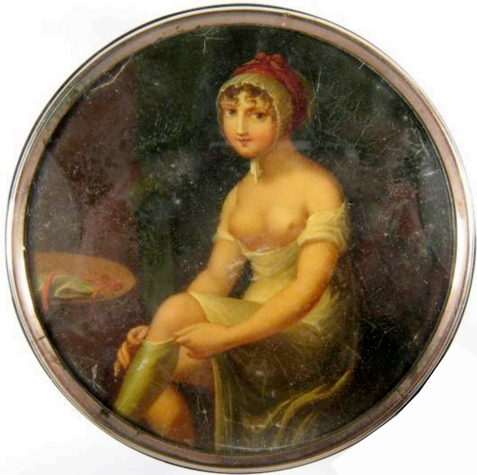
Snuff Box 18th Century