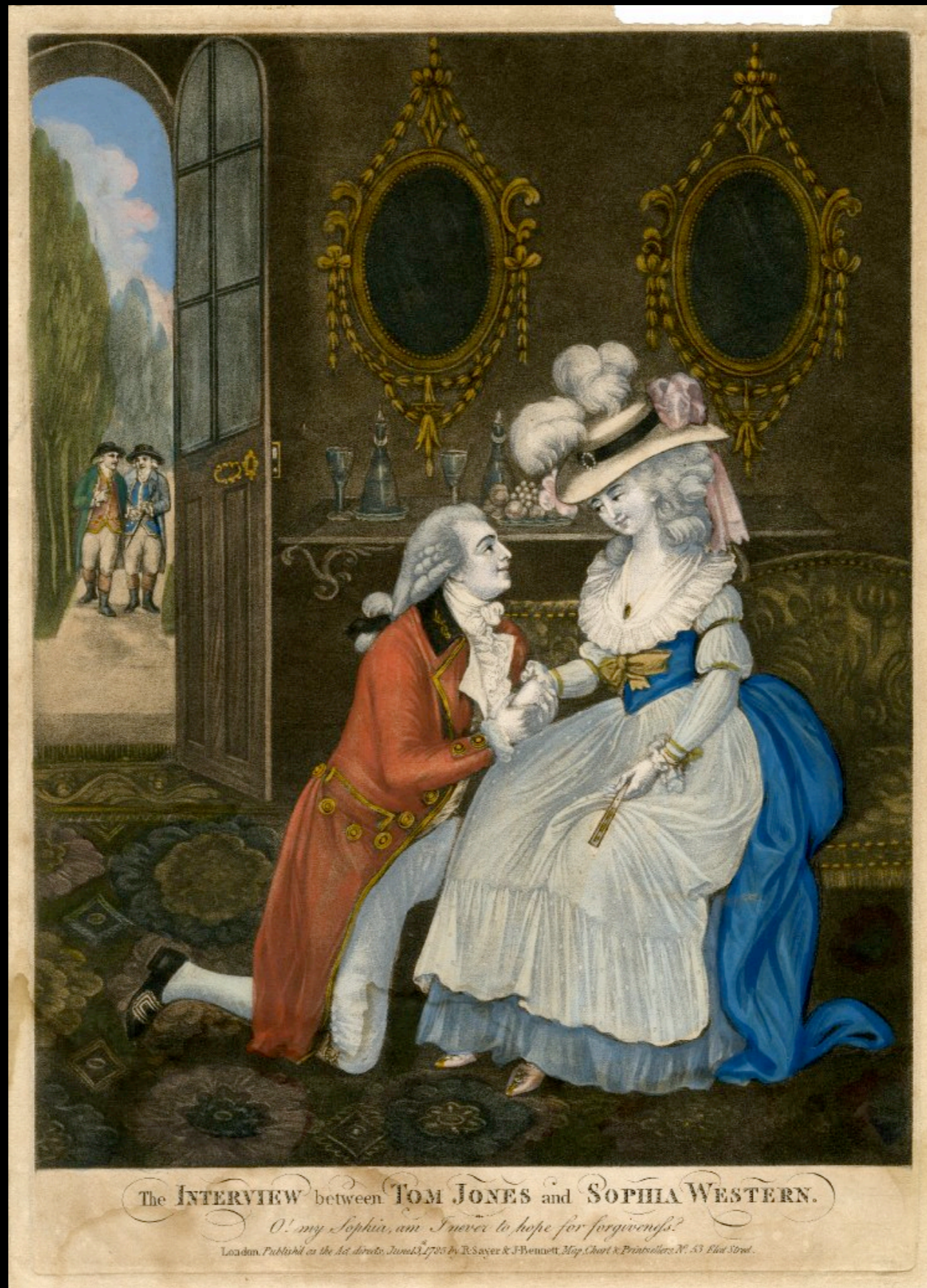
“The INTERVIEW between TOM JONES and SOPHIA WESTERN” by Sayer & Benett 1785 (The British Museum)