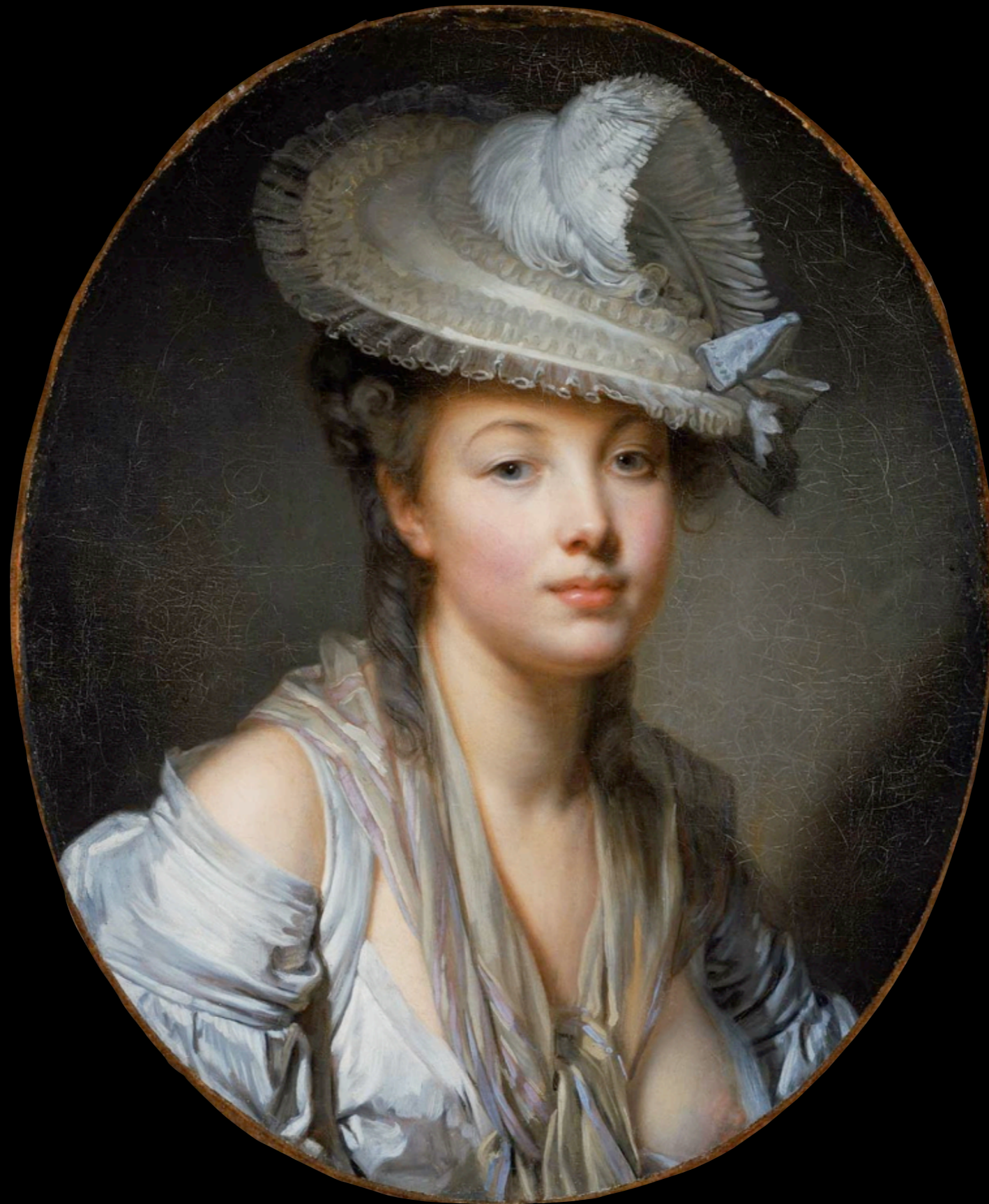
The White Hat by Jean-Baptiste Greuze 1780 (Museum of Fine Arts, Boston)