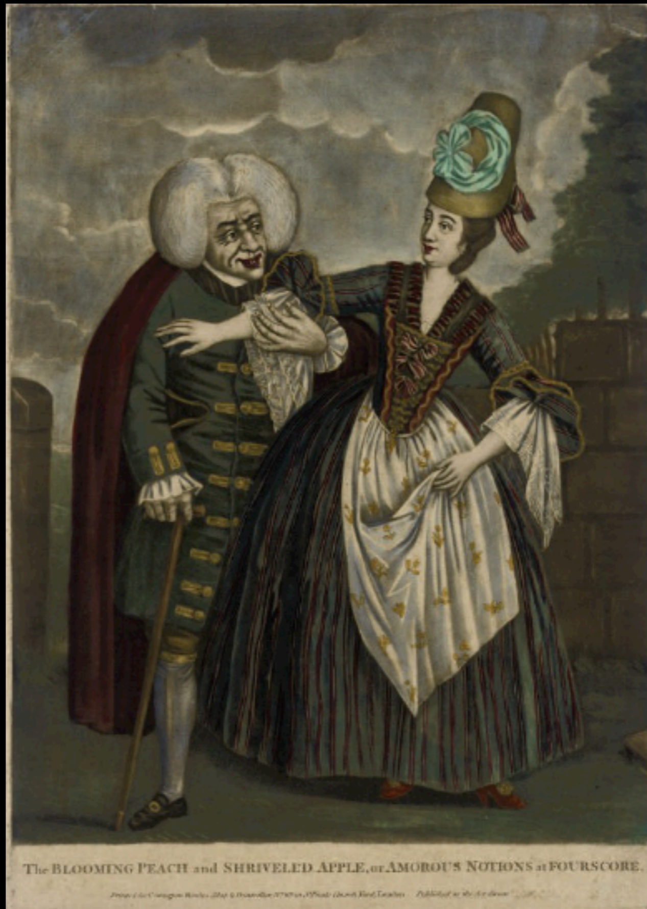
The BLOOMING PEACH and SHRIVELLED APPLE, or AMOUROUS NOTIONS at FOURSORE.