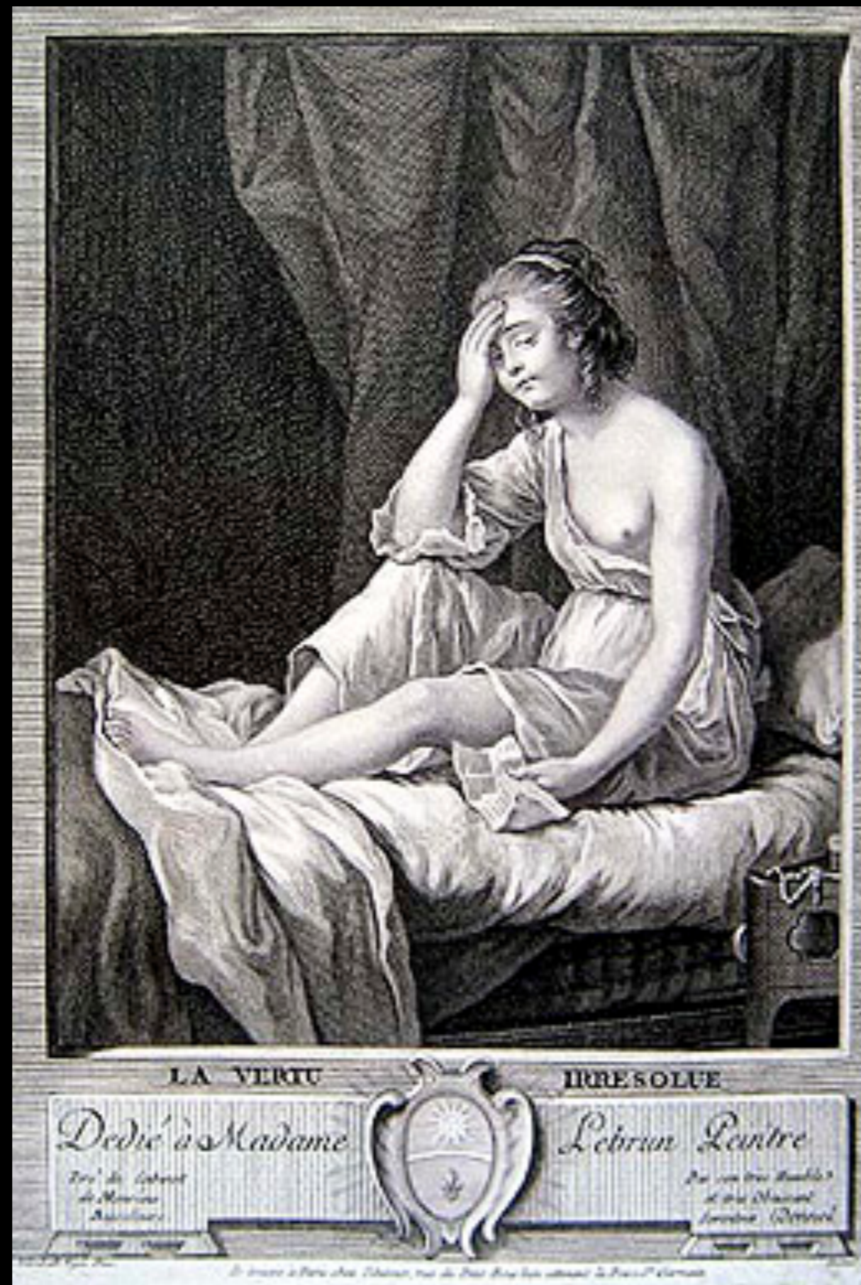
“LA VERTU IRRESOLUE” - Irresolute Virtue Antoine Francois Denon after the original by Louise Elisabeth Vigée Le Brun 1781