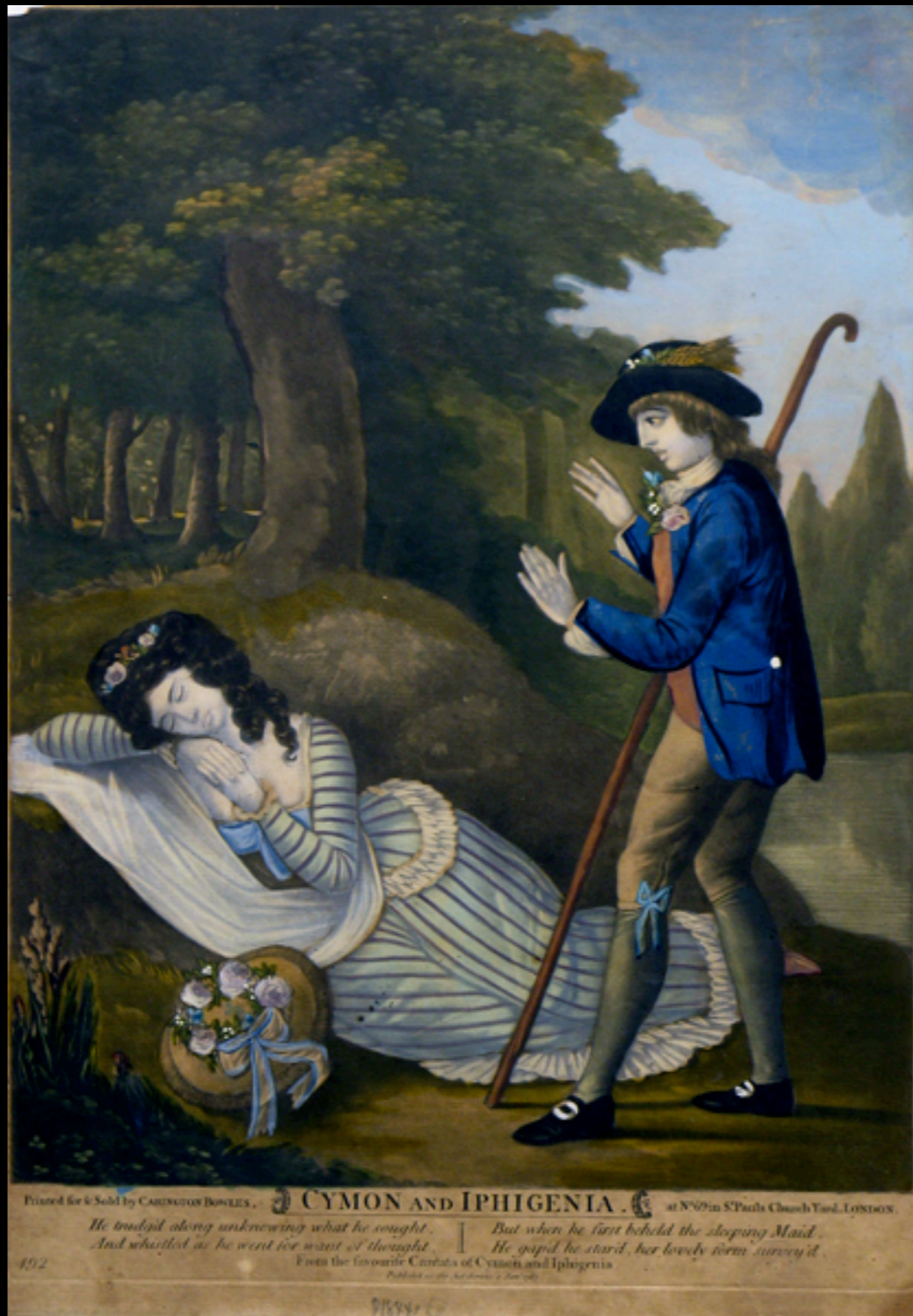
“CYMON and IPHIGENIA” by Carington Bowles 1783