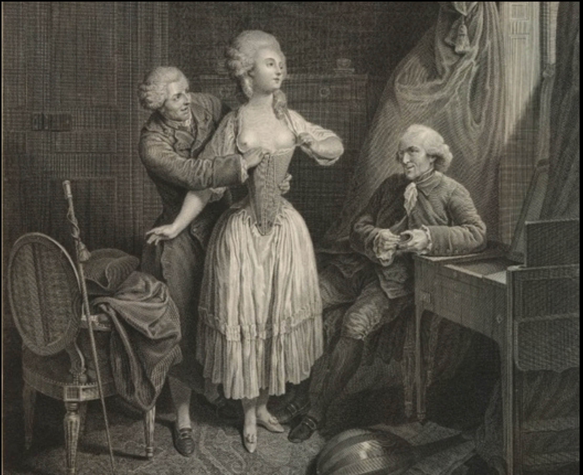
L'ESSAI DU CORSET by unknown