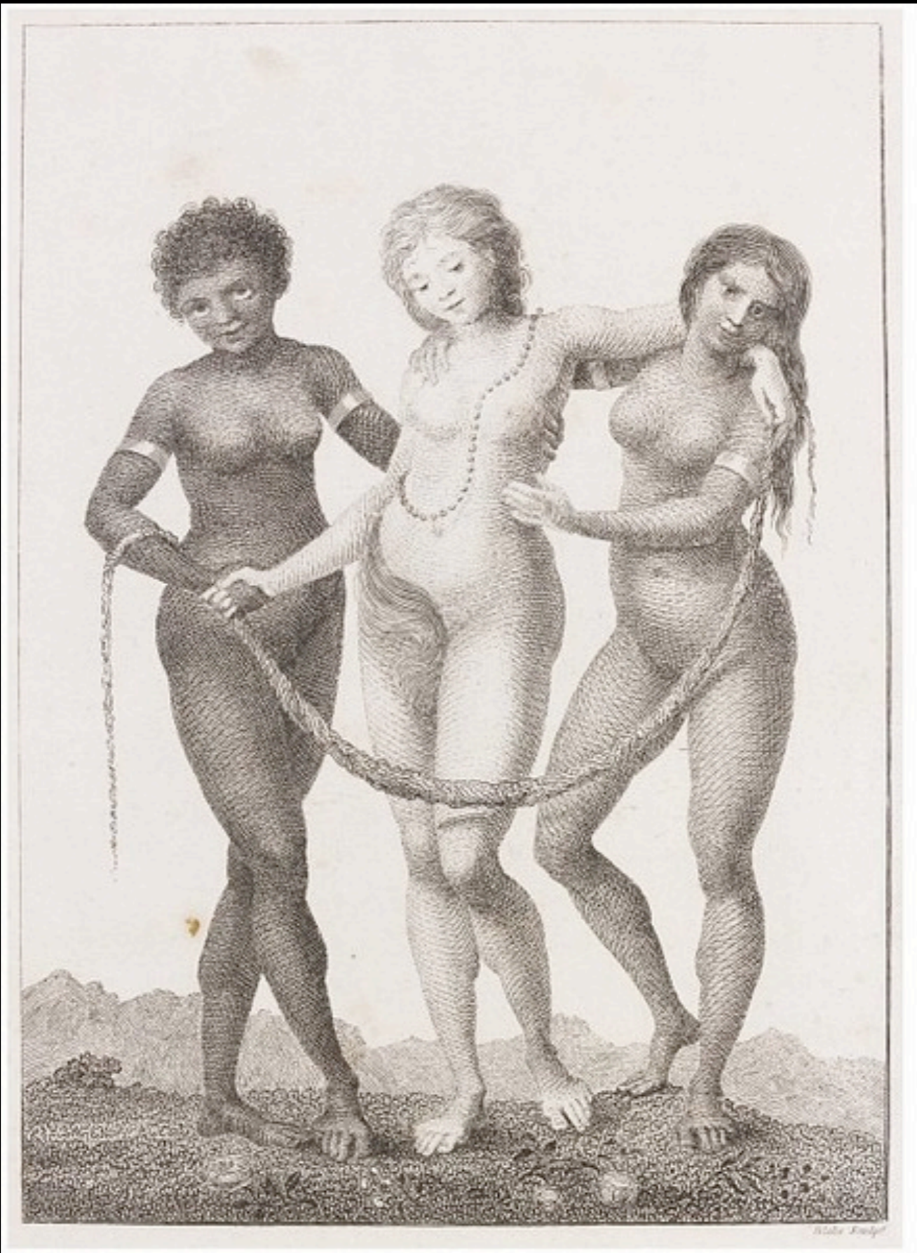
Europe Supported by Africa and America by William Blake c. 1796 (Victoria & Albert Museum)