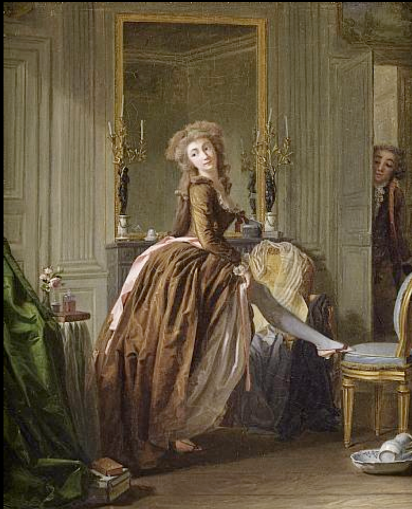
“Elegant Lady at her Toilette” by Michel Garnier, 1788