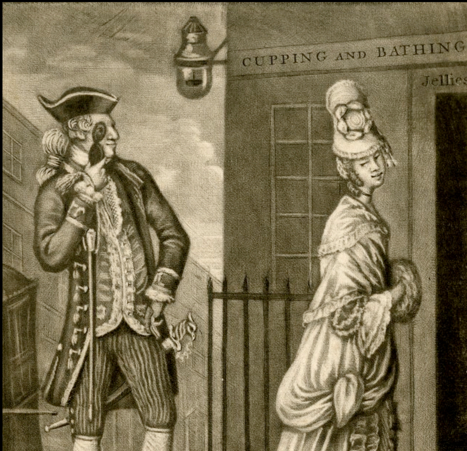
"The COVENT GARDEN MACARONI" by Carington Bowles c. 1786 (The British Museum)