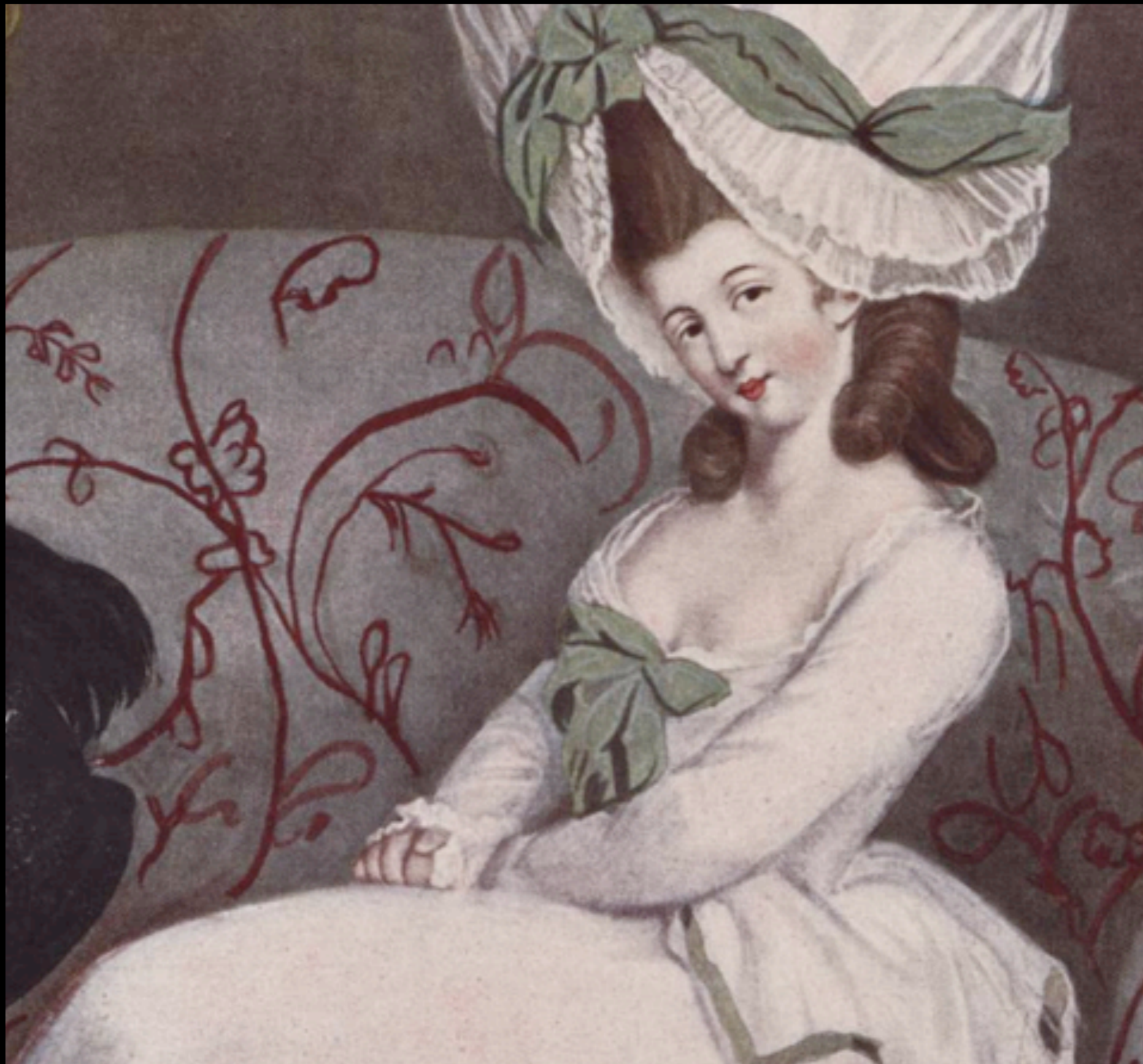
"A Man Trap" by Carington Bowles 1780 (Yale Center for British Art)