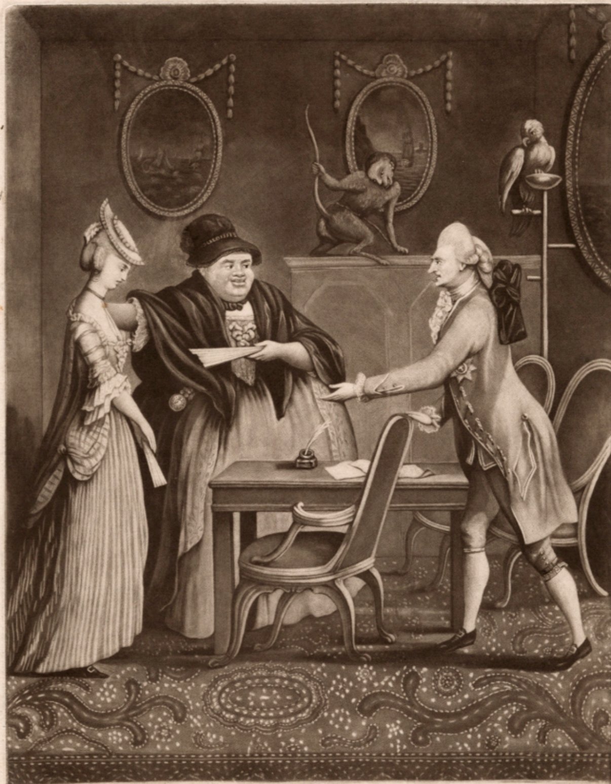
A TRUE TOWN PICTURE; OR An OLD HAG of DRURY presenting a CHICKEN to his LORDSHIP.