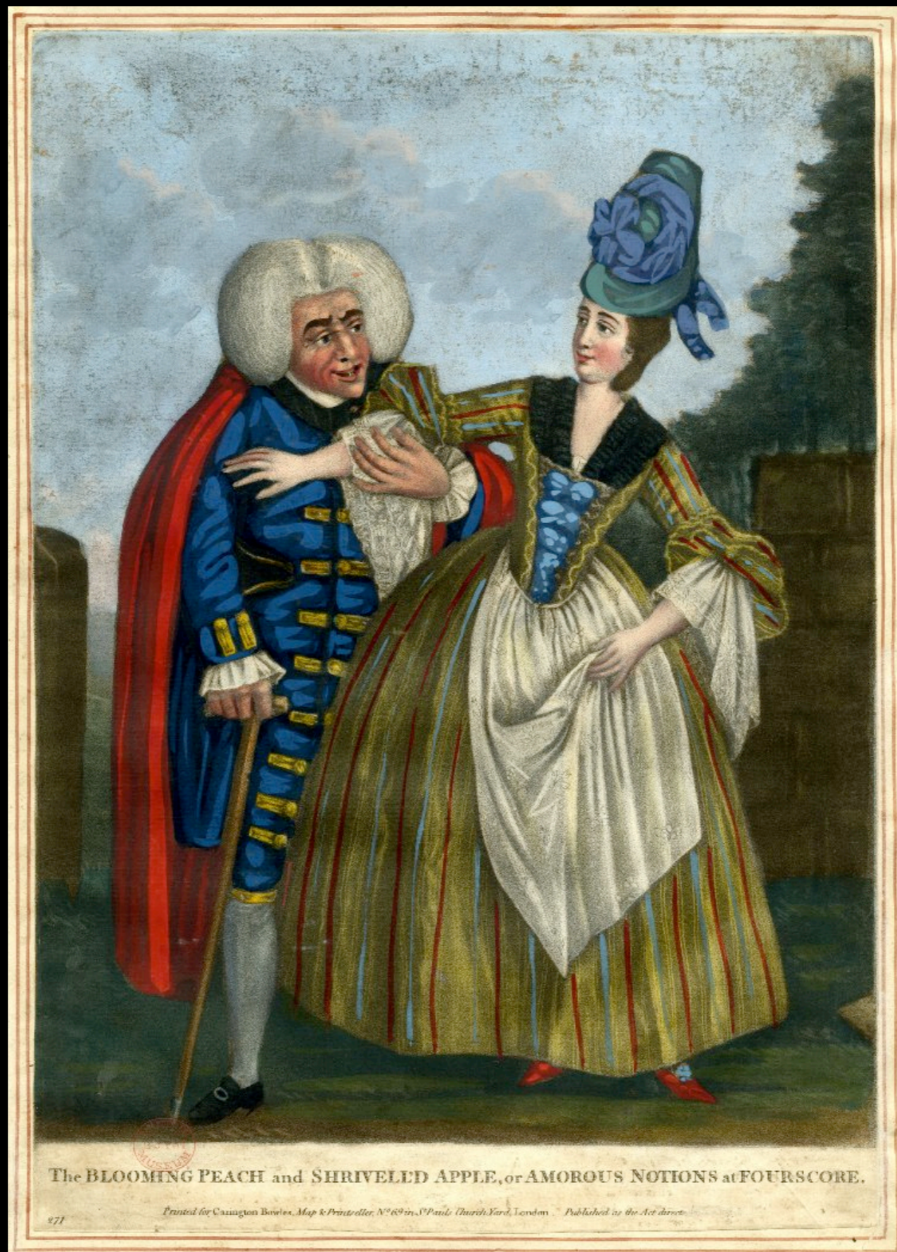
“The BLOOMING PEACH and SHRIVELL'D APPLE, or AMOROUS NOTIONS at FOURSORE” by Carington Bowles 1773 (The British Museum)