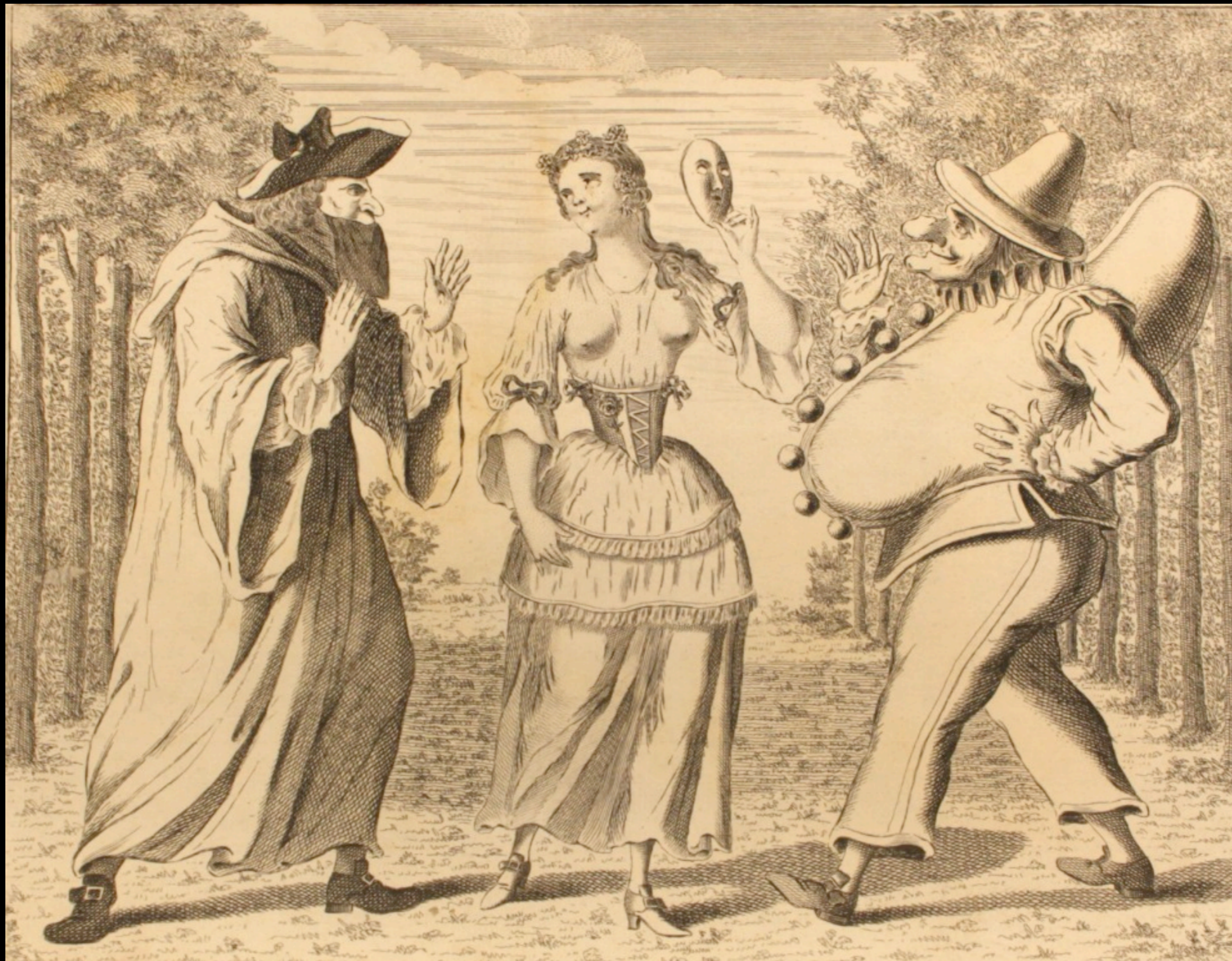
Bigamist Elizabeth Chudleigh, Duchess of Kingston