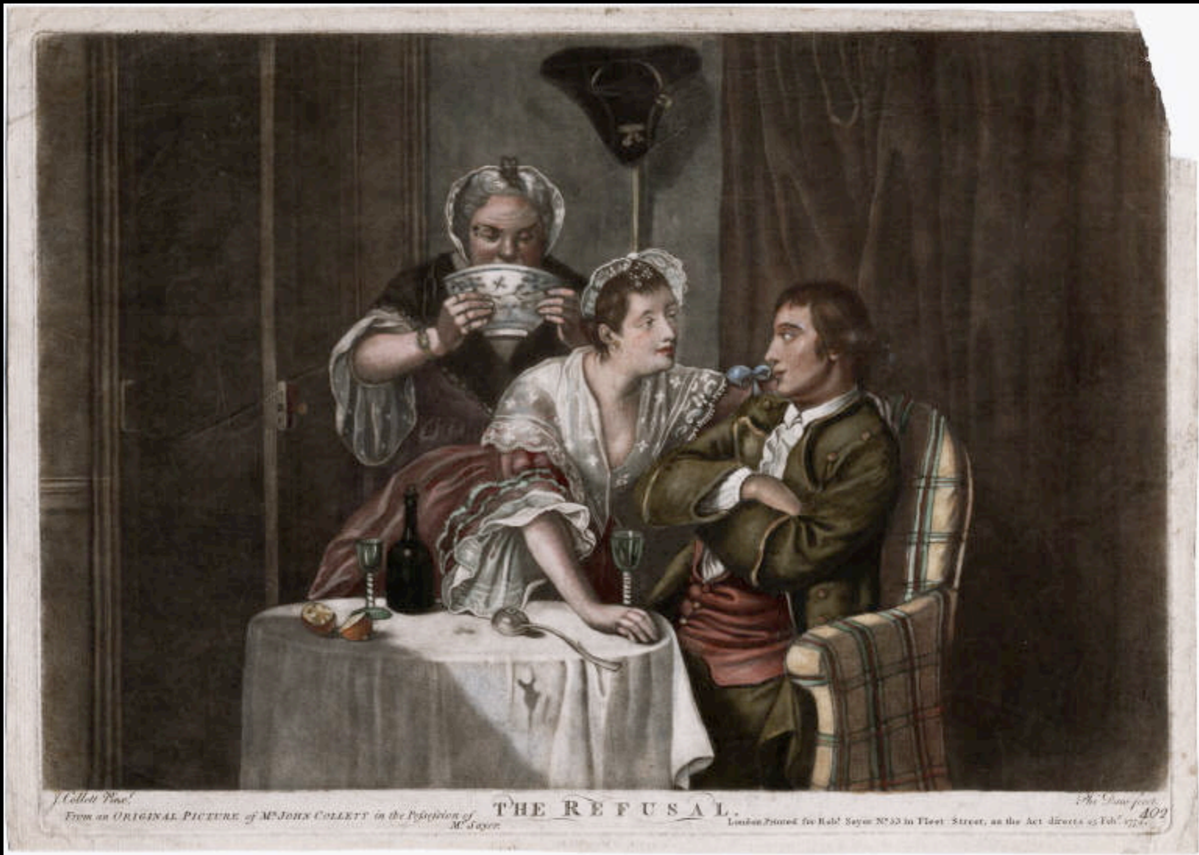
"THE REFUSAL" Printed for Robt. Sayer, No. 53 in Fleet Street, as the act directs, 25 Feby. 1774