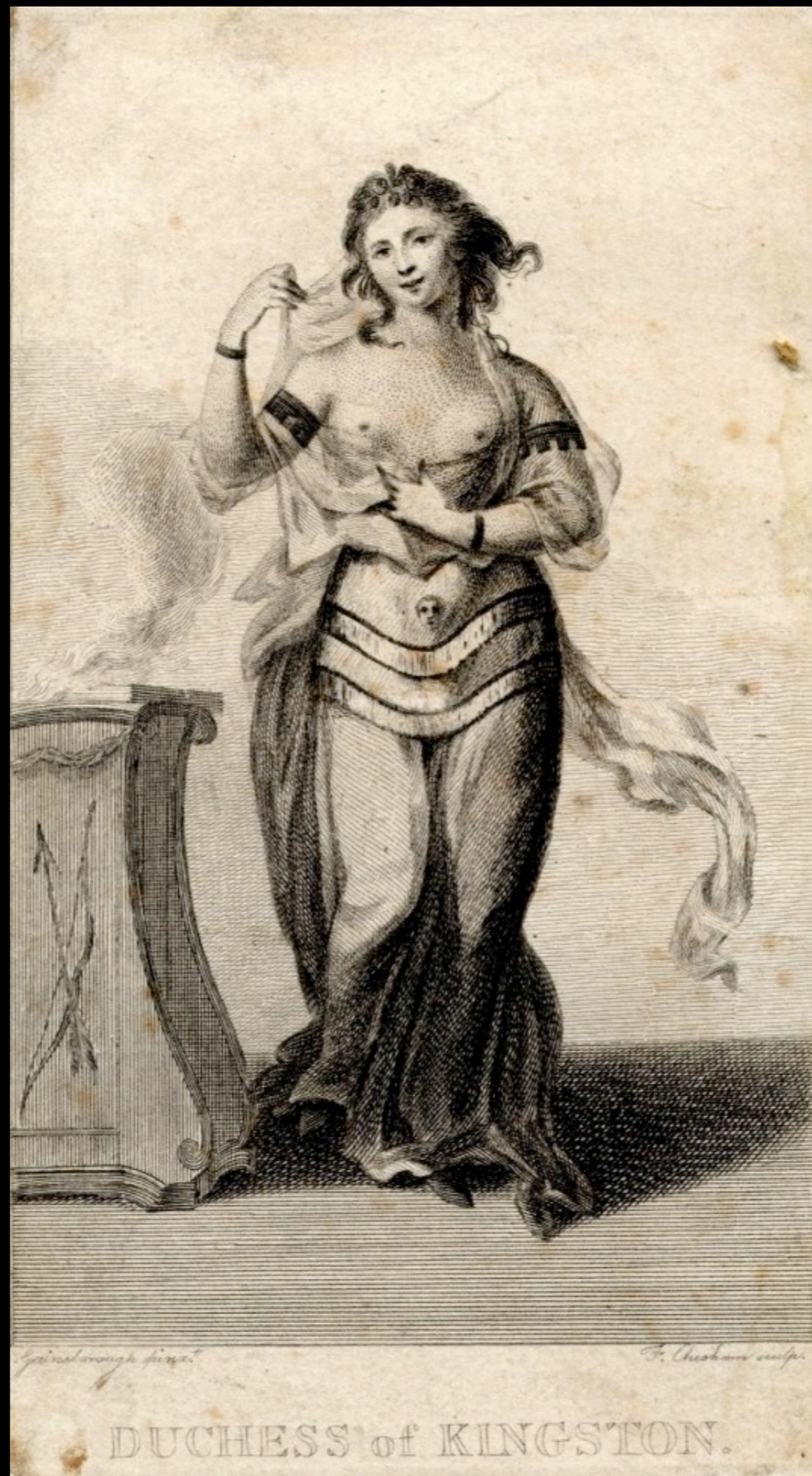
"DUCHESS OF KINGSTON"