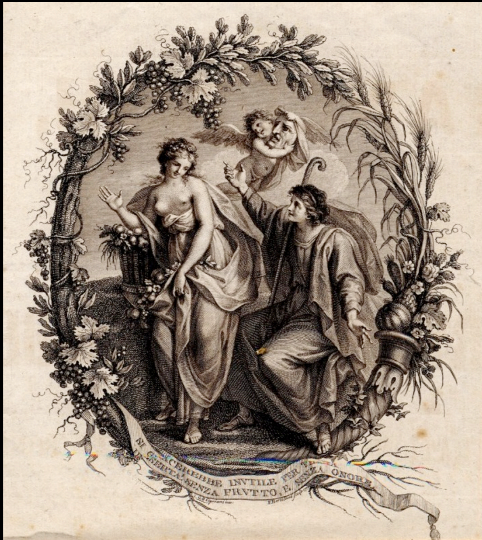
Bigamist Elizabeth Chudleigh, Duchess of Kingston