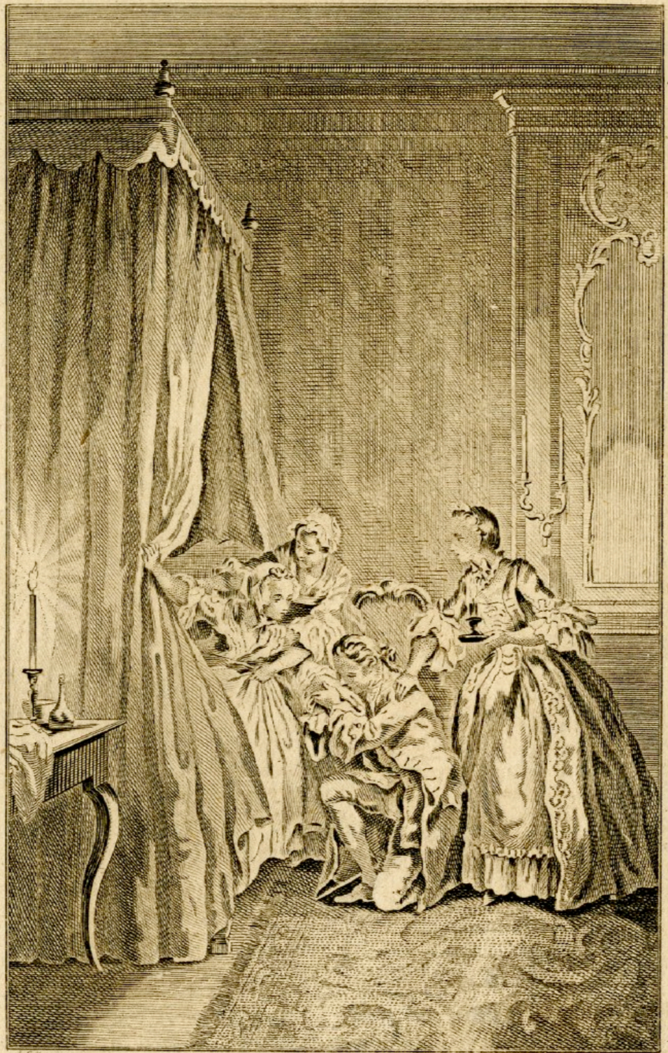
Inoculation for Love.

“Innoculation for Love” by Joseph Coliyer Mid 18th Century (The British Museum)