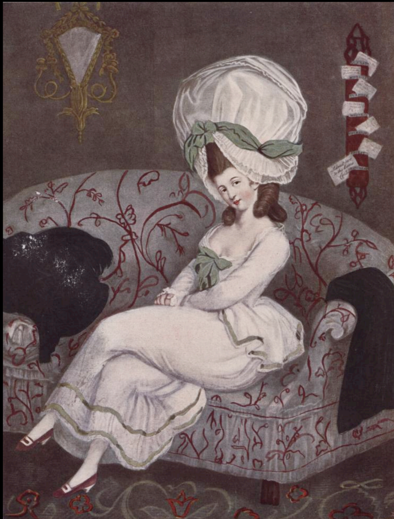
"A Man Trap" by Carington Bowles 1780 (Yale Center for British Art)