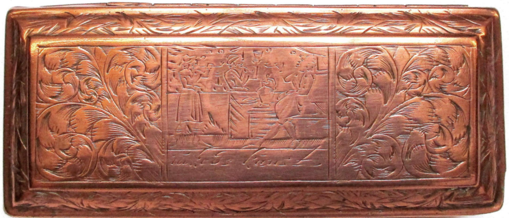
English Copper Tobacco Box Mid 18th Century (Victoria & Albert)