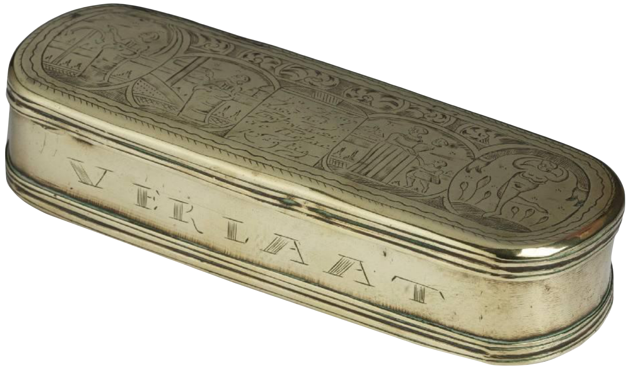
Dutch Brass Tobacco Box c. 1750 (Eye Stone Antiques, Ltd.)