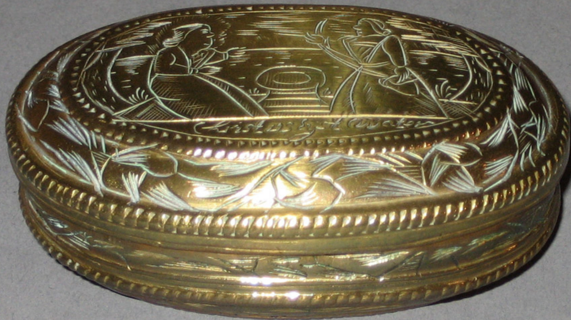
Dutch Brass Tobacco Box