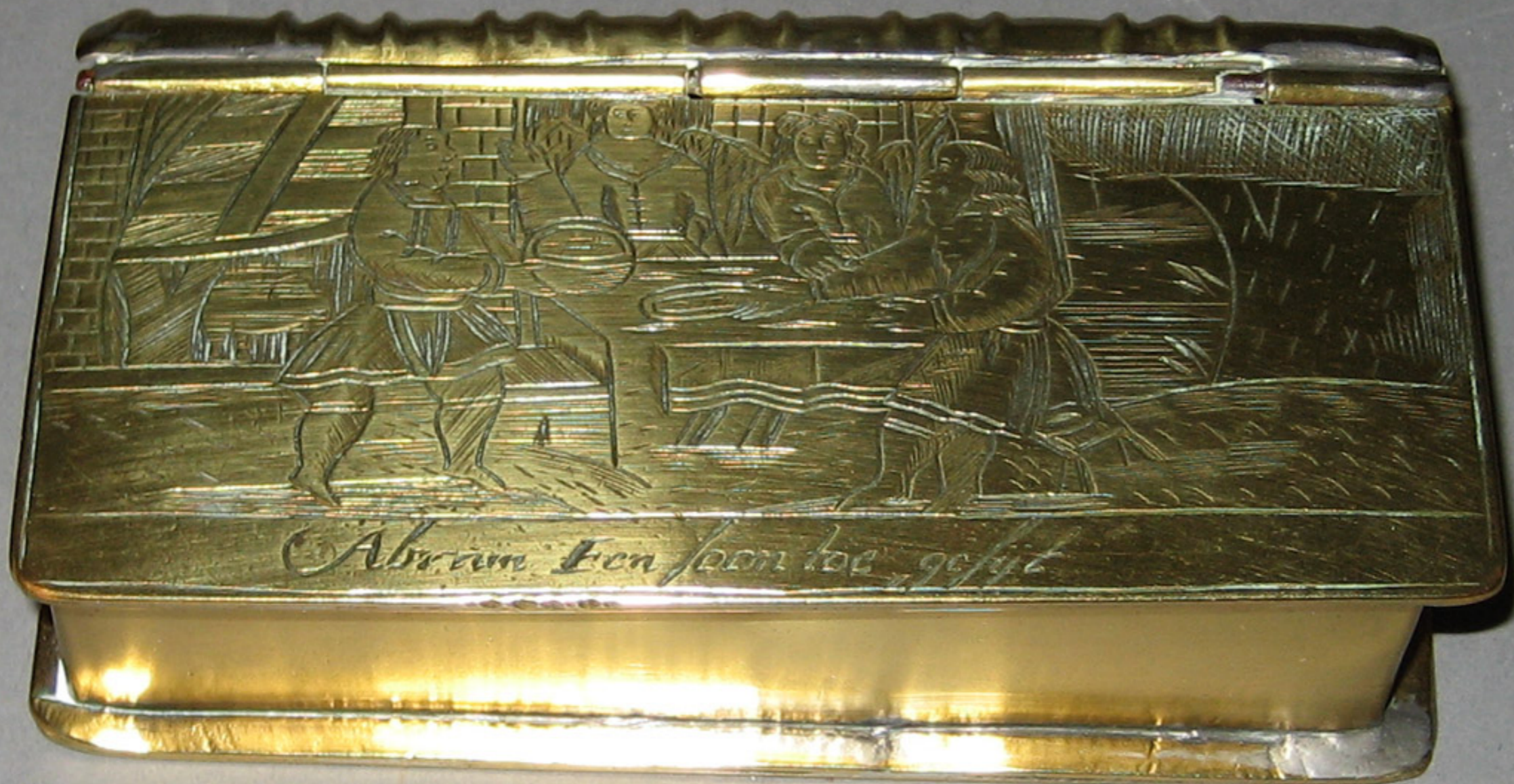
Dutch Brass Tobacco Box