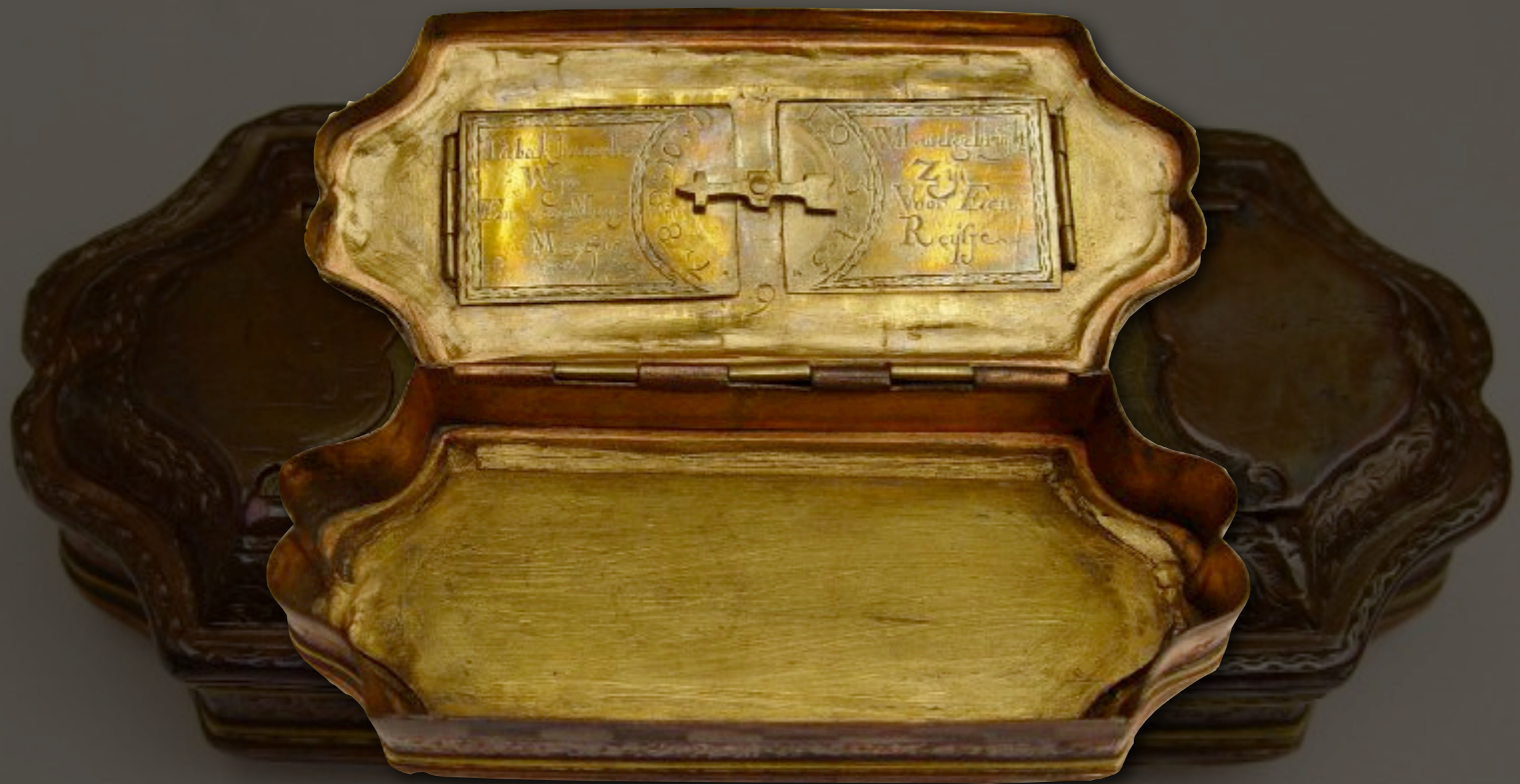
Dutch Brass & Copper Tobacco Box Designs Relating to the Union of England & Holland Against France c. 1756 - 1763