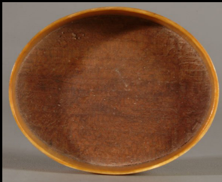
English Horn & Wood Tobacco Box Dated 1704 (Brunk Auctions)