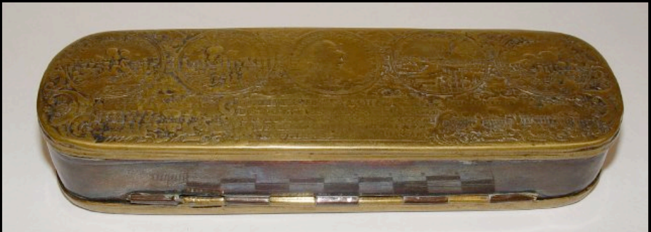
German Brass & Copper Tobacco Box c. 1757 - 1763 Depicting Frederick the Great and Battle Scenes from the 7 Years War (The British Museum)