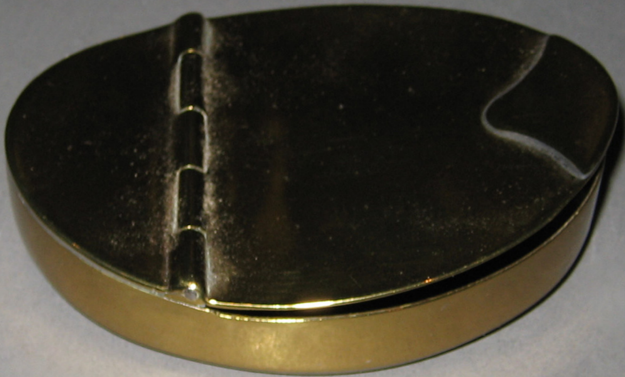
English Brass Tobacco Box c. 1770 - 1800 (Winterthur)