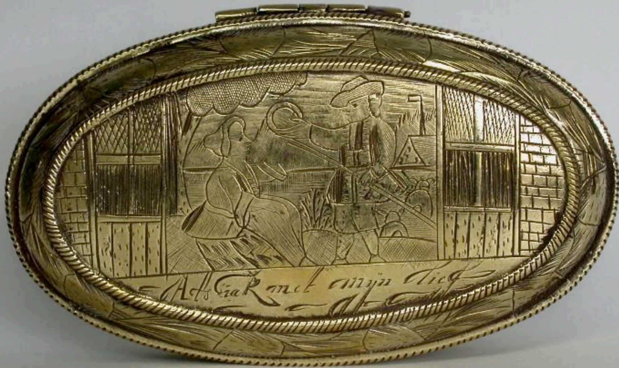
Dutch Brass Tobacco Box Mid 18th Century (Private Collection)