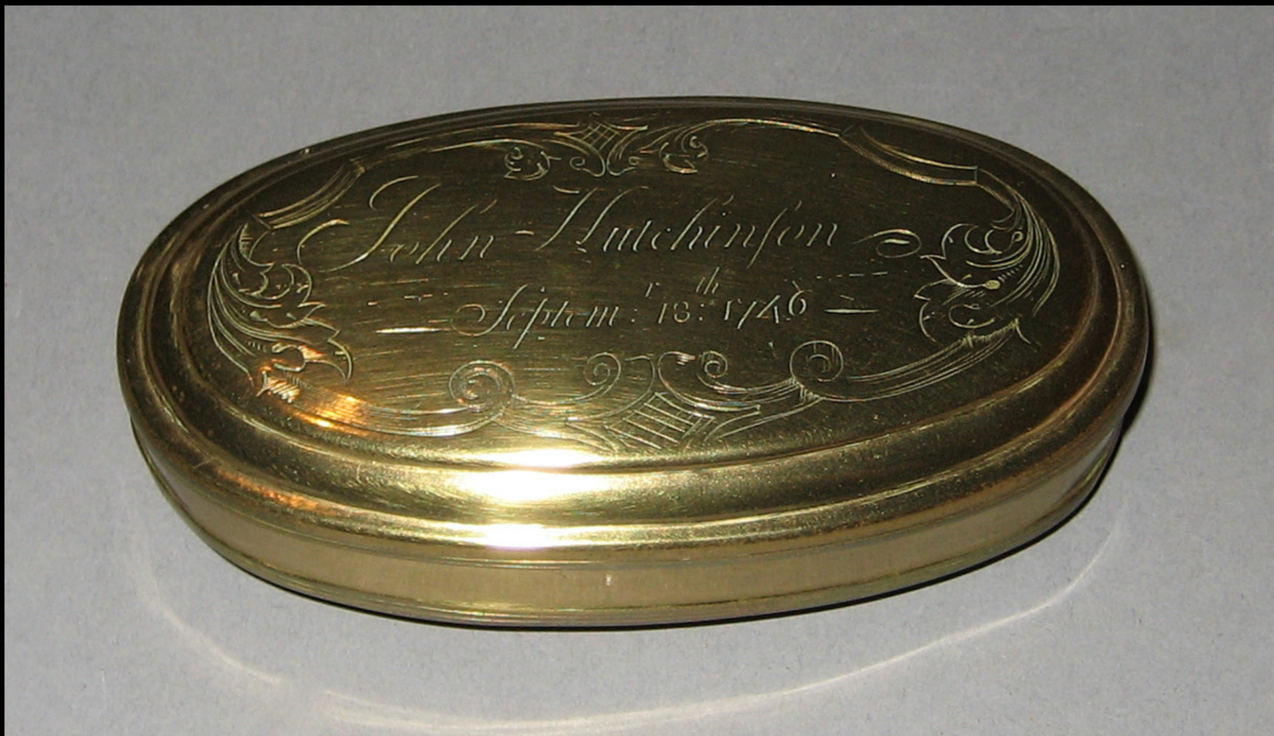
English or Dutch Brass Tobacco Box