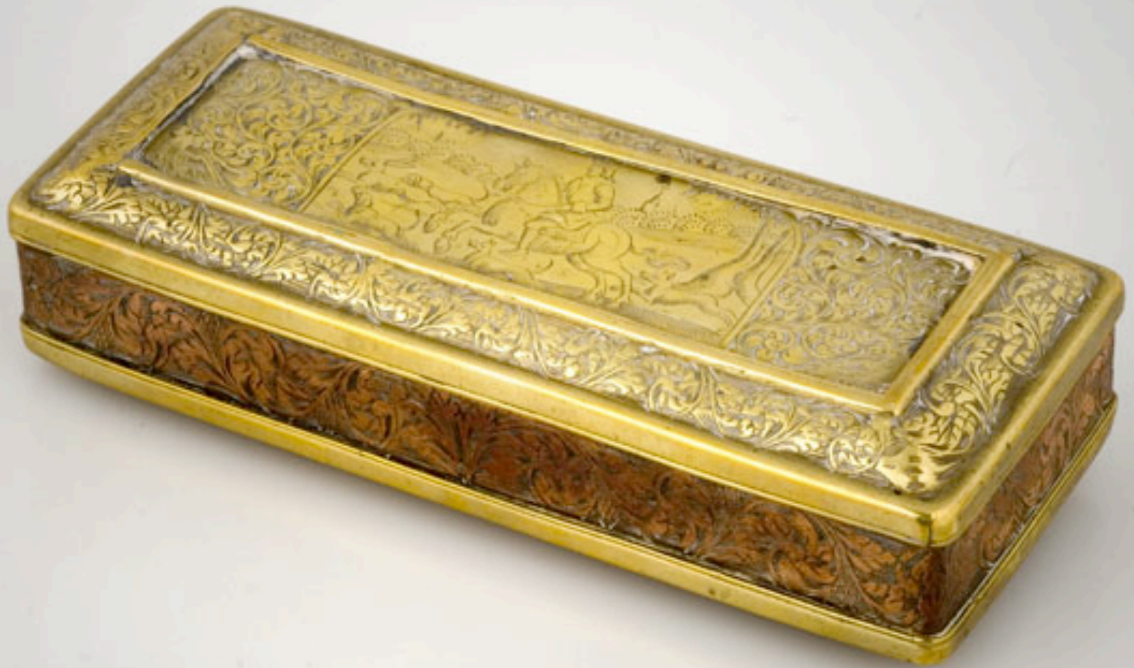
Dutch Brass and Copper Tobacco Box Mid-18th Century (Private Collection)