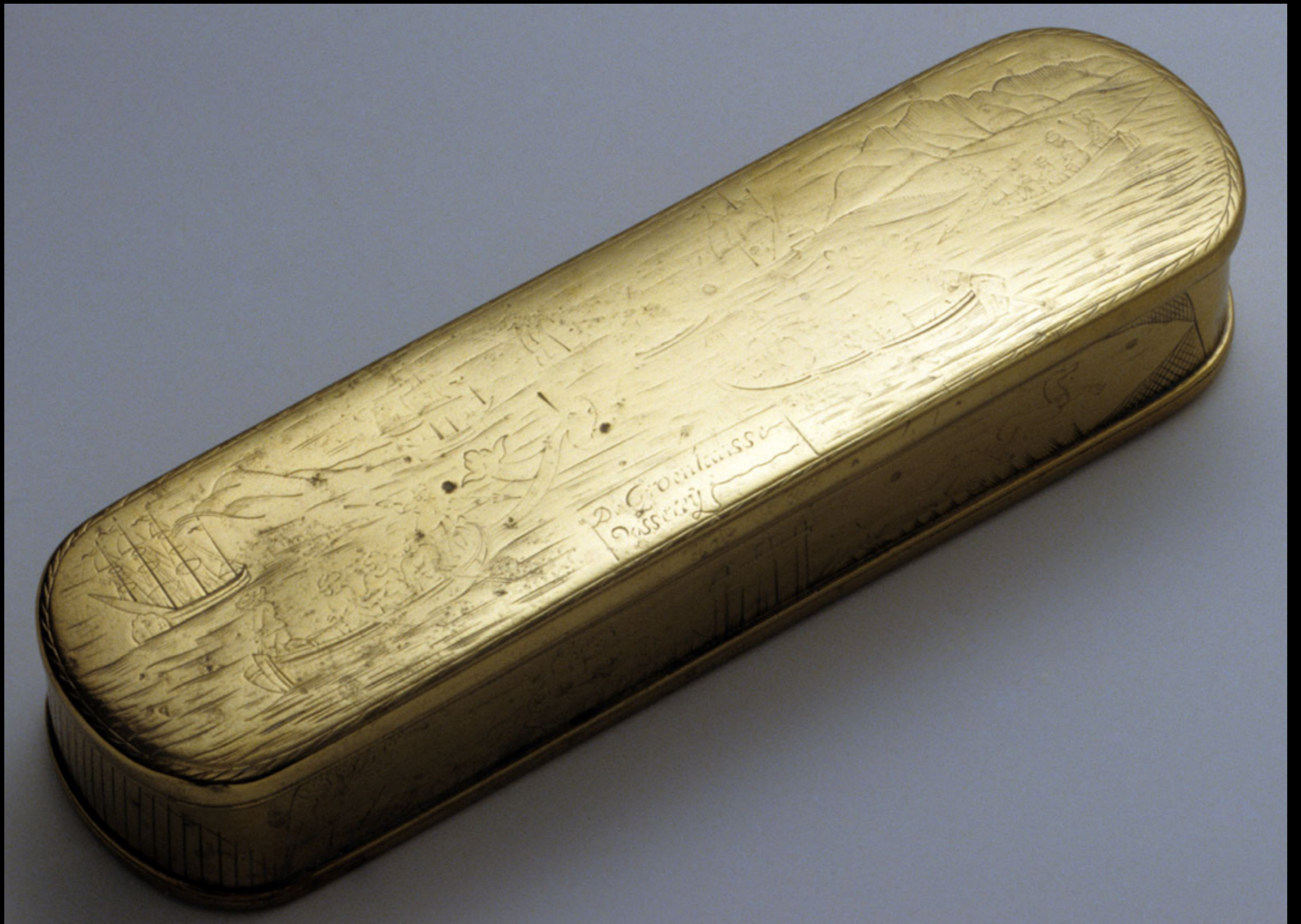
Dutch Brass Tobacco Box