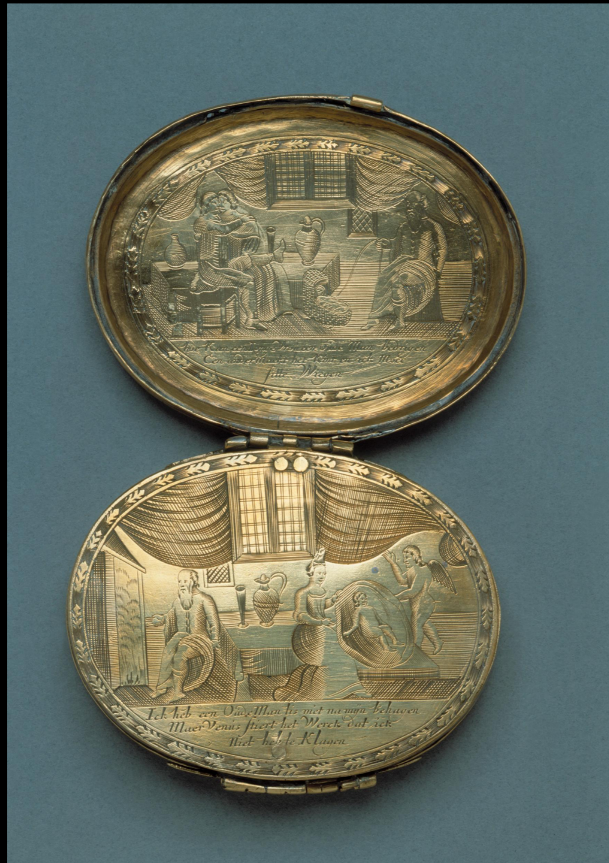
Dutch Silver Tobacco Box Early 18th Century (Victoria & Albert)