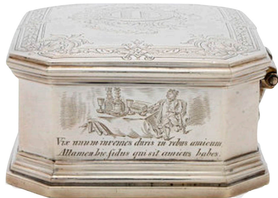
English Silver Tobacco Box from London by Paul de Lamerie c. 1723 - 1724 (Victoria & Albert)