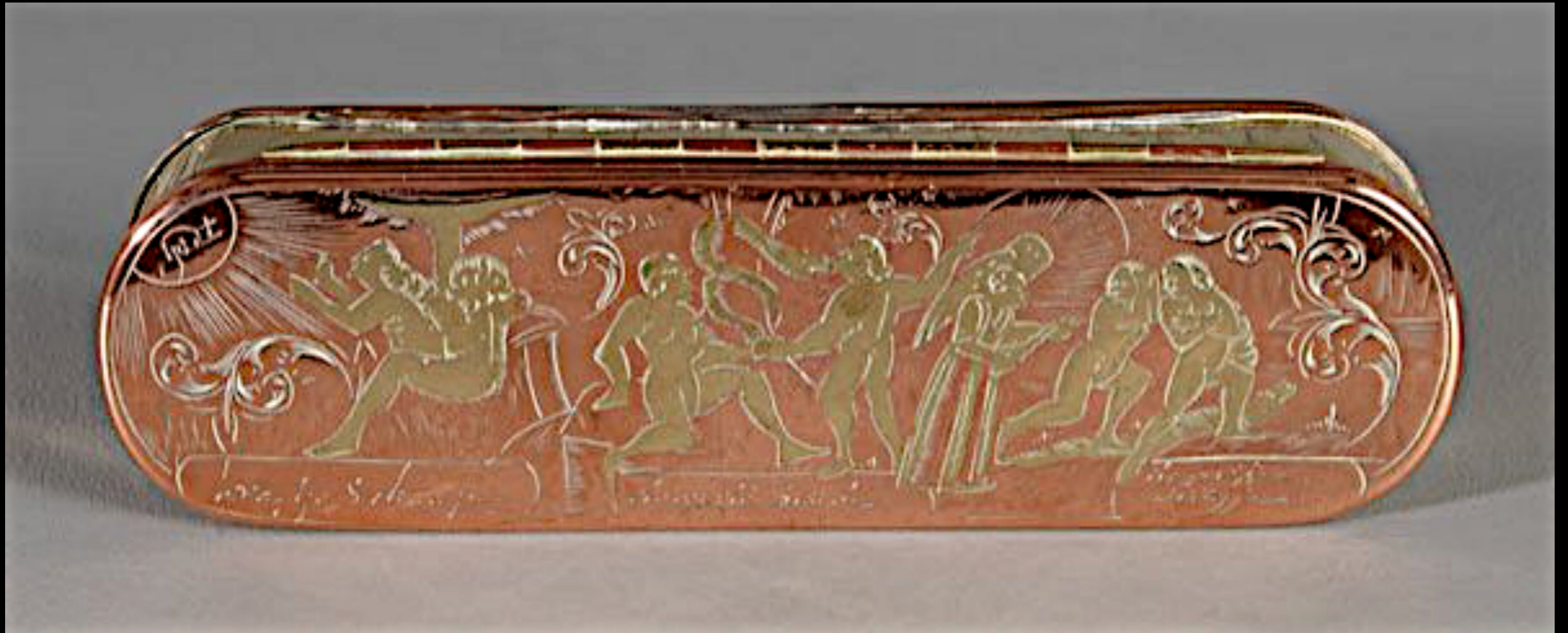
Dutch Brass and Copper Tobacco Box Depicting Scenes from the Old Testament The Expulsion of Adam and Eve, Abraham's Sacrifice of Isaac, & Cain and Abel Mid-18th Century