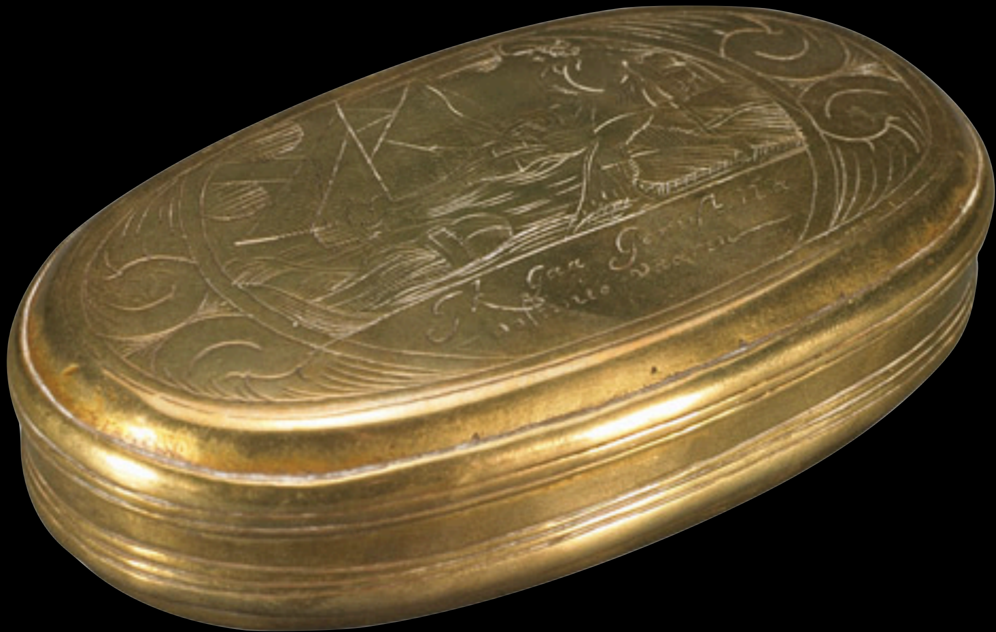
Dutch Brass Tobacco Box Mid 18th Century (Private Collection)