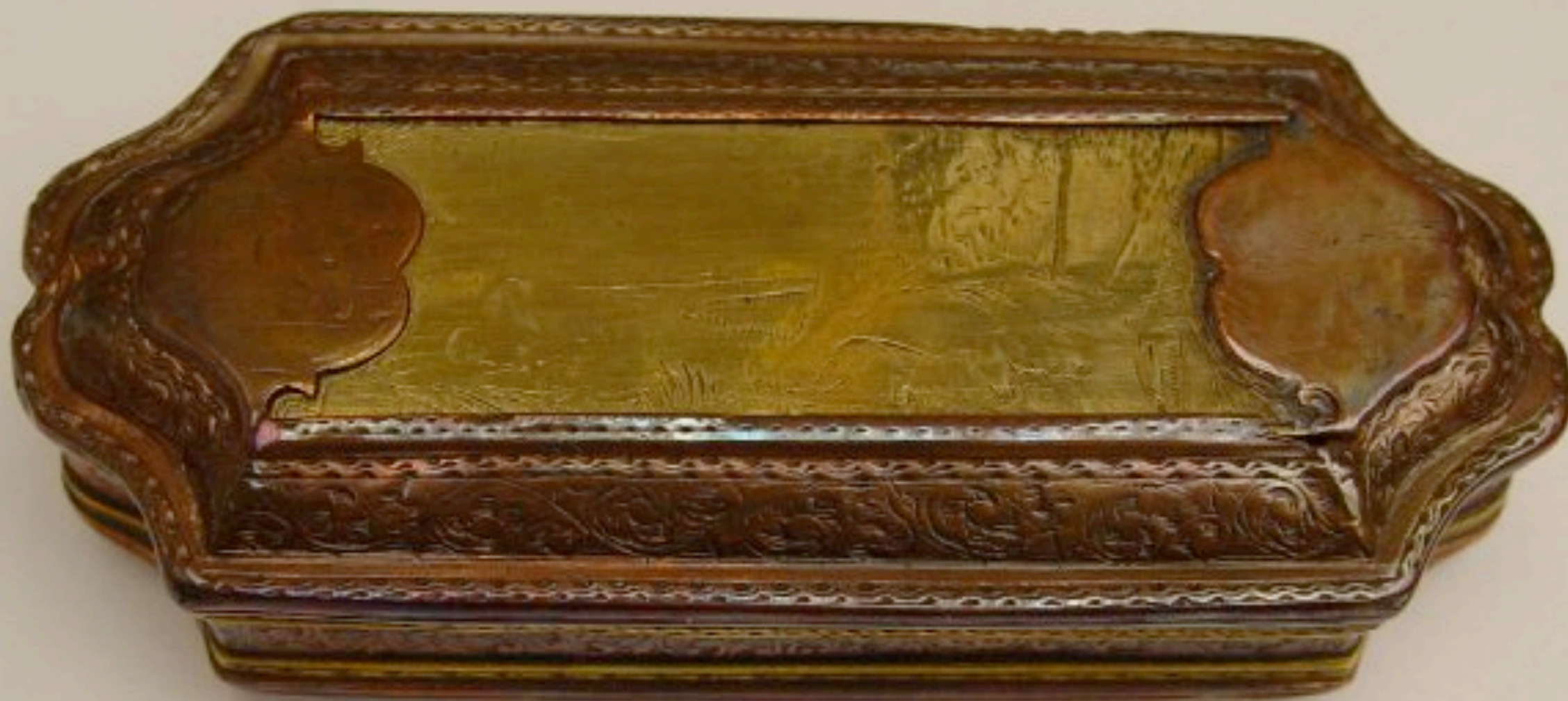
Dutch Brass & Copper Tobacco Box Designs Relating to the Union of England & Holland Against France c. 1756 - 1763 (The British Museum)