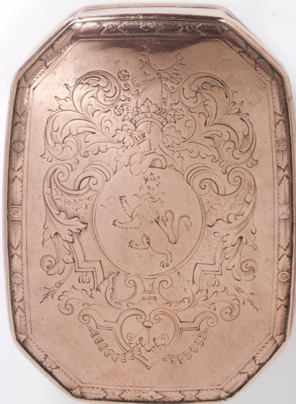
English Copper Tobacco Box c. 1720 (Victoria & Albert)