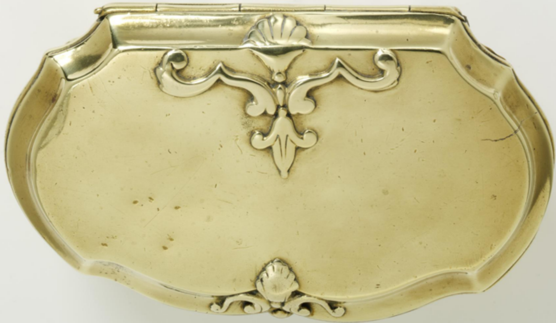
English or Dutch Brass Tobacco Box Mid 18th Century (Victoria & Albert)