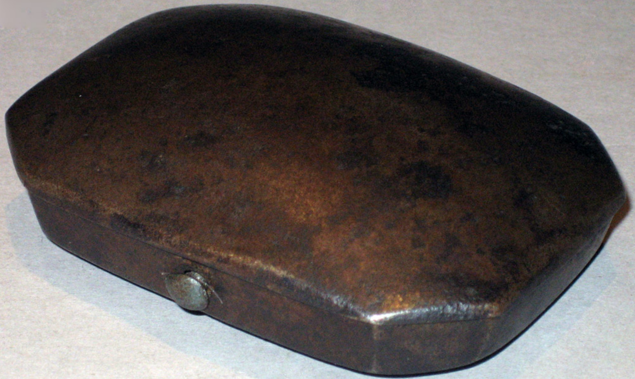
European Sheet Iron Tobacco Box