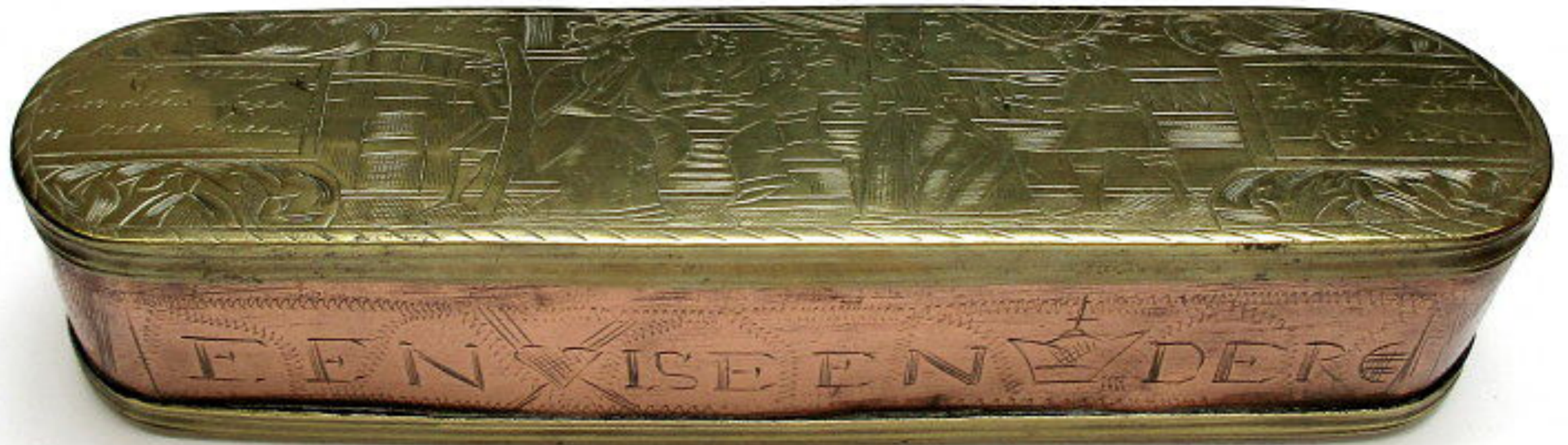
German Brass & Copper Tobacco Box