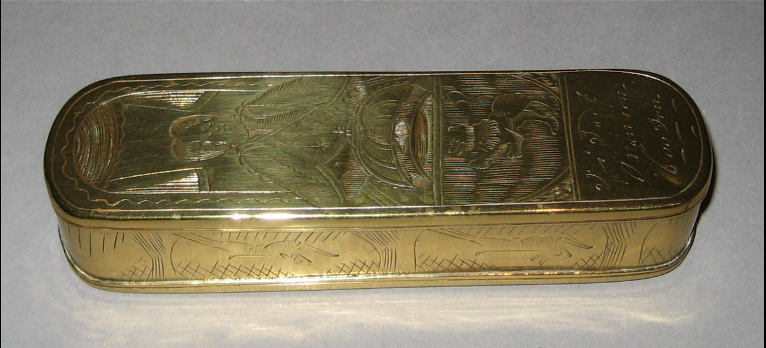
Dutch Brass Tobacco Box