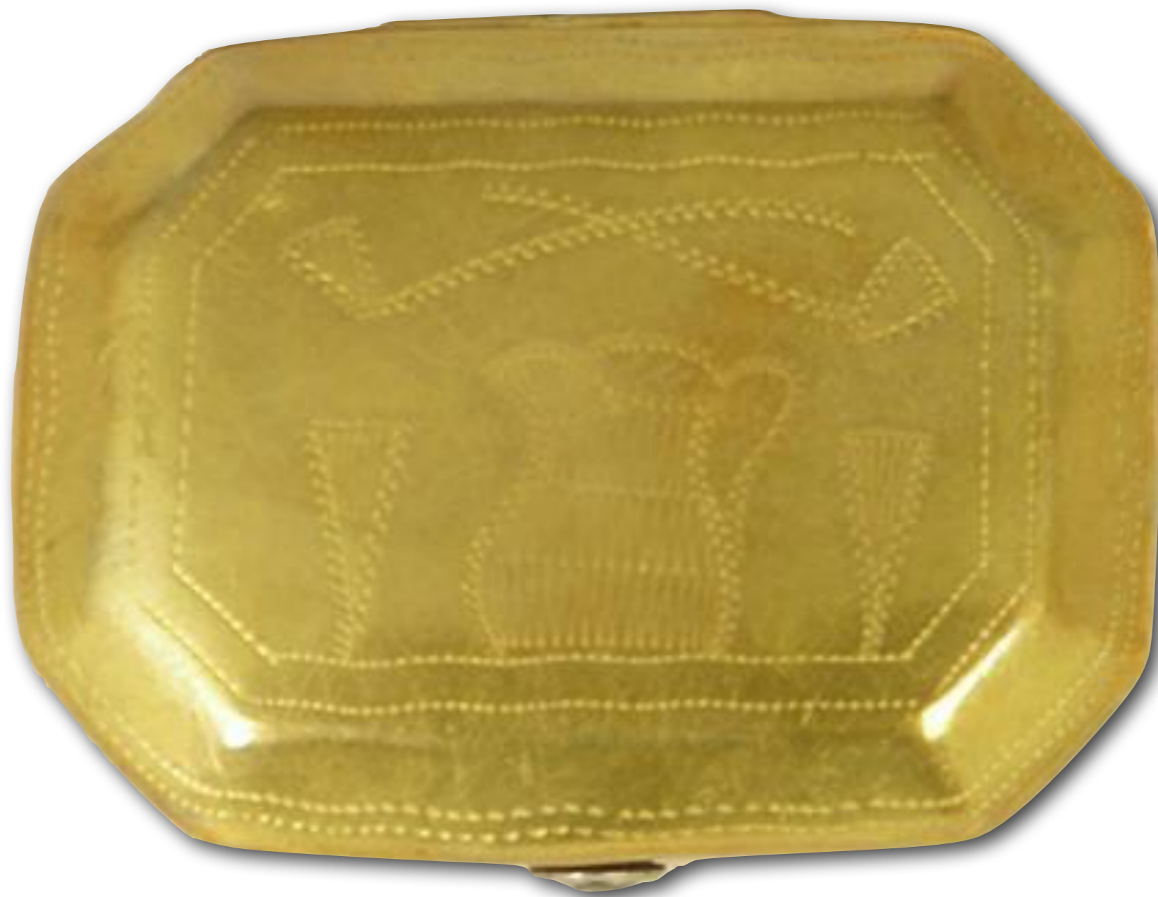
English Brass Tobacco Box 18th Century