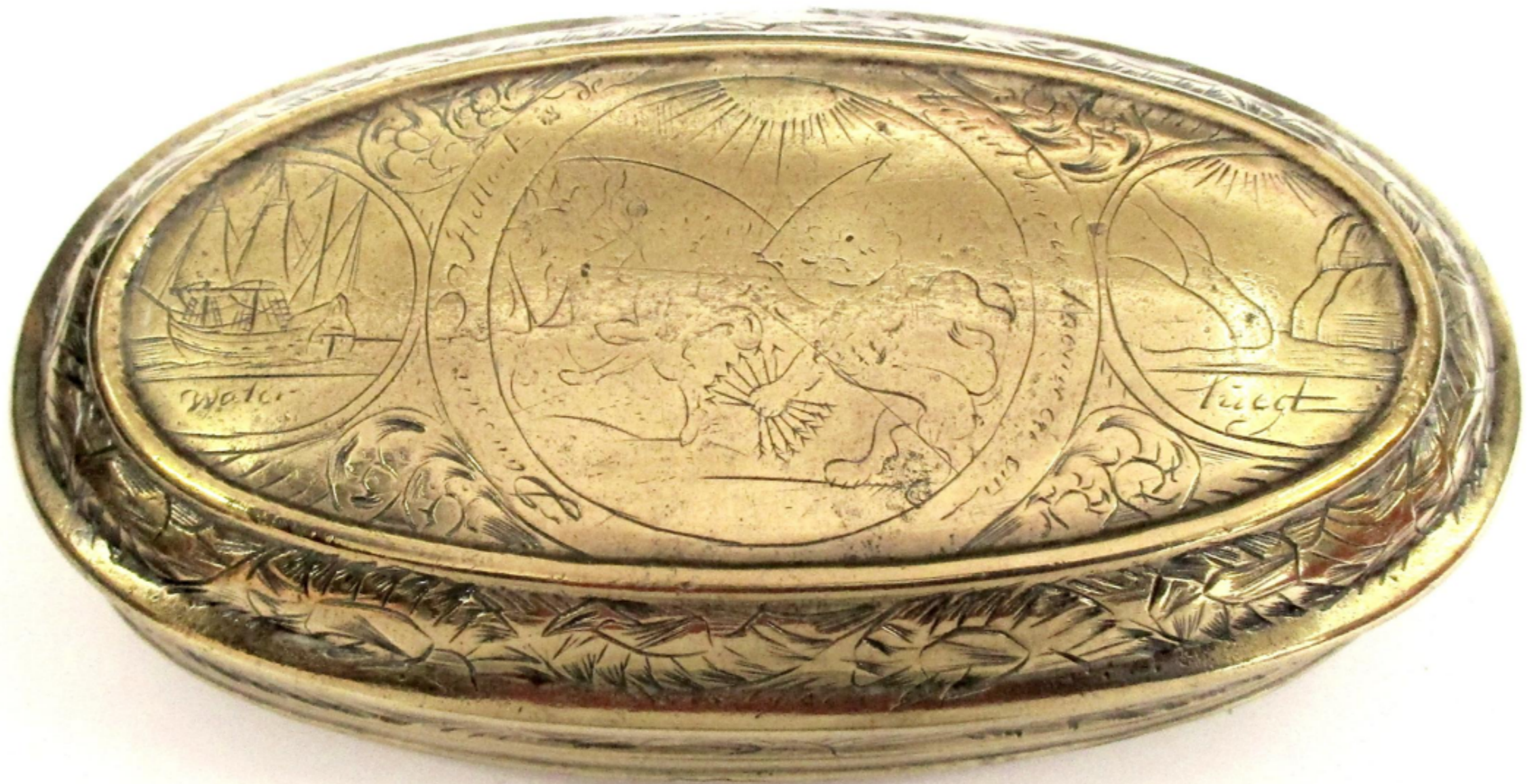
English or Dutch Brass Tobacco Box Mid 18th Century (Victoria & Albert)