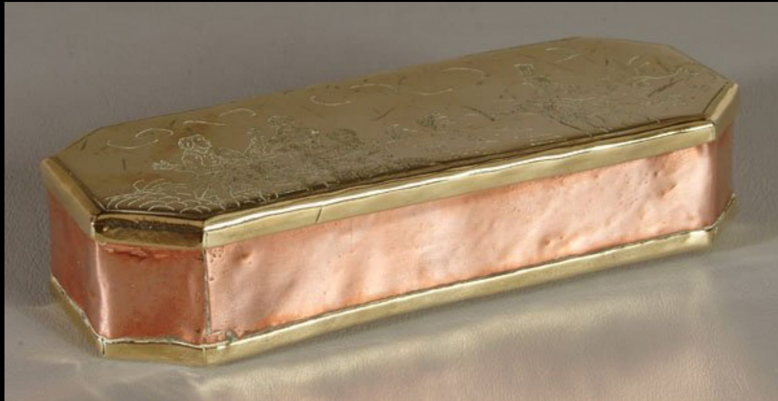
Brass & Copper Tobacco Box with an Abolitionist Theme Late 18th Century (Brunk Auctions)