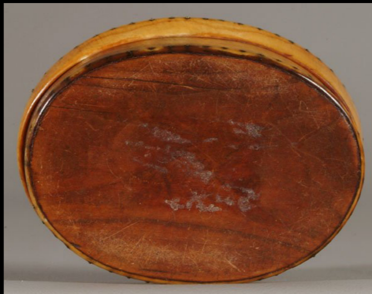
English Horn & Wood Tobacco Box "IF YOU LOVE MEE LEND MEE NOT / RP 1651"