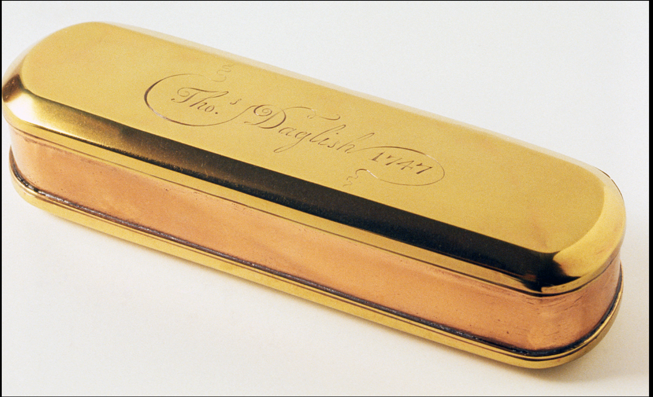
English Brass & Copper Tobacco Box