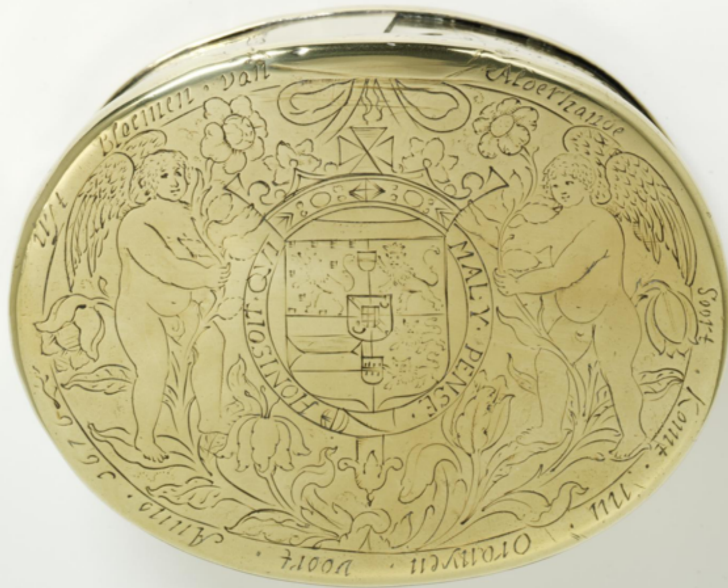
Dutch Brass Tobacco Box 1676 (Victoria & Albert)