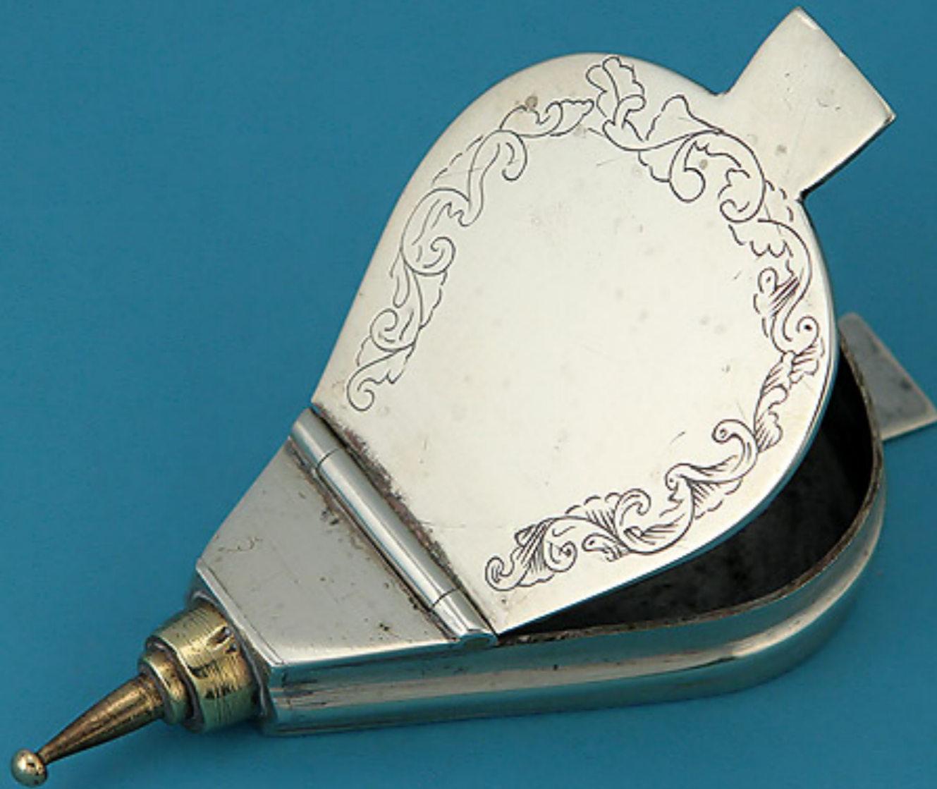
English Closed Plate Snuff/Tobacco Box Late 18th Century (M. Ford Creech Antiques & Fine Arts)