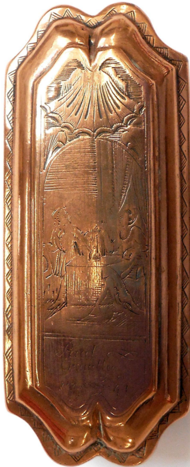
English Copper & Brass Tobacco Box