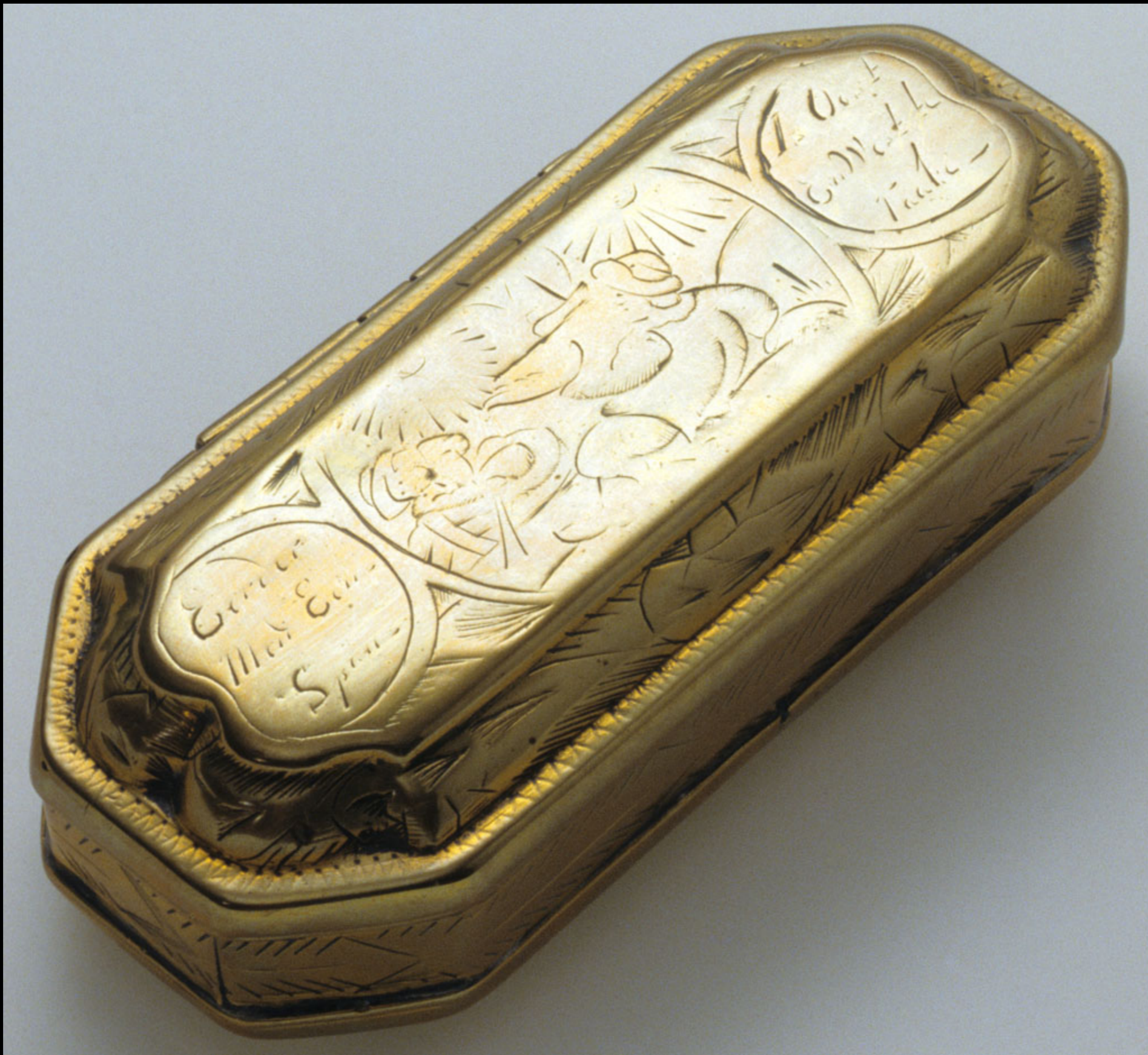
Dutch Brass Tobacco Box