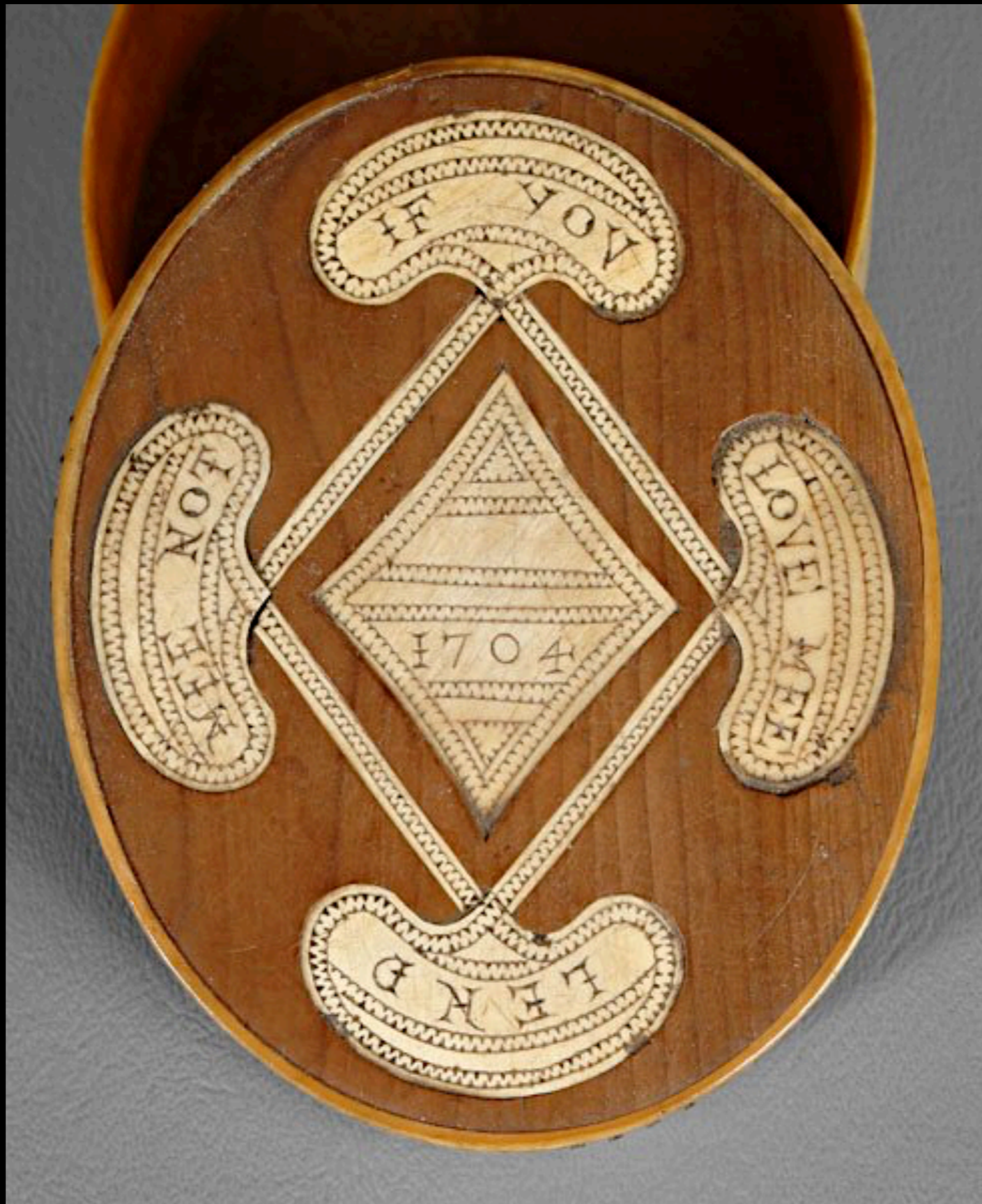
English Horn & Wood Tobacco Box Dated 1704 (Brunk Auctions)