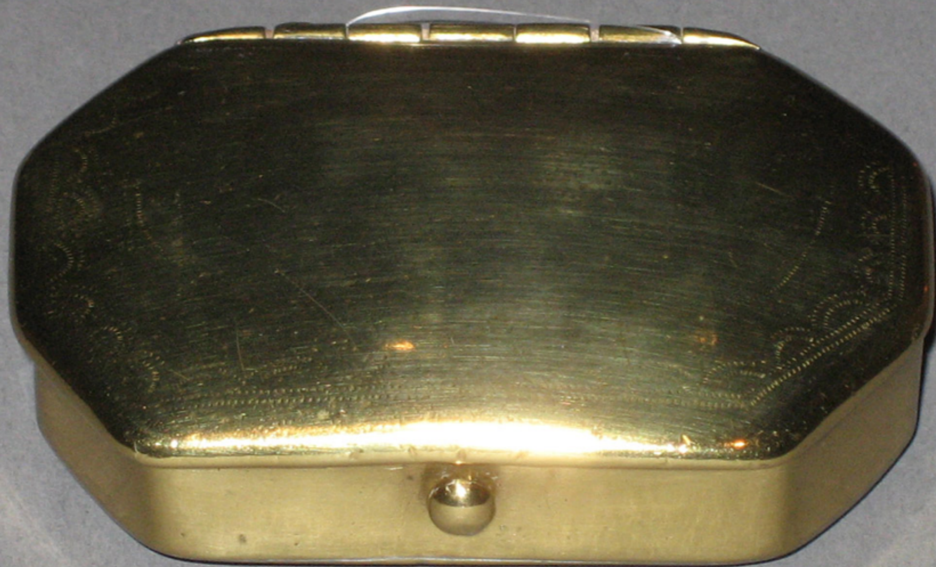
English Brass Tobacco Box