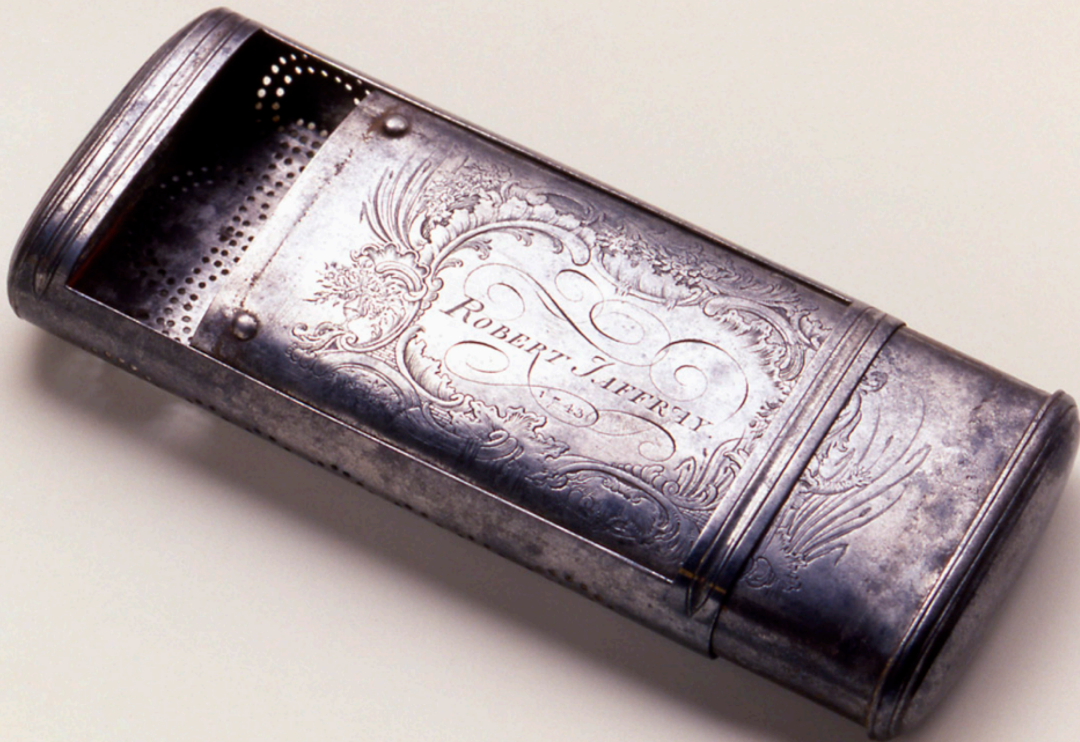
English Sheet Iron Tobacco Box from Birmingham by Thomas Lakin 1743 (Private Collection)