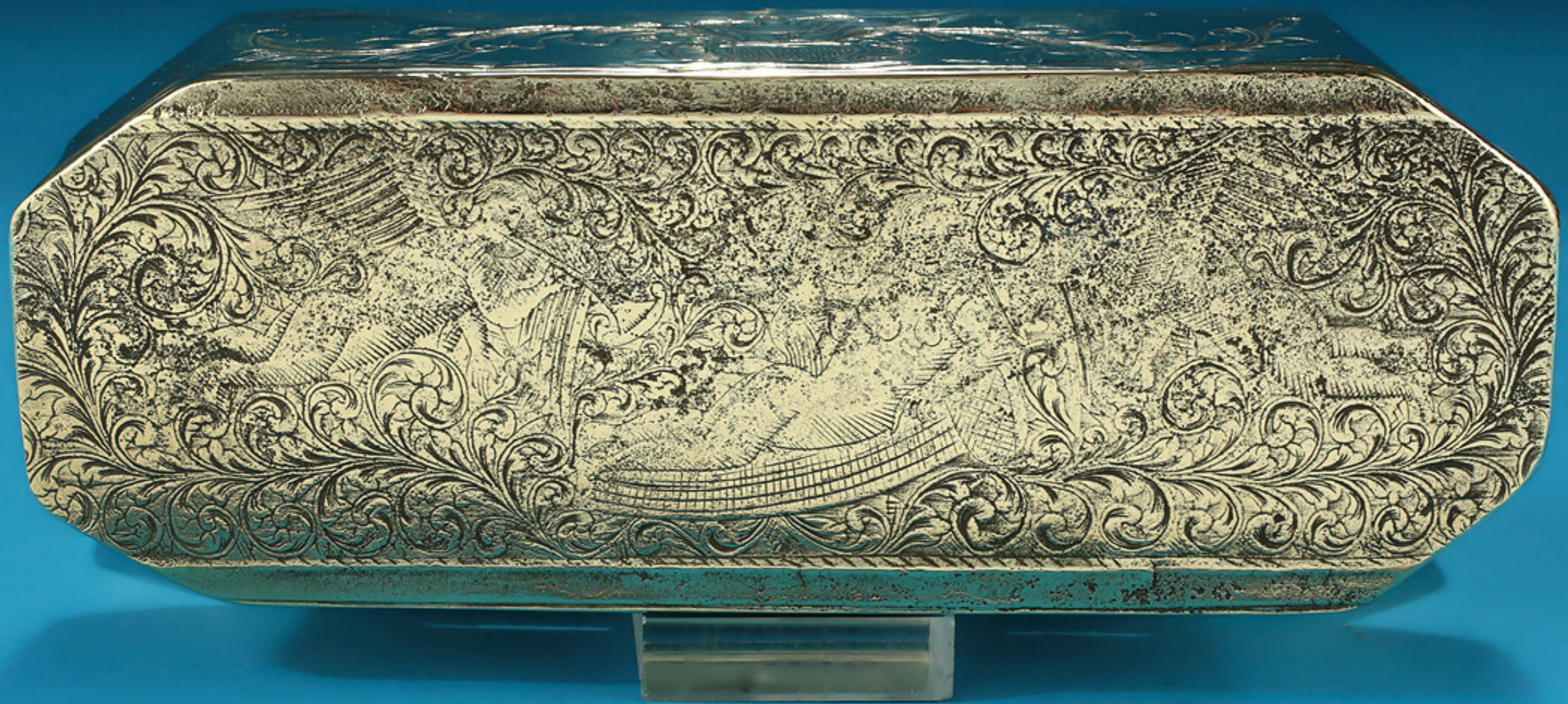
Dutch Pierced Brass Tobacco Box c. 1740 - 1770 (M. Ford Creech Antiques & Fine Arts)