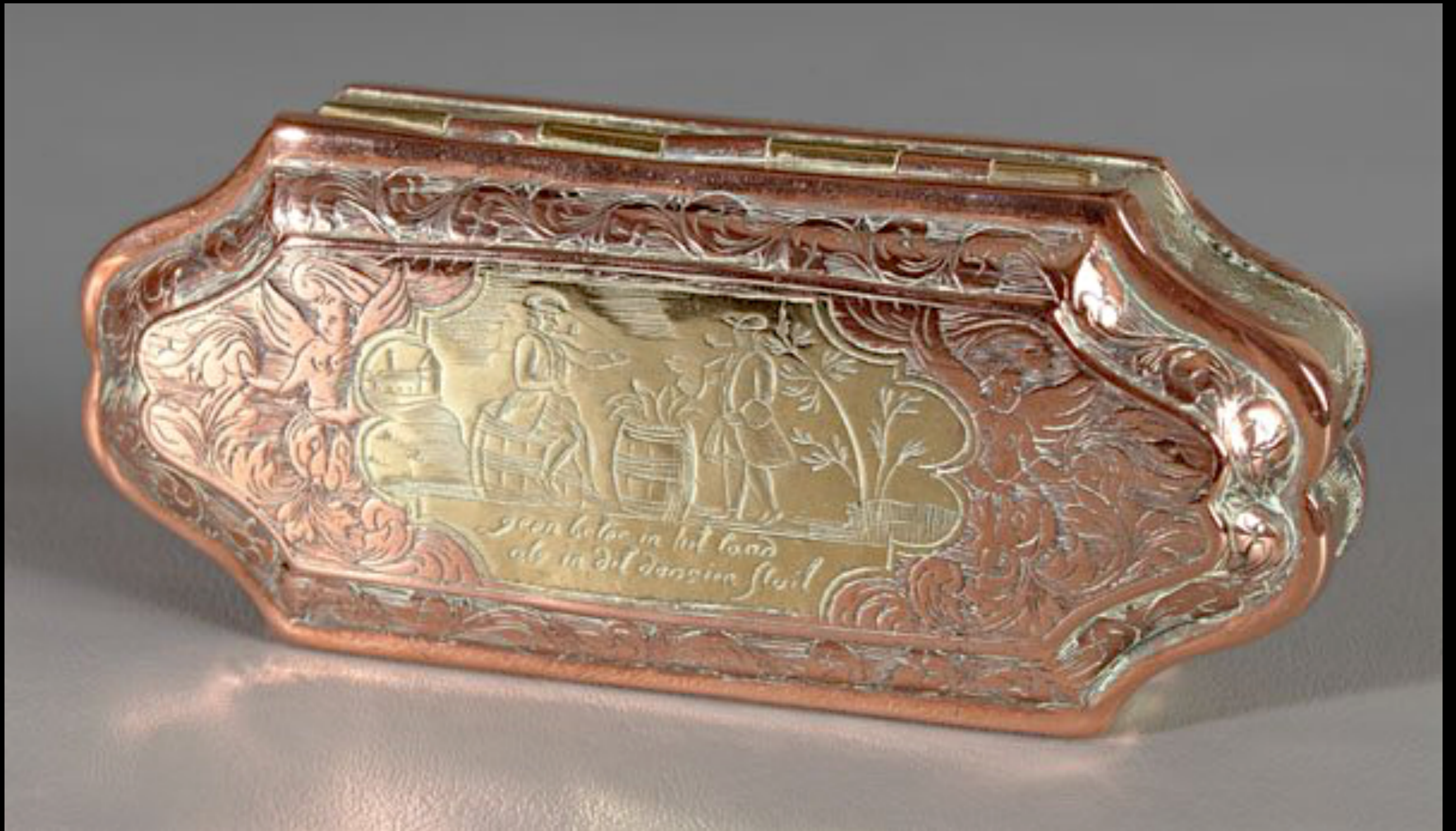
Dutch Brass and Copper Tobacco Box Mid-18th Century