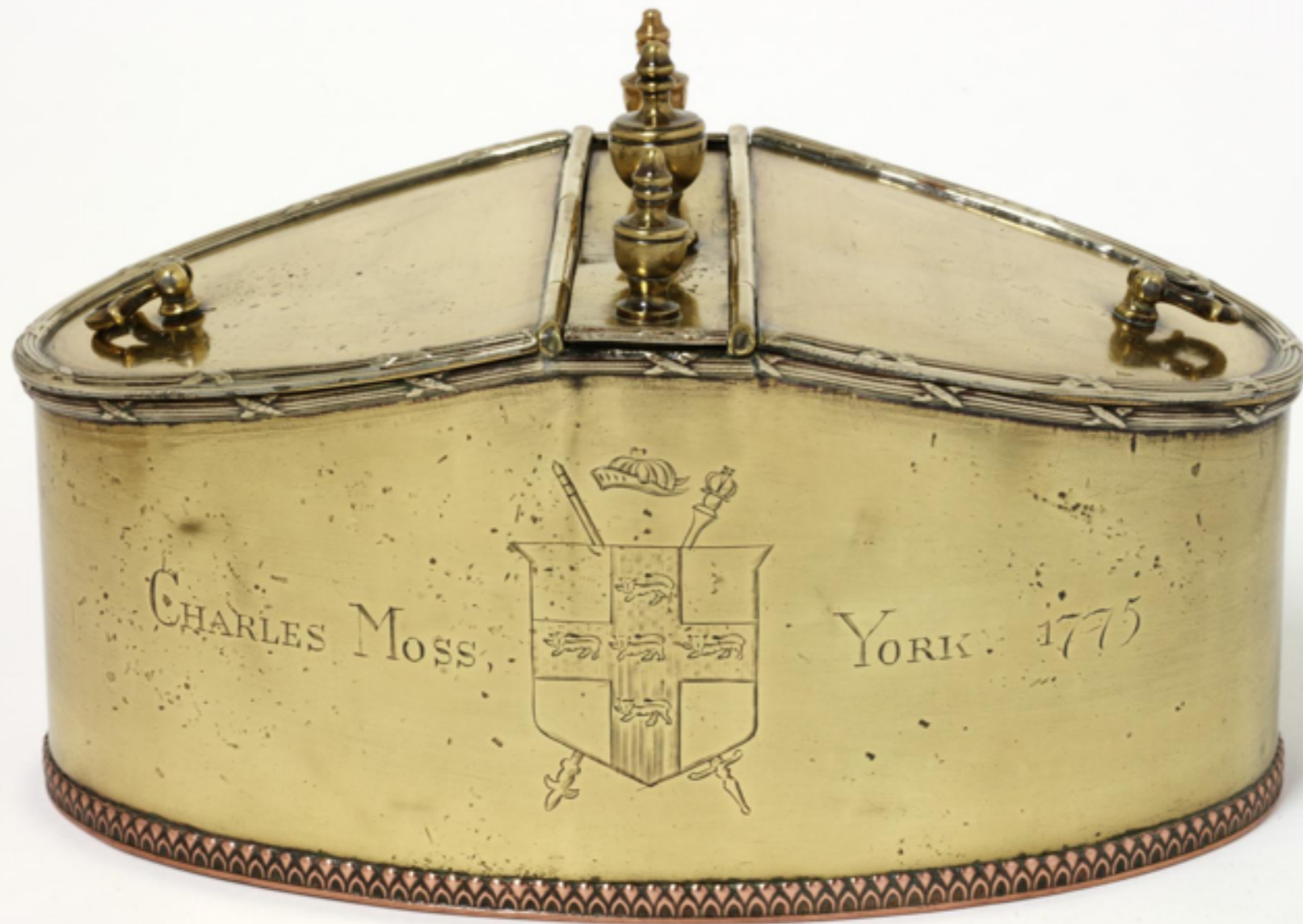
English Brass & Copper Tobacco Box c. 1775 (Victoria & Albert)