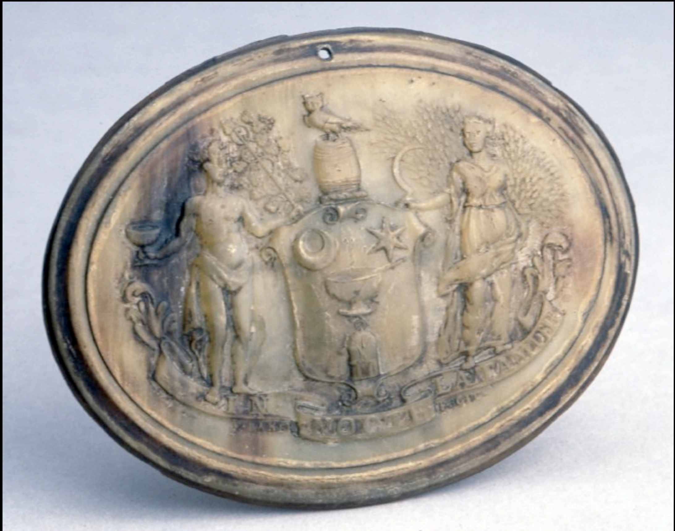
English Pressed Horn Tobacco / Snuff Box Lid Bearing the Arms of a Convivial Club & Bacchus (with Punchbowl) and Ceres Mid 18th Century (The British Museum)