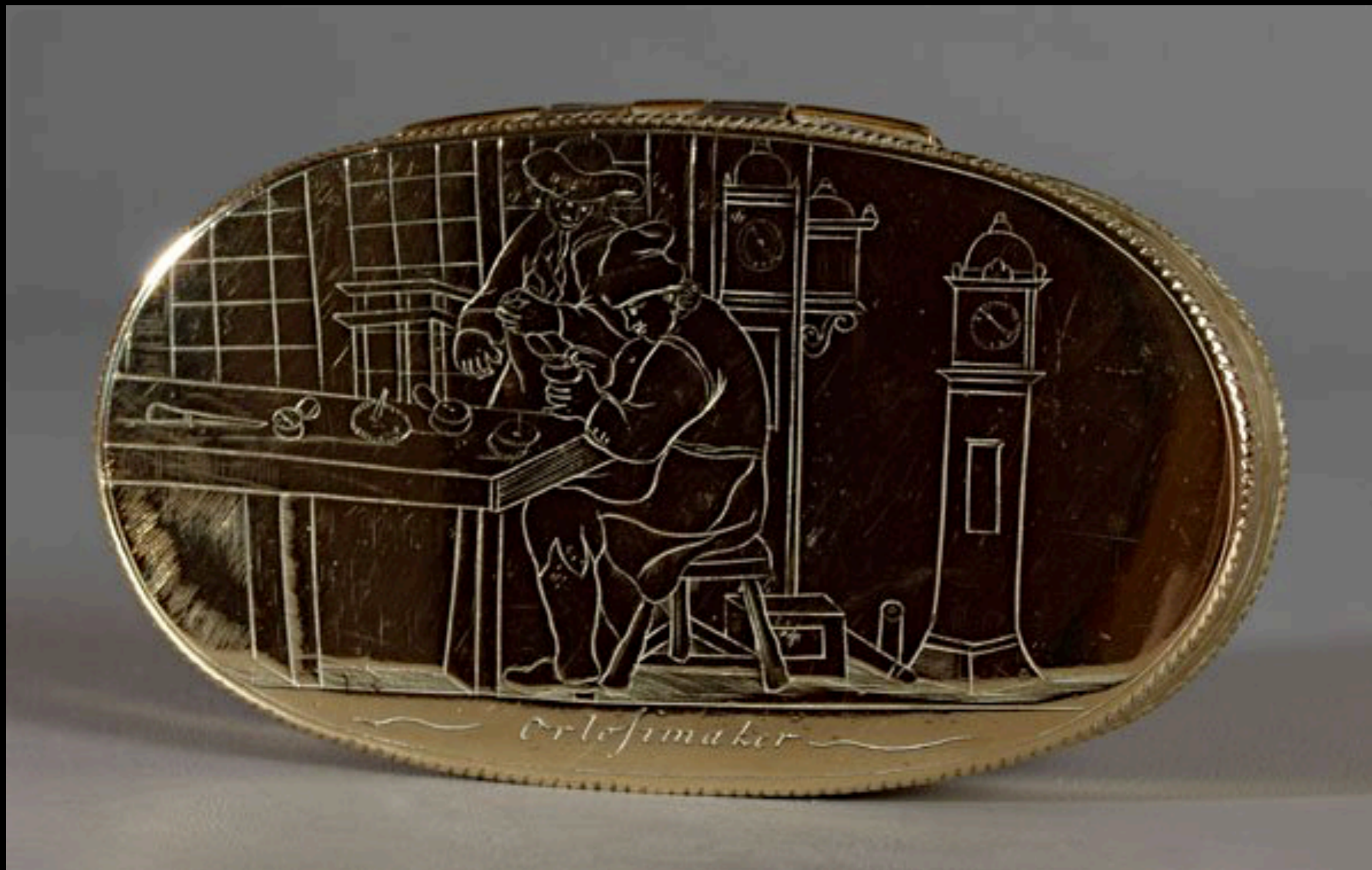
Dutch Brass Tobacco Box Depicting a Clock Maker 18th Century