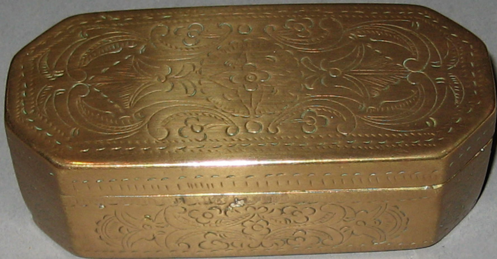
Dutch Brass Tobacco Box