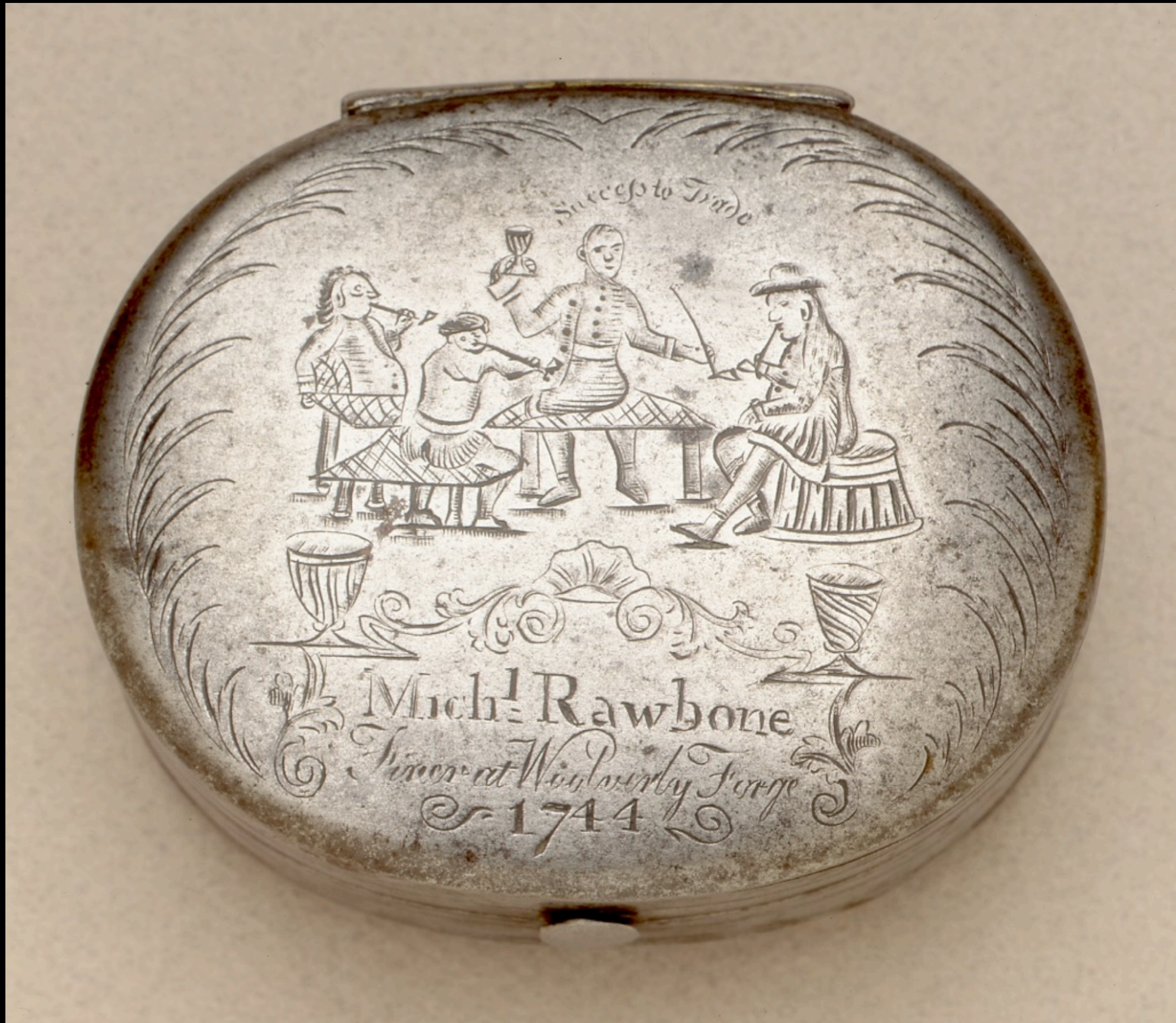
English Sheet Iron Tobacco Box