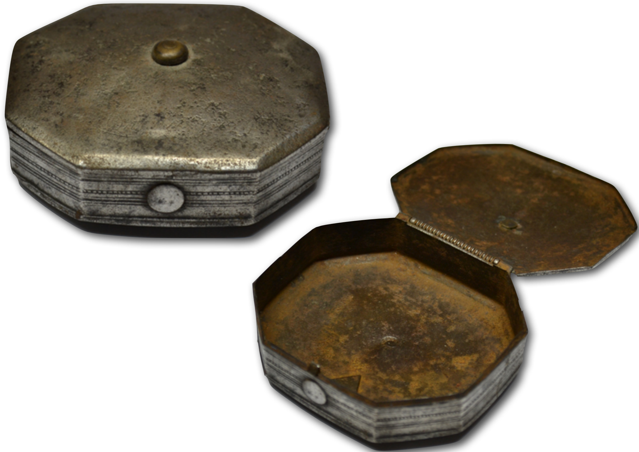
English Sheet Iron Tobacco Box Mid 18th - Early 19th Century (Private Collection)