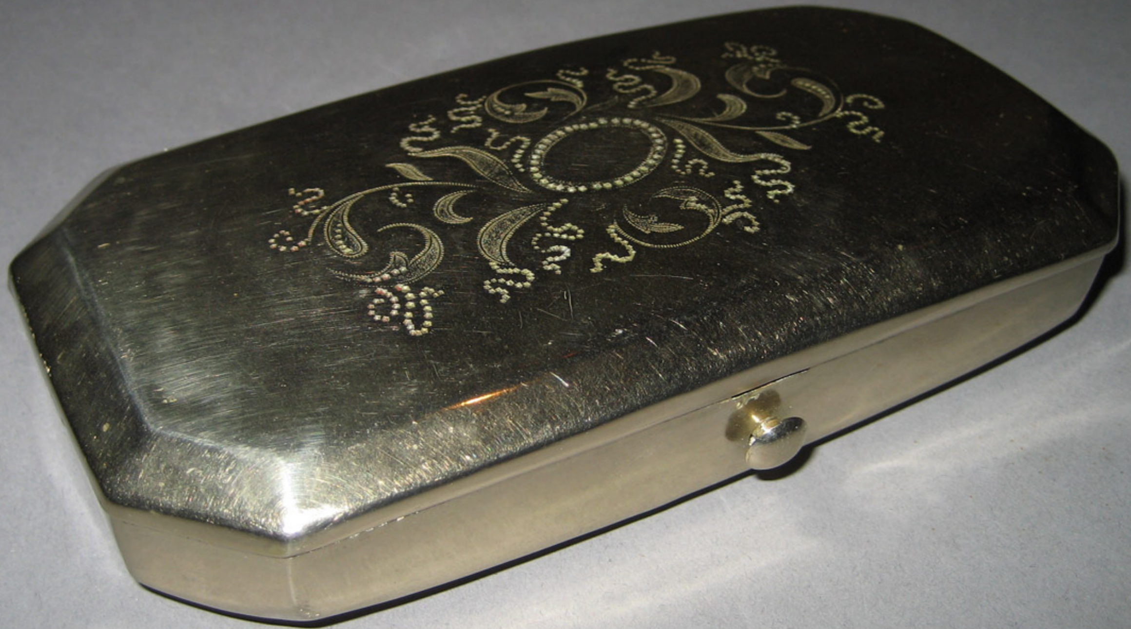
English or Dutch Brass Tobacco Box