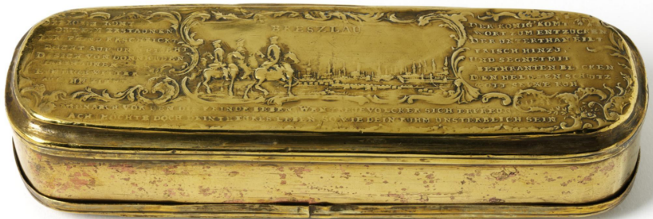
German Brass Tobacco Box