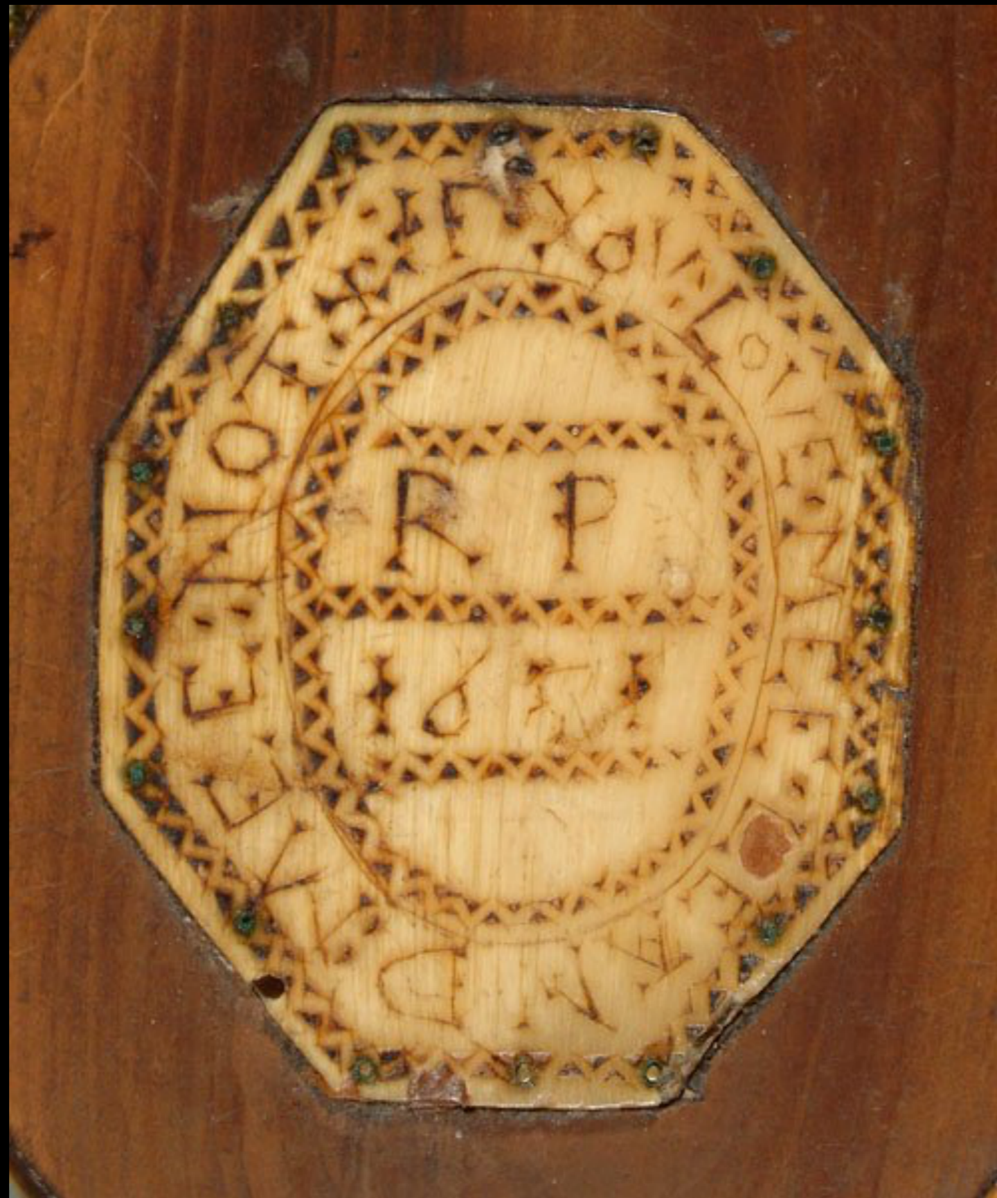
English Horn & Wood Tobacco Box "IF YOU LOVE MEE LEND MEE NOT / RP 1651" (Brunk Auctions)