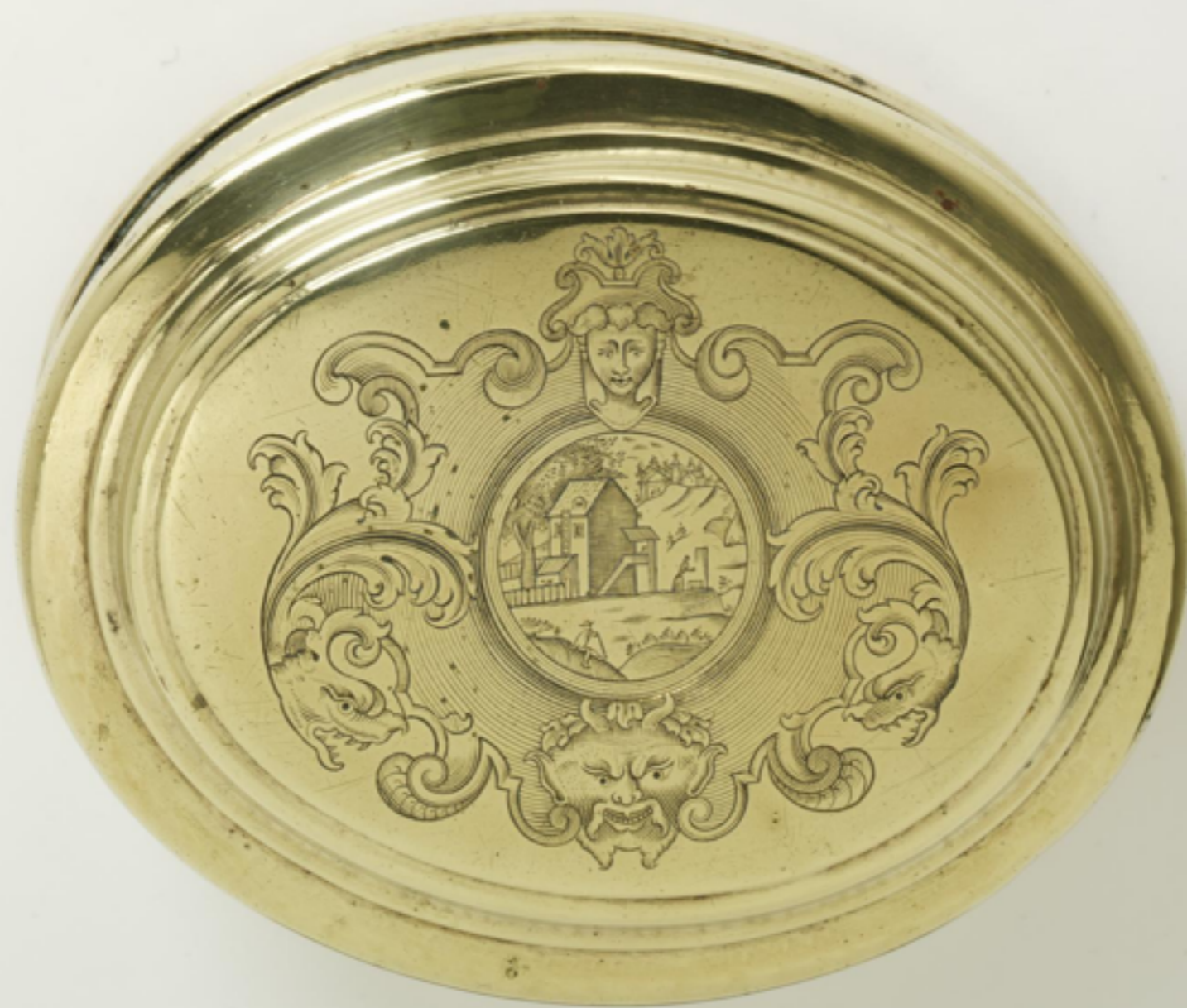
Dutch Brass Tobacco Box Early 18th Century (Victoria & Albert)