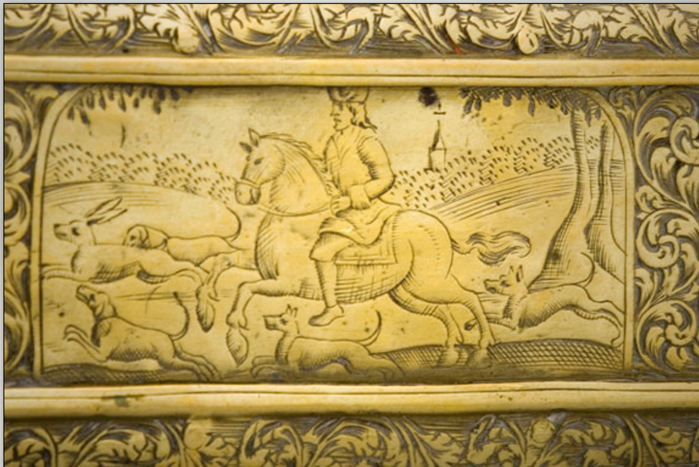
Dutch Brass and Copper Tobacco Box Mid-18th Century (Private Collection)