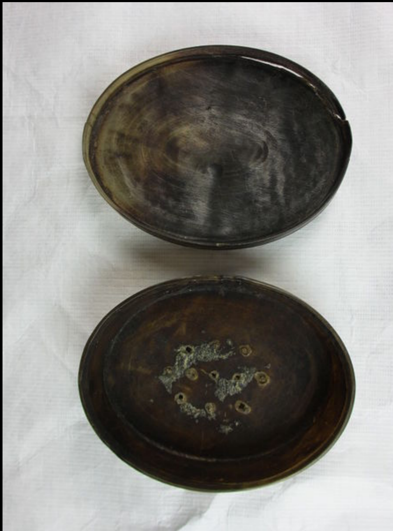
English Pressed Horn Tobacco Box Bearing the Coat of Arms of the Lumbar Troop - Hogarth