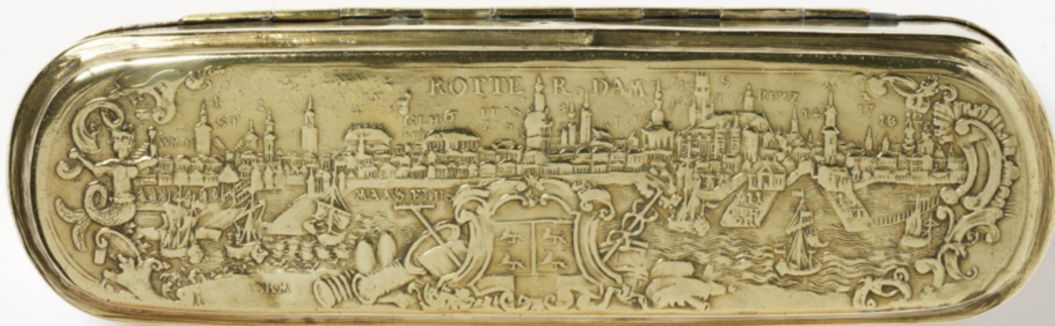
English or Dutch Brass Tobacco Box Mid 18th Century (Victoria & Albert)