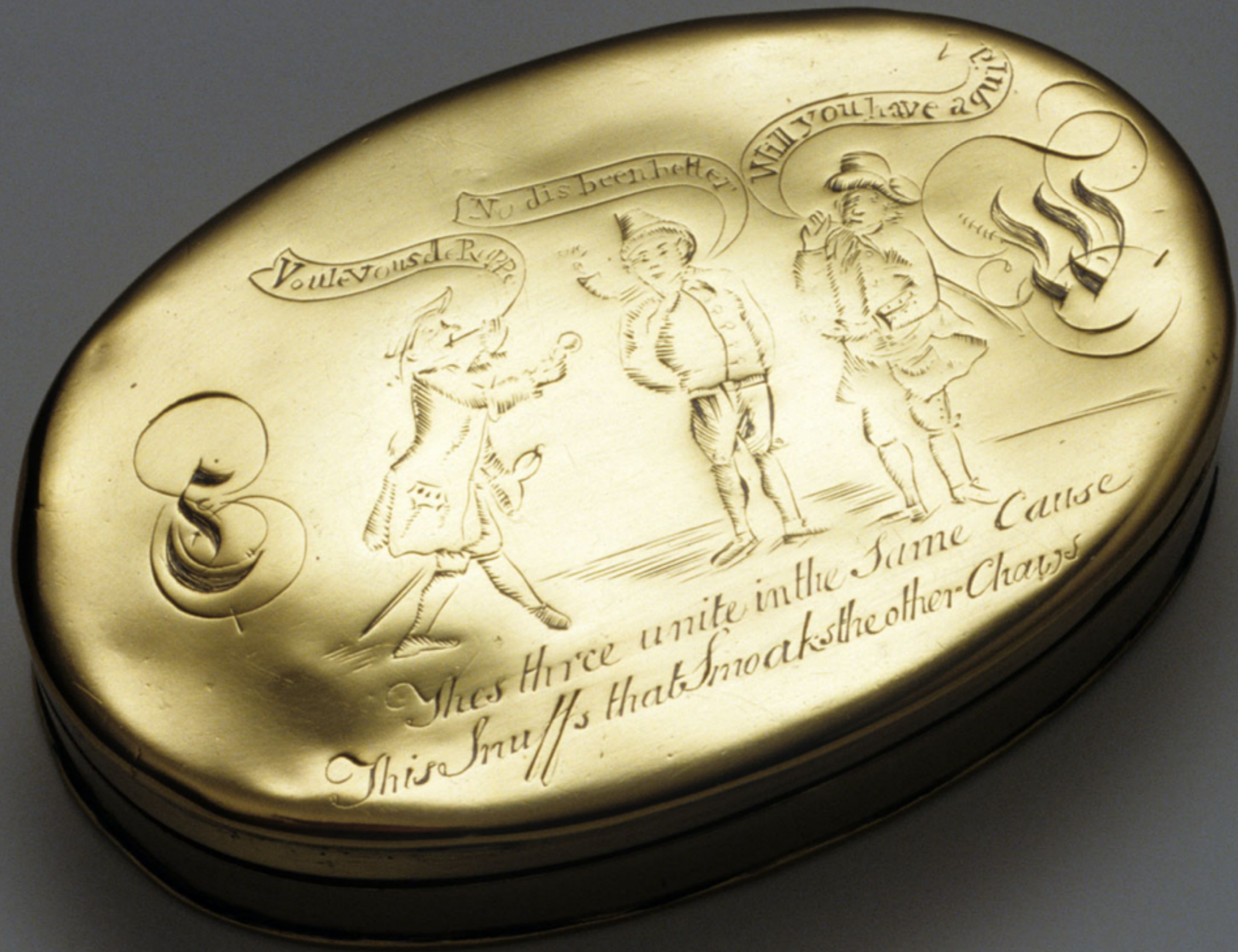
English Brass Tobacco Box