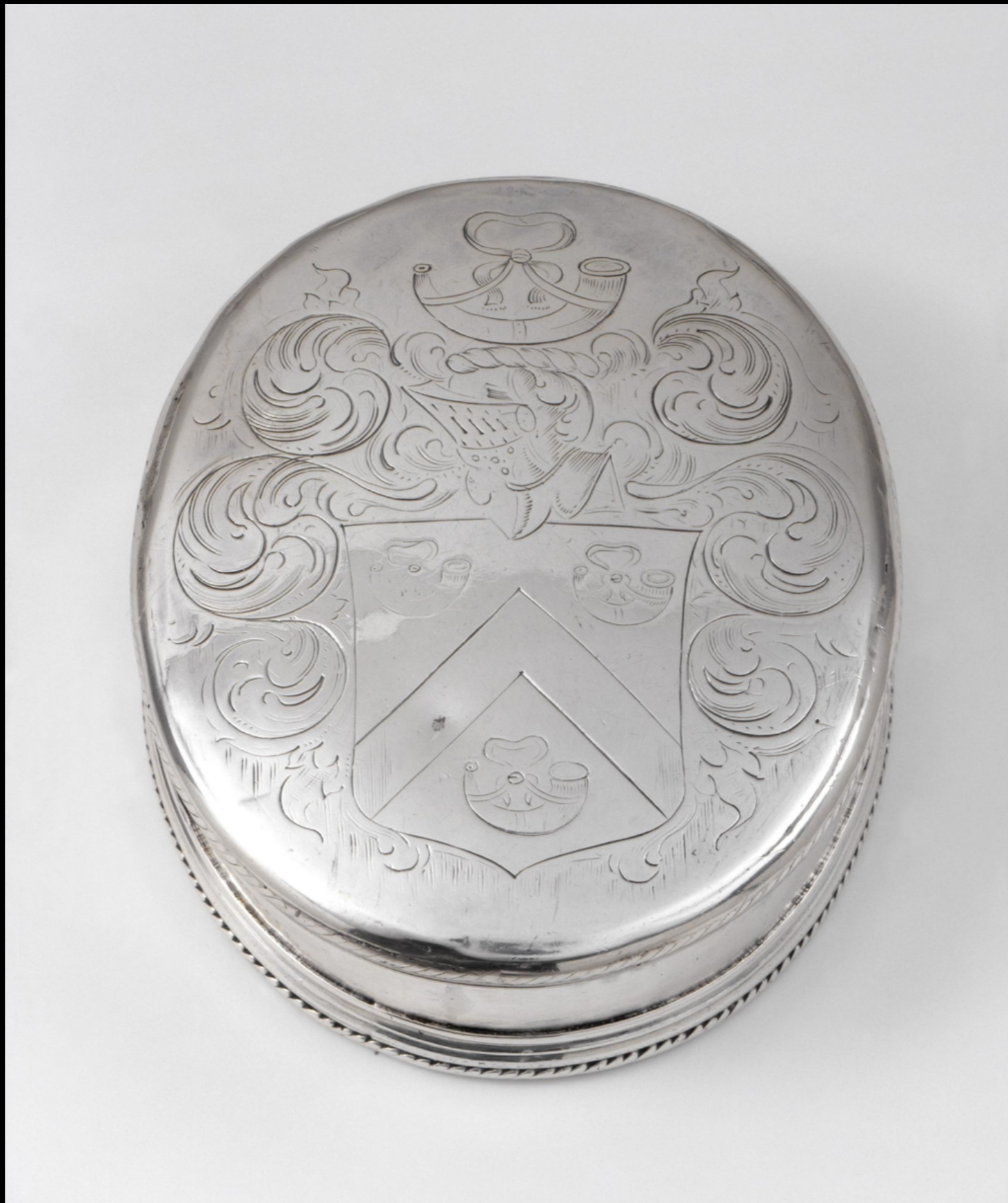
English Silver Tobacco Box from London c. 1655 - 1656 (Victoria & Albert)