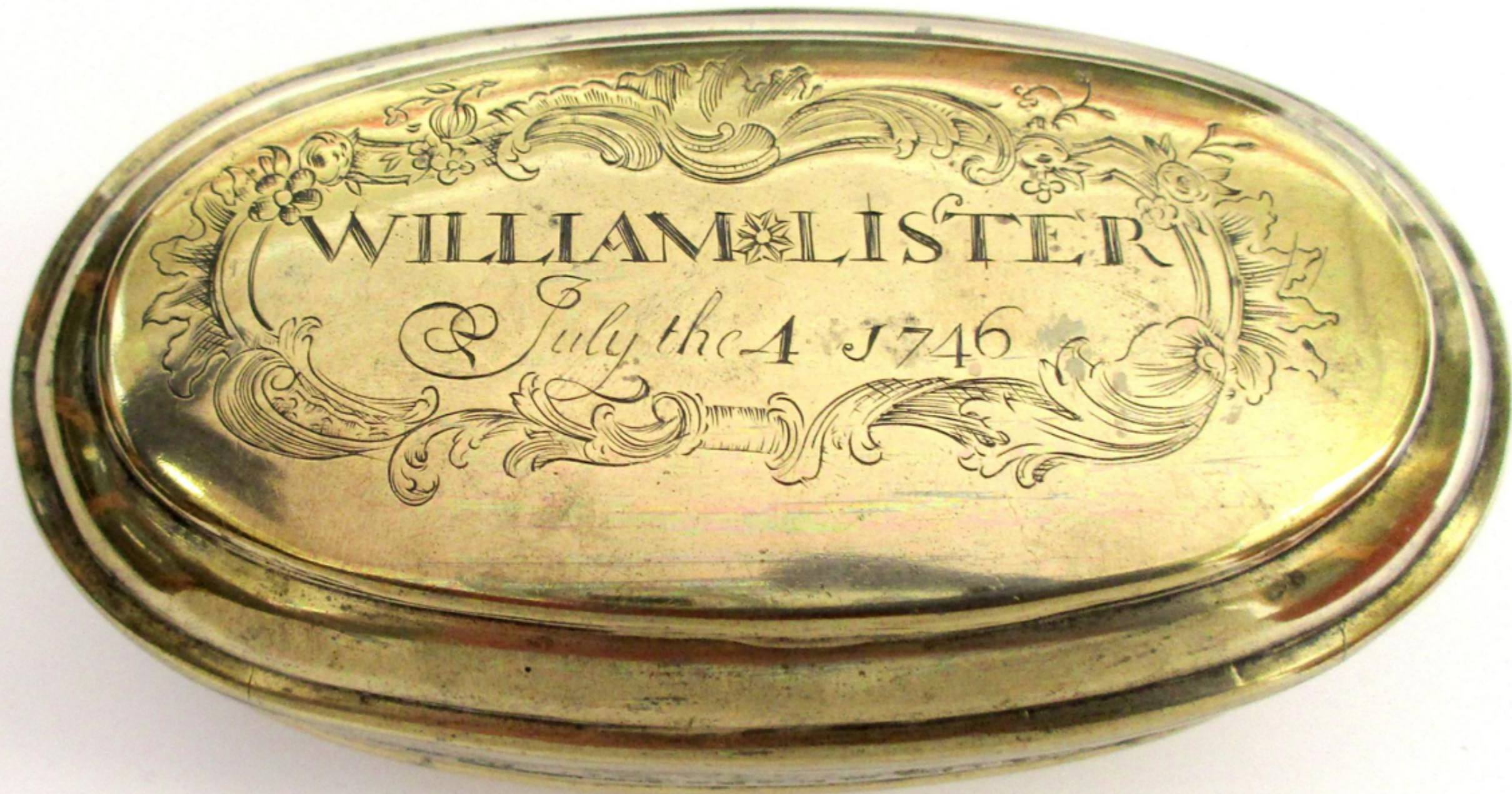
English Brass Tobacco Box 1746 (Victoria & Albert)