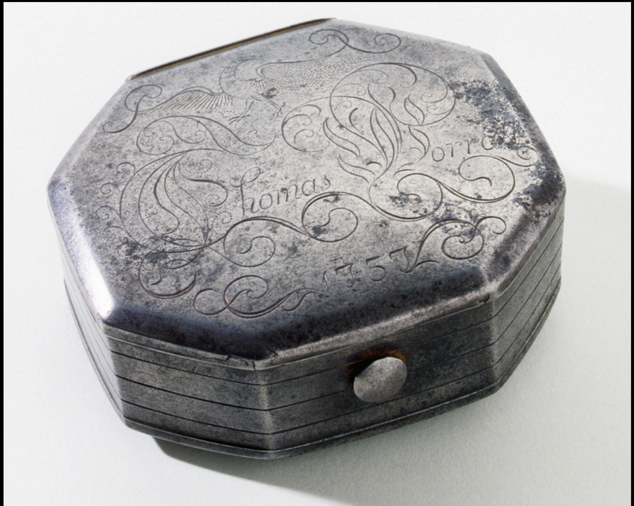
English Sheet Iron Tobacco Box from Birmingham or Warwick