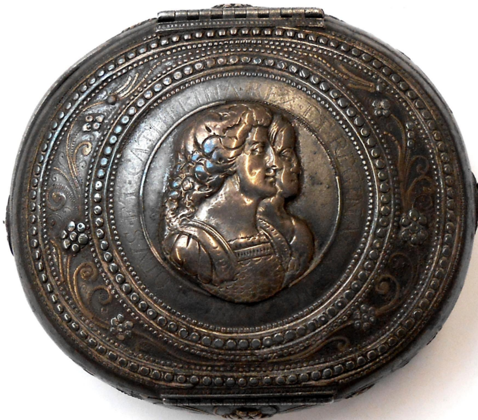
English Steel Tobacco Box Depicting King Charles II & Catherine of Braganza 1662 (Victoria & Albert)