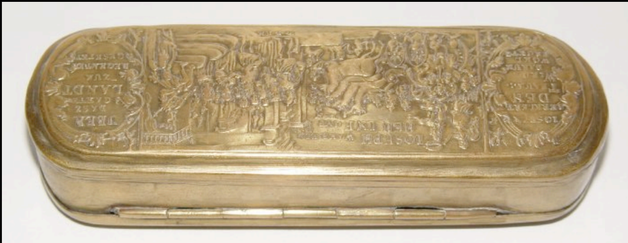
German Brass Tobacco Box Embossed with the Battle of Greyburg “KEPPELMAN 1762” (The British Museum)