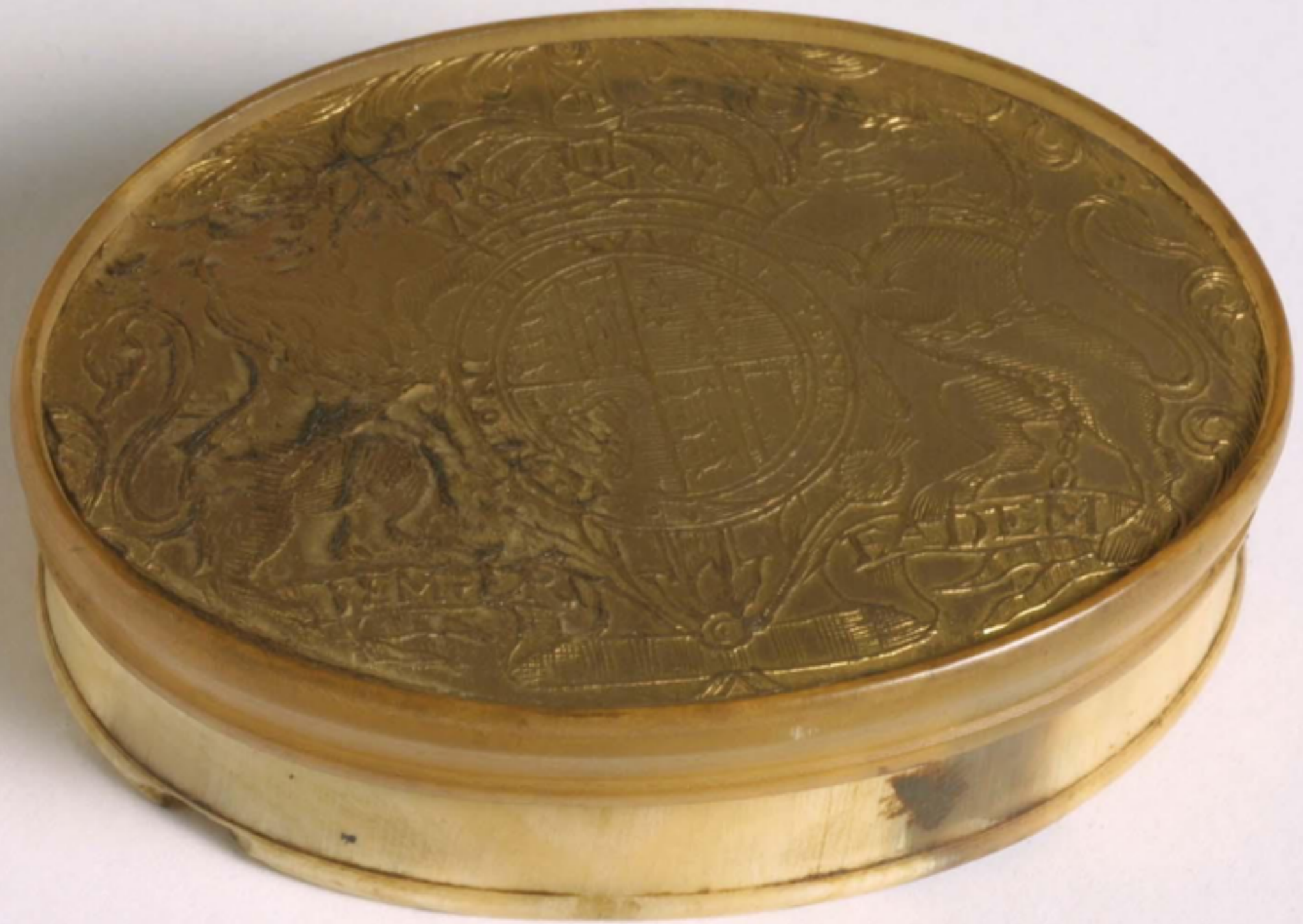
English Pressed Horn Tobacco or Snuff Box