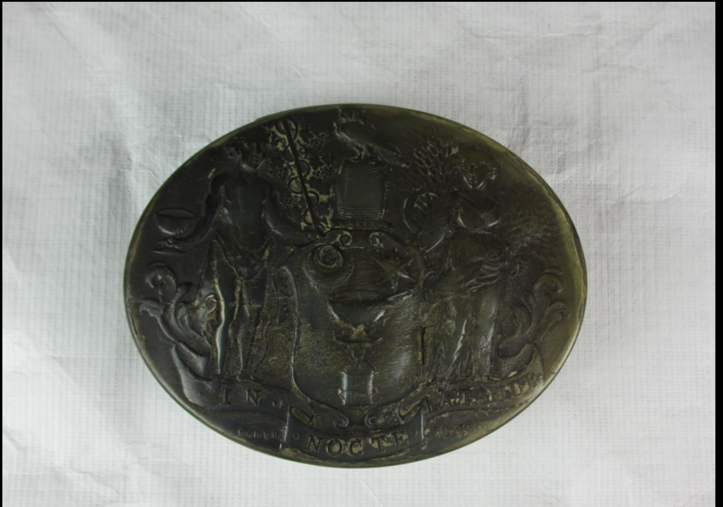
English Pressed Horn Tobacco Box Bearing the Coat of Arms of the Lumbar Troop - Hogarth