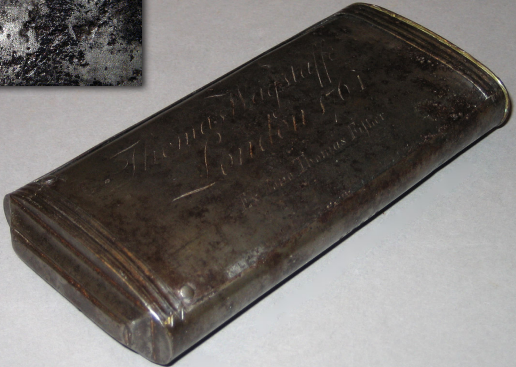
English Sheet Iron Tobacco Box from Birmingham or Warwick by Thomas Shaw 1764 (Private Collection)