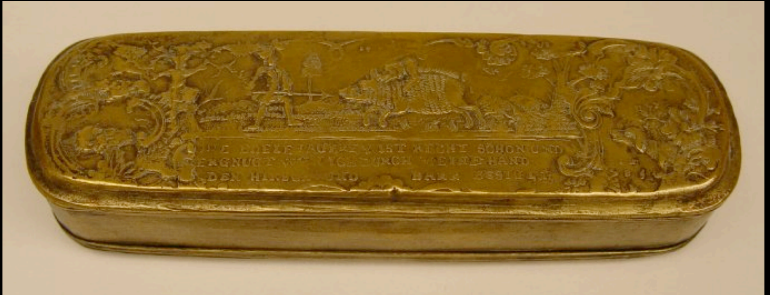
German Brass Hunting Scene Tobacco Box Dated 1777 (The British Museum)