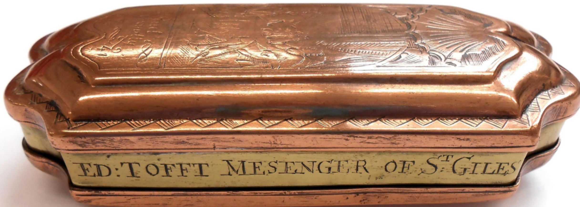
English Copper & Brass Tobacco Box