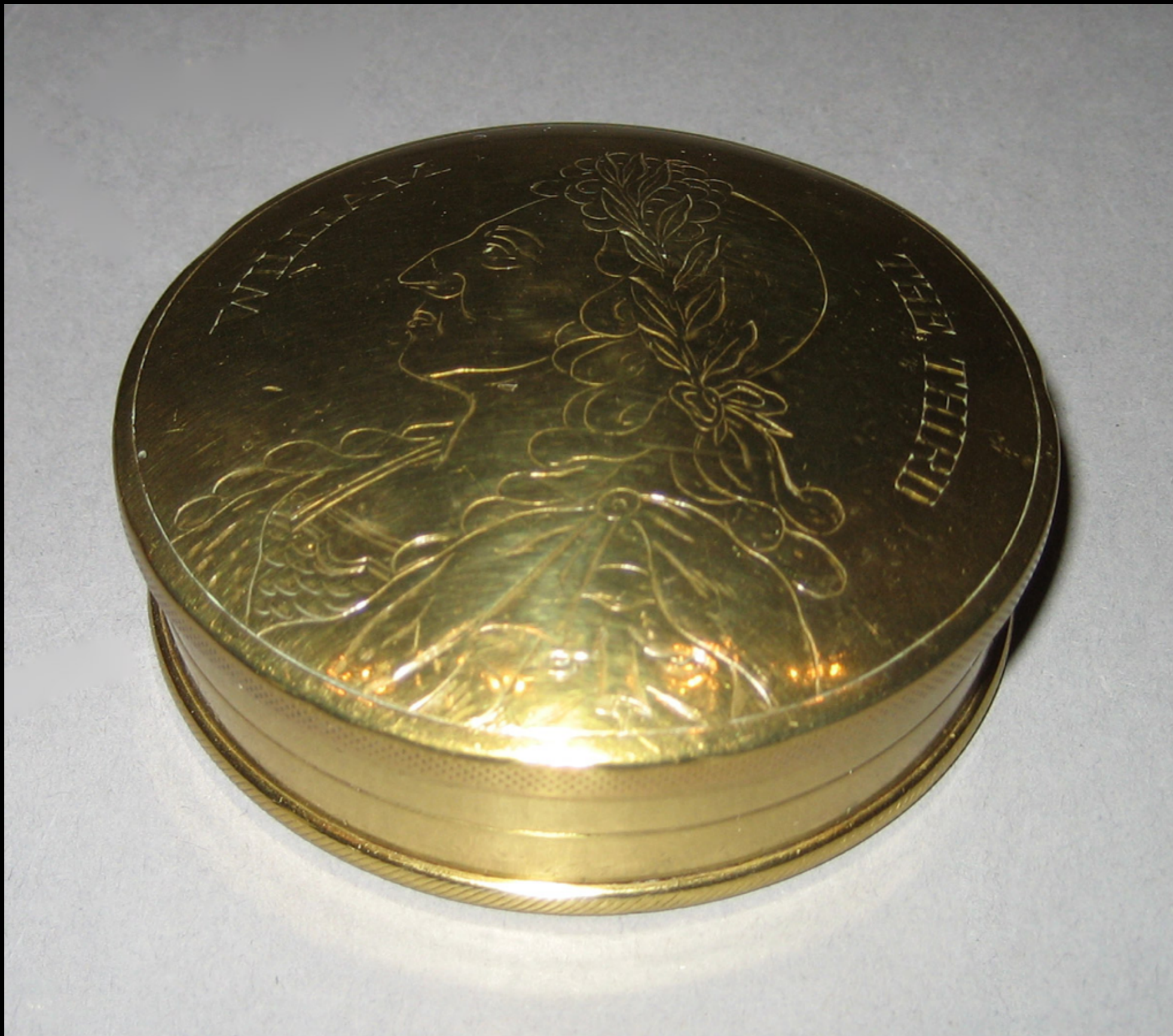
English Brass Tobacco Box