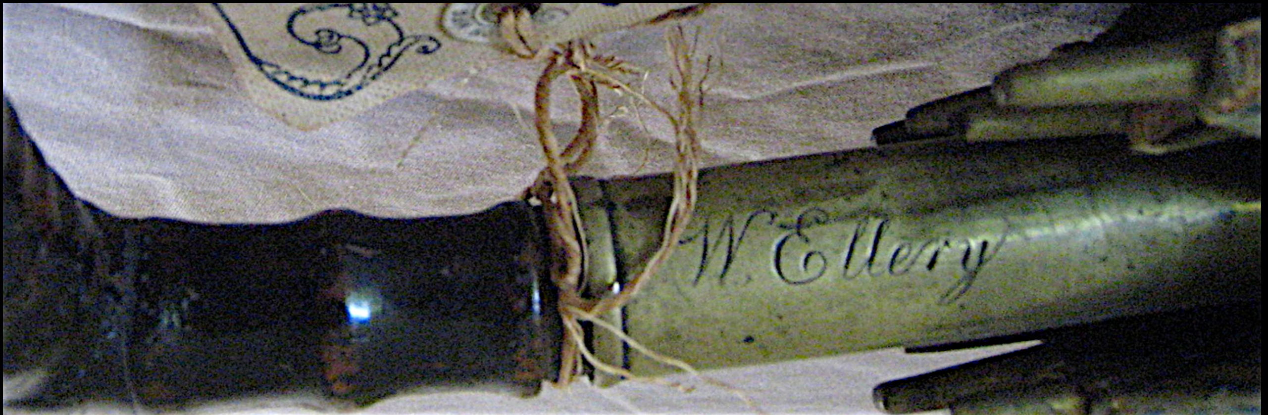
Umbrella of William Ellery, signer of the Declaration of Independence from Rhode Island. Late 18th Century (Private Collection)