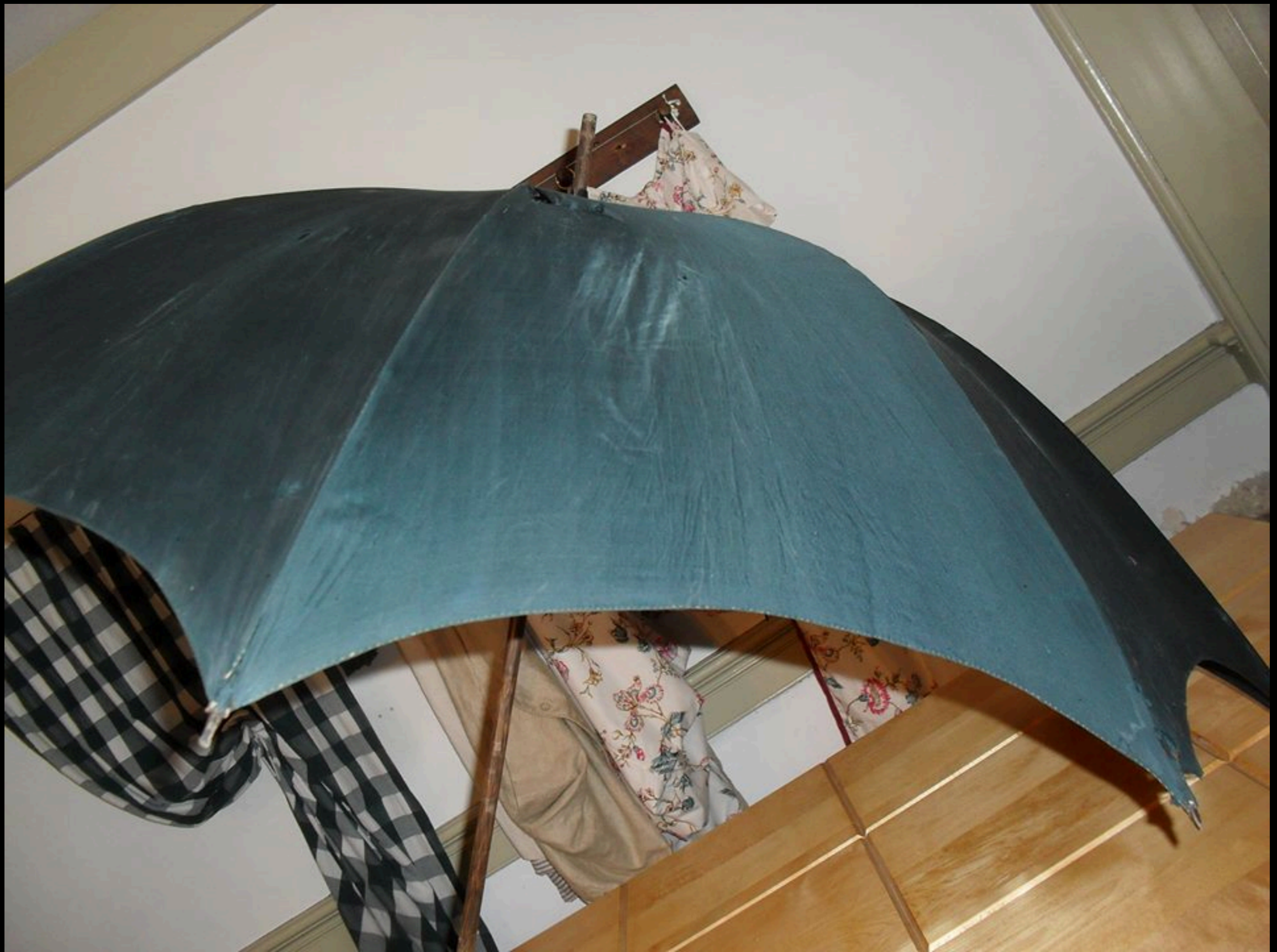
Dutch Green Silk Umbrella Late 18th Century (Betsy Ross House)