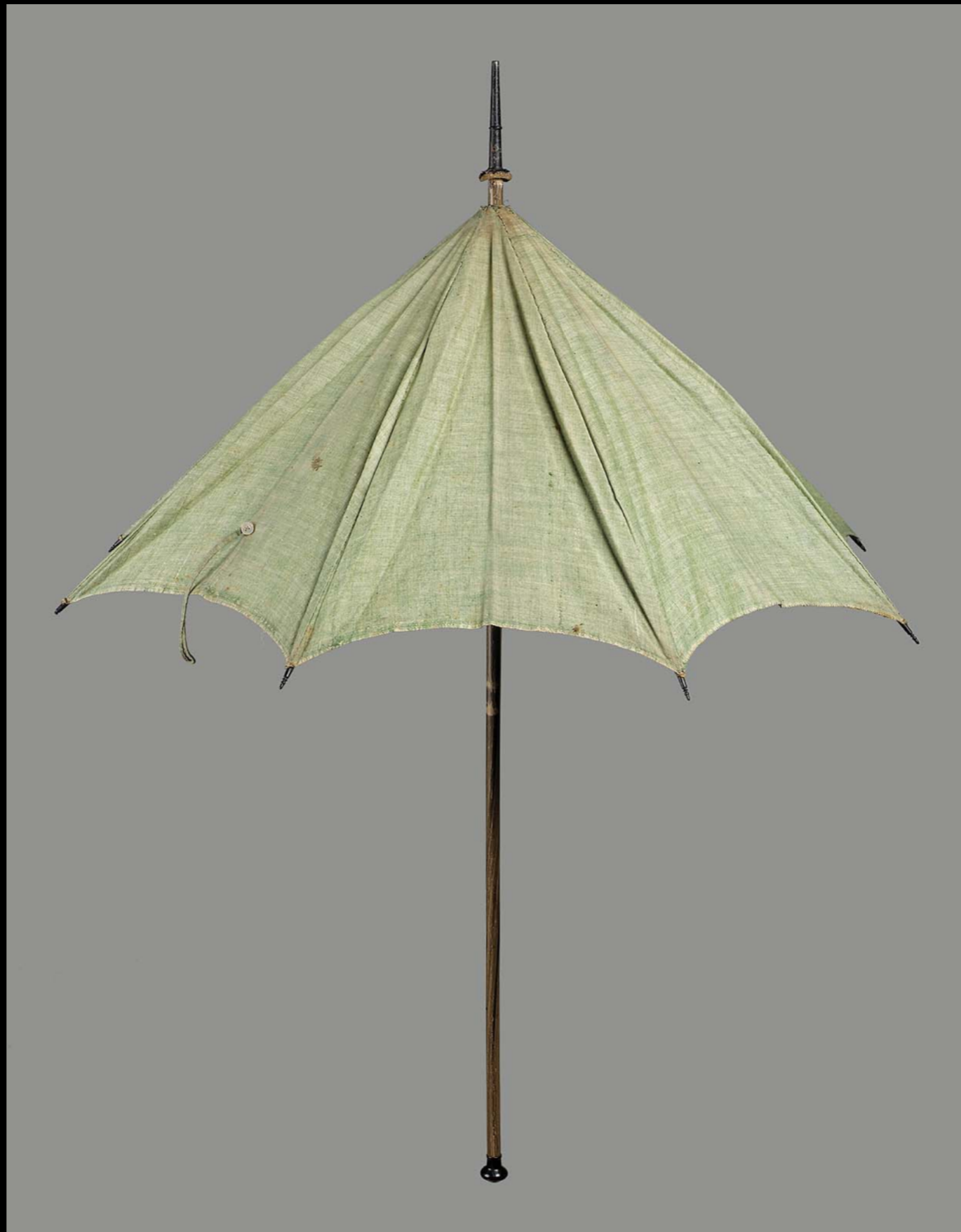
Green Cotton Parasol Late 18th Century (Museum of Fine Arts, Boston)