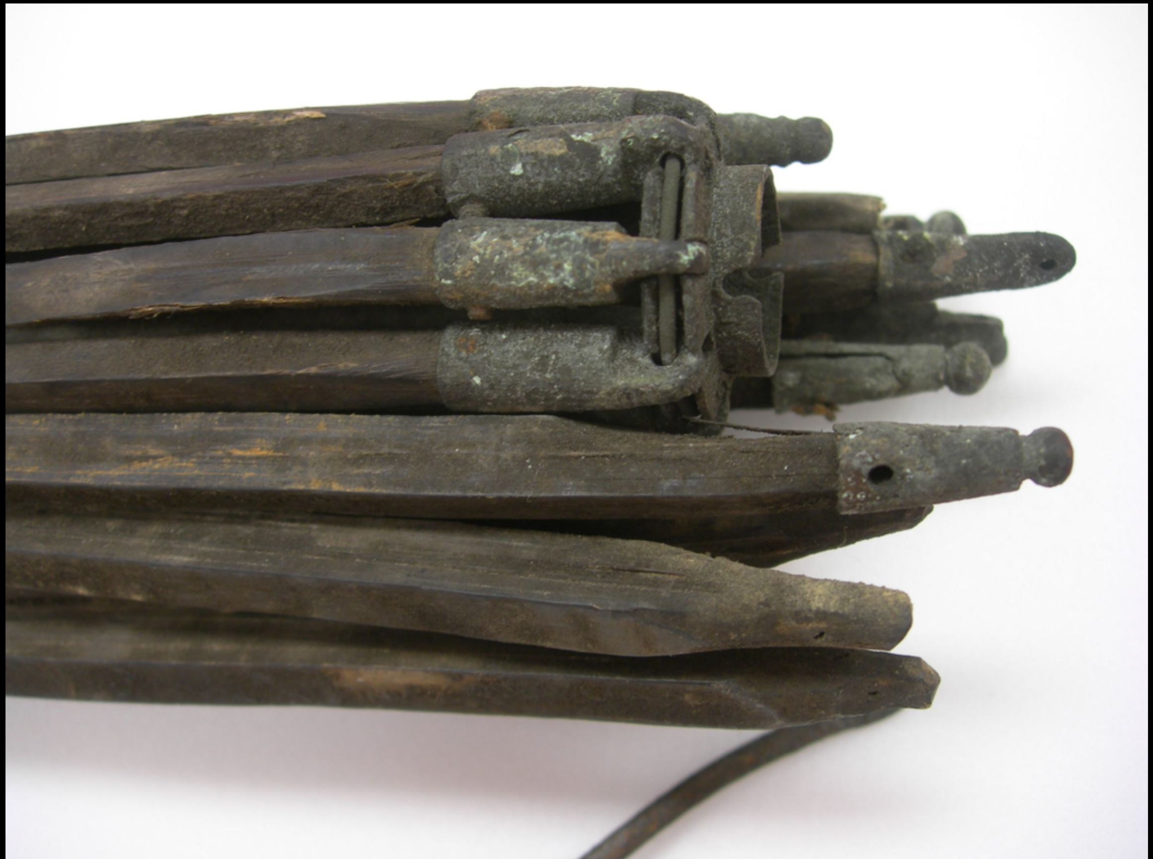
Umbrella Frame Late 18th Century (Colonial Williamsburg)