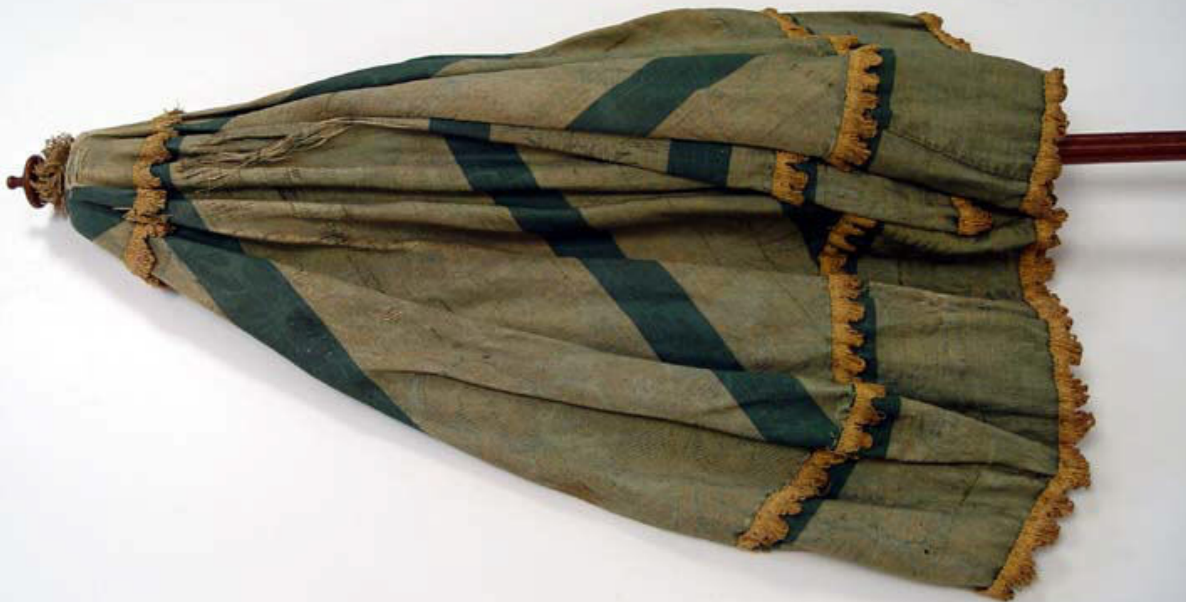
Italian Silk Parasol c. Early 18th Century (Metropolitan Museum of Art)