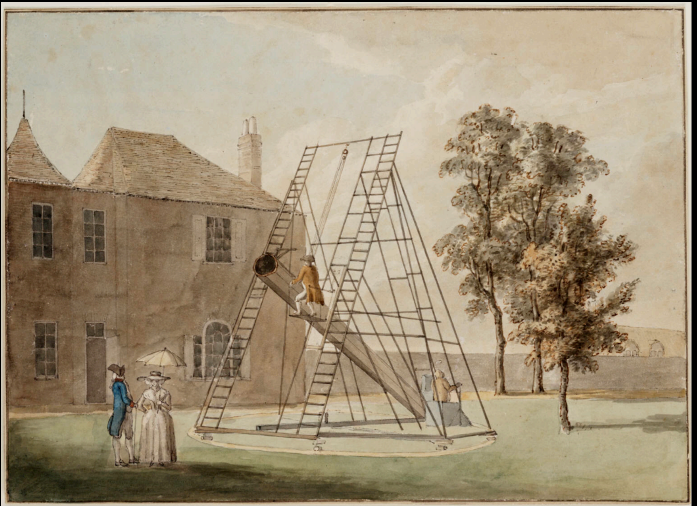
“Sir William Herschel exhibiting his great telescope to George III at Slough” by John Inigo Richards 1782