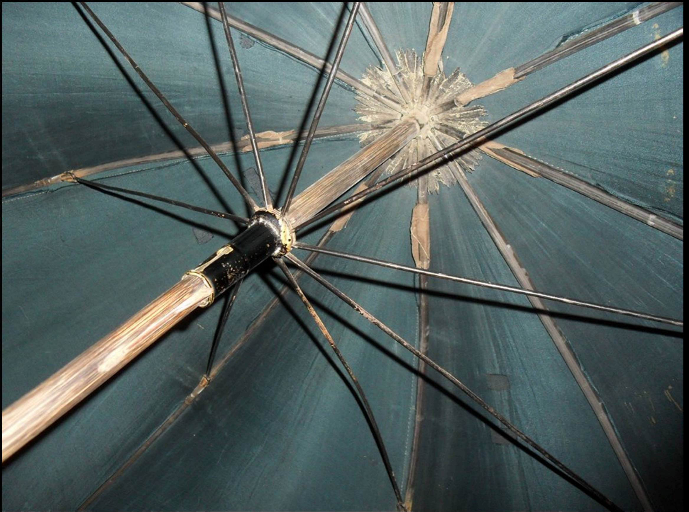
Dutch Green Silk Umbrella Late 18th Century (Betsy Ross House)