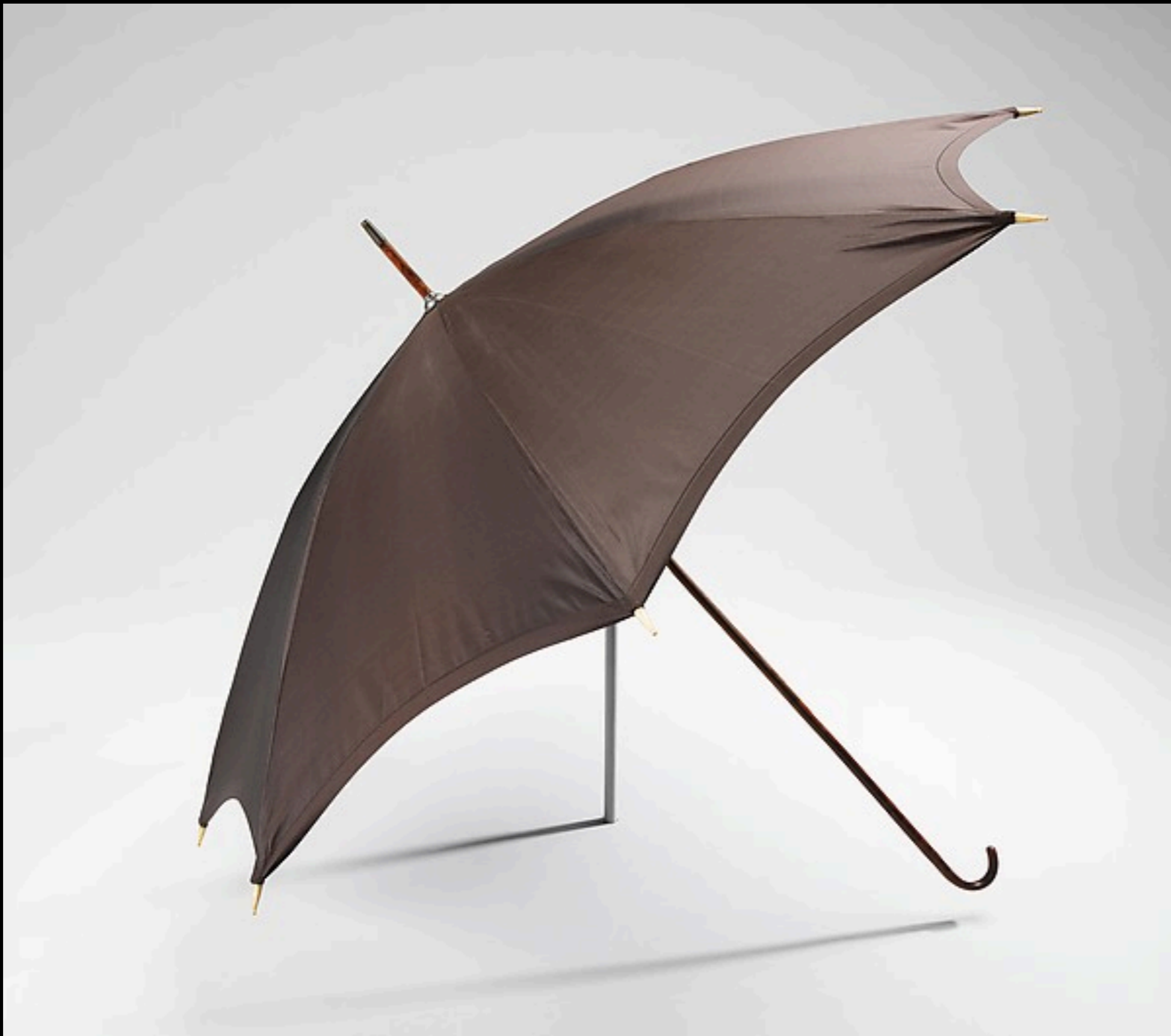
American Brown Silk Umbrella c. 1790 (Metropolitan Museum of Art)