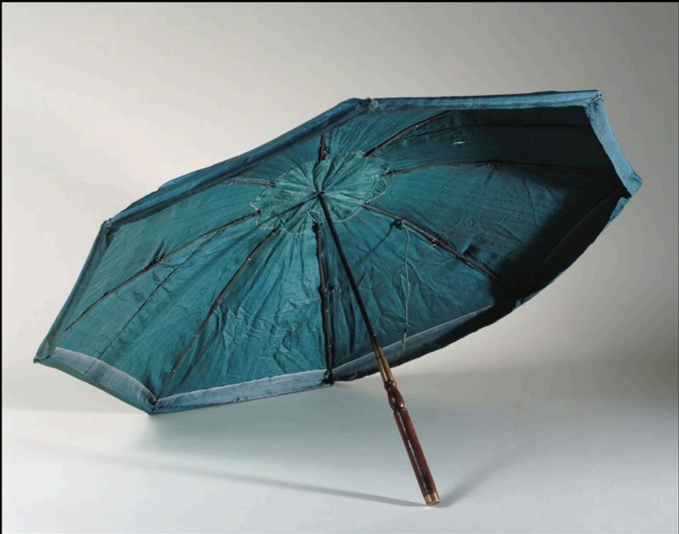
Green Silk with Hinged Metal Frame and Oak Handled "Marius - System" Umbrella Post 1715 (Palais Galliera, musée de la Mode de la Ville de Paris)