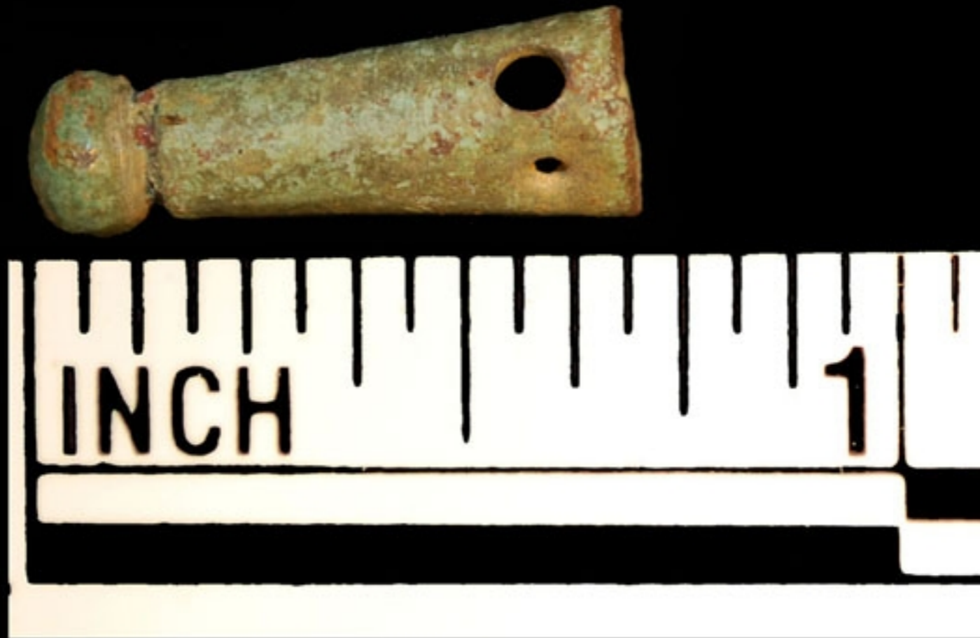
Parasol Tip found at Ferry Farm - The Boyhood Home of George Washington 18th Century (Ferry Farm)