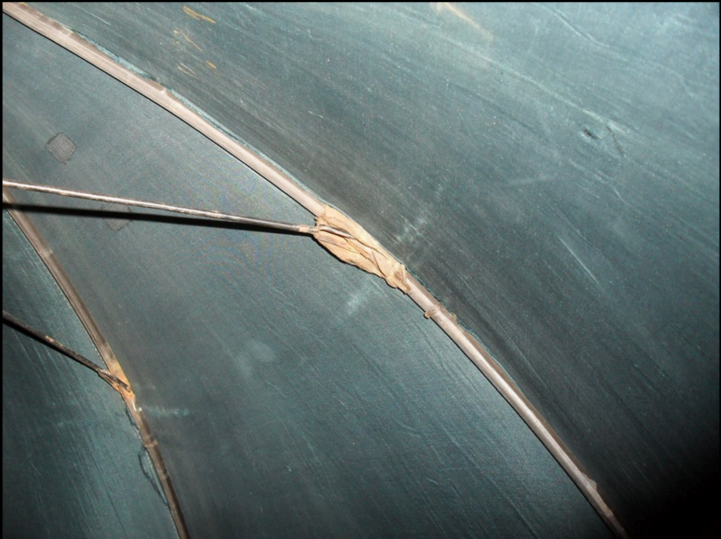
Dutch Green Silk Umbrella Late 18th Century (Betsy Ross House)