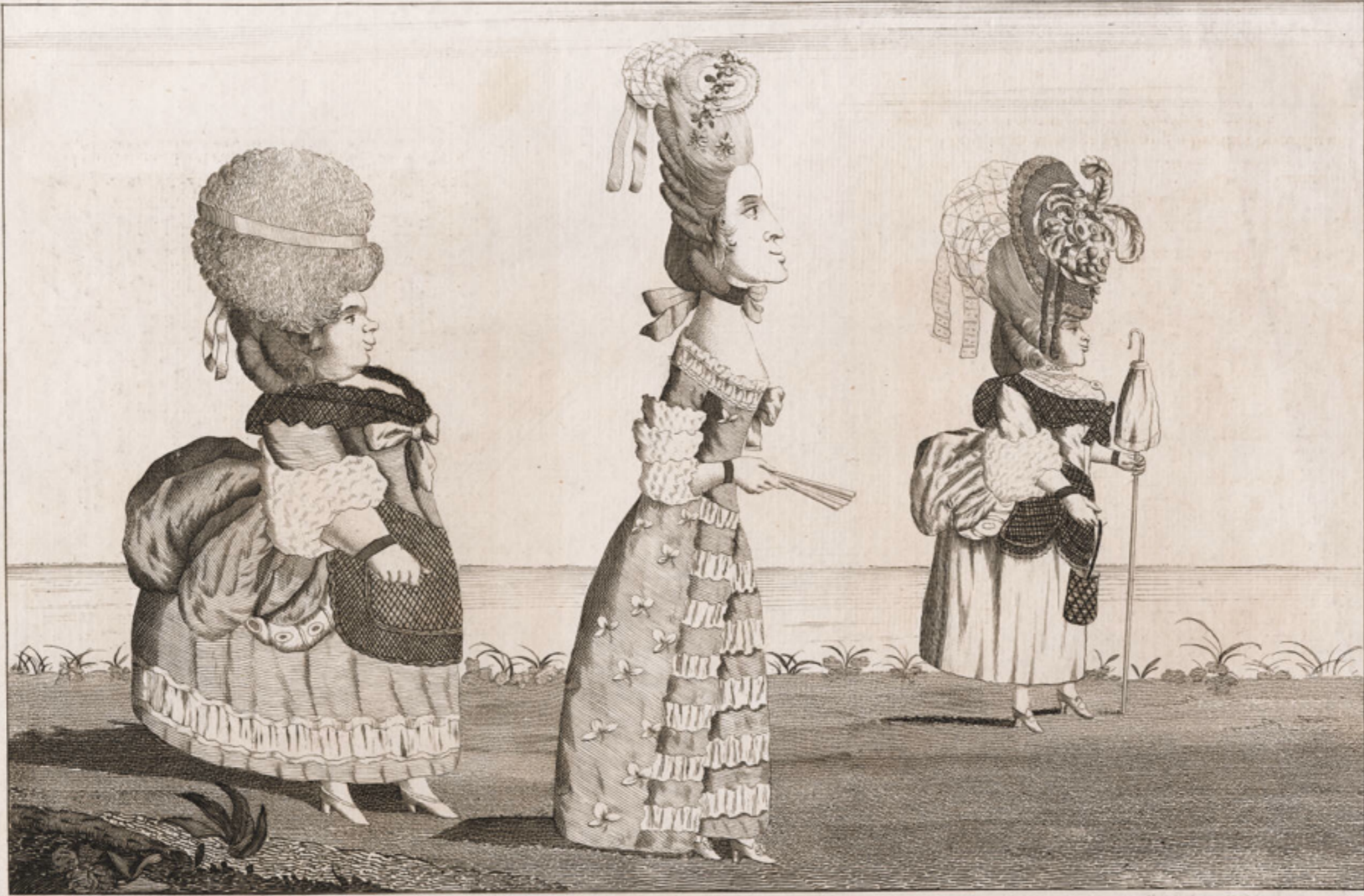
MISS S . DUMPLIN DUCKTAIL AND TITTUP. RETURN'D FROM WATERING