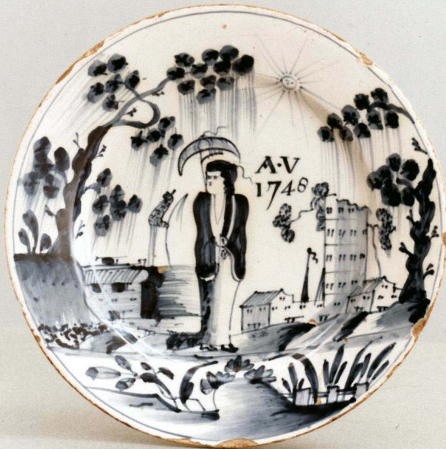
English Tin Glazed Plate from Liverpool 1748 (Colonial Williamsburg)