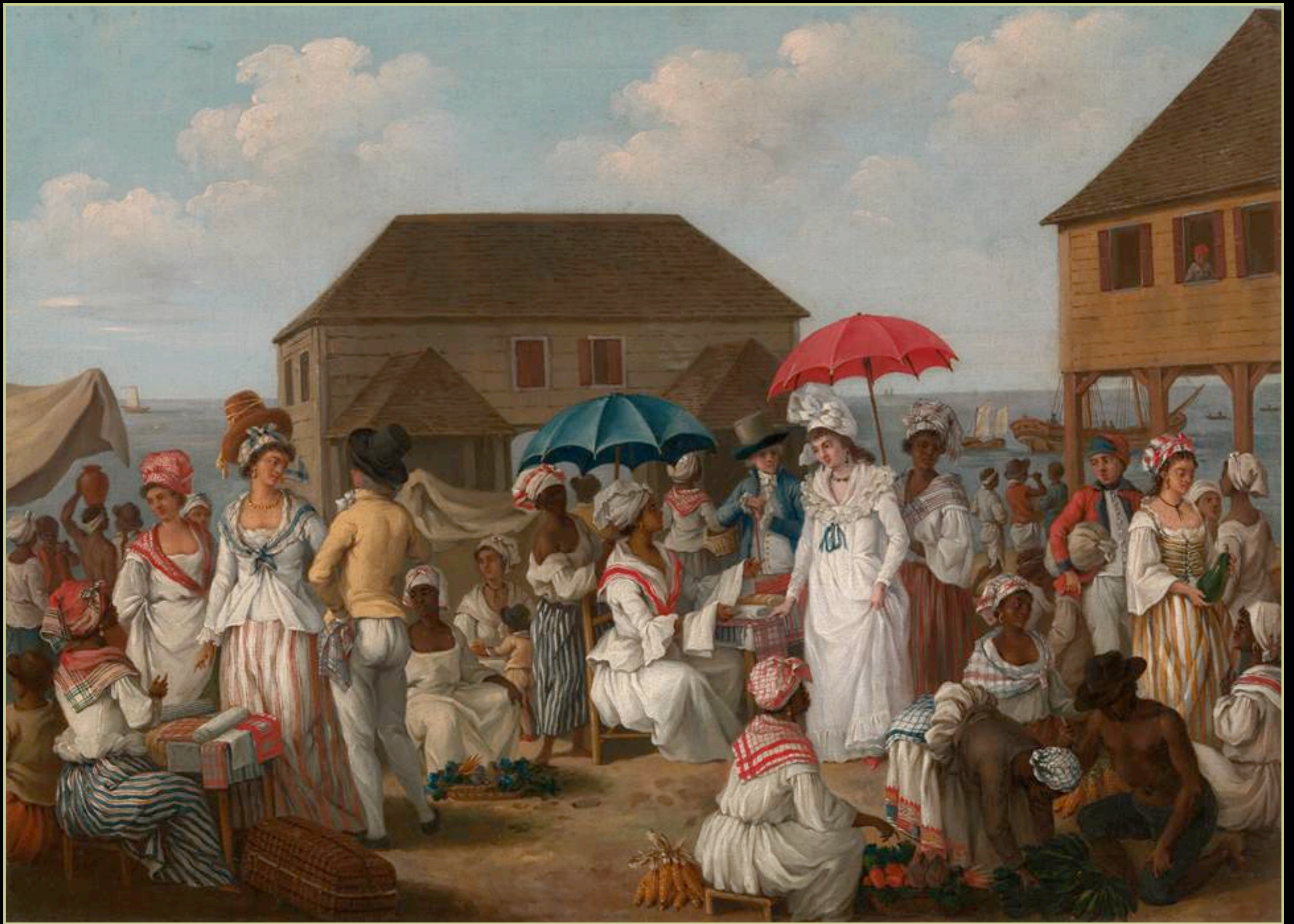
A Linen Market in the West Indies by Agostino Brunias, Italian. Active in Britain (1758-1770; 1777-1780s)