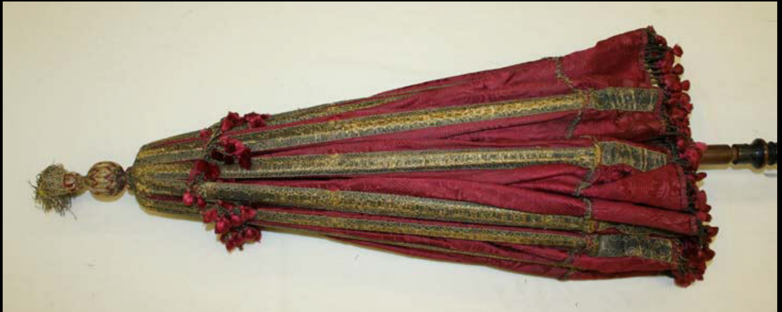
French Silk Parasol c. 1675 - 1725 (Metropolitan Museum of Art)