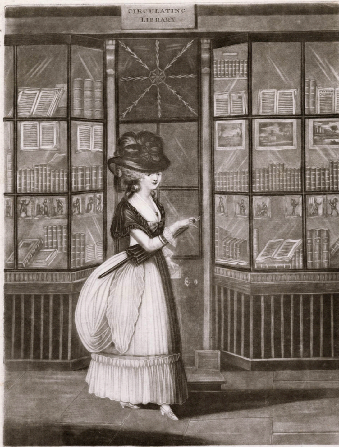
BEAUTY in SEARCH of KNOWLEDGE.