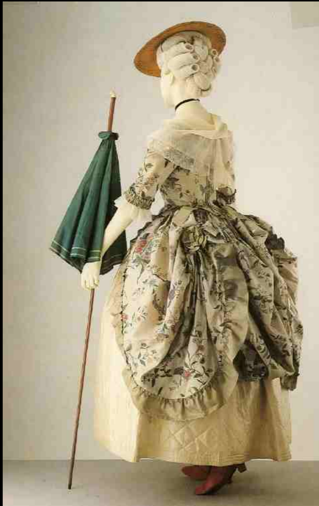
Parasol c. 1775 - 1785 (Victoria & Albert)