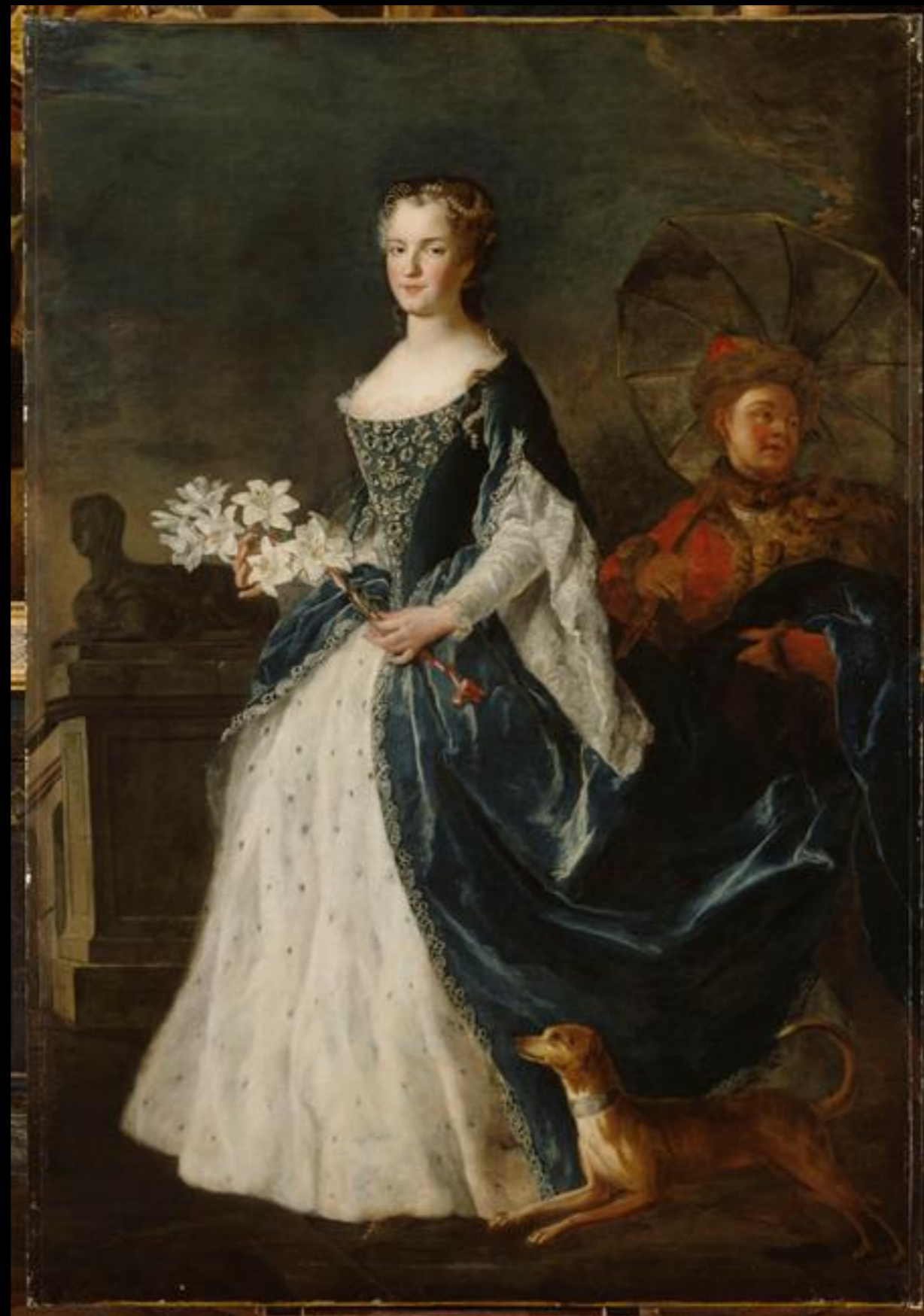
Marie Leszczyńska, the Polish Wife of King Louis XV, Queen of France by Alexis Simon Belle 1730