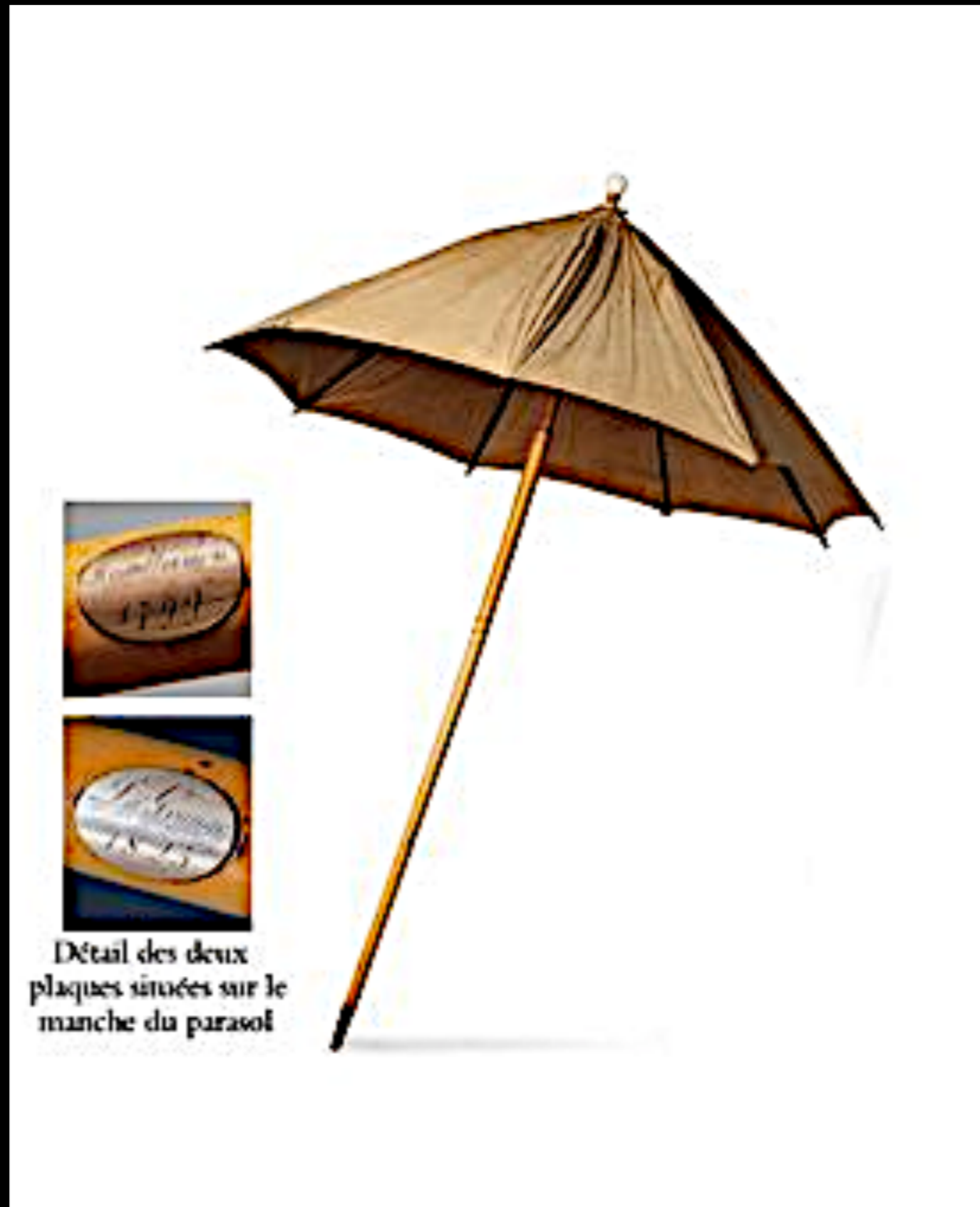
George Washington's Equestrian Sunshade - PARASOL ÉQUESTRE DE GEORGE WASHINGTON Given to Lafayette / "Mount Vernon 1799" (Christie's Auction House)