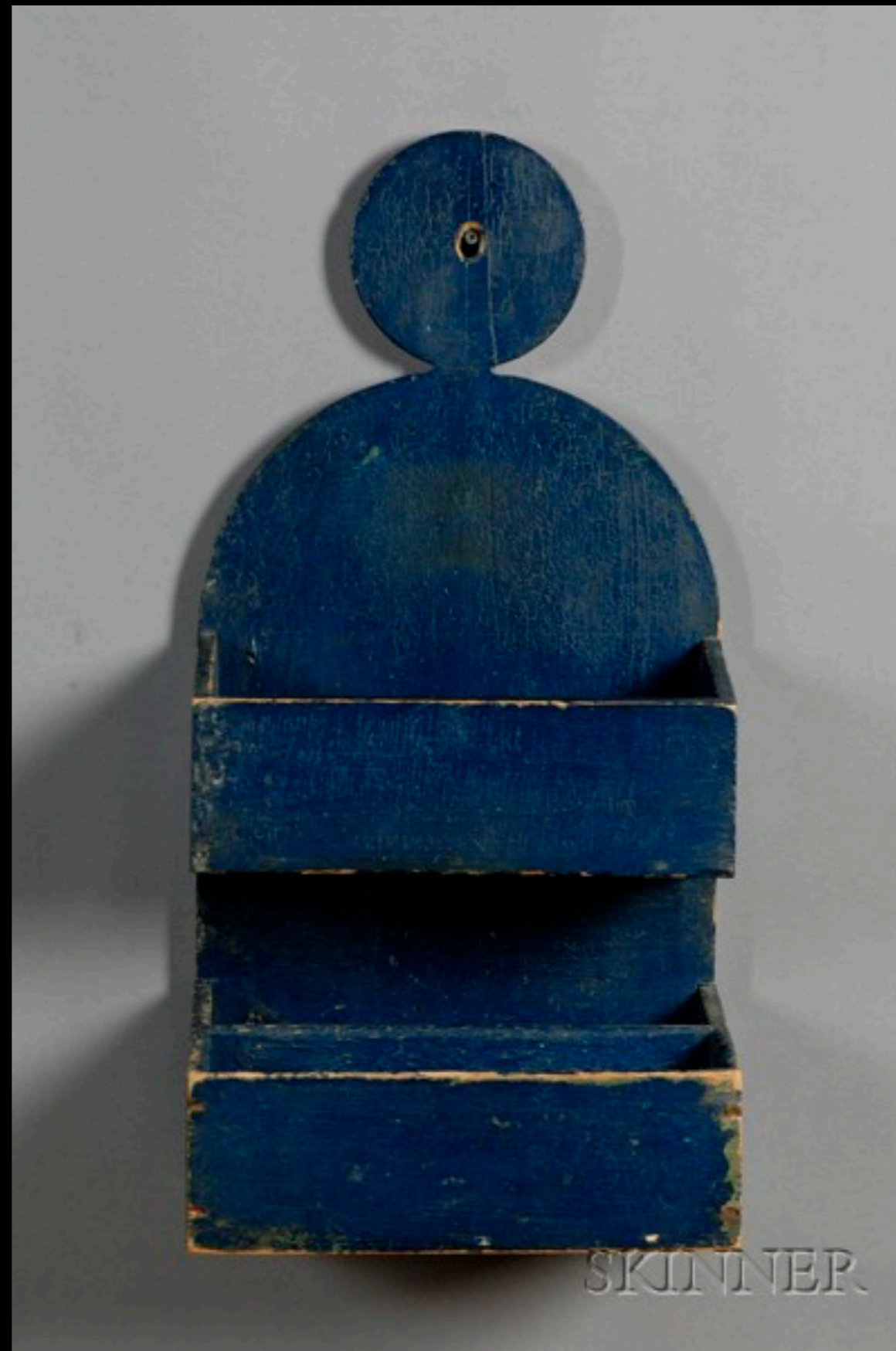
American Wall Box in Blue Paint Late 18th / Early 19th Century (Skinner)