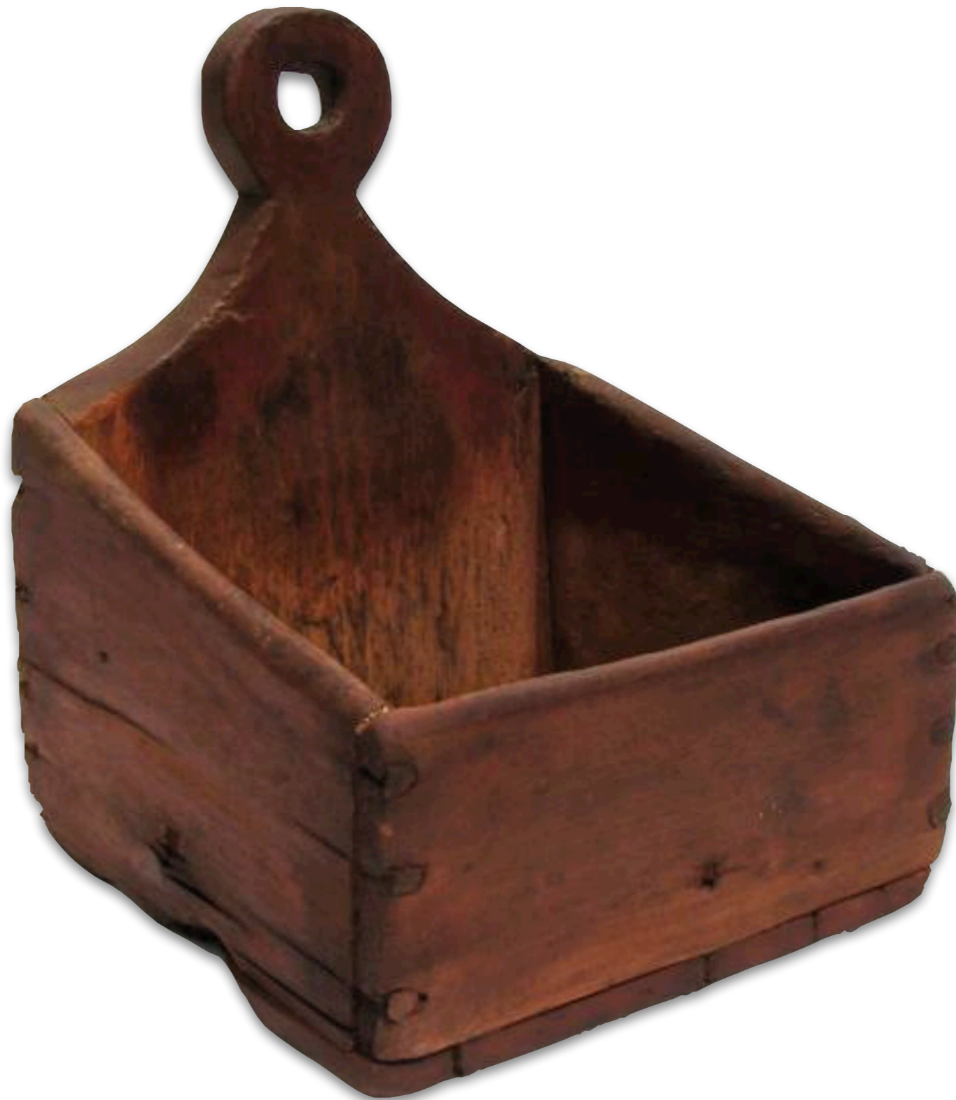
American Wall Box c. 1780 (John Philbruck Antiques)