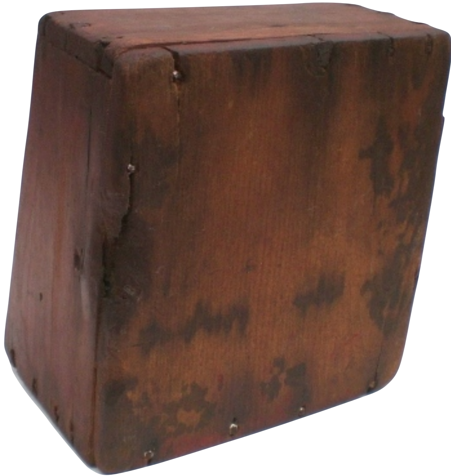
American Wall Box c. 1780 (John Philbruck Antiques)