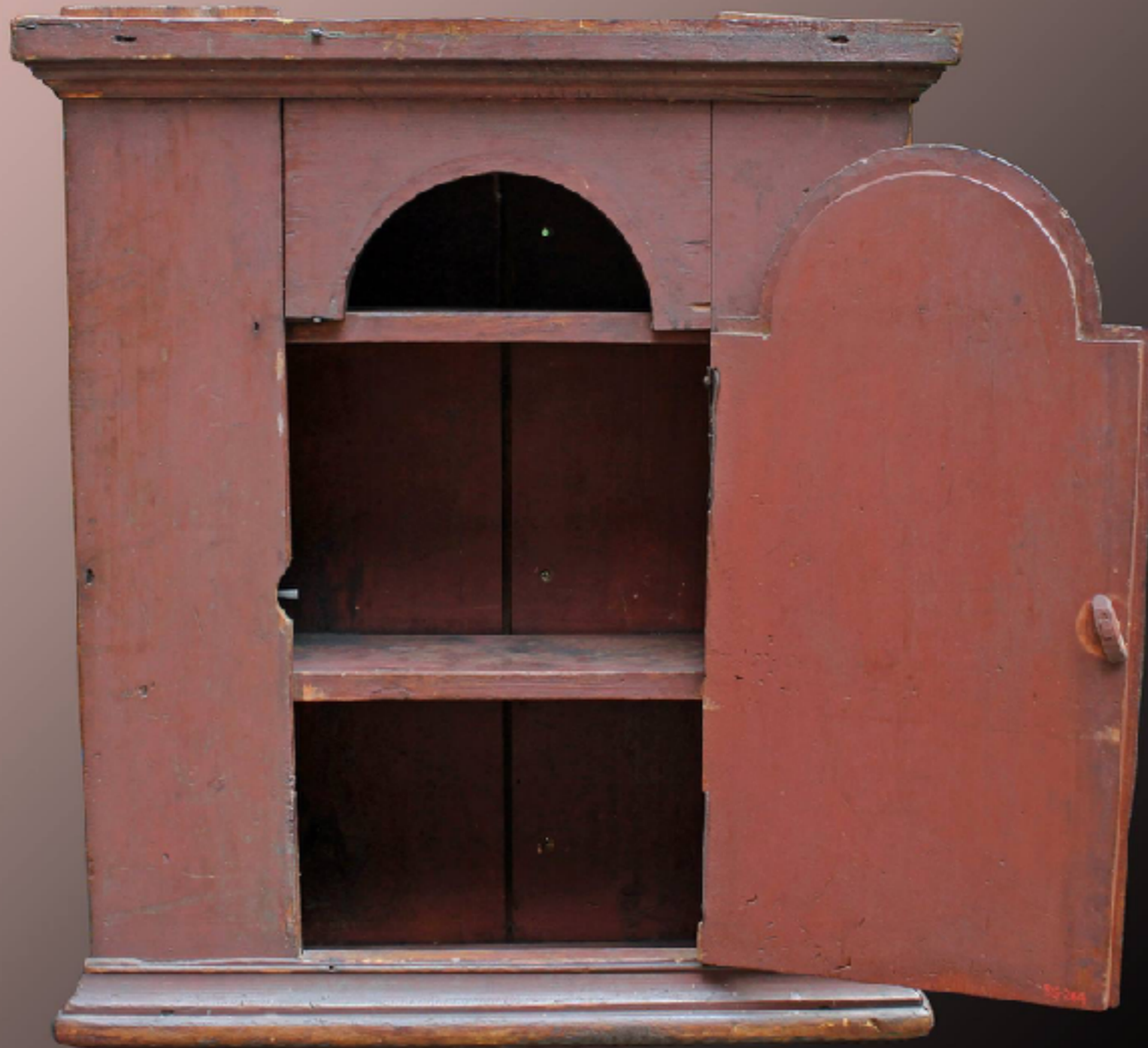
American Pine Wall Cupboard in Red Paint 18th Century