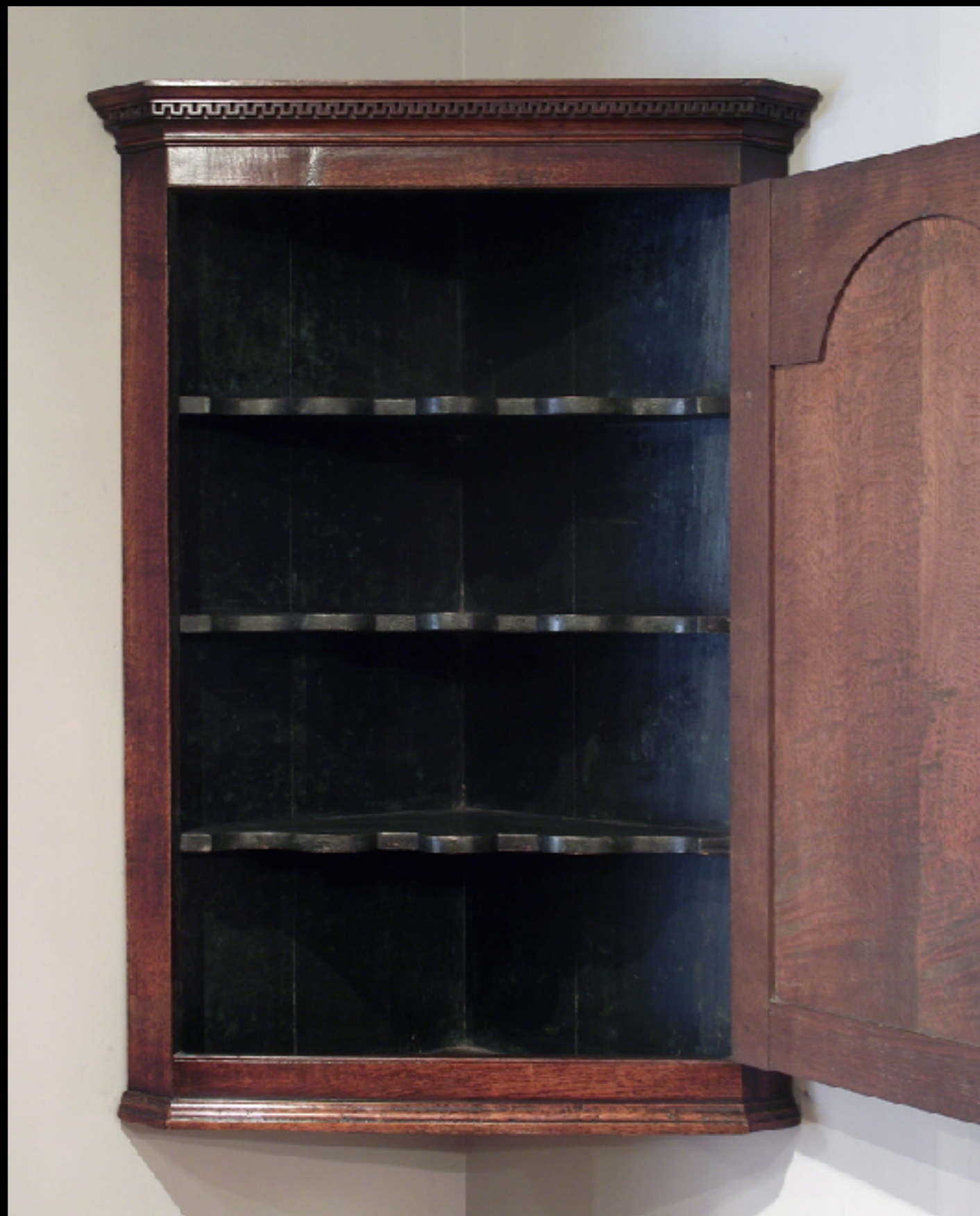
English Oak Wall Corner Cupboard 18th Century (Thakeham Furniture)