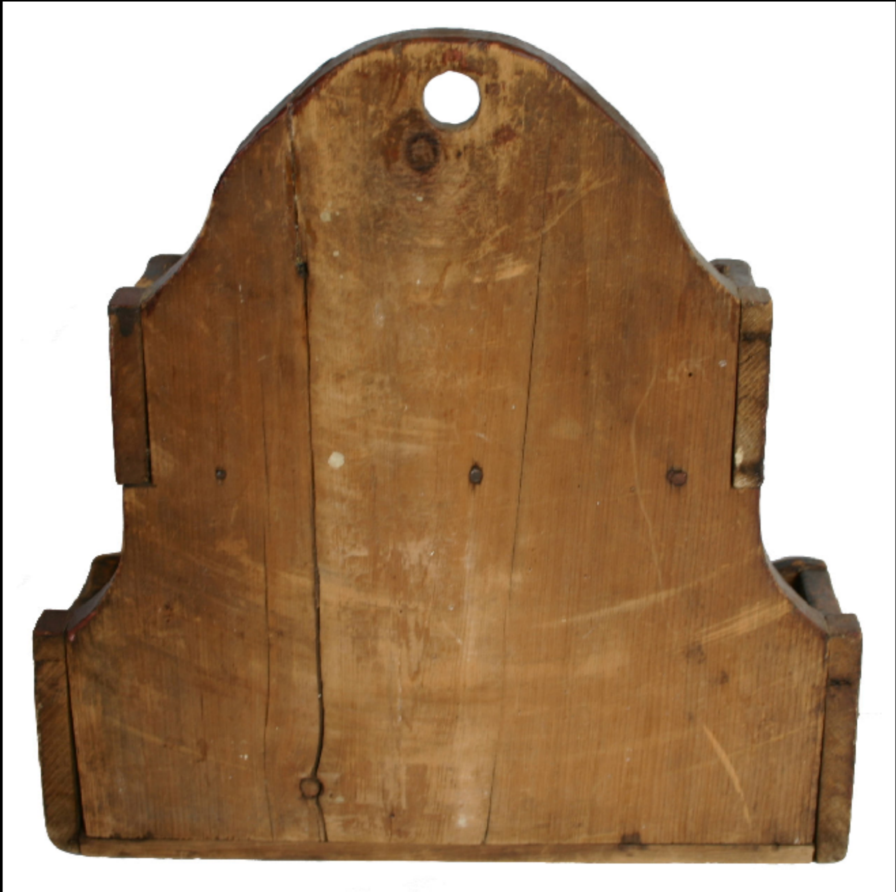
American Wall Box in Red Paint Late 18th / Early 19th Century (Sheridan Loyd)