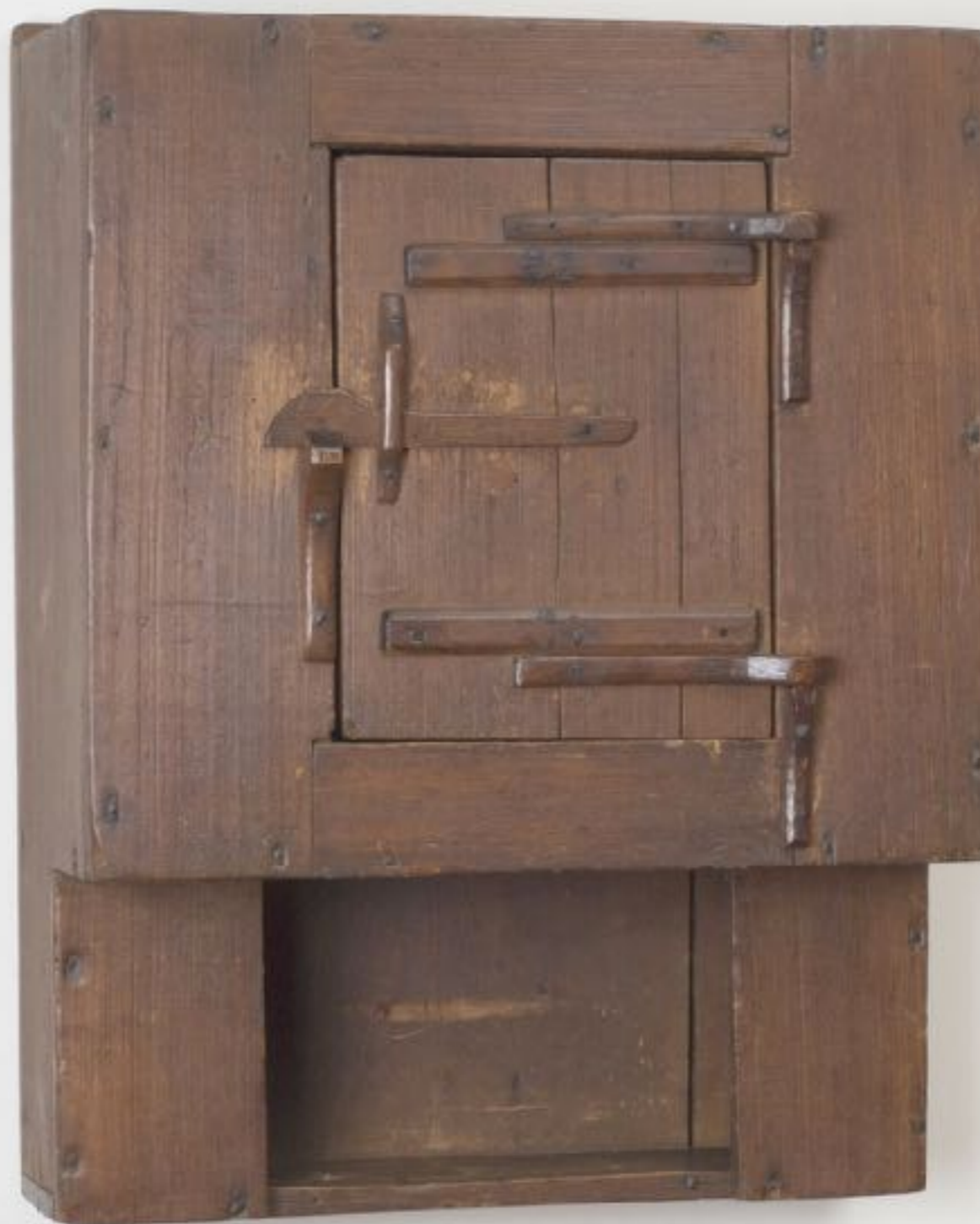
American Wall Cupboard from Pennsylvania Pennsylvania German Origins c. 1755 - 1765 (Philadelphia Museum of Art)