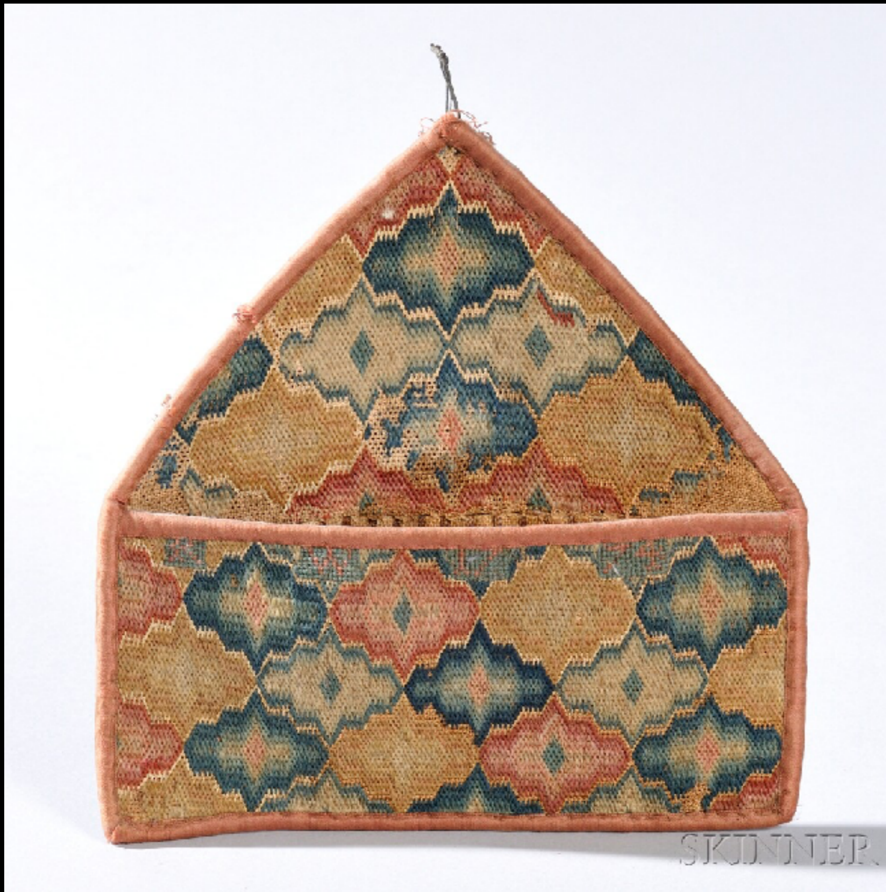
American Wool Embroidered Wall Pocket