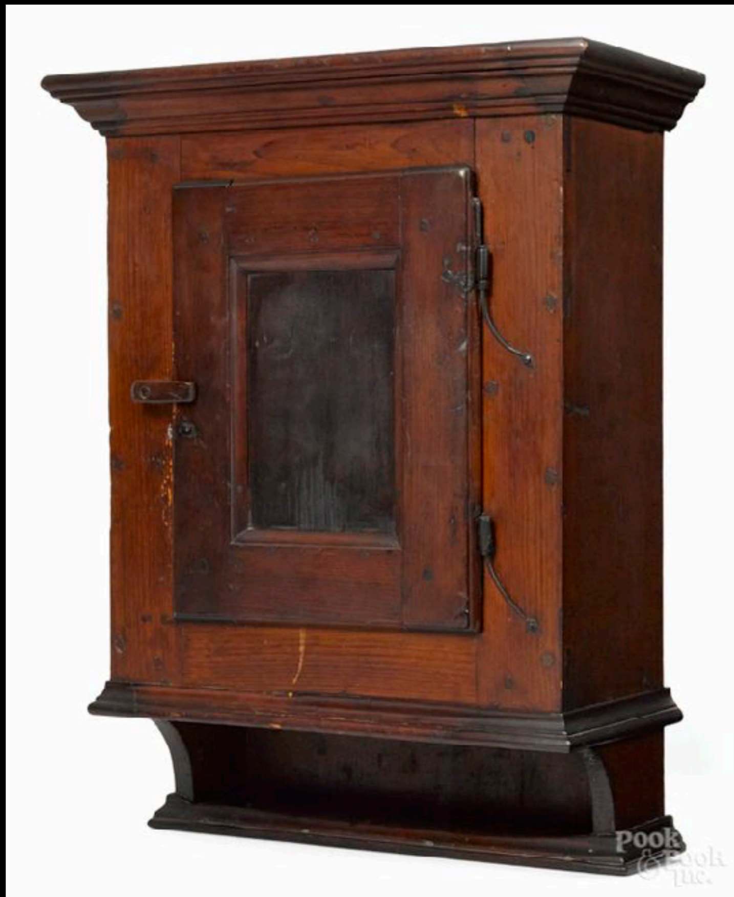
American Pine Wall Cupboard from Lancaster County, Pennsylvania Late 18th - Early 19th Century (Pook & Pook, Inc.)