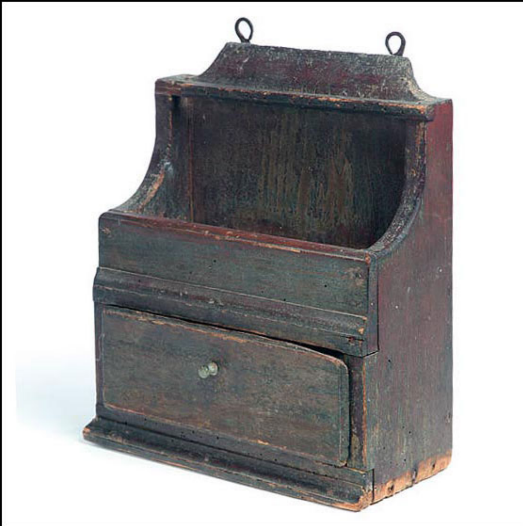
American Wall Box with Drawer in Red Paint Late 18th Century (Garth's Auction)