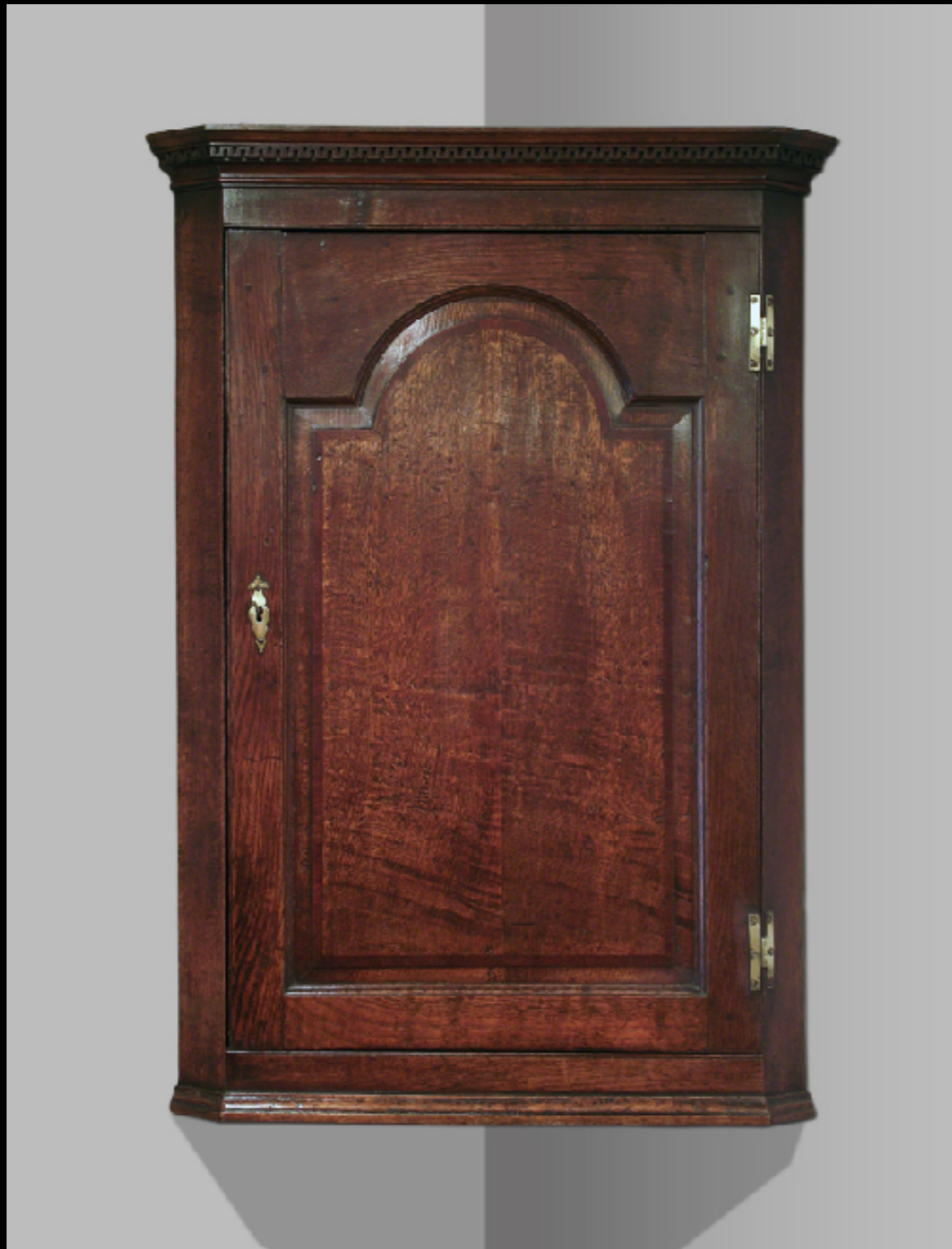
English Oak Wall Corner Cupboard 18th Century (Thakeham Furniture)