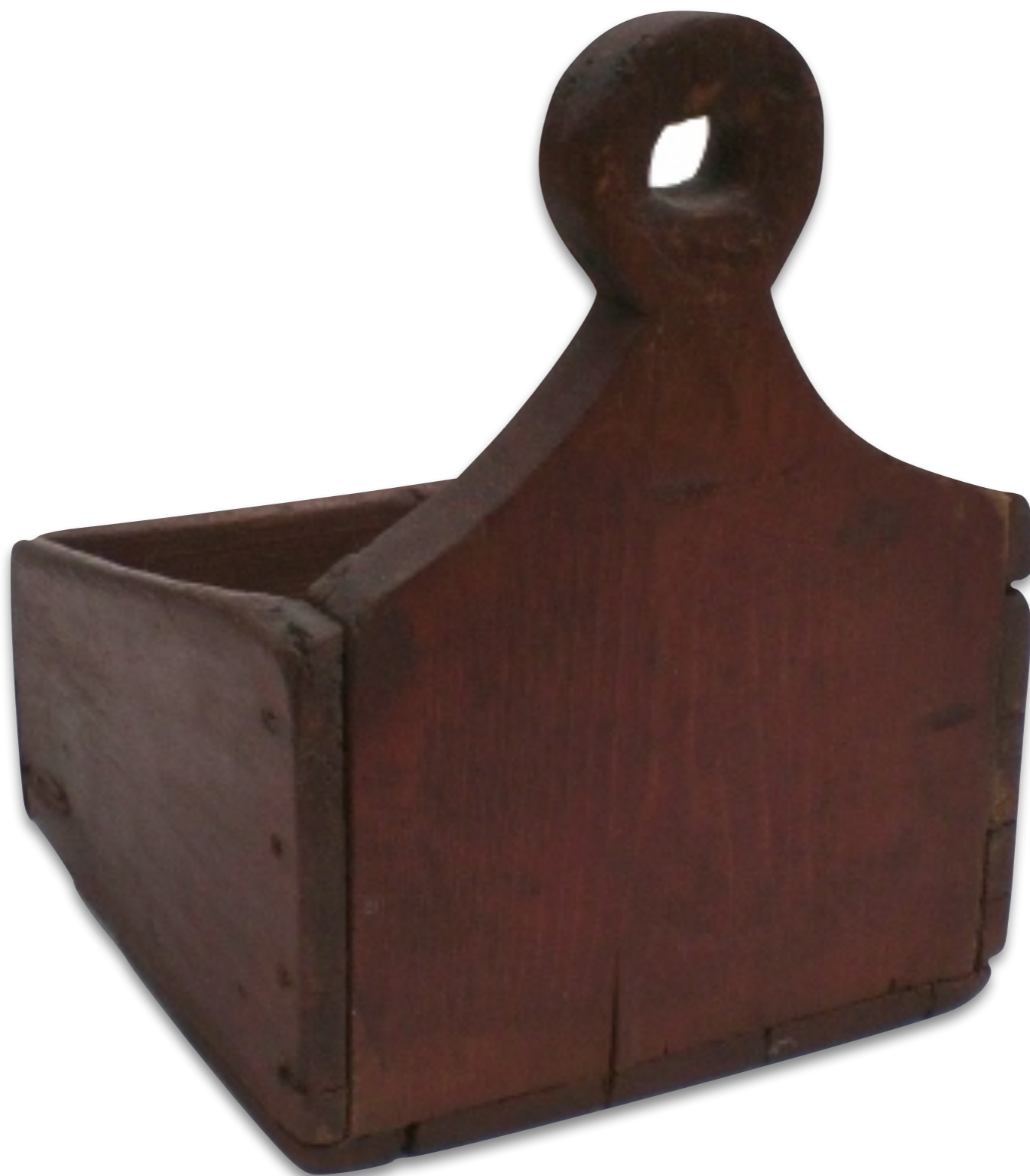
American Wall Box c. 1780 (John Philbruck Antiques)