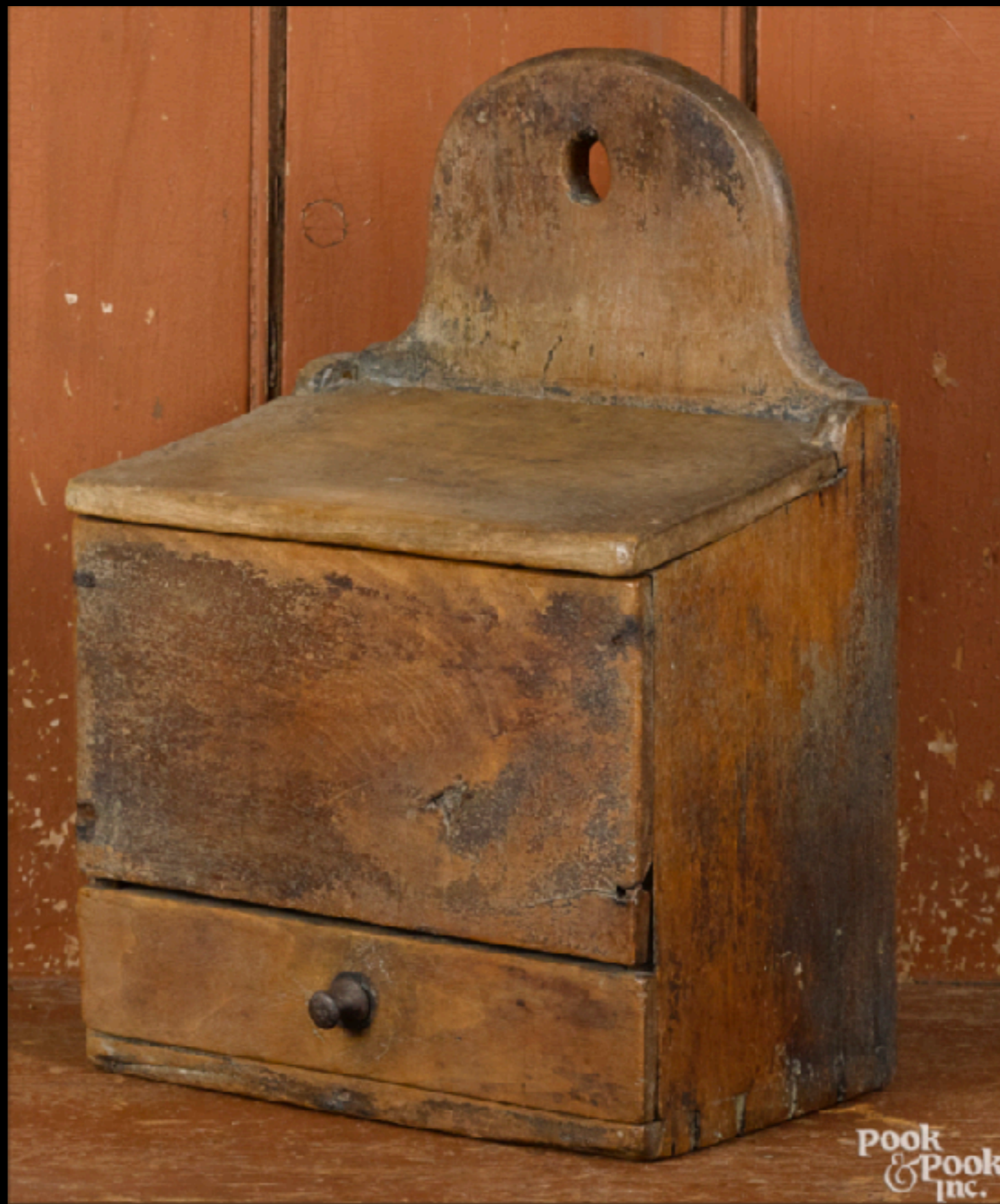
American Walnut Lidded Wall Cupboard with Drawer from Lancaster County, Pennsylvania Late 18th - Early 19th Century (Pook & Pook, Inc.)