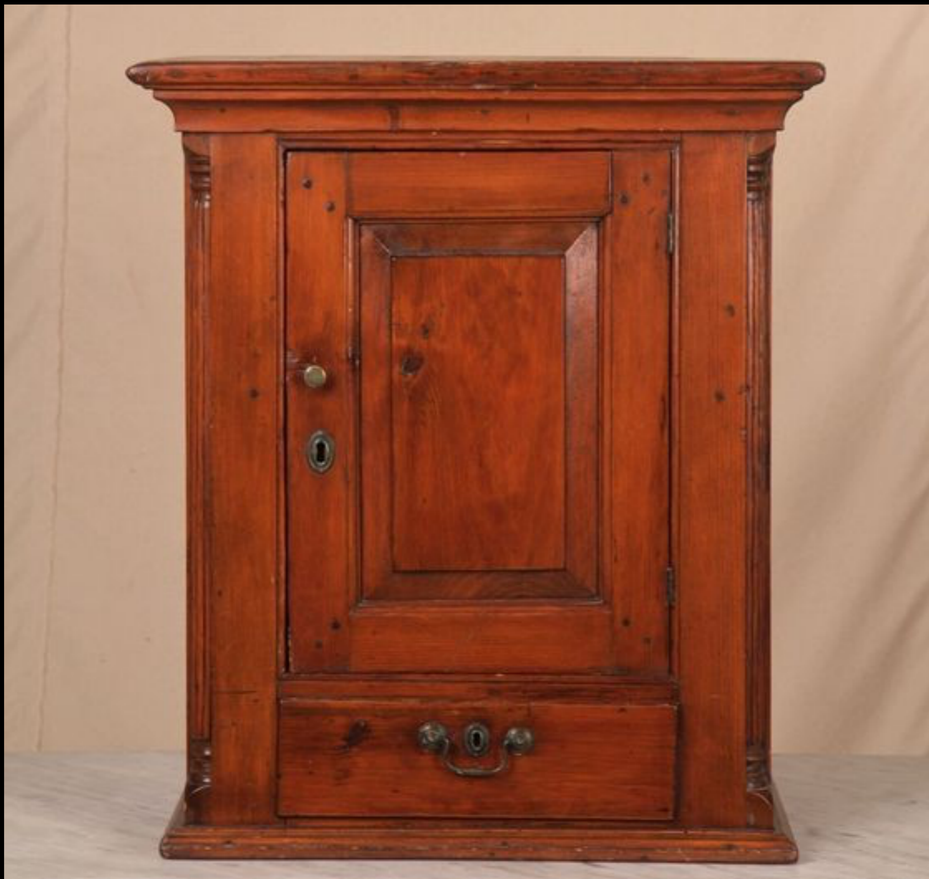
American Pine Wall Corner Cupboard from Pennsylvania Late 18th - Early 19th Century (Skinner)