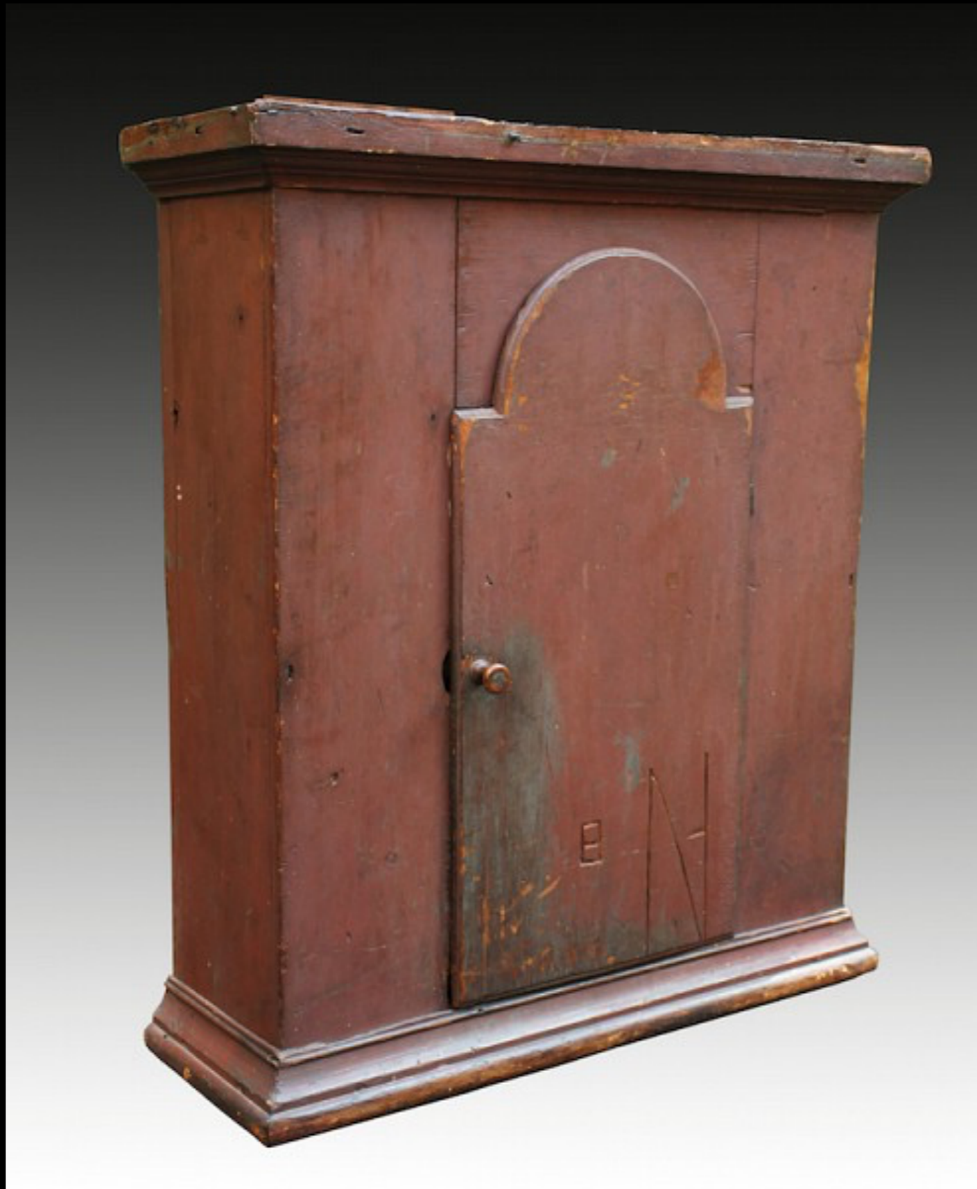
American Pine Wall Cupboard in Red Paint 18th Century (Don Olson American Antiques & Fine Art)