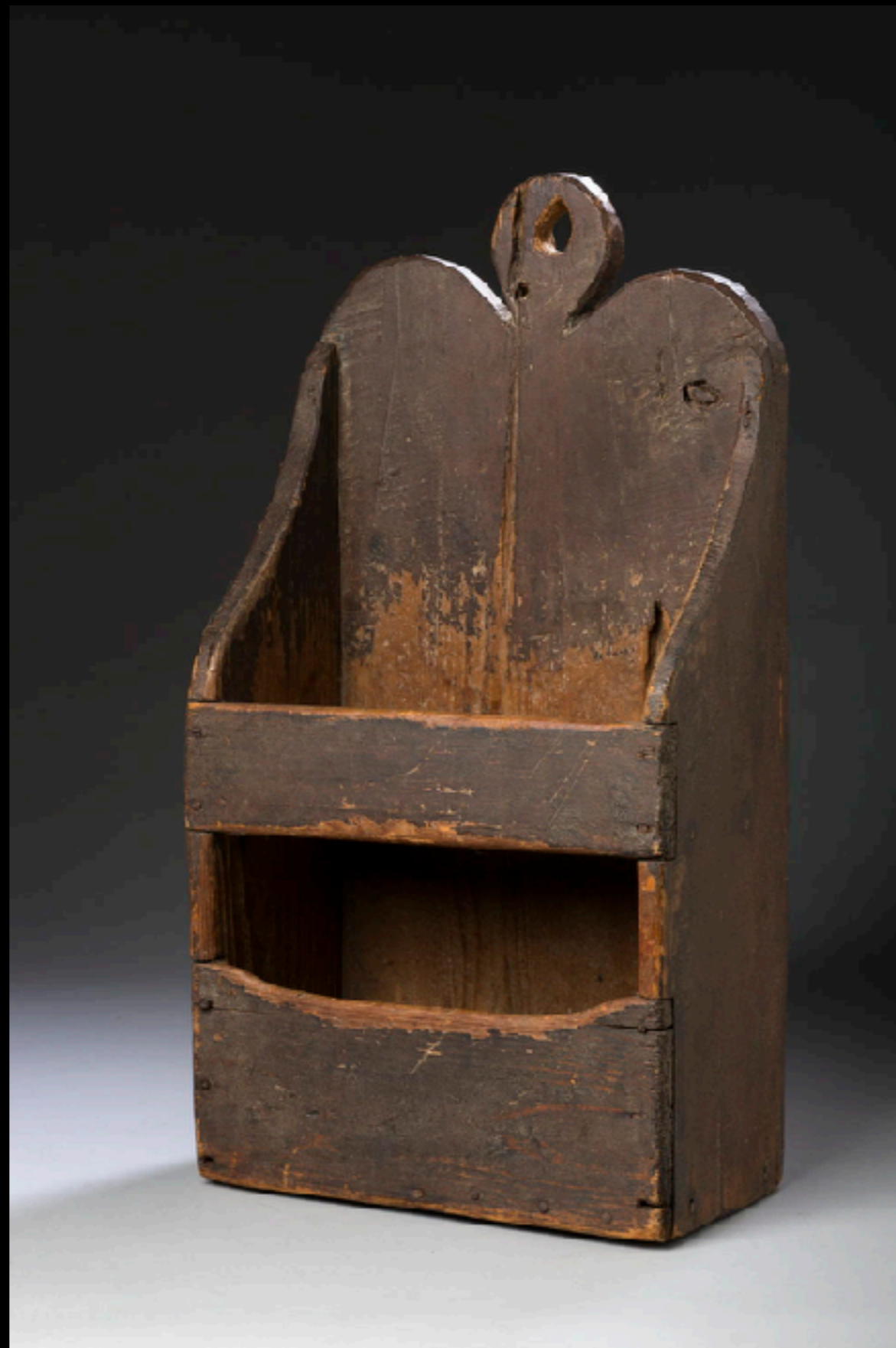
American Wall Box in Spanish Brown Paint Late 18th / Early 19th Century (Northeast Auctions)