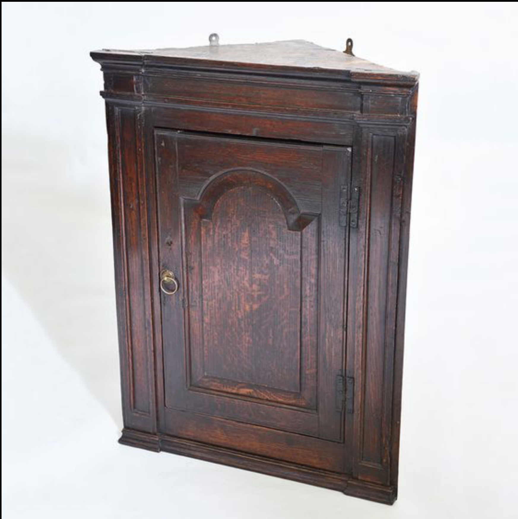
English Oak Corner Wall Corner Cupboard 18th Century (Elaine Phillips Antiques)