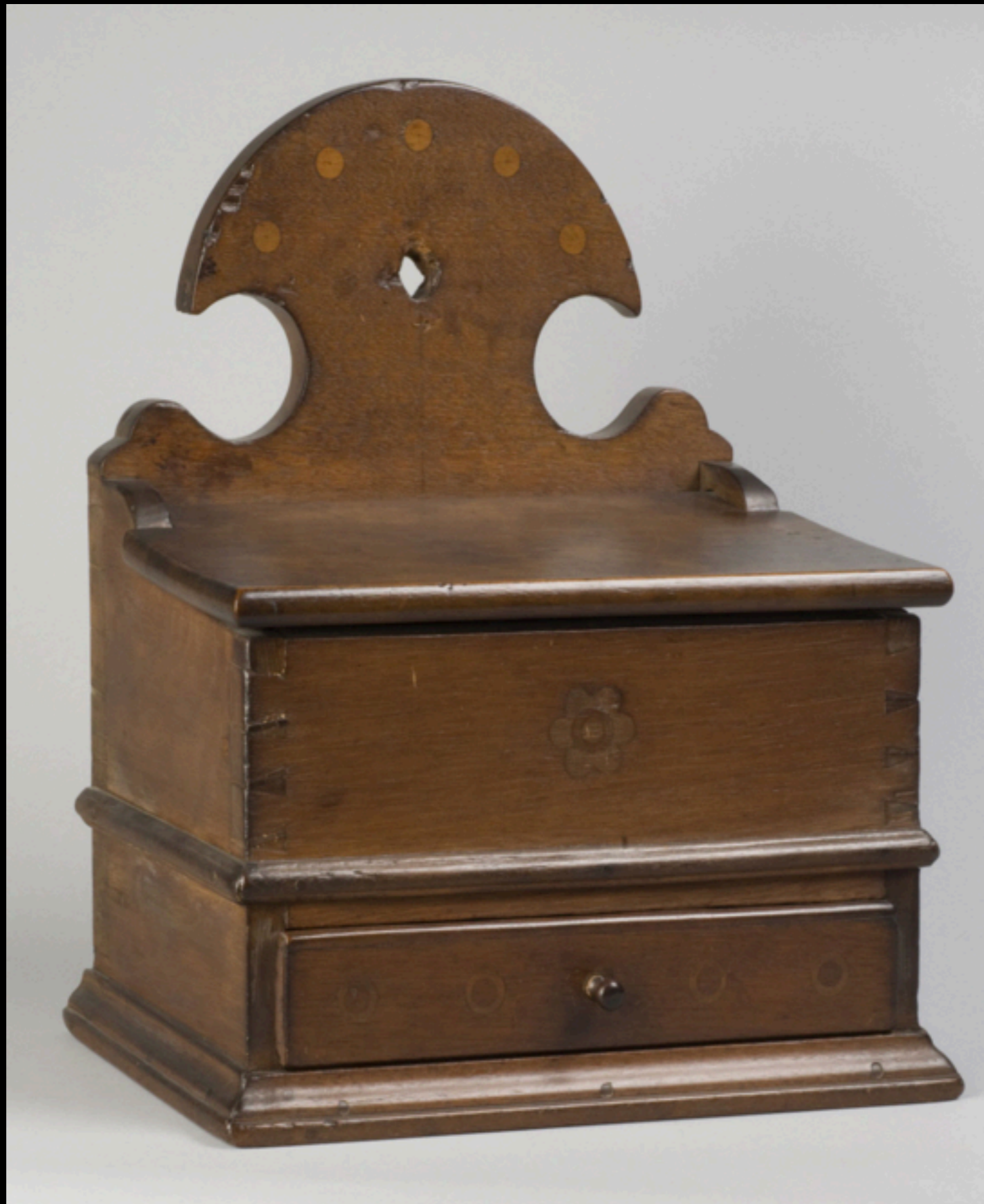
American Walnut & Poplar Lidded Wall Box with Drawer in Brown Paint c. 1780 - 1820 (Philadelphia Museum of Art)