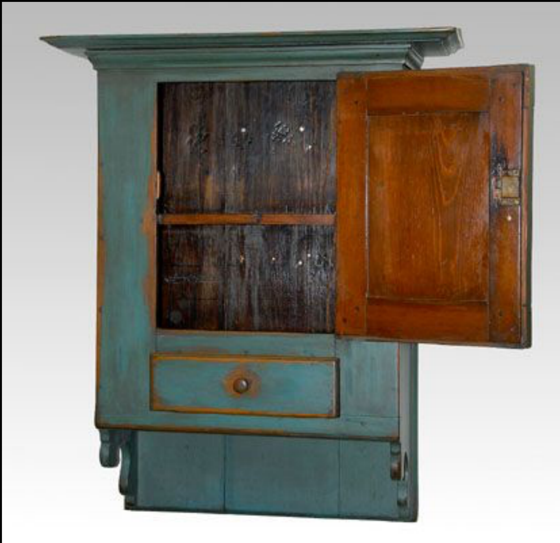
American Yellow Pine Wall Cupboard in Blue Paint from Piedmont, North Carolina Late 18th - Early 19th Century (Brunk Auctions)