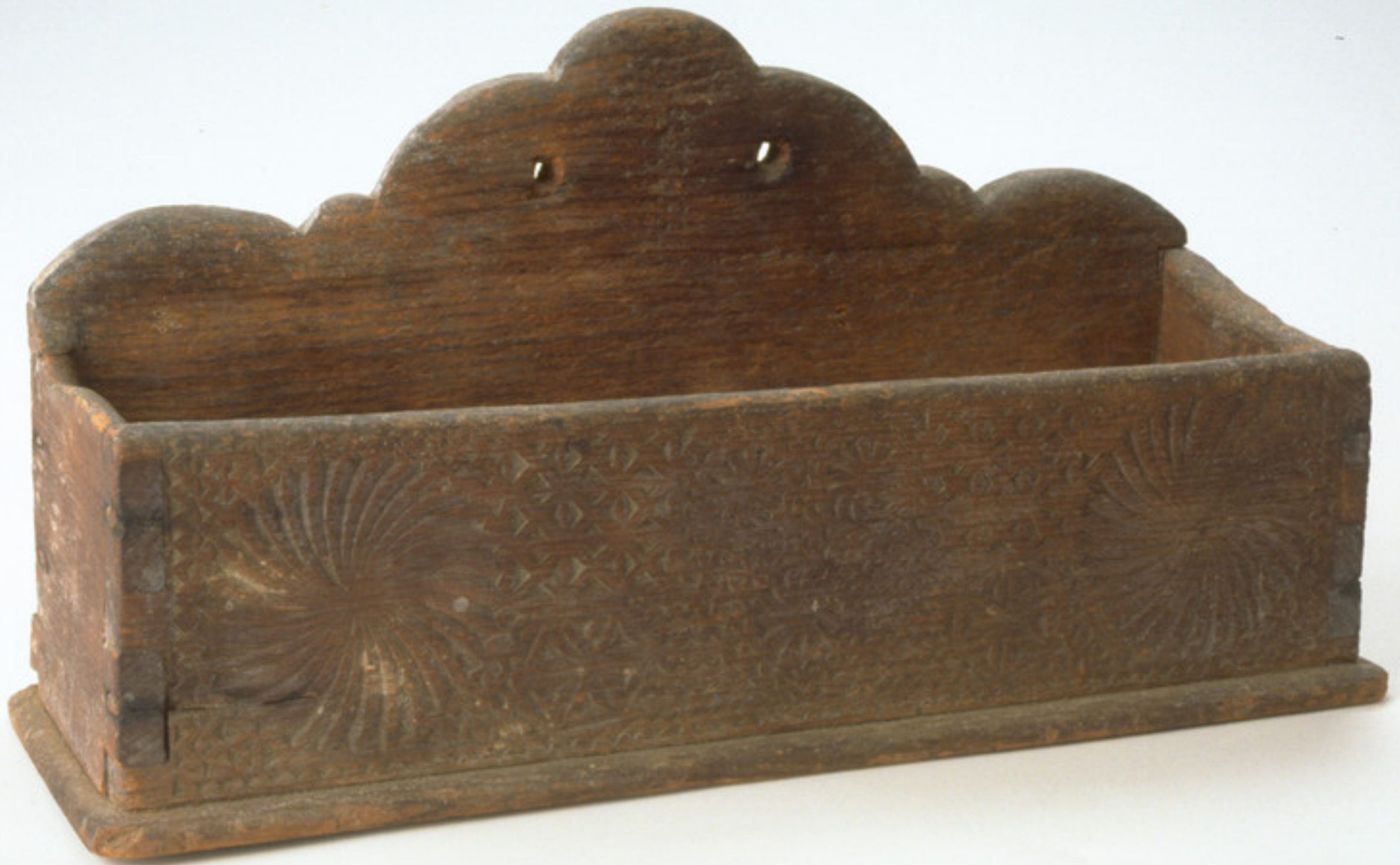
American Chip Carved Pine Wall (Candle) Box c. 1775 - 1800 (Historic New England)