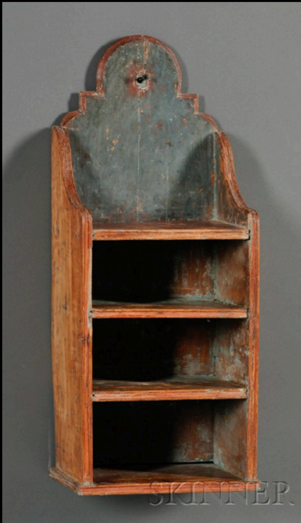
American Wall Shelf in Blue Paint 18th Century (Skinner)