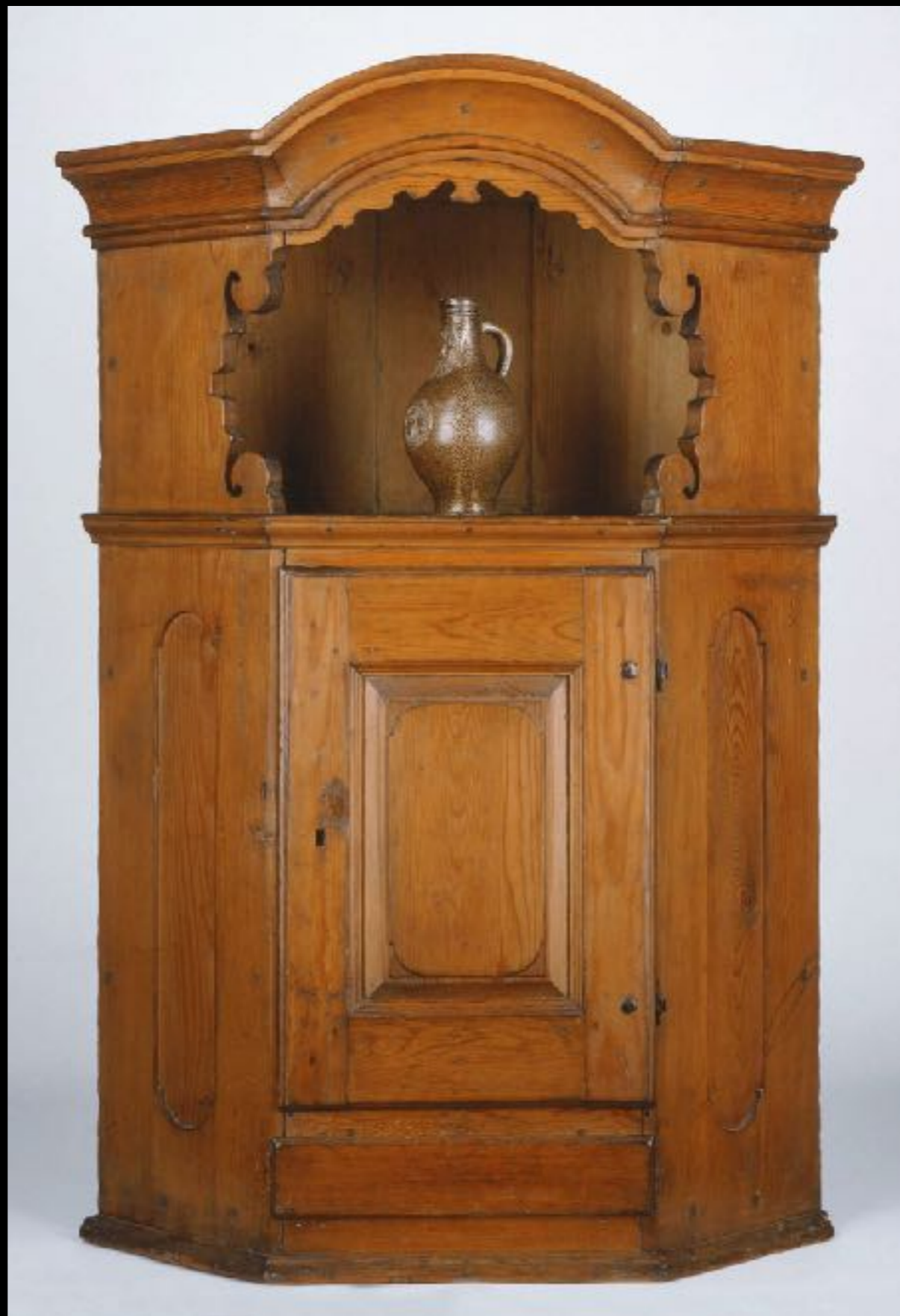
American Wall Corner Cupboard from Pennsylvania c. 1760 - 1800 (Philadelphia Museum of Art)