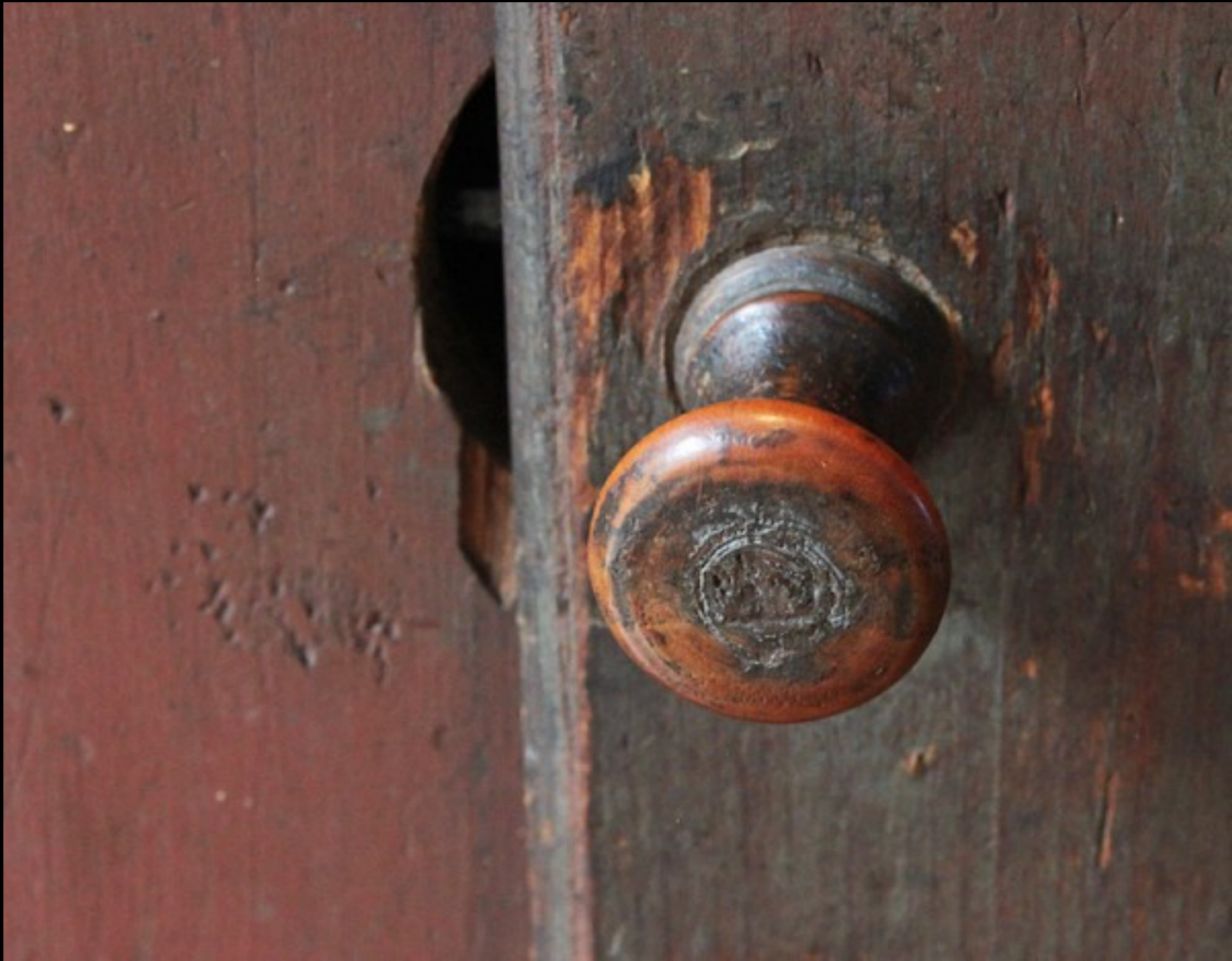
American Pine Wall Cupboard in Red Paint 18th Century (Don Olson American Antiques & Fine Art)