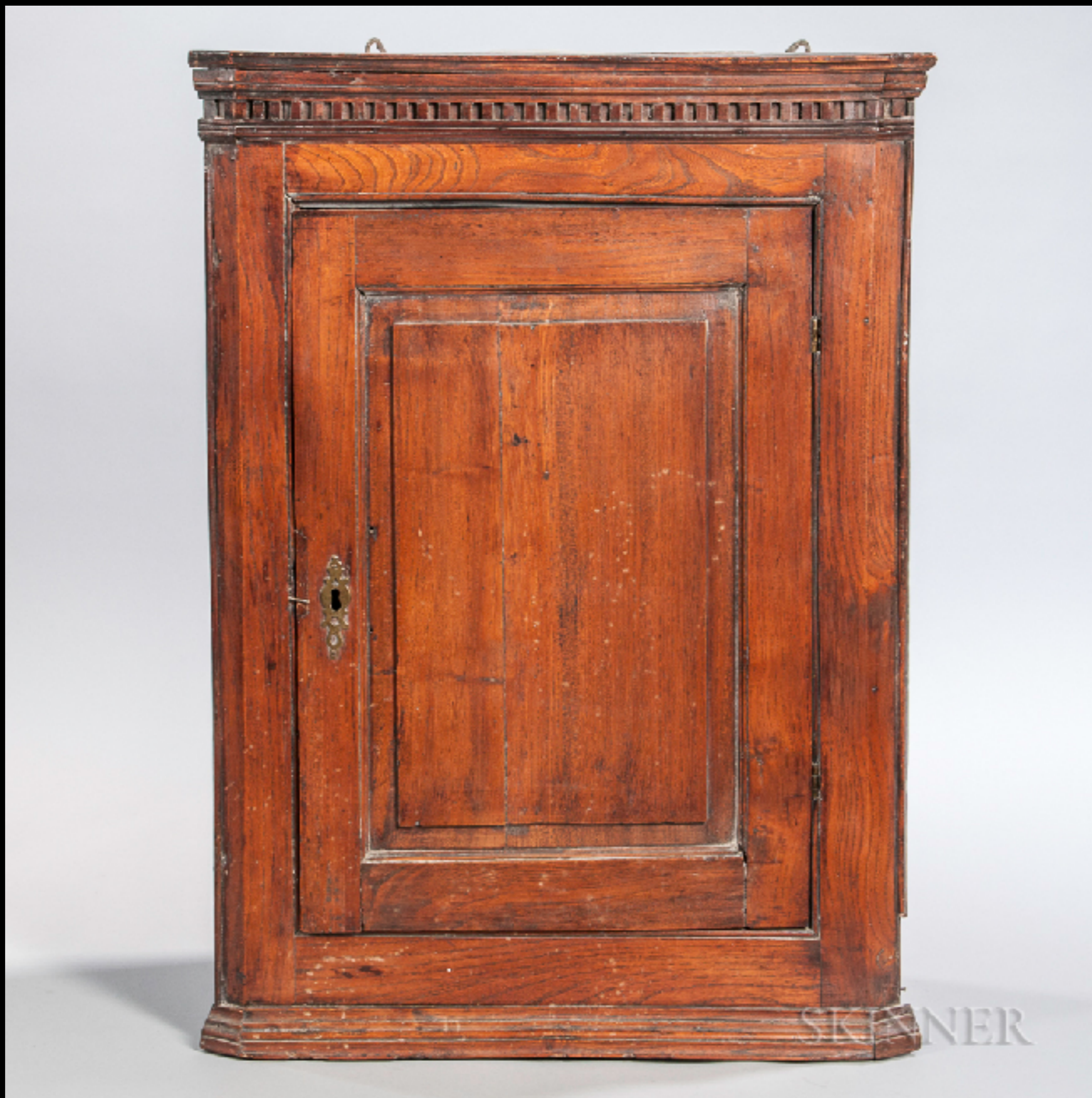
English Mahogany Wall Corner Cupboard Late 18th - Early 19th Century (Skinner)