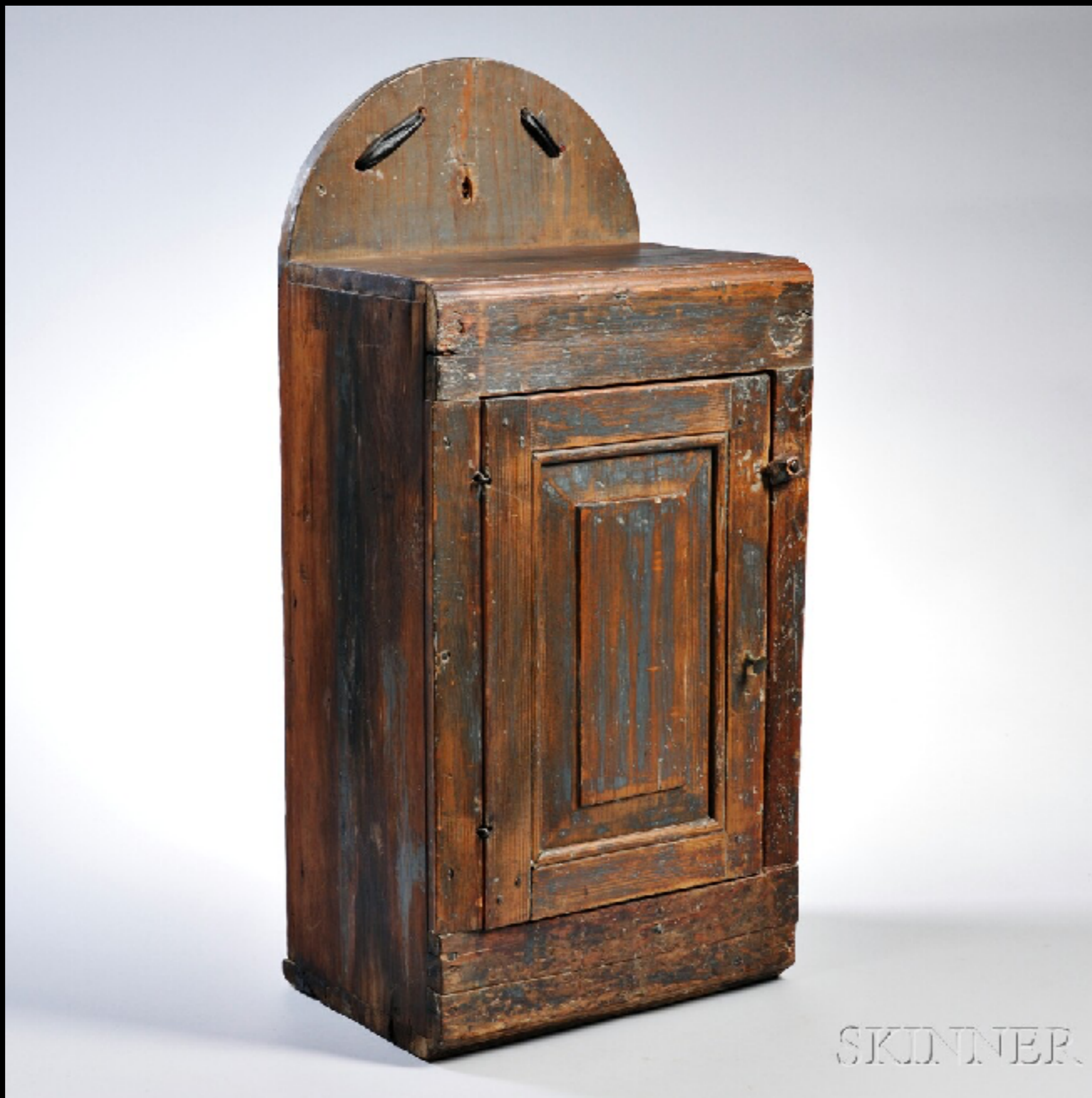
American Pine Wall Cupboard in Blue Paint Late 18th - Early 19th Century (Skinner)