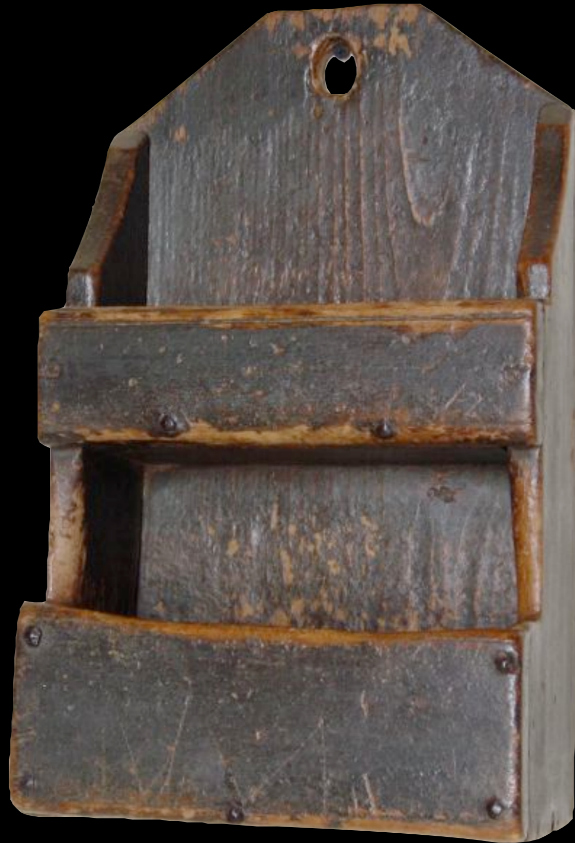
American Wall Box Late 18th Century (Private Collection)