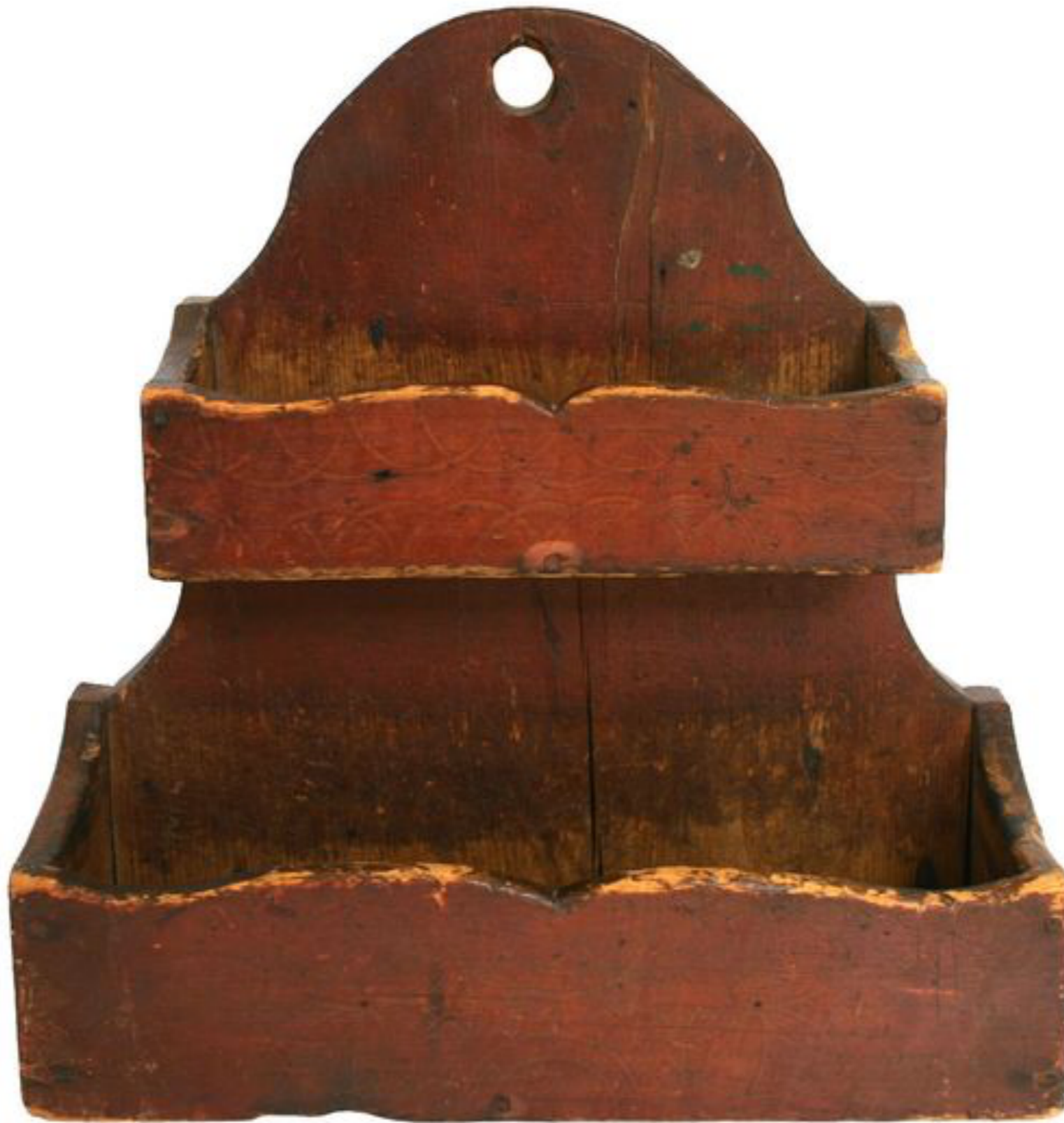
American Wall Box in Red Paint Late 18th / Early 19th Century (Sheridan Loyd)