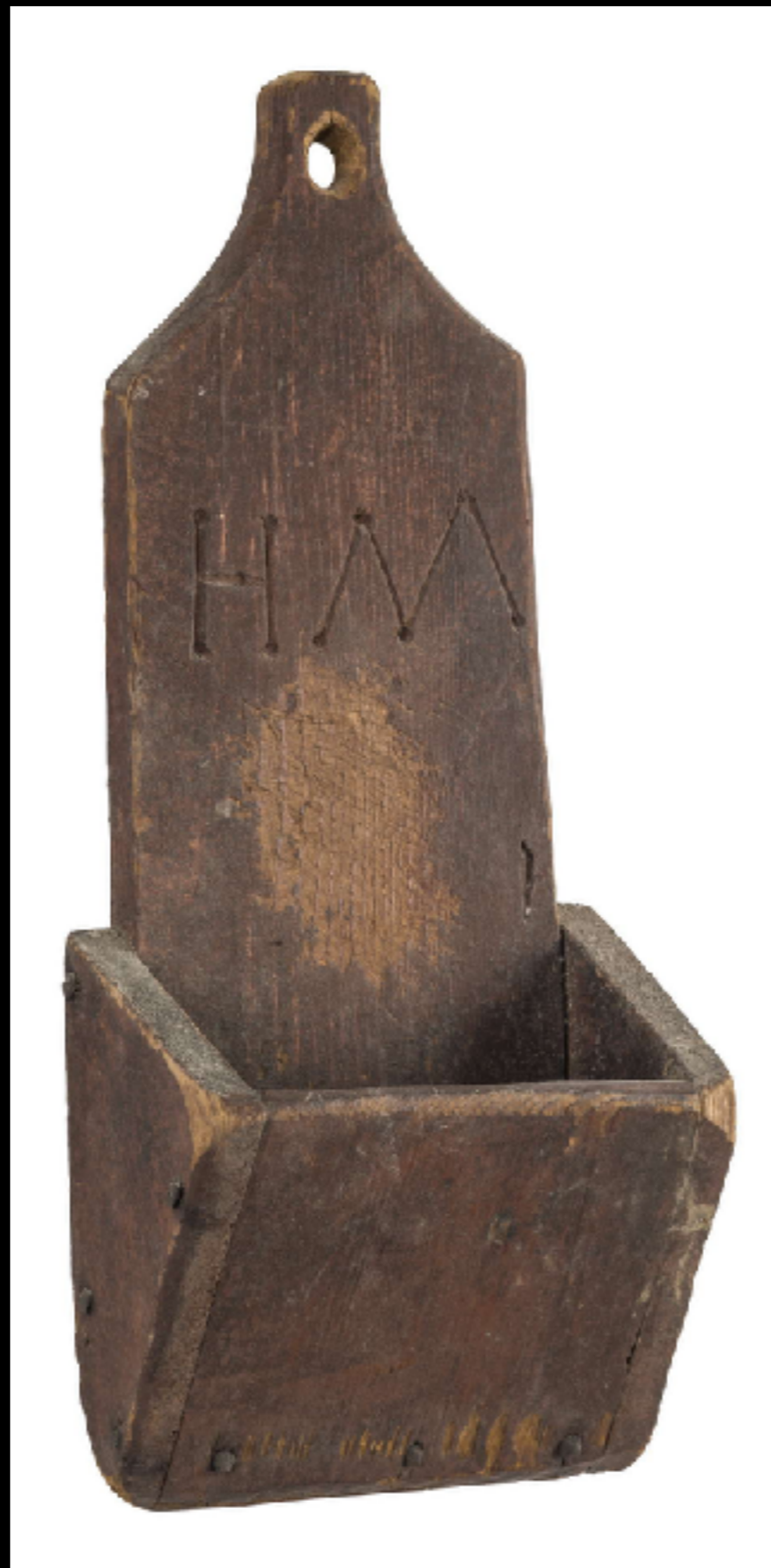
American Wall Box in Red Paint Late 18th / Early 19th Century