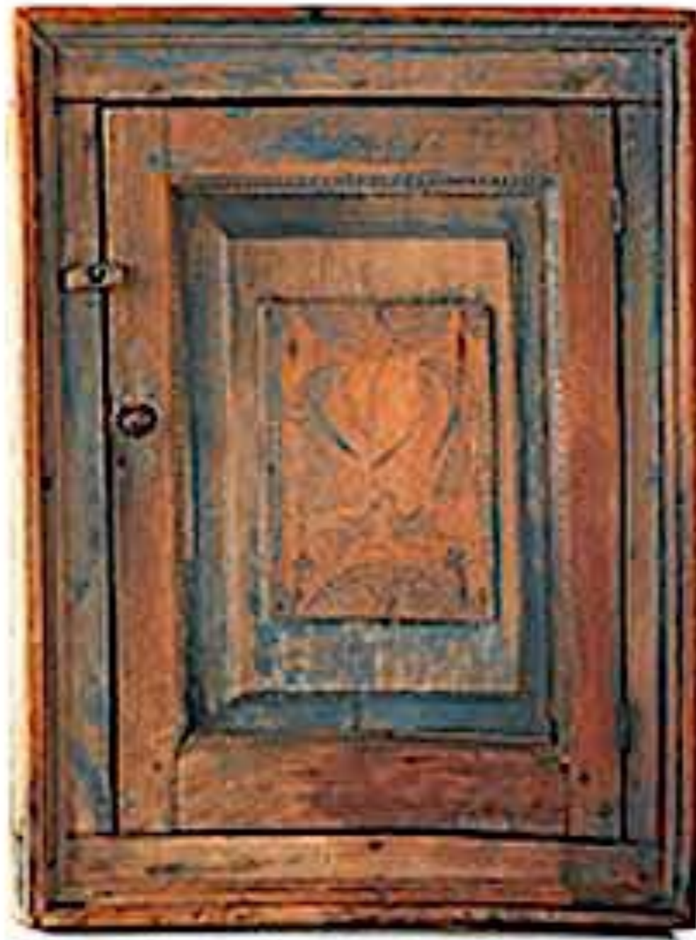
American Pine, Poplar, & Maple Wall Cupboard in Blue Paint Late 18th Century (Titus Geesey / ex. Philadelphia Museum of Art)