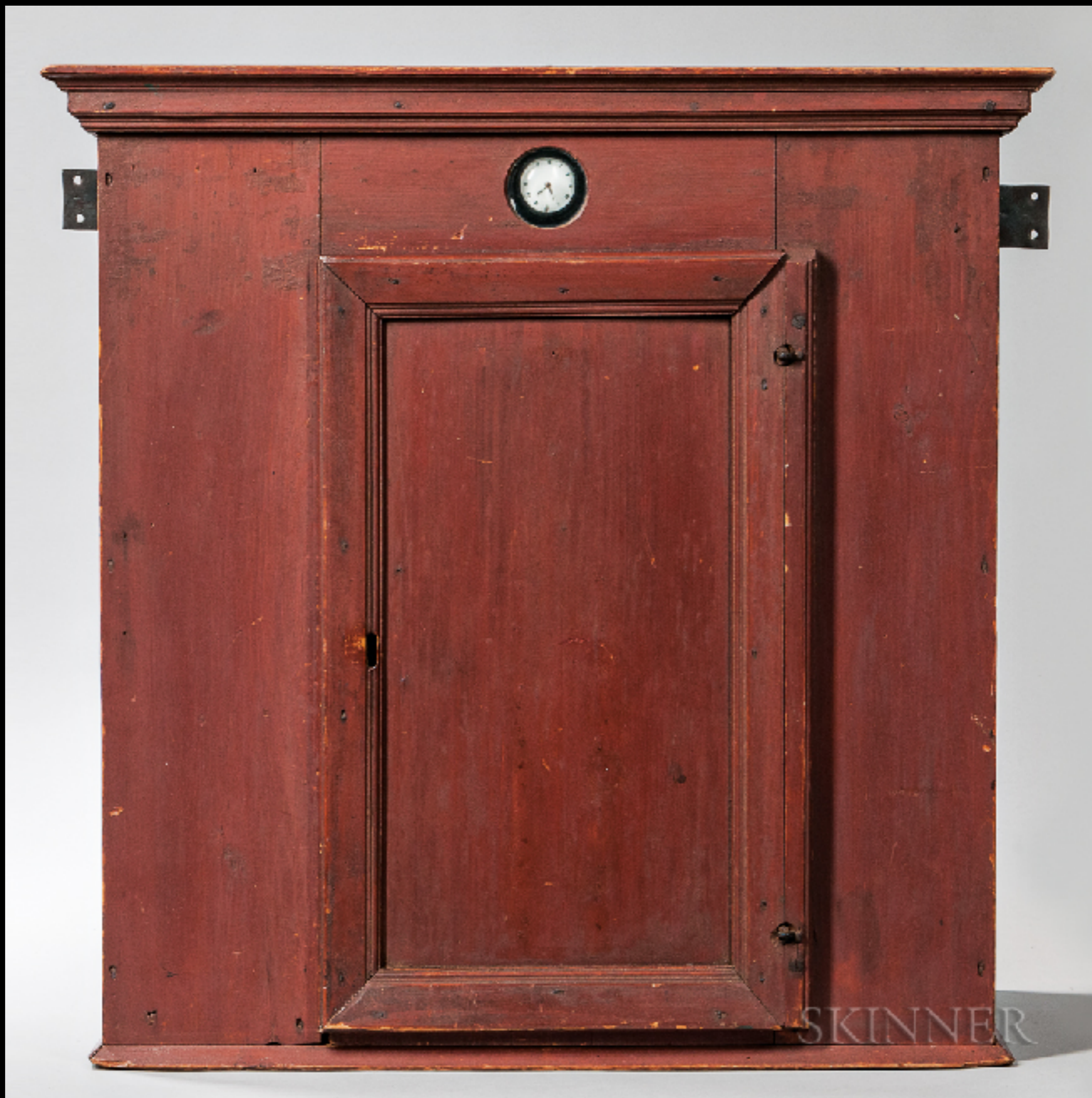
American Pine Wall Cupboard with Glazed Watch Window in Red Paint 18th Century (Skinner)