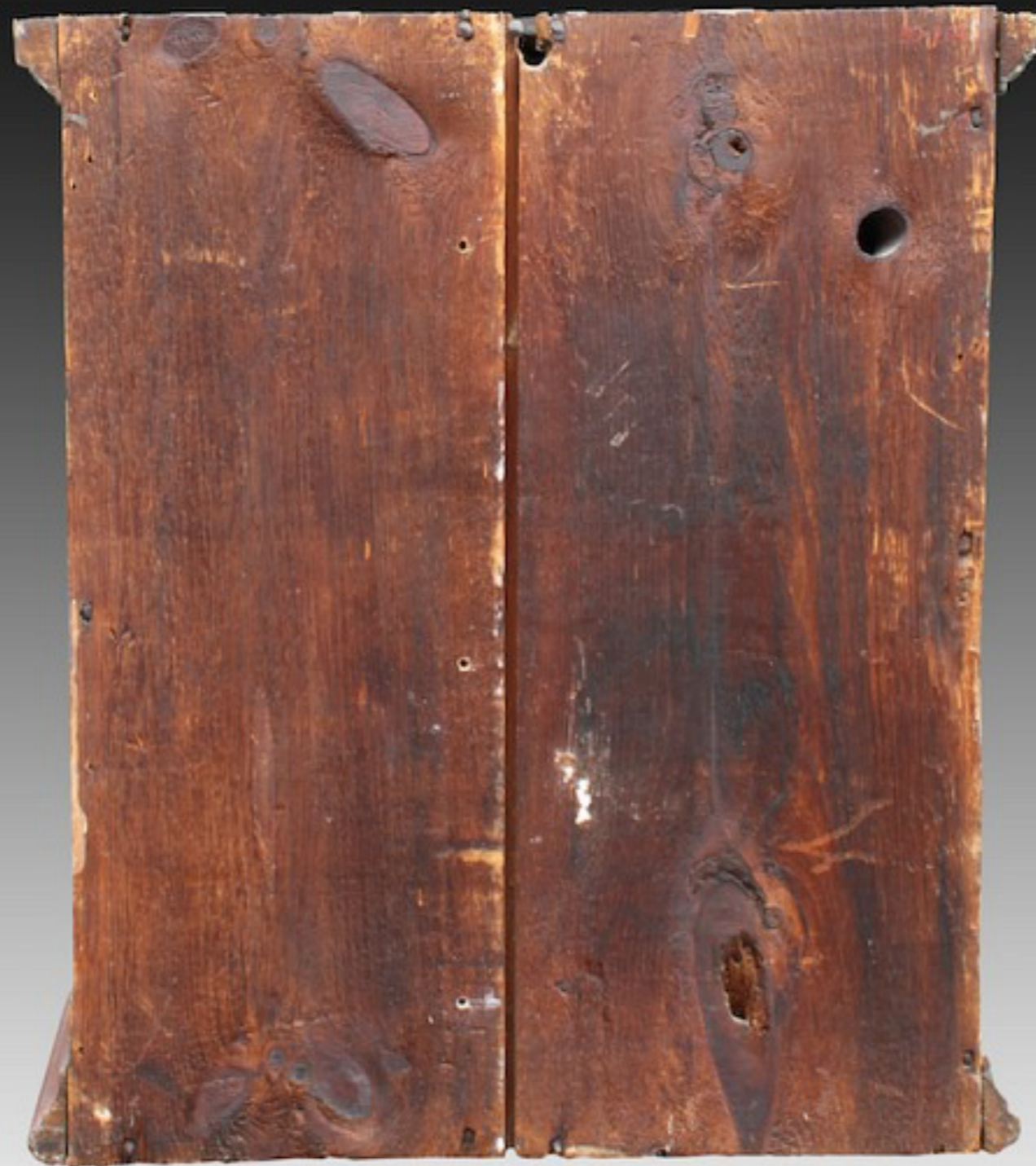
American Pine Wall Cupboard in Red Paint 18th Century (Don Olson American Antiques & Fine Art)