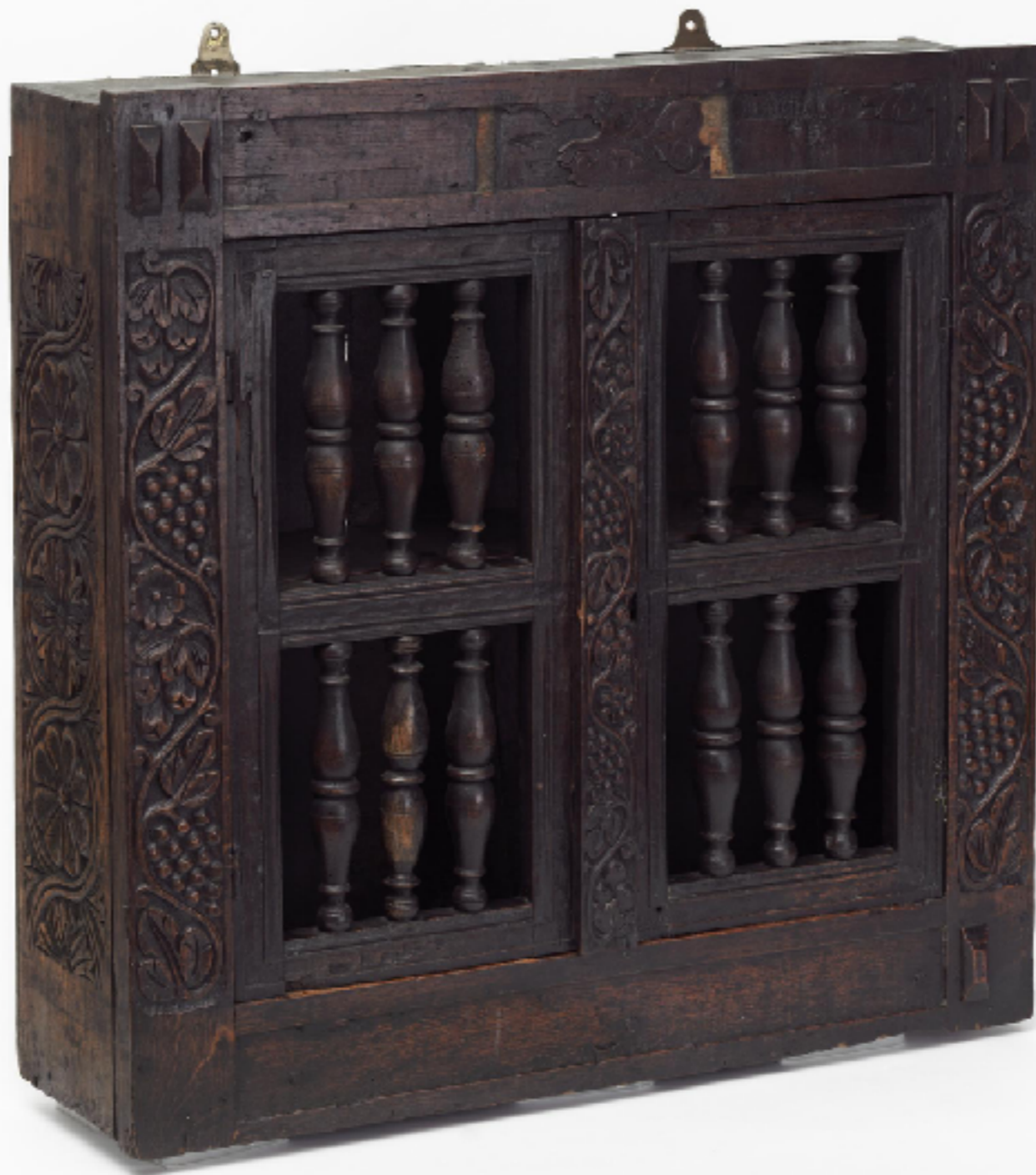
English Oak Wall Cupboard c. 1600 - 1620 (Victoria & Albert)