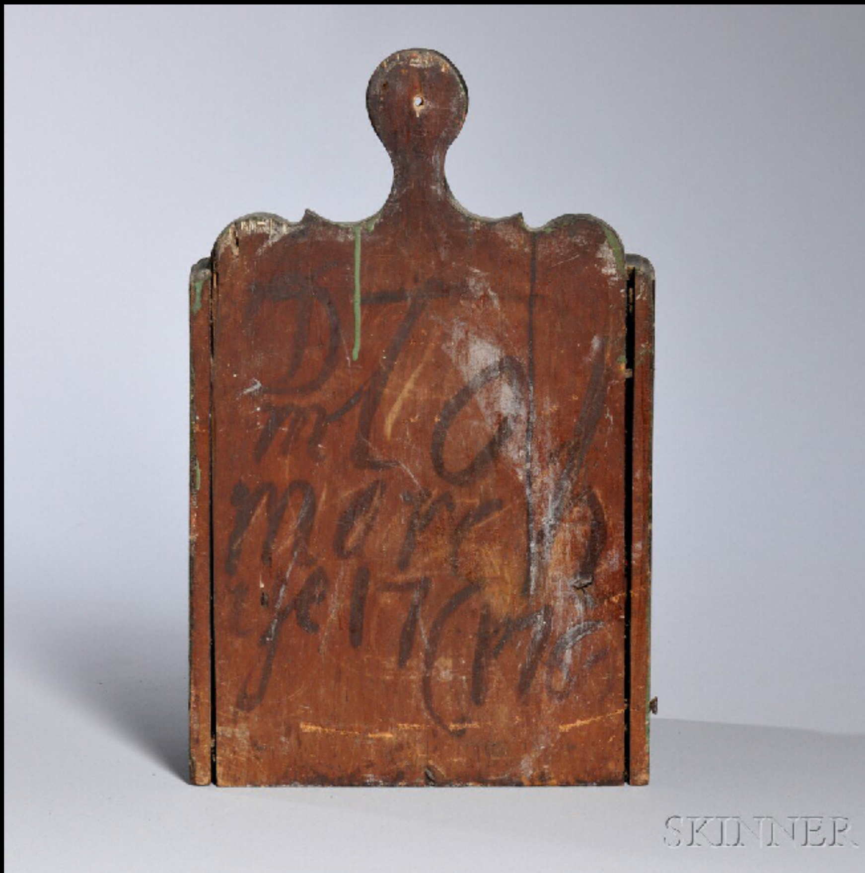
American Lidded Wall Box with Drawer in Black Paint Marked "DM TO / march / ye 17 1760" (Skinner)