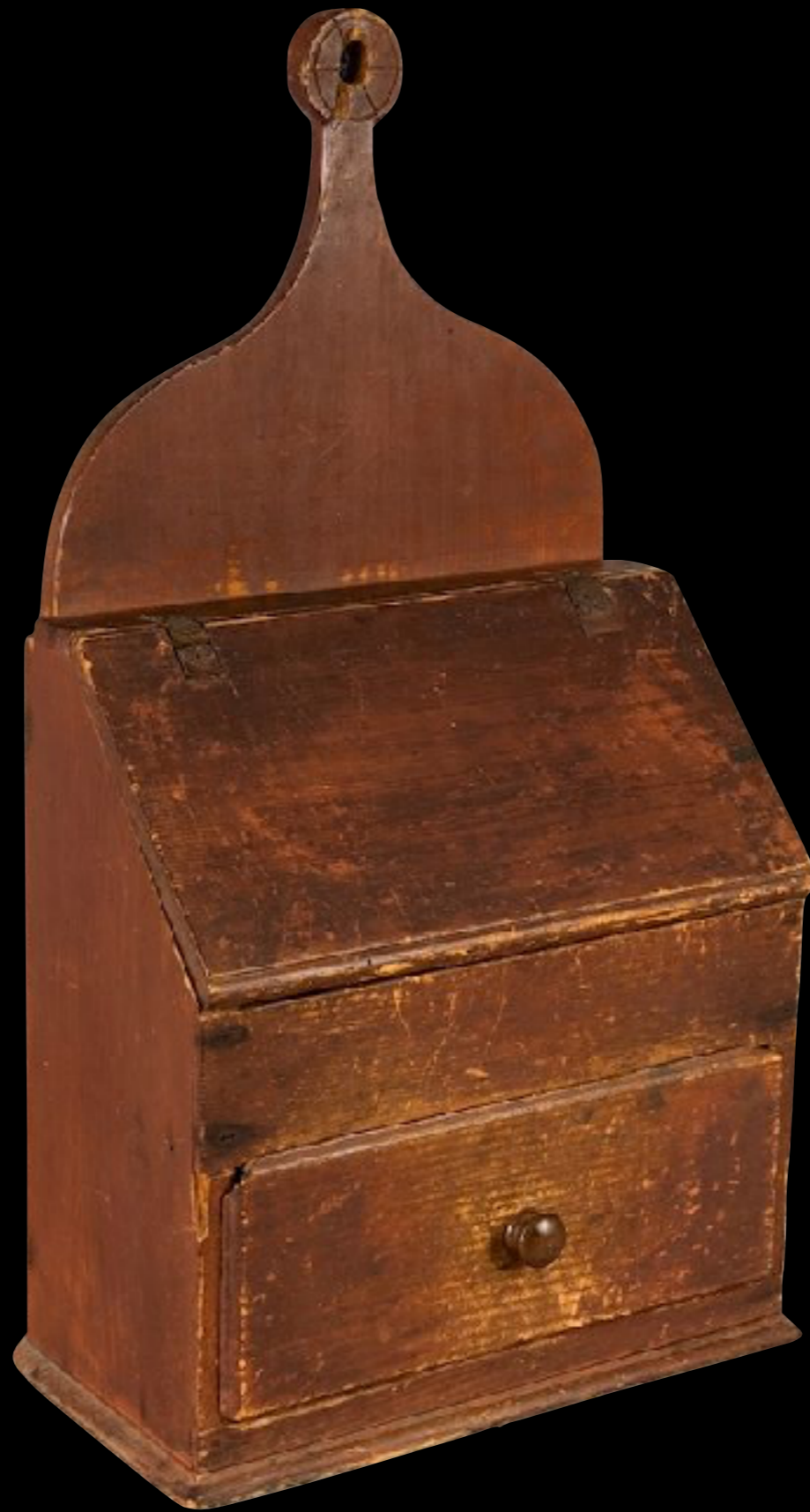
American Lidded Wall Box with Drawer in Red Paint Late 18th / Early 19th Century (Harold Pickett)